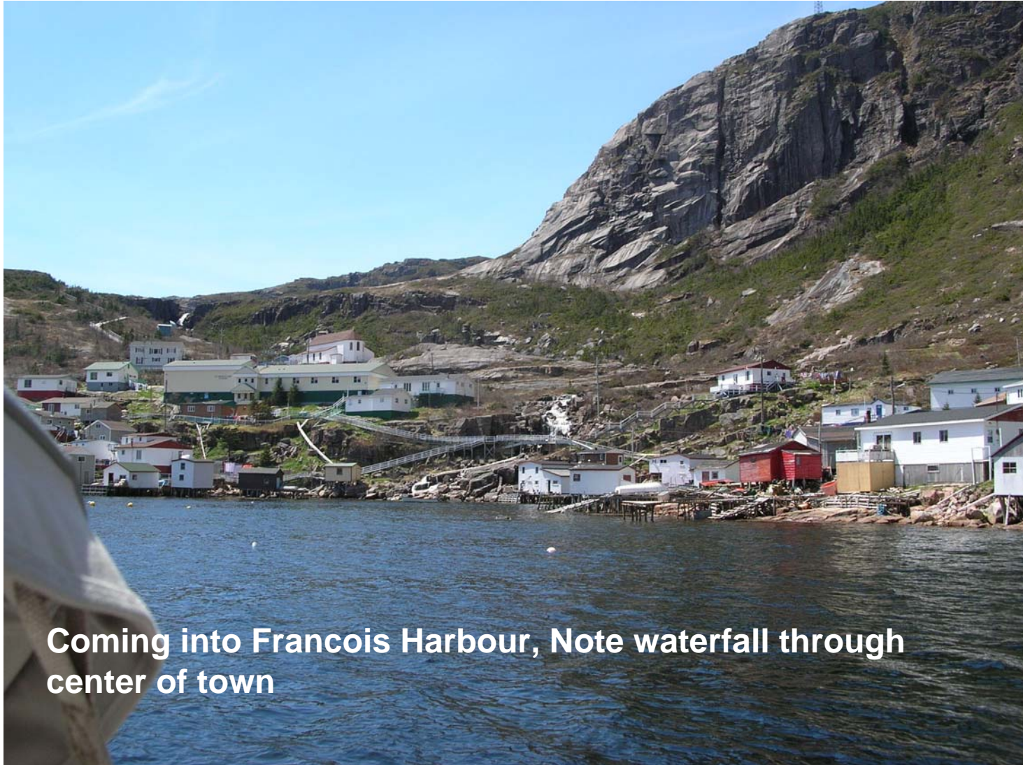
Coming into Francois Harbour, Note waterfall through center of town