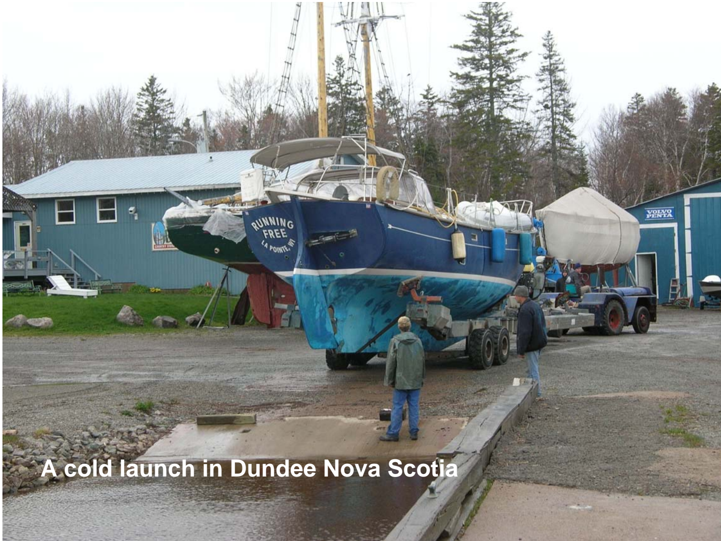
A cold launch in Dundee Nova Scotia