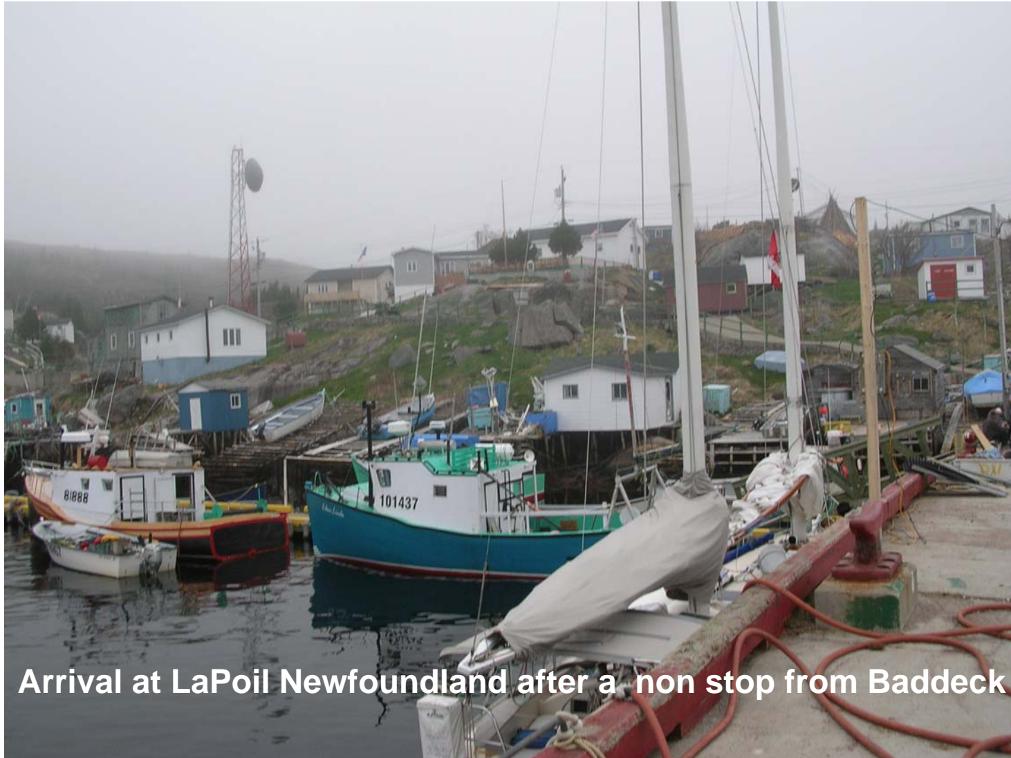
Arrival at LaPoil Newfoundland after a non stop from Baddeck