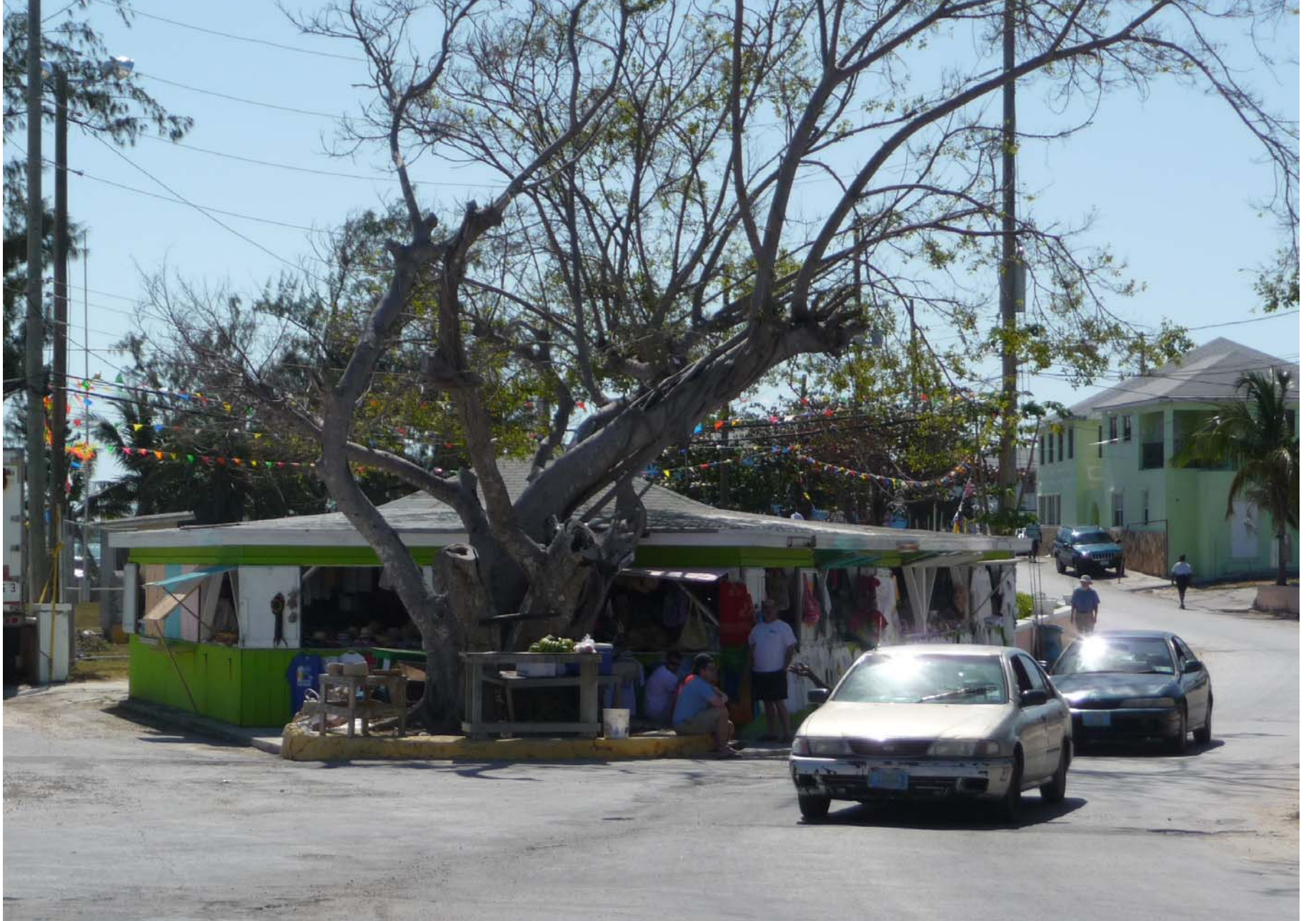
The Straw Market across from the library & the All-Ages School.