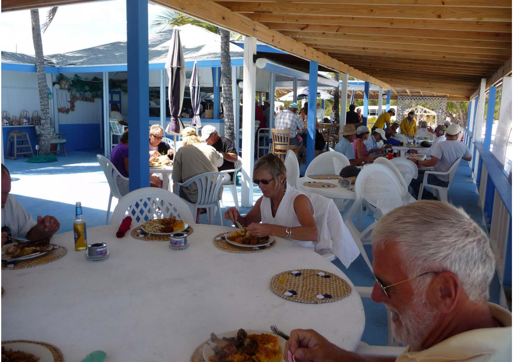
55 of us boaters took a tour of Exuma Island and ended up in Rolleville and had a wonderful buffet lunch at Exuma Point Restaurant.