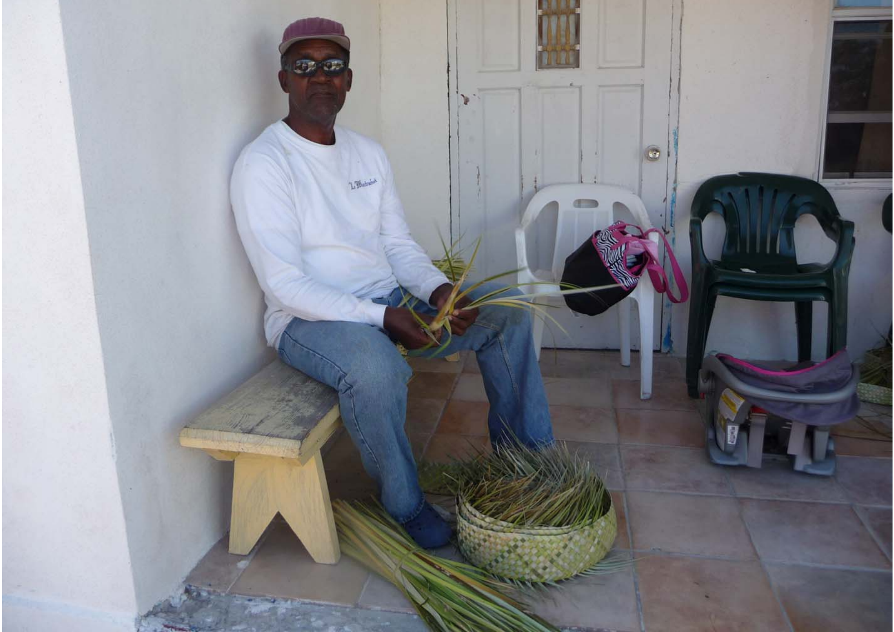
Weaving straw at Lorraine's Mom's house in Black Point.