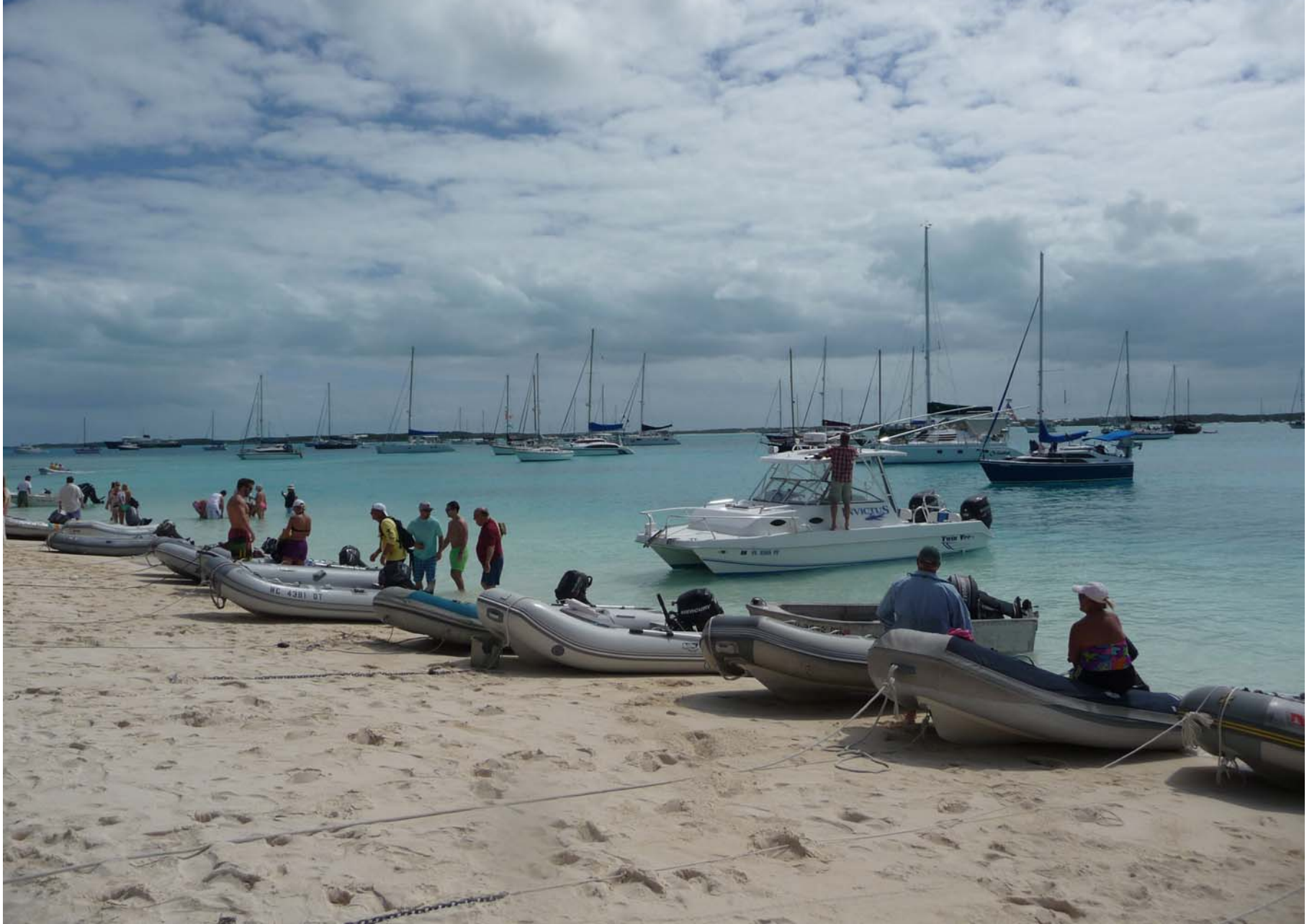
Sunday afternoon at Volleyball Beach. Gorgeous day.