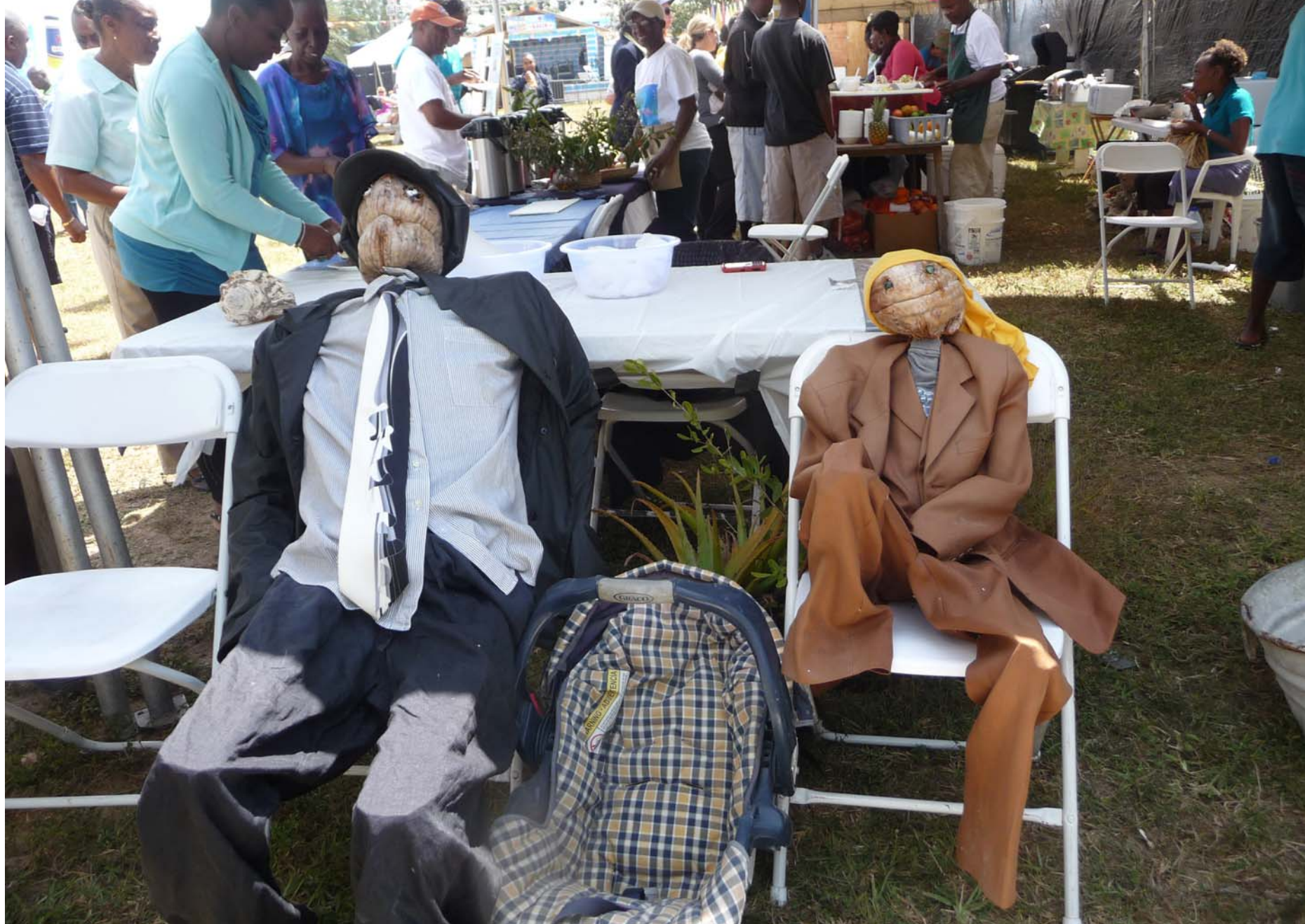
More coconut "people" by one of the food booths.