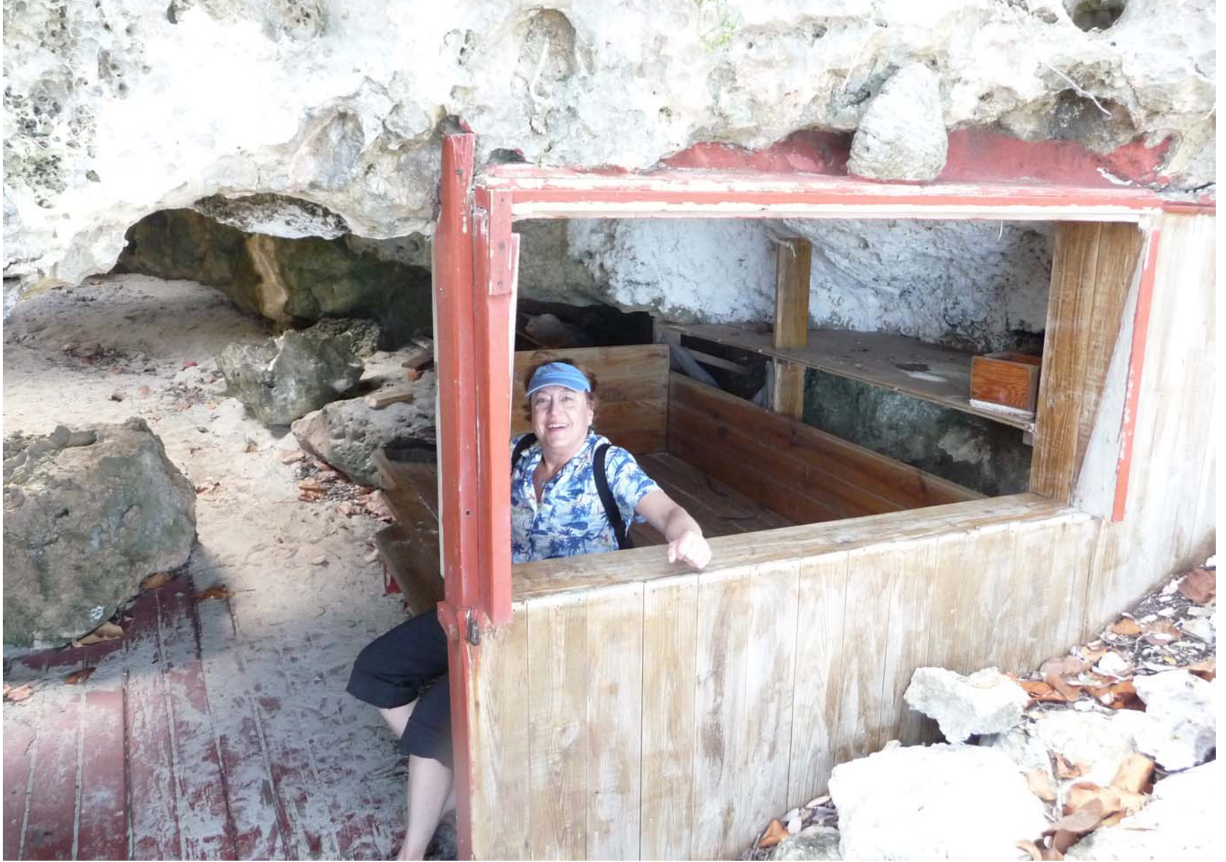
We explore a cave formerly occupied by freed slaves.