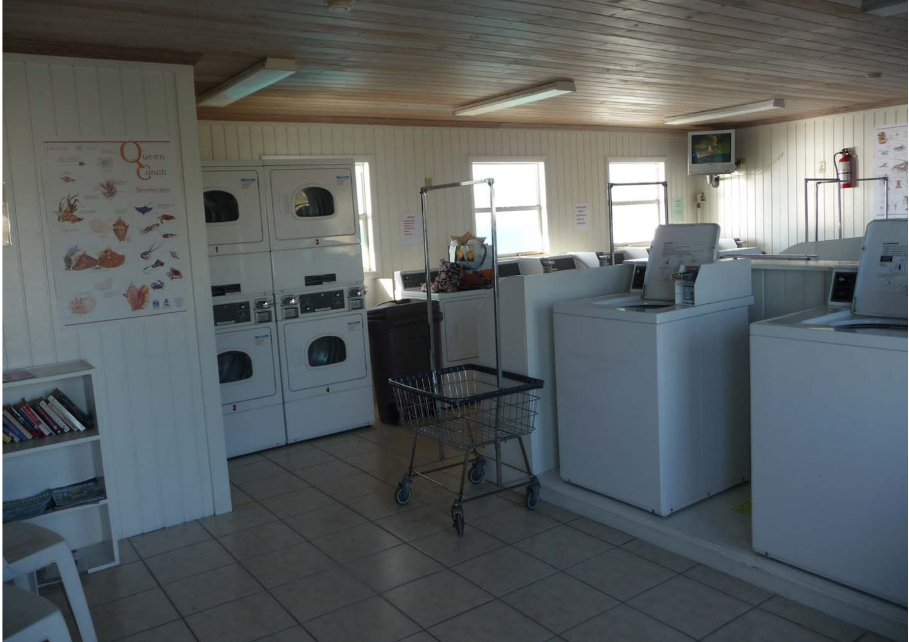
Ms. Ida's laundry in Black Point is where all the sailors go. Spotless place.