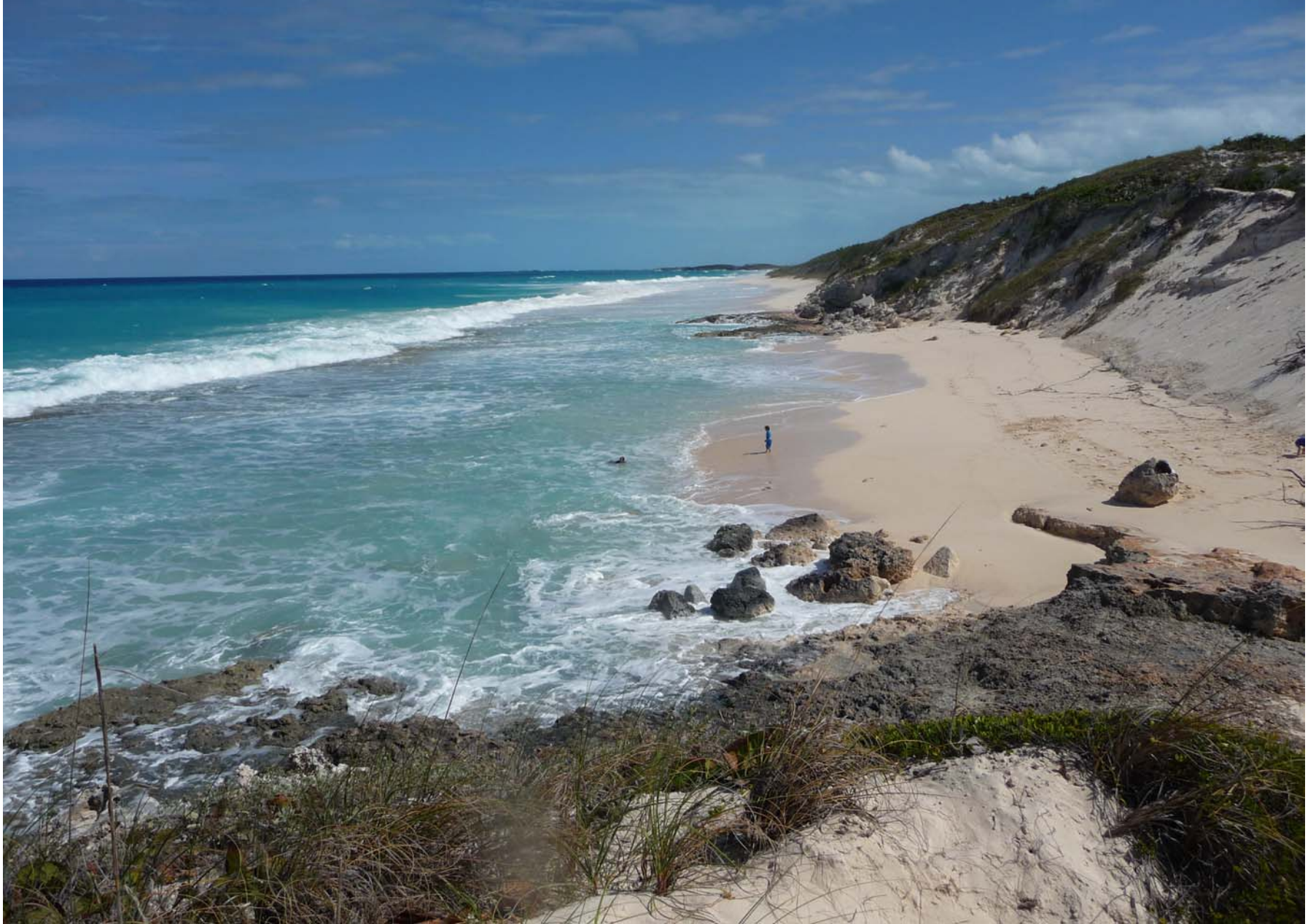
One of the beaches on the ocean side of Stocking Island.