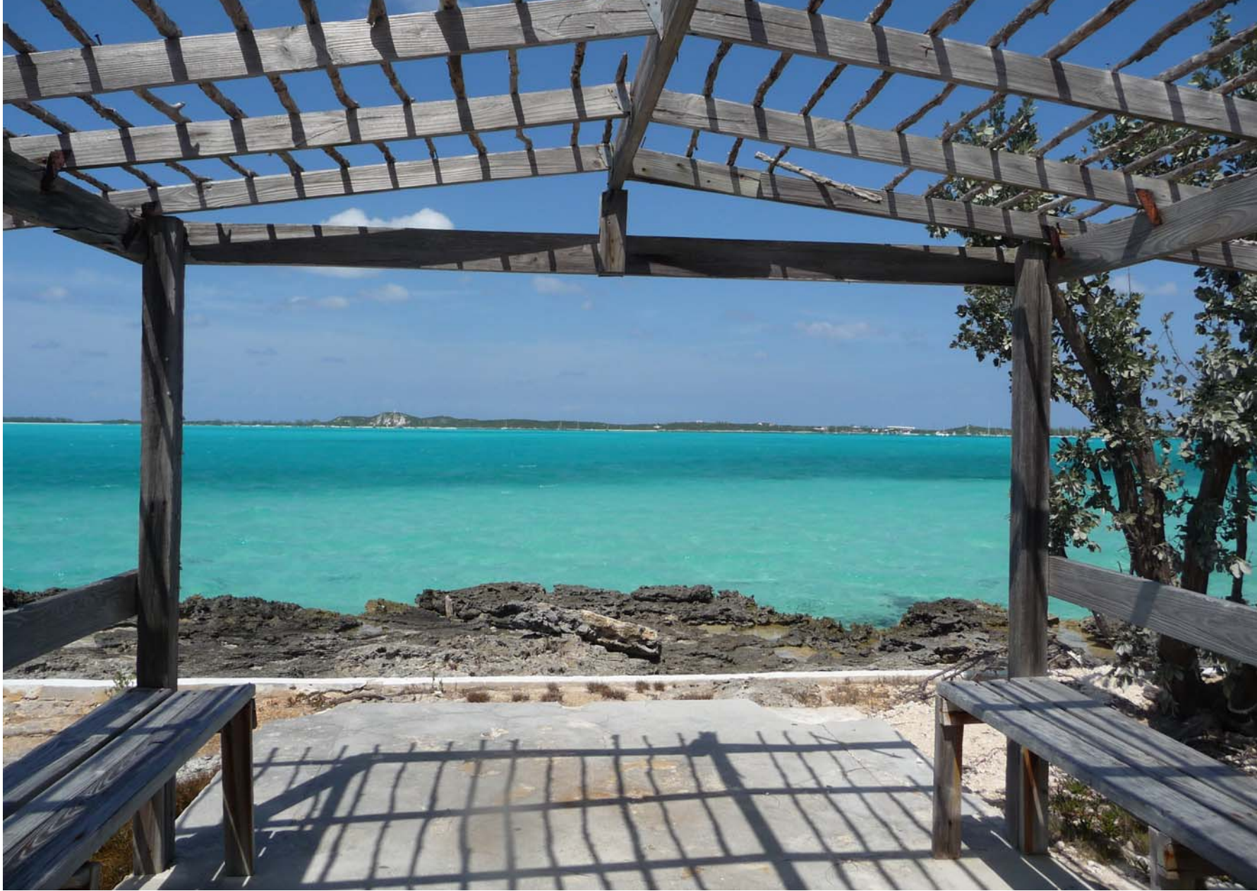
View from Regatta Point looking east to Monument Beach & Volleyball Beach where many boats are anchored.