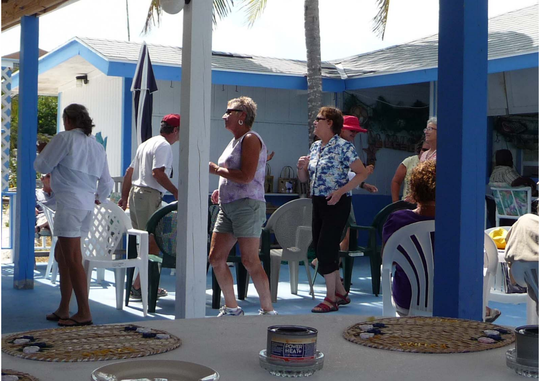
After lunch the restaurant had us boaters take part in “musical chairs”.