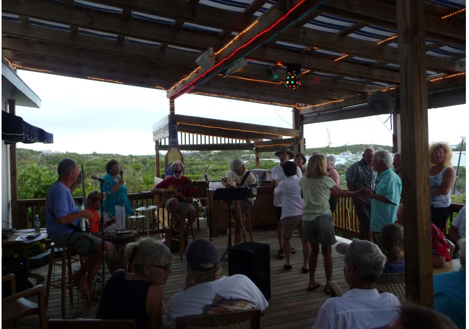
Sailors provide some good music at St. Francis Resort near Volleyball Beach.