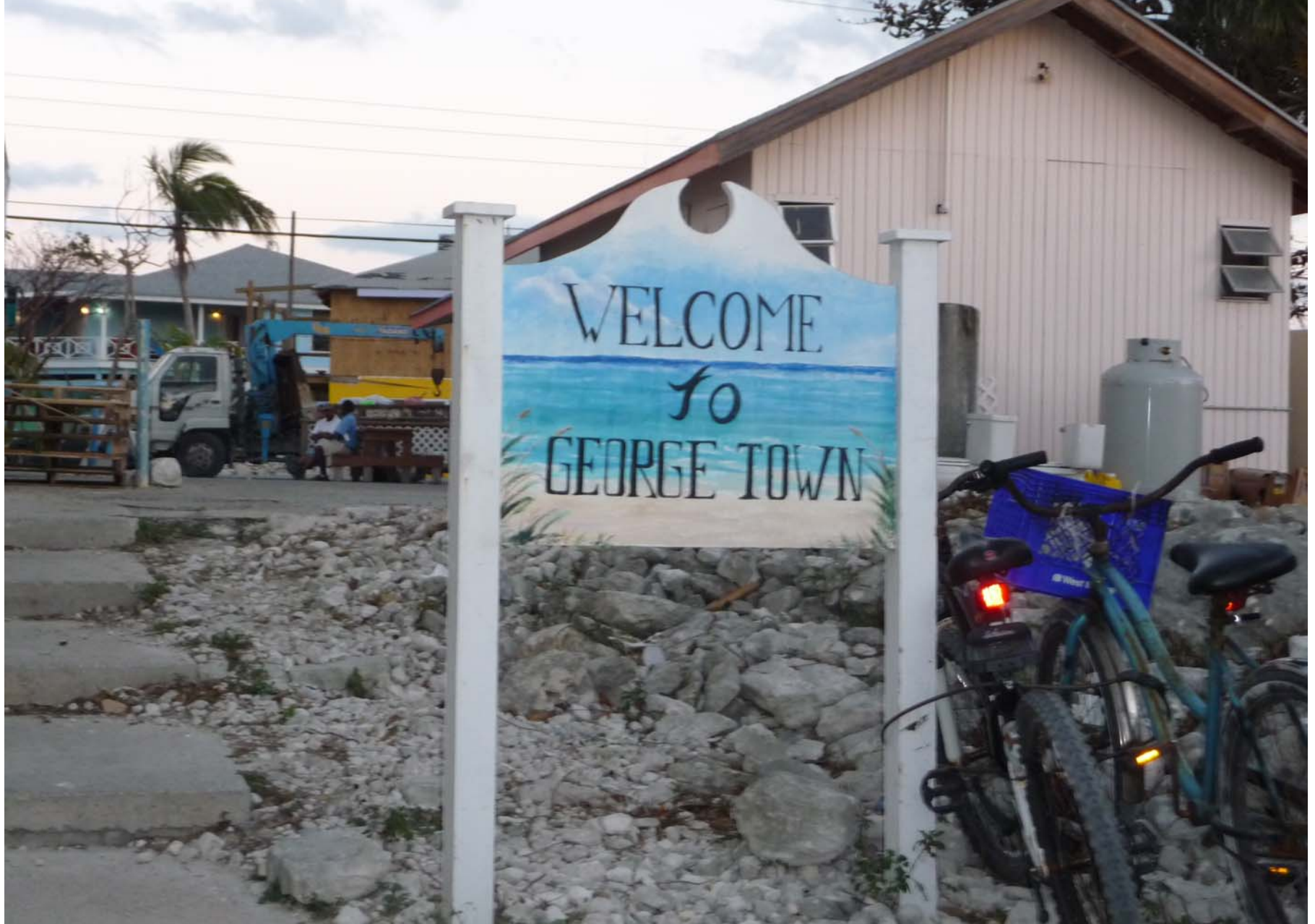
Good to be back in Georgetown, Great Exuma Island. It had been 14 years since we last were there on Running Free.