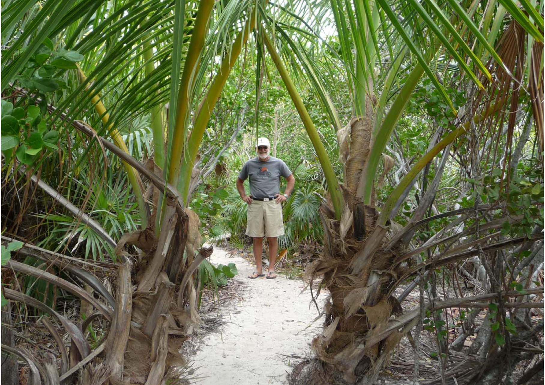
We walk one of the paths to the ocean side of Stocking Island.