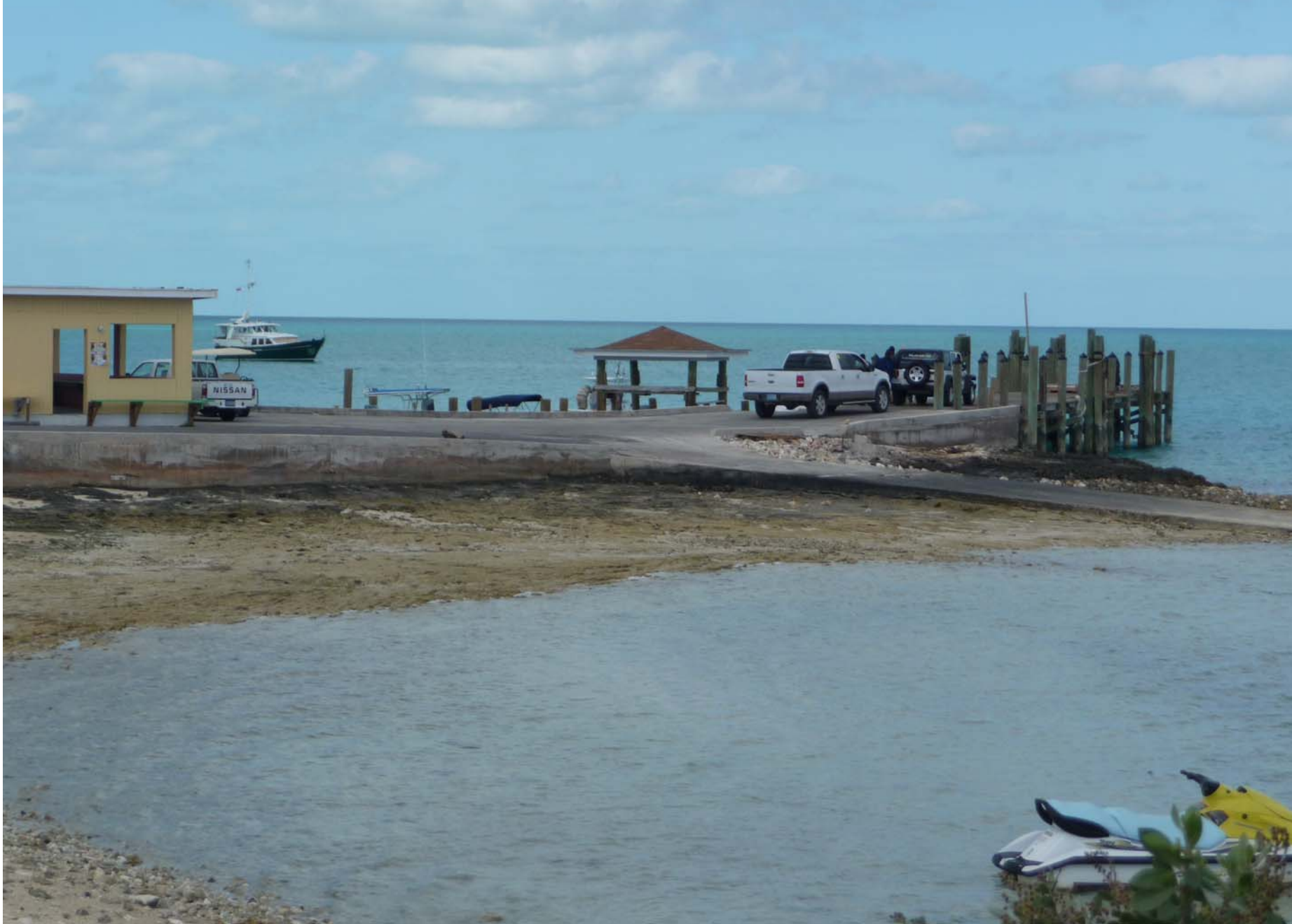
Black Point's government dock.