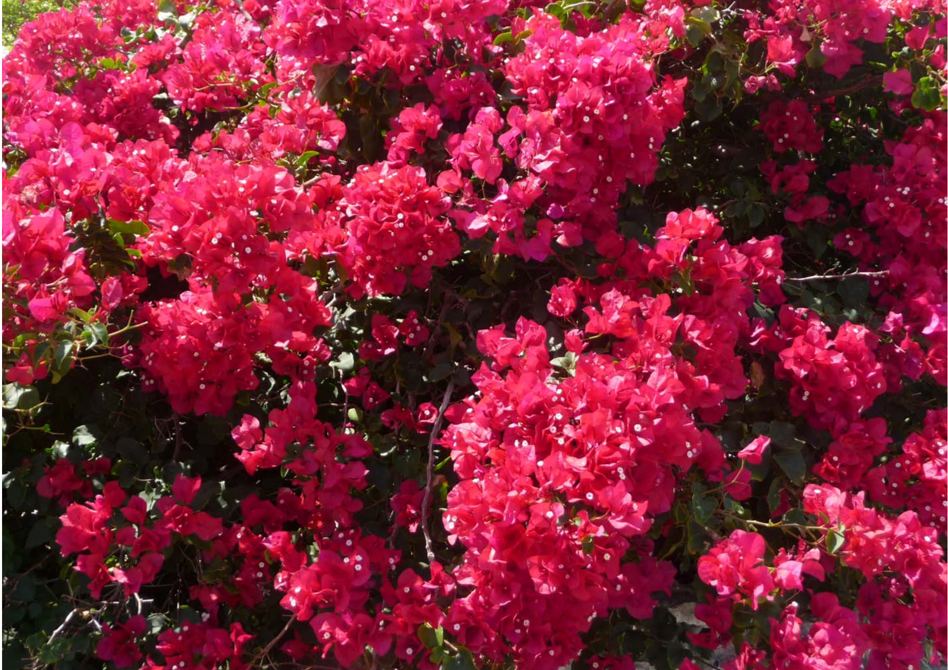
Lovely bougainvillea bushes of all colors by the Yacht Club.