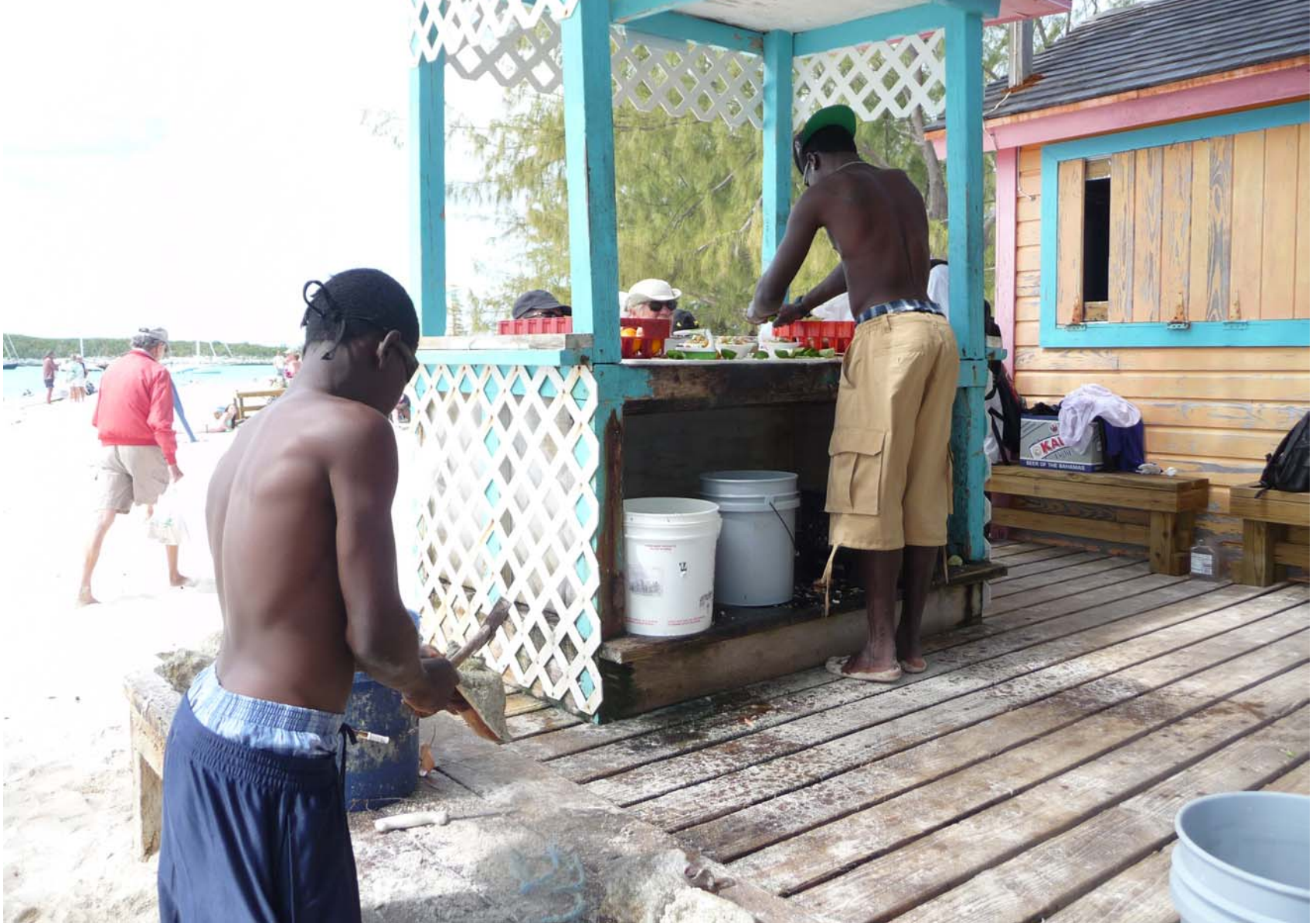
The Chat 'n Chill's "Conch Shack". These guys make the BEST conch salad!