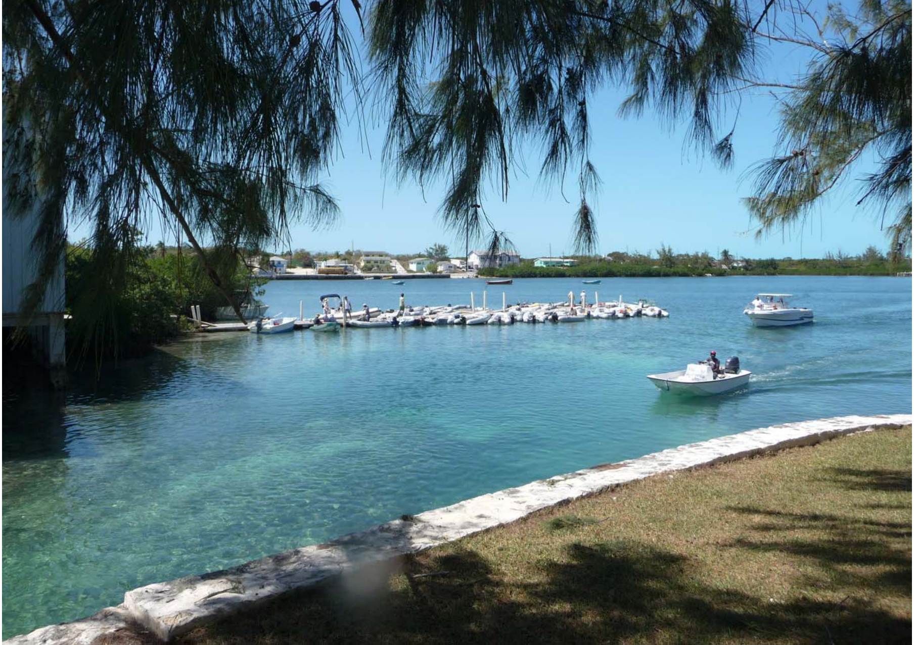
Lake Victoria and the packed dinghy dock in Georgetown.