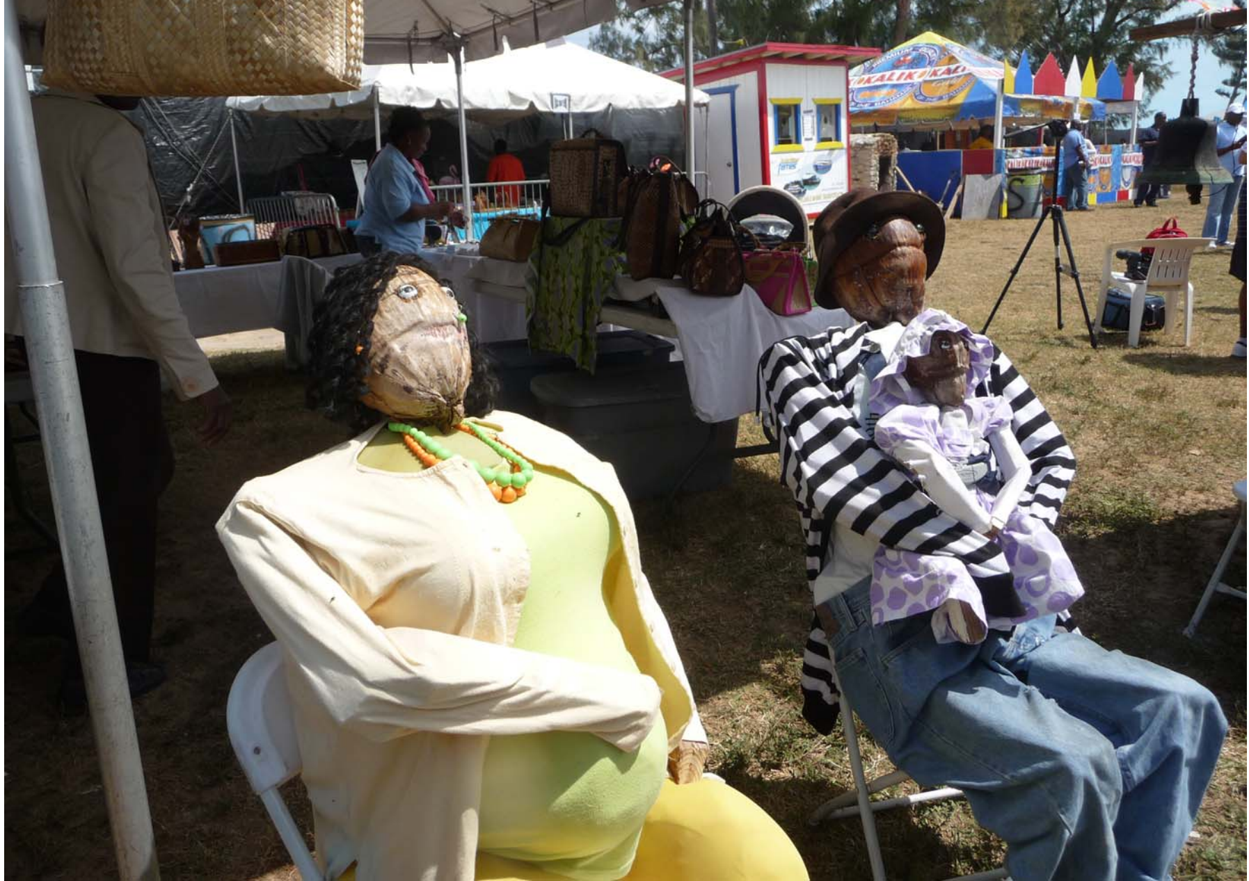
Music Festival in Georgetown. These coconut “people” got our attention.