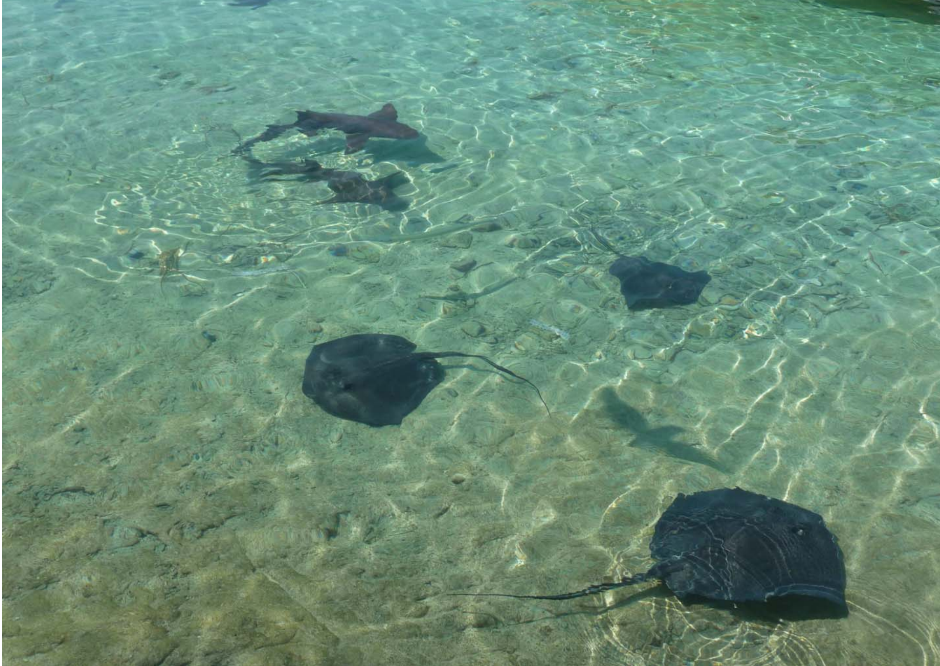
Rays & nurse sharks show up for fish scraps at the Staniel Cay Yacht Club.