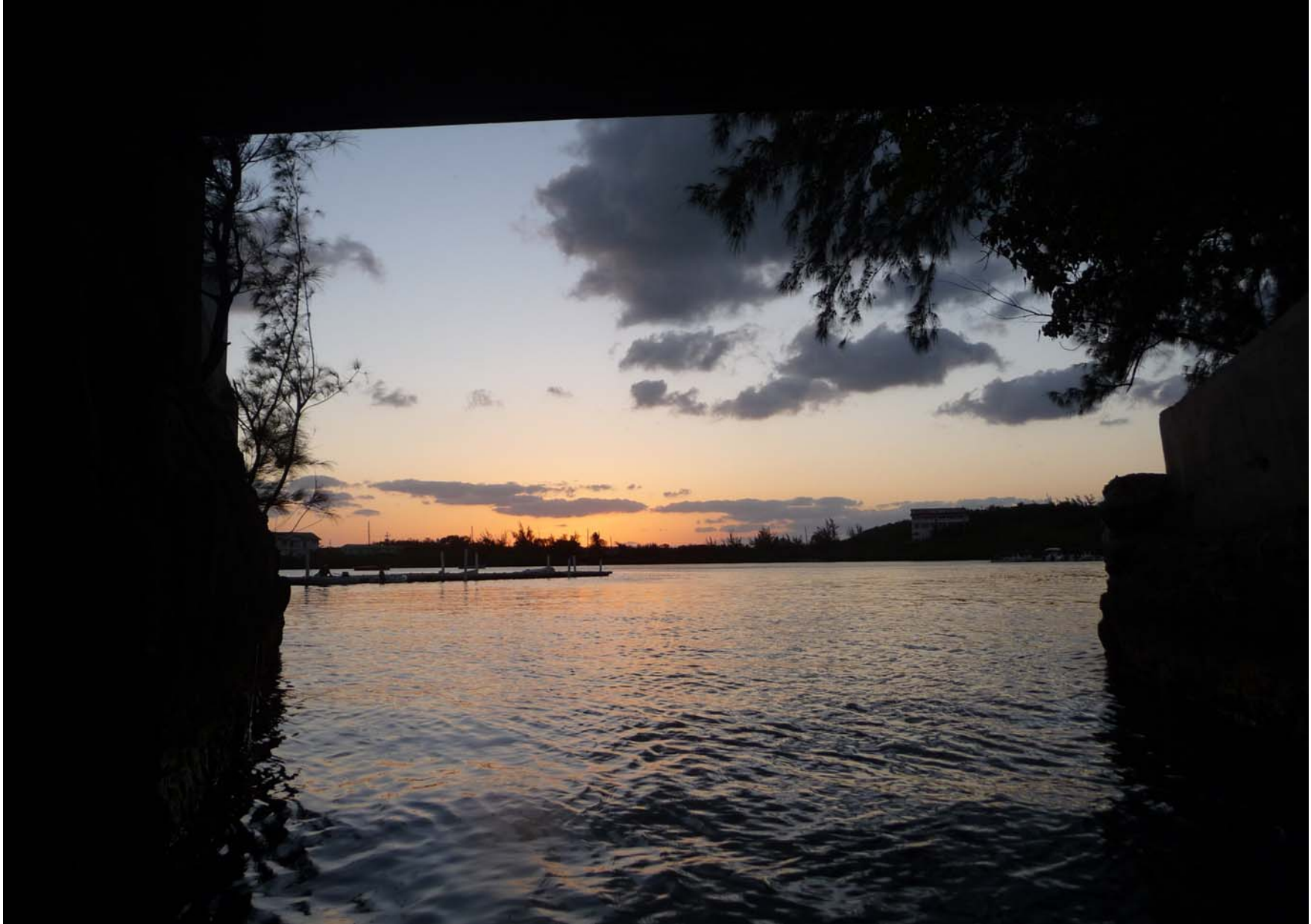
This is going into Lake Victoria and the dinghy dock in Georgetown at sunset to go eat at the Peace 'n Plenty.