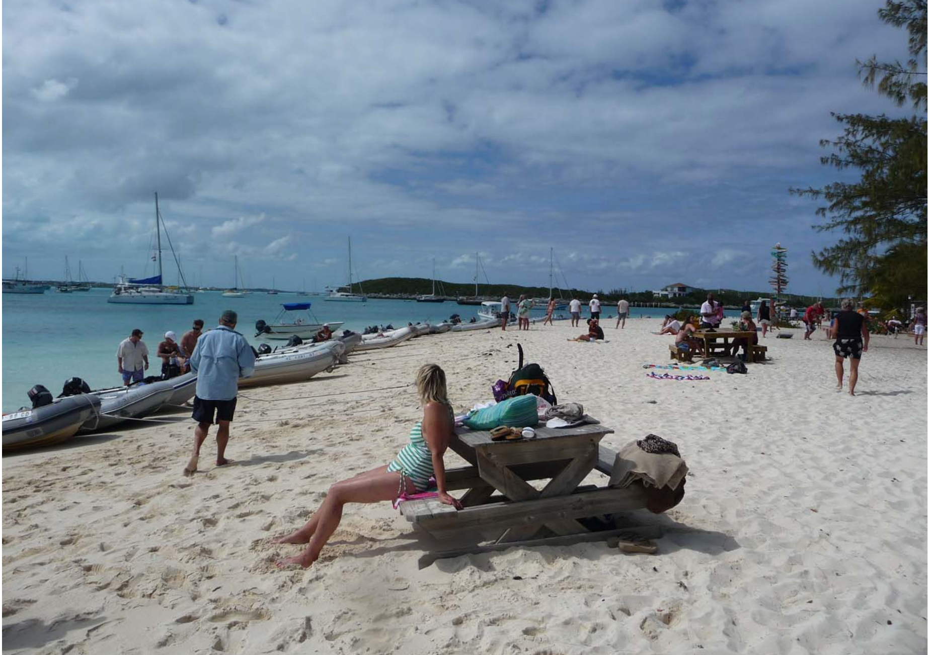
Volleyball Beach scene on a Sunday afternoon. Very laid back place.