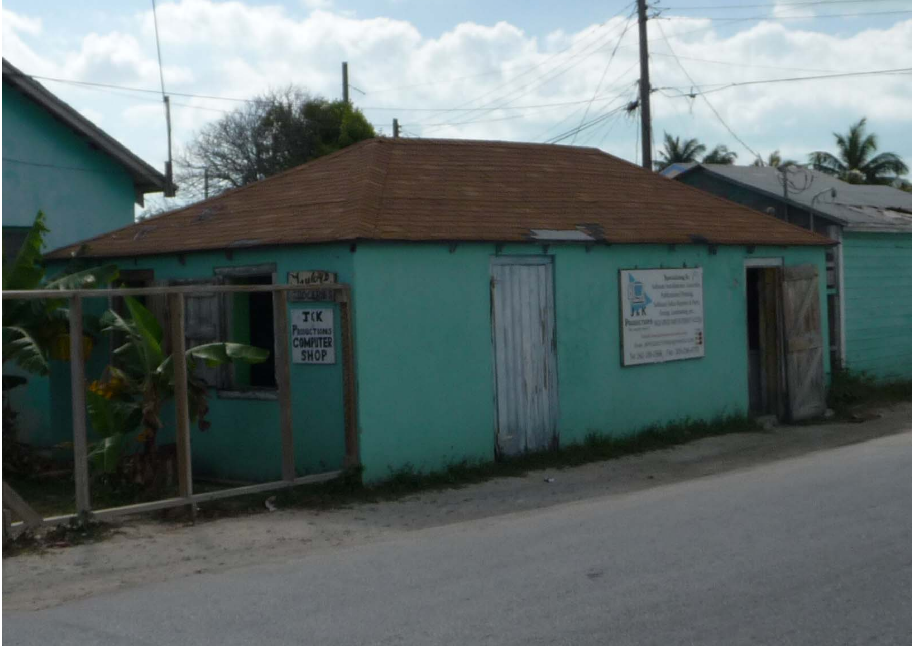
J & K Productions & Computer Shop where the WiFi coverage is good.