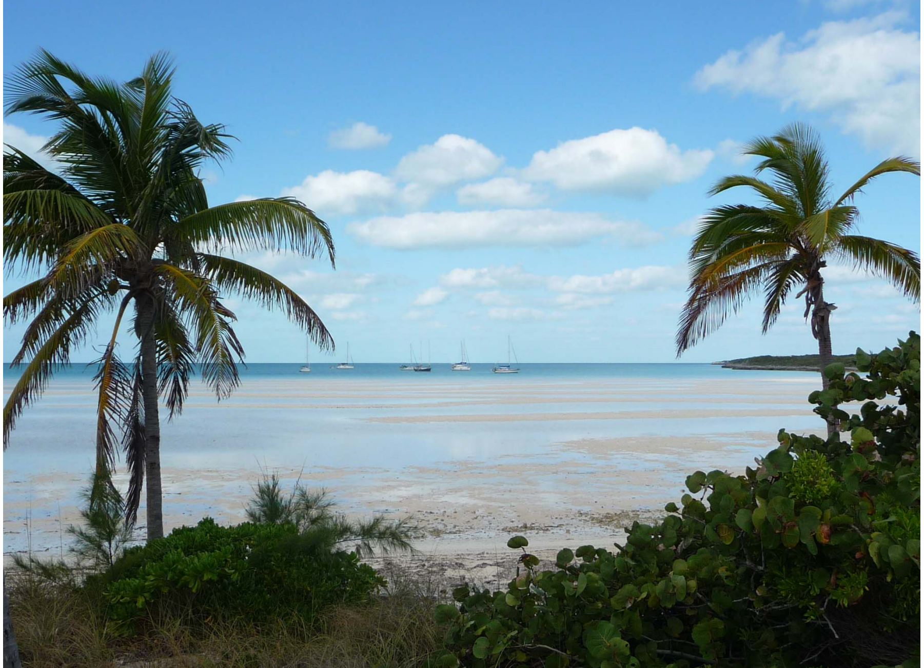
Low tide at Black Point Settlement, 3/5/13.