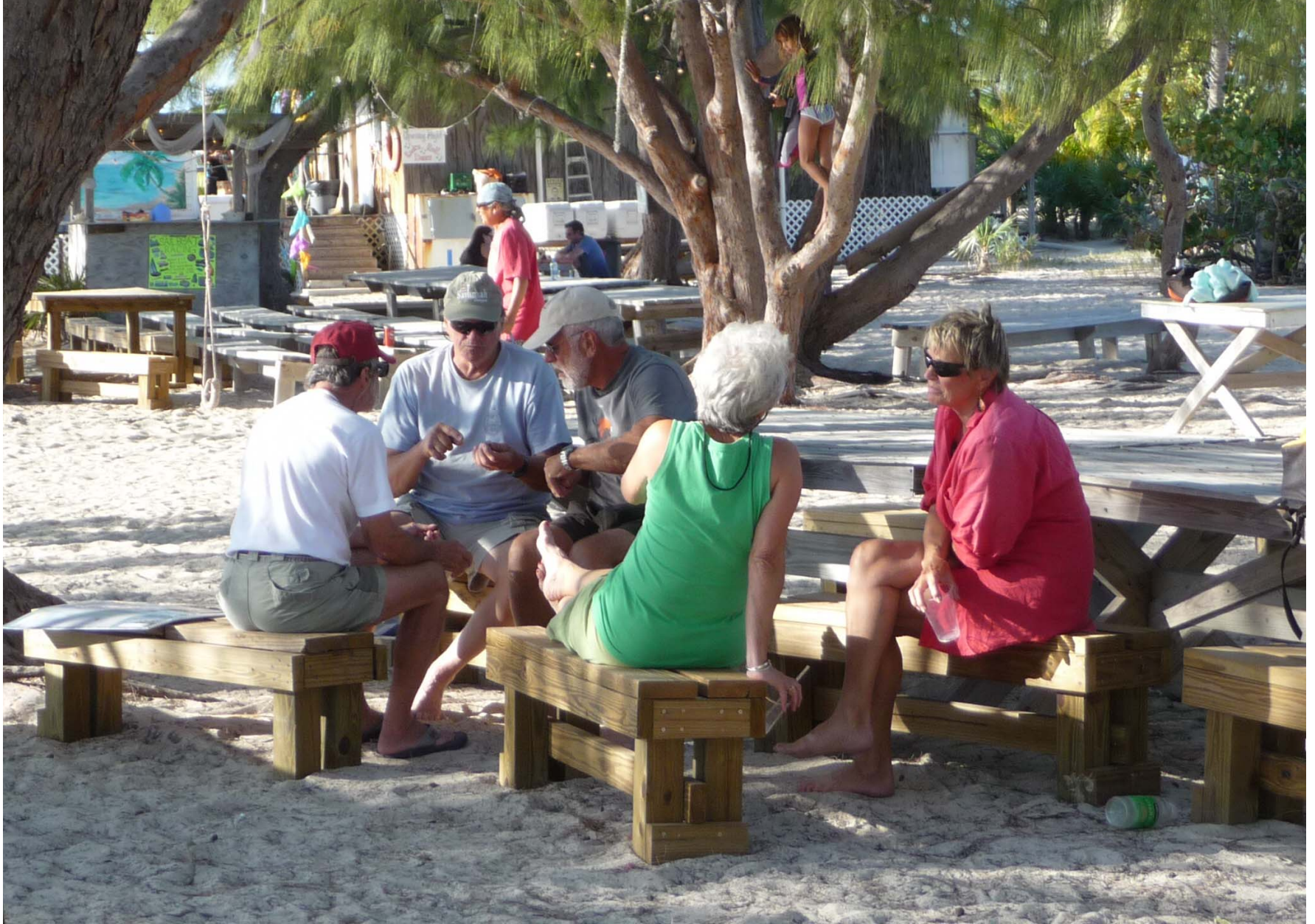
Late afternoon discussions among us sailors on Meltemi, Summer of '42 & Running Free.