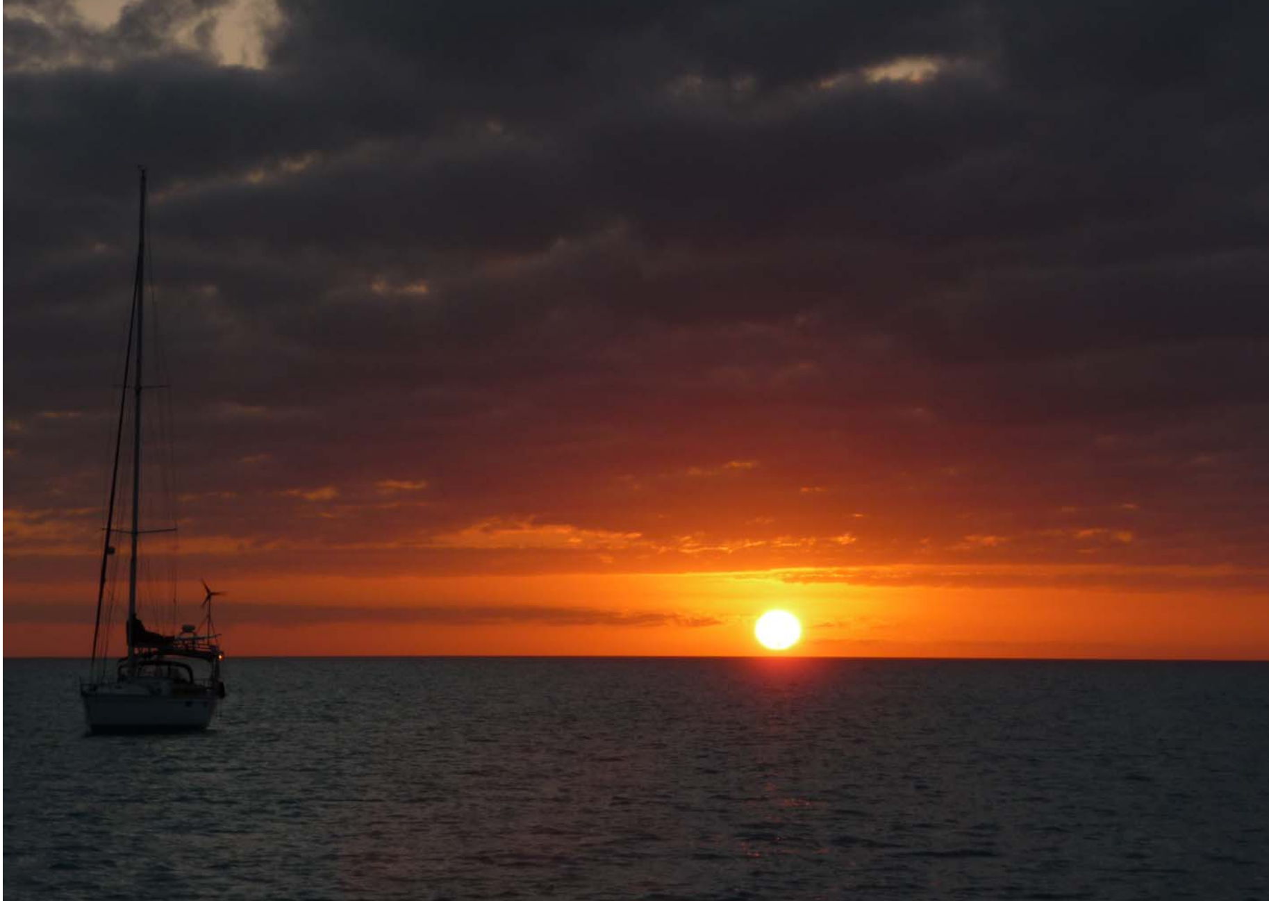
Black Point sunset.