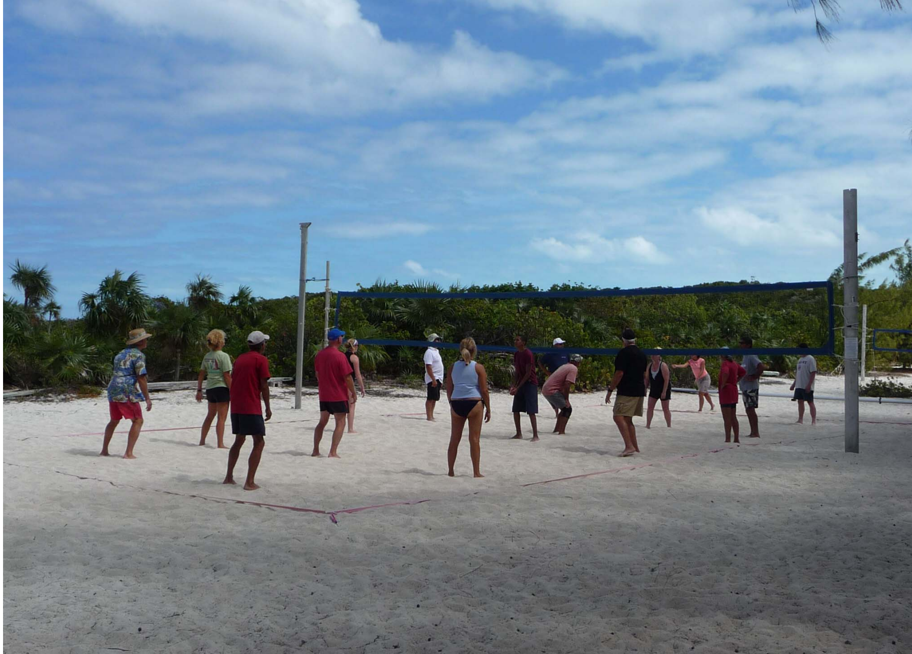
A volleyball game at Volleyball Beach.