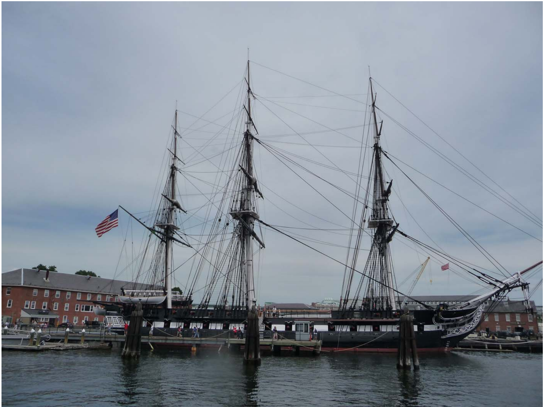
The U.S.S. Constitution in Boston Harbor at the Navy Shipyard.