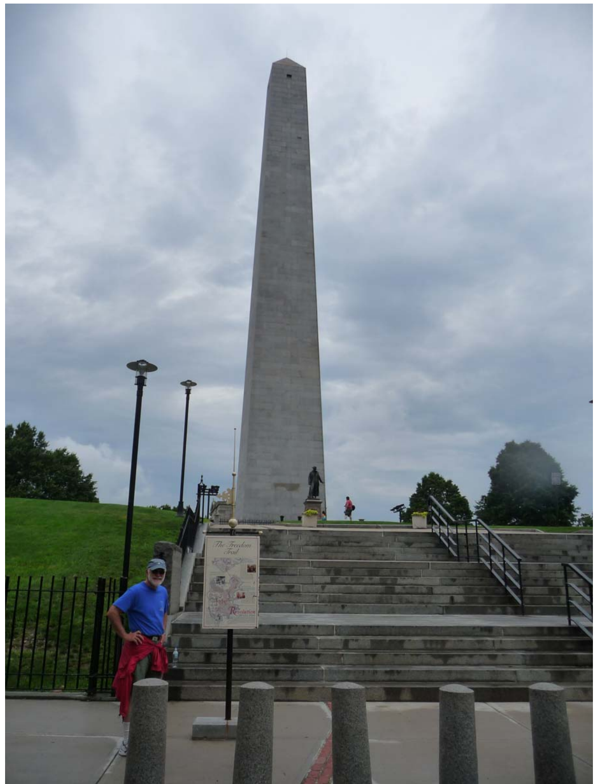
The Bunker Hill monument.