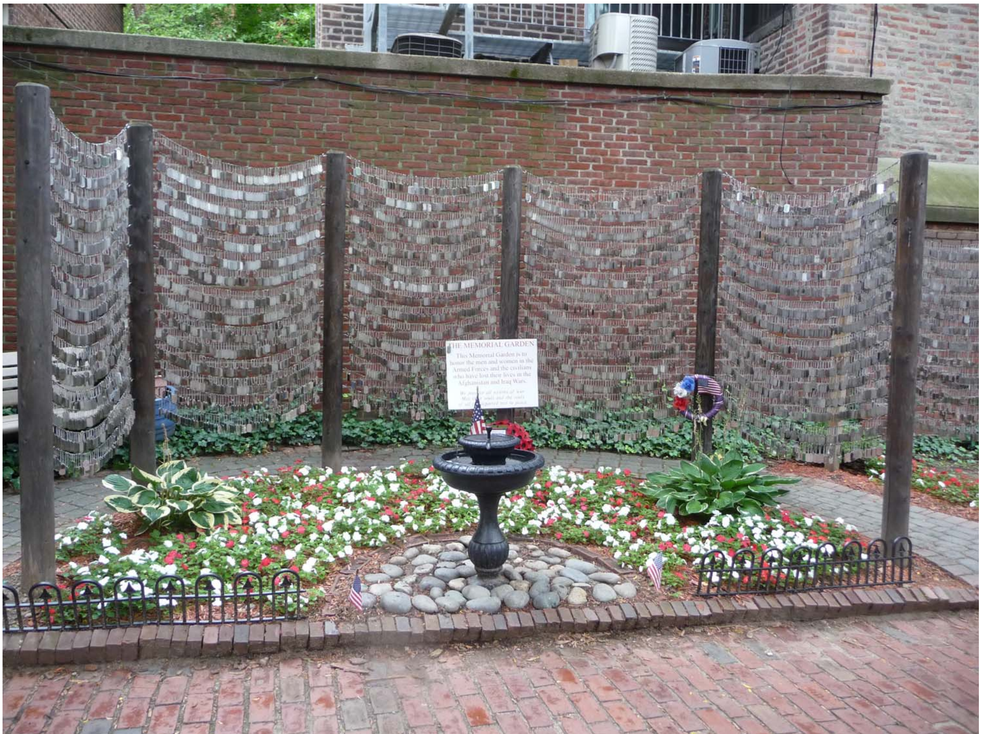
Thousands of dog tags commemorating all the lives lost in the Iraq War.