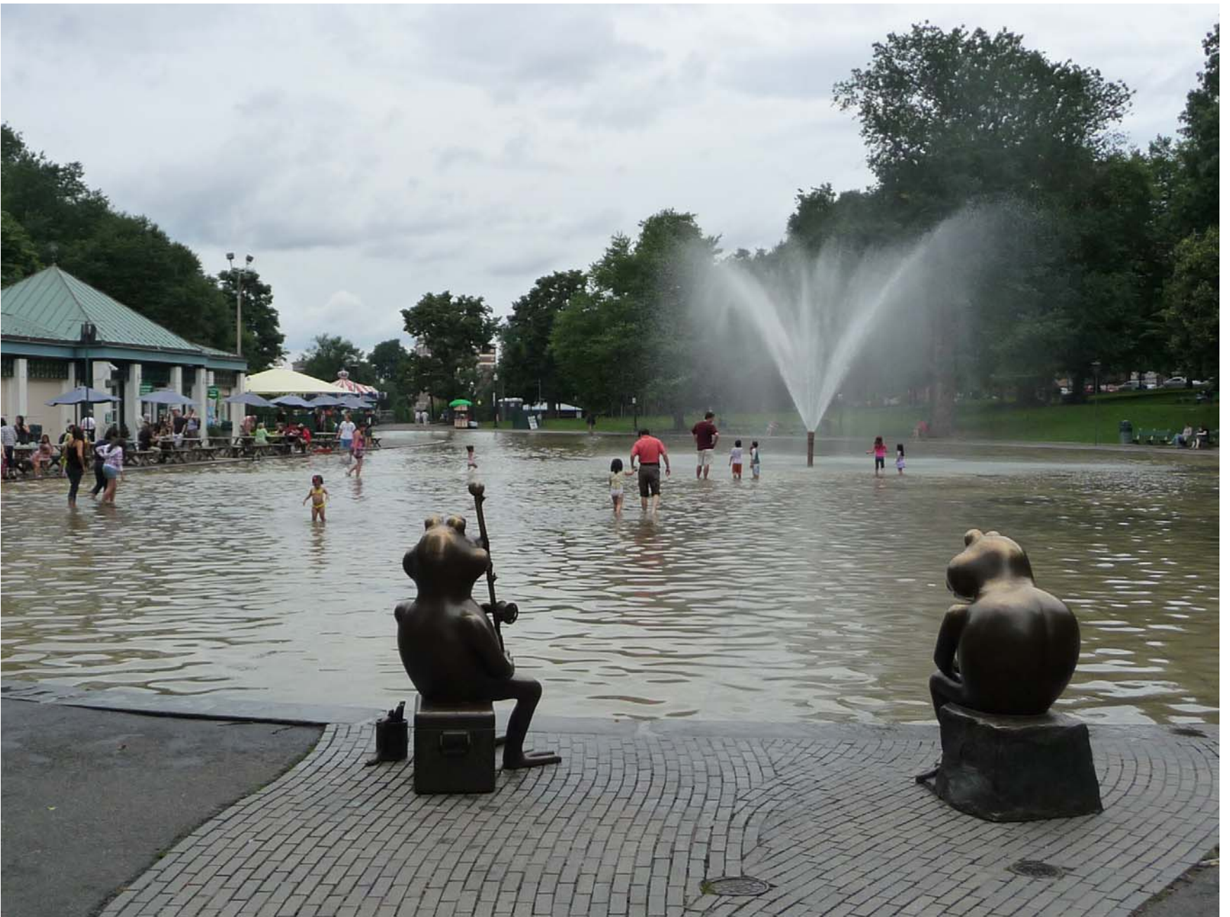
Frog Pond in Boston Common.