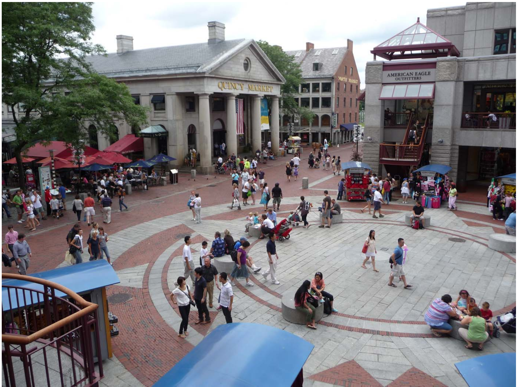
The wonderful Quincy Market by Faneuil Hall.