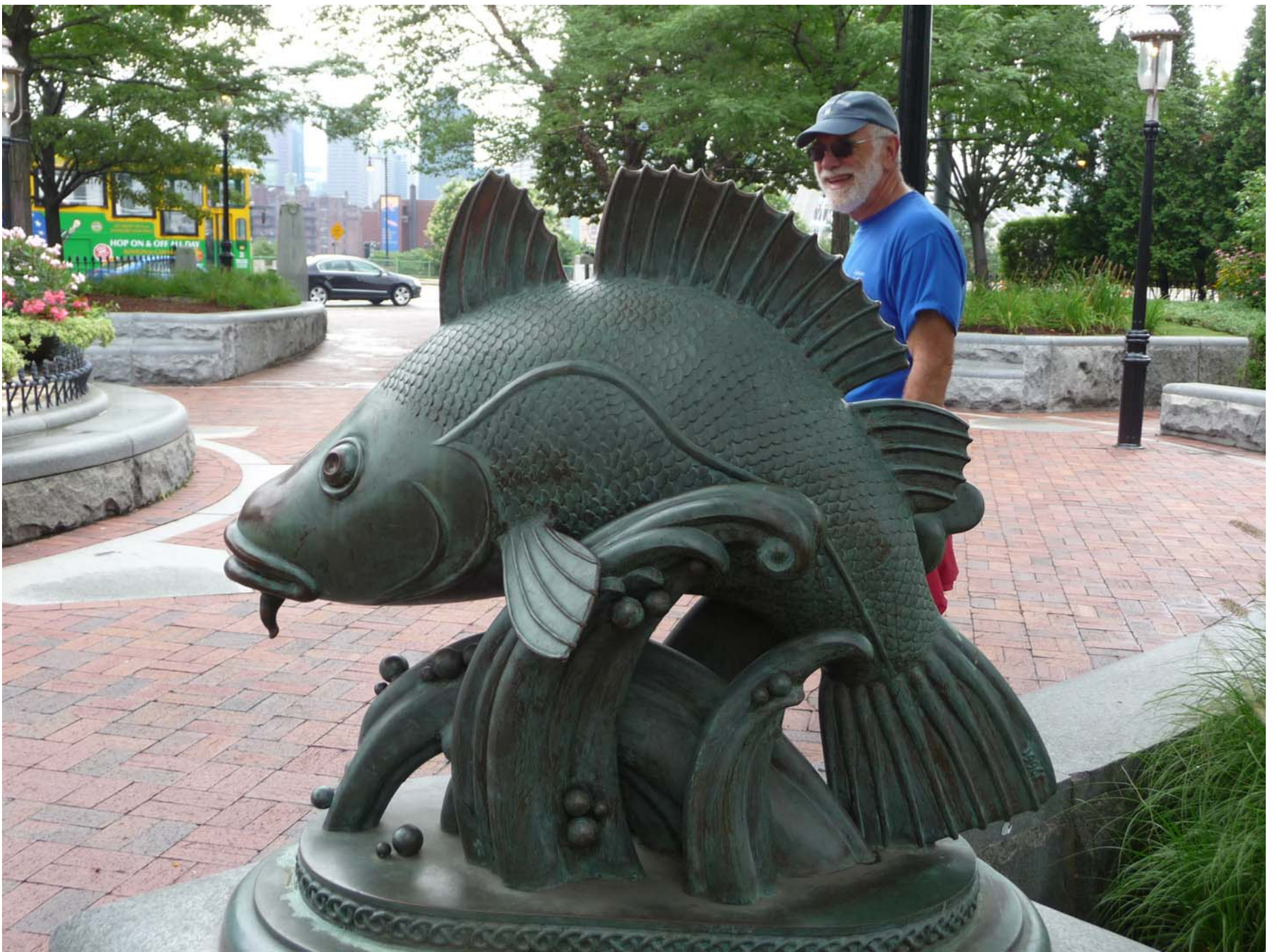
A cod sculpture near Bunker Hill.