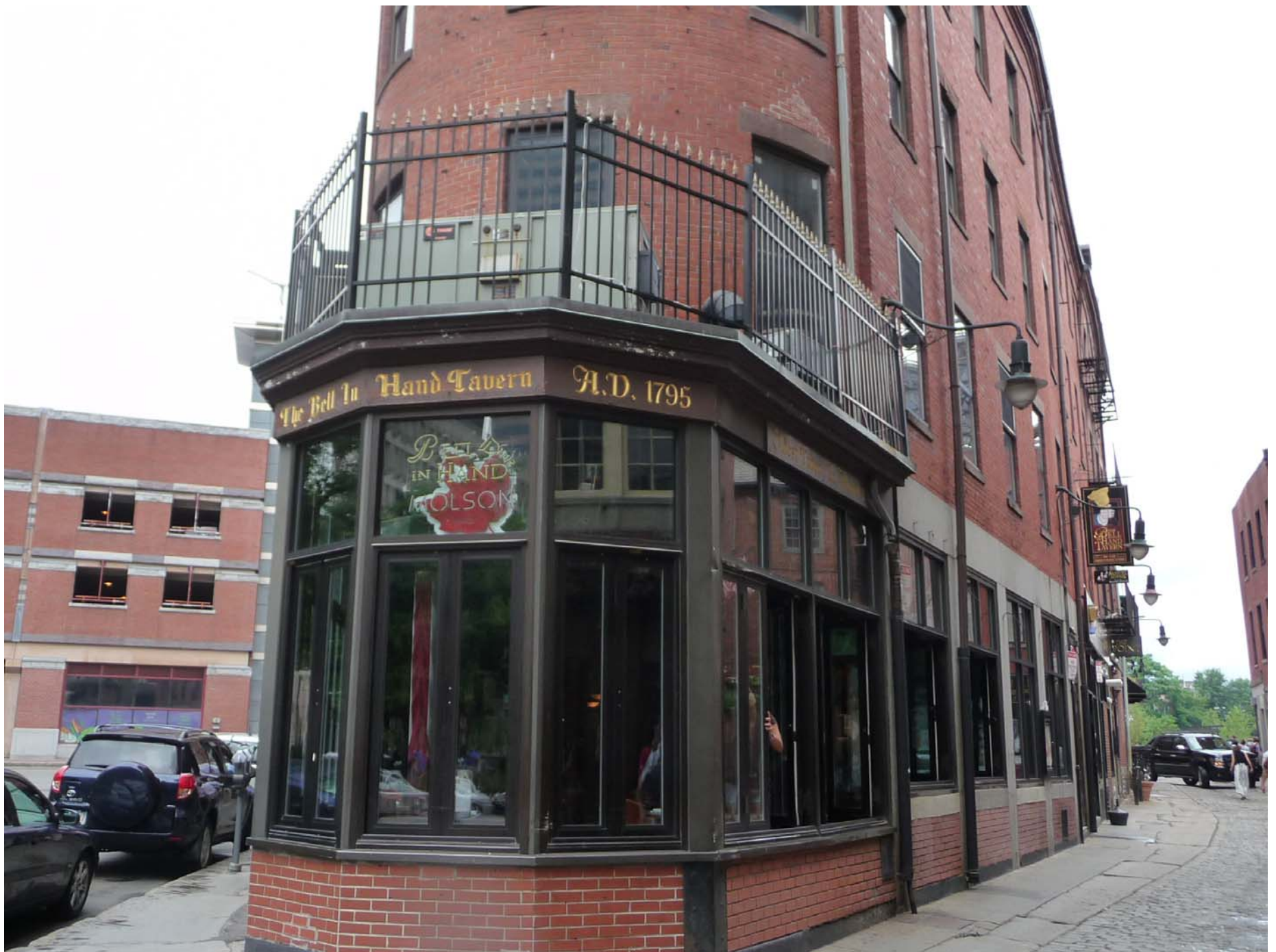
Bell In Hand tavern from 1795. Oldest tavern in the U.S.