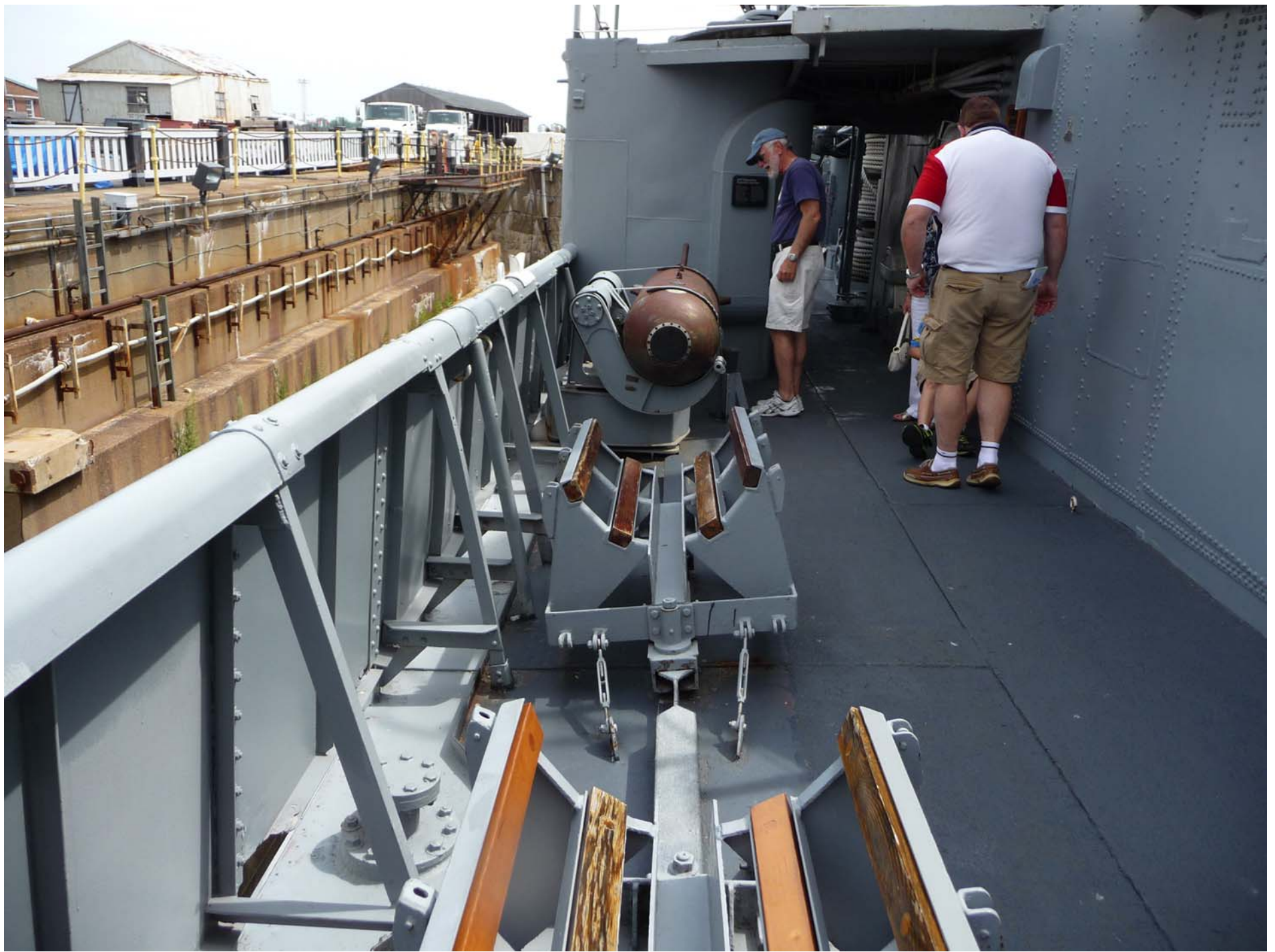
Carl looking at a torpedo on the ship.