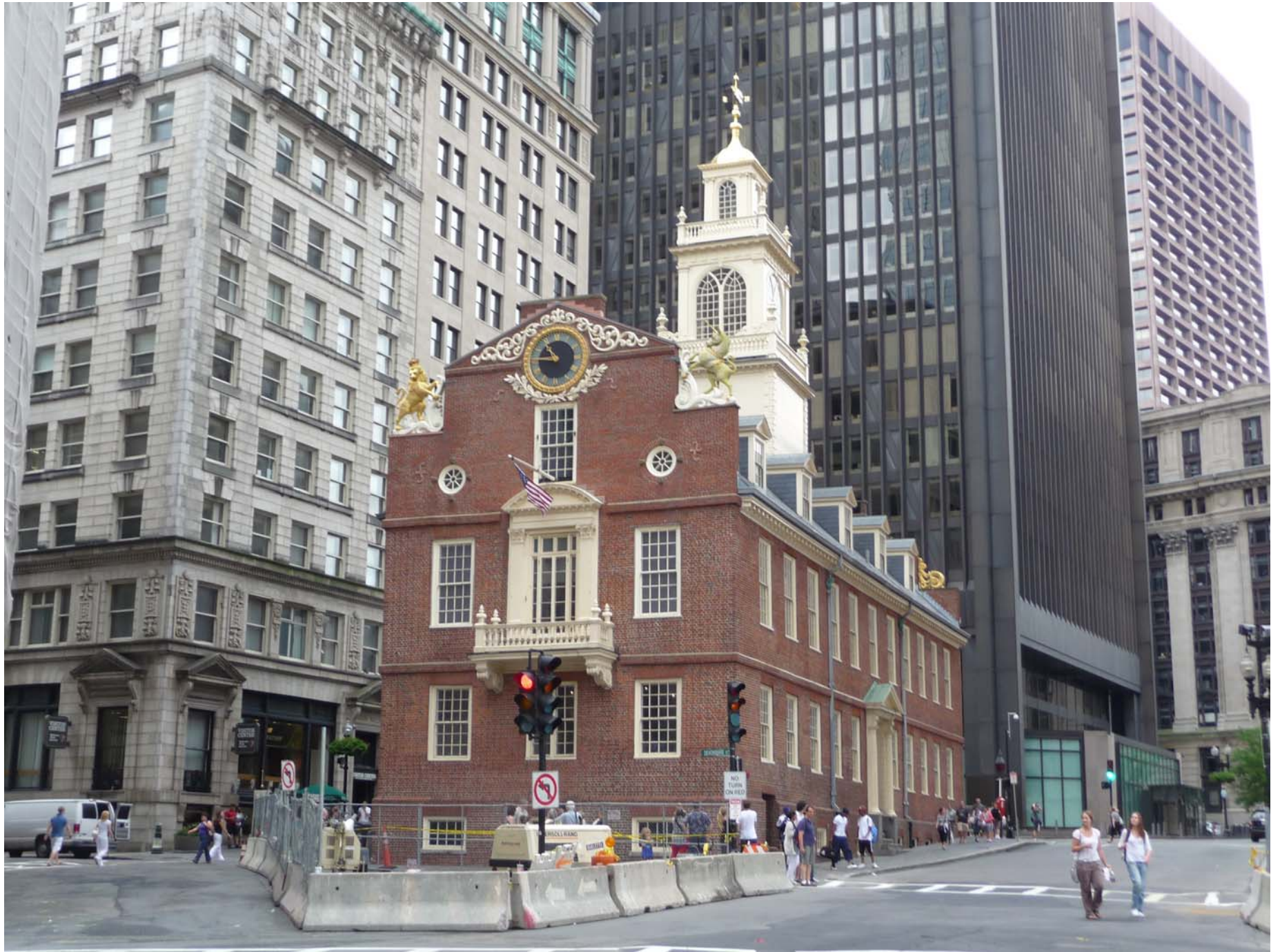
Old State House where the Boston Massacre took place. The British shot a many American colonists here