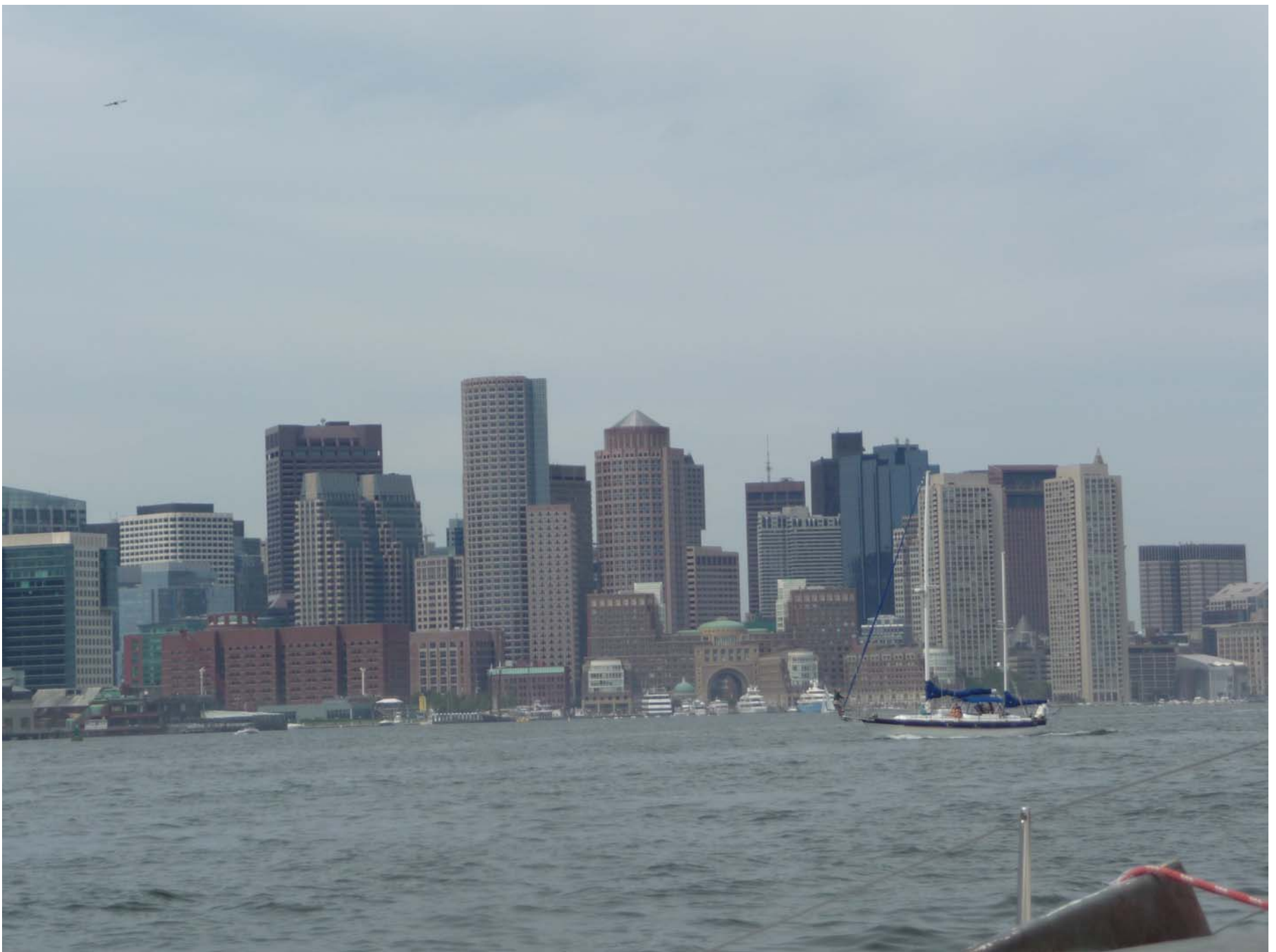
We arrive in Boston, August 13, 2011.