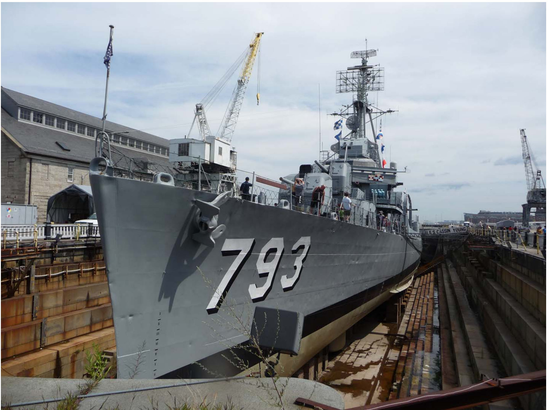
The U.S.S. Cassin Young in drydock dedicated by President Andrew Jackson at the Navy yard.