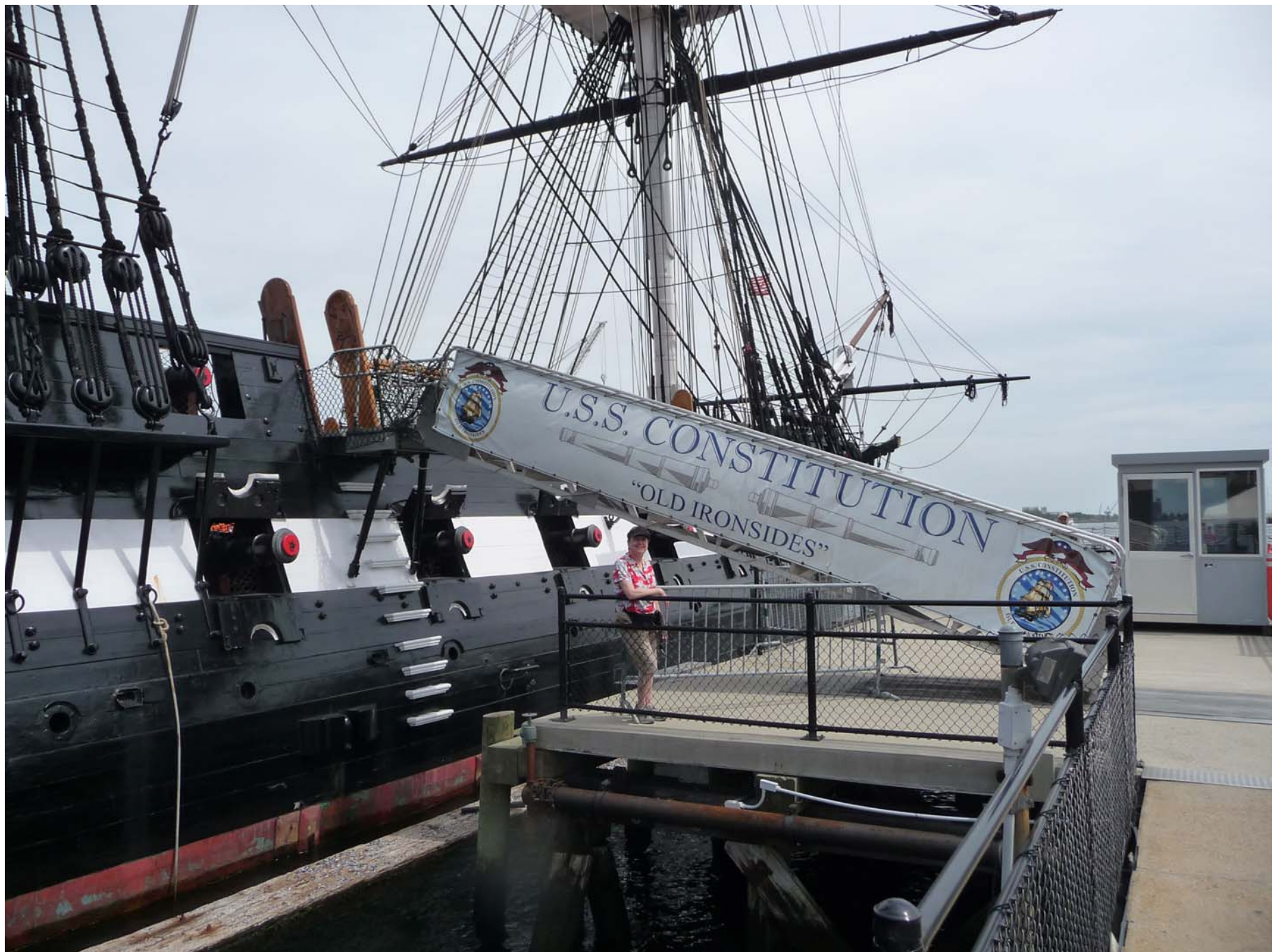
The U.S.S. Constitution "Old Ironsides" is located near the marina.