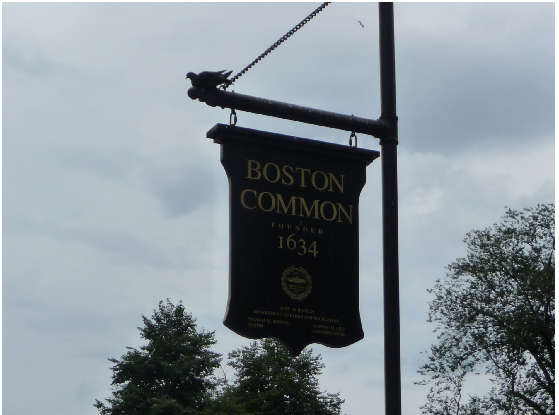
Boston Common park on Tremont Street.