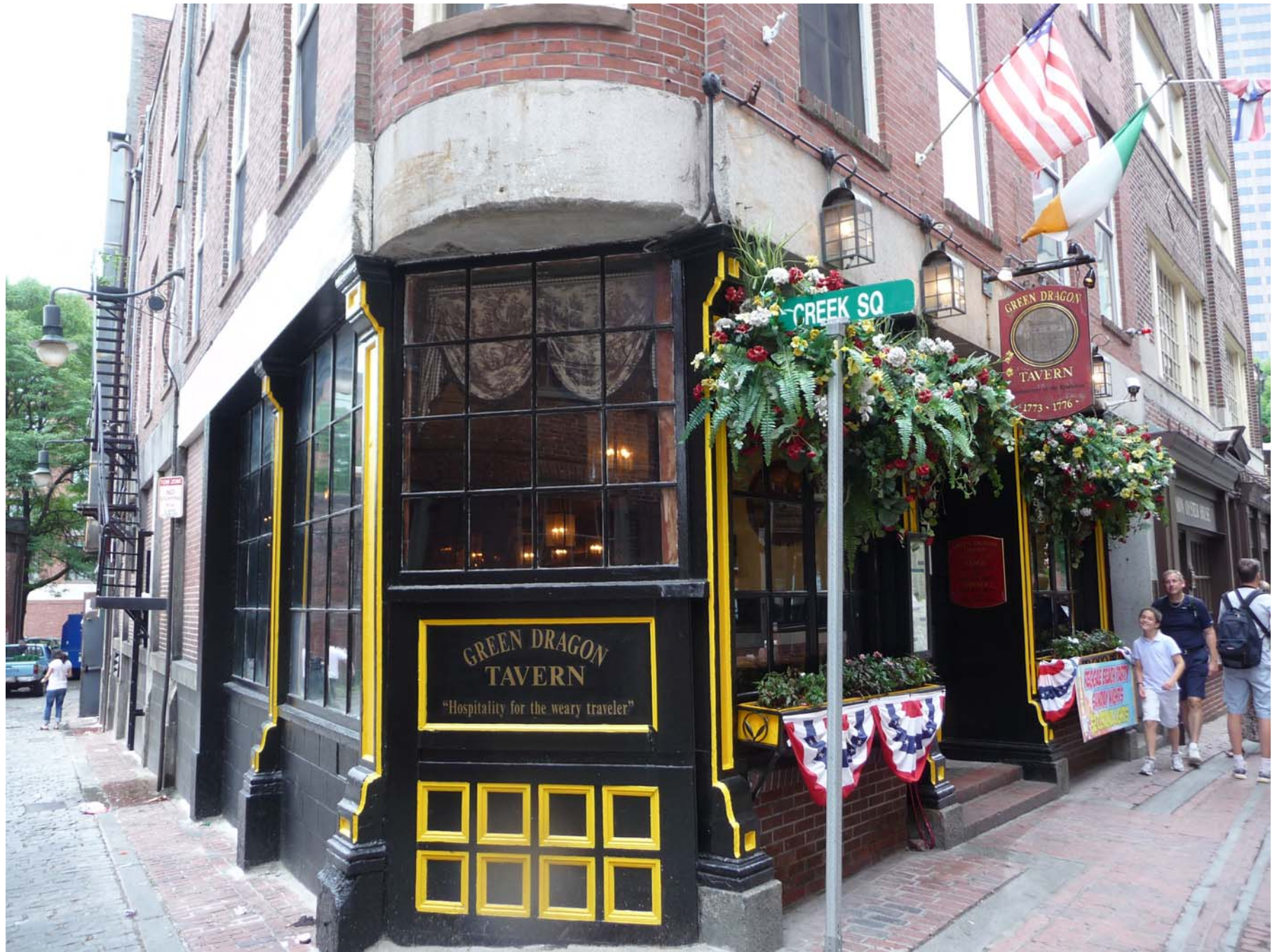
The Green Dragon Tavern where the Revolutionaries planned the Boston Tea Party.