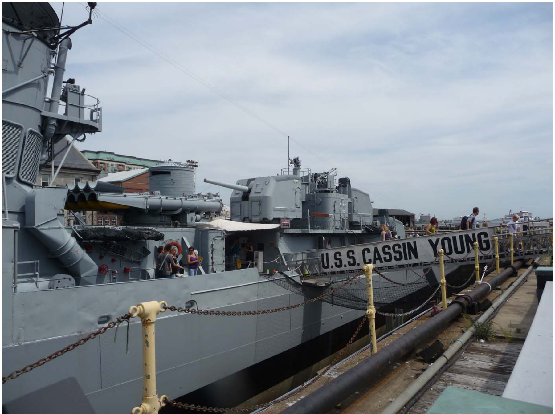
The U.S.S. Cassin Young museum ship. It survived 2 kamikaze attacks during WWII.