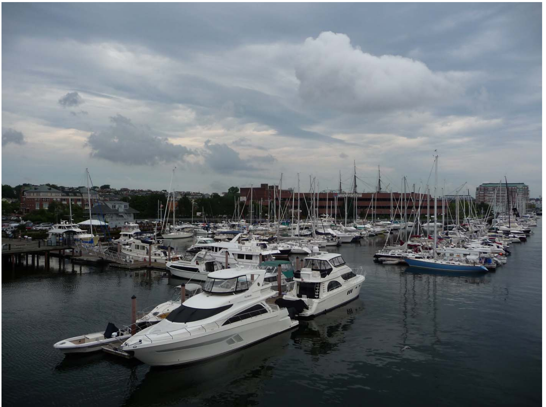
Another view of the marina. About 90 people live on their boats there year round.