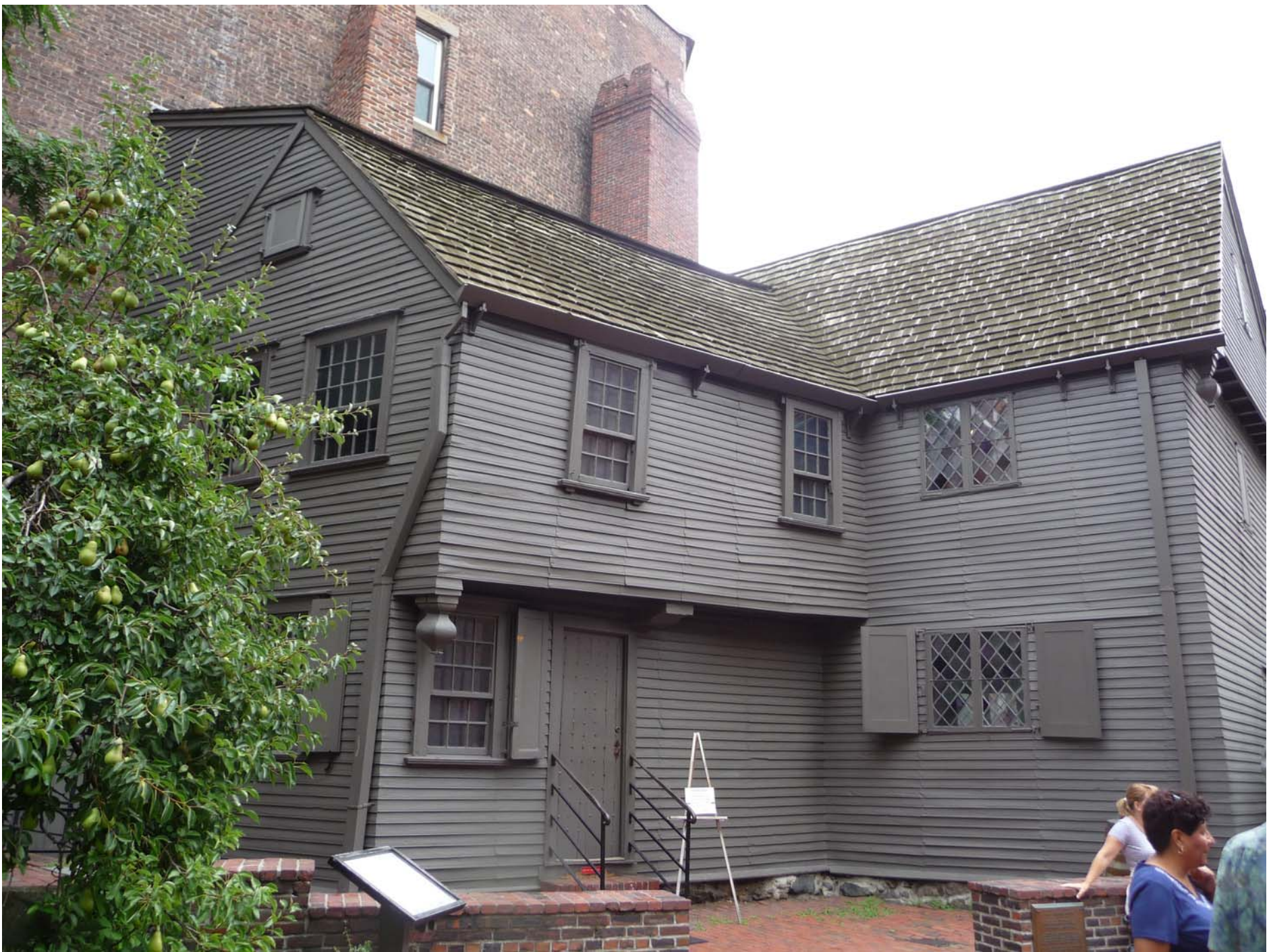
Paul Revere's house from the late 1600's. It has been restored.