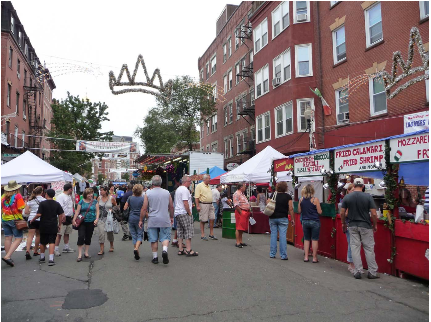
The Italian North End's festival for "Saint Della Cava".