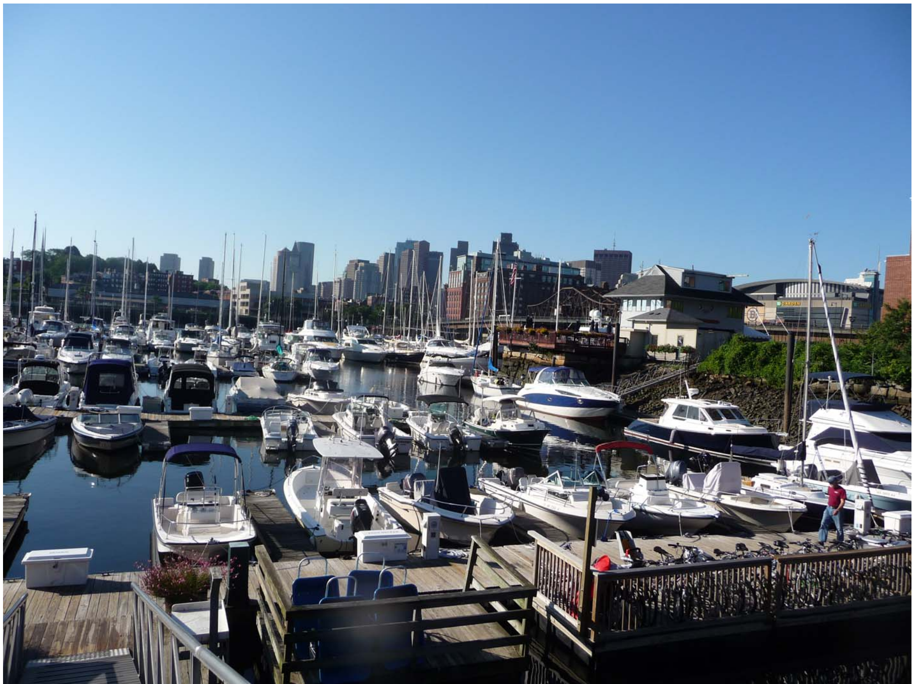
We stay at the Constitution Marina for 4 days near downtown Boston.