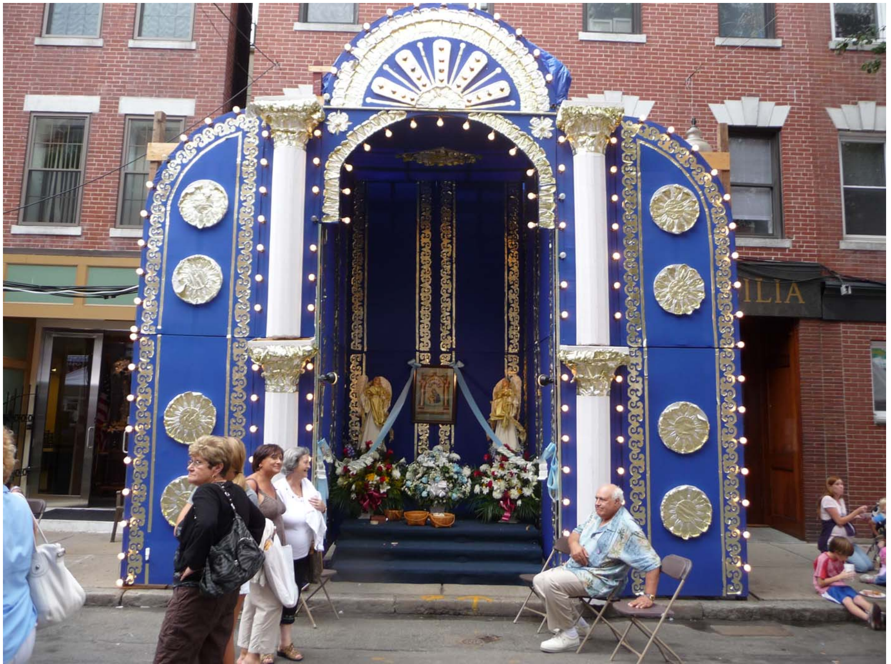
The altar for the soon to be paraded "Saint Della Cava" in the North End.