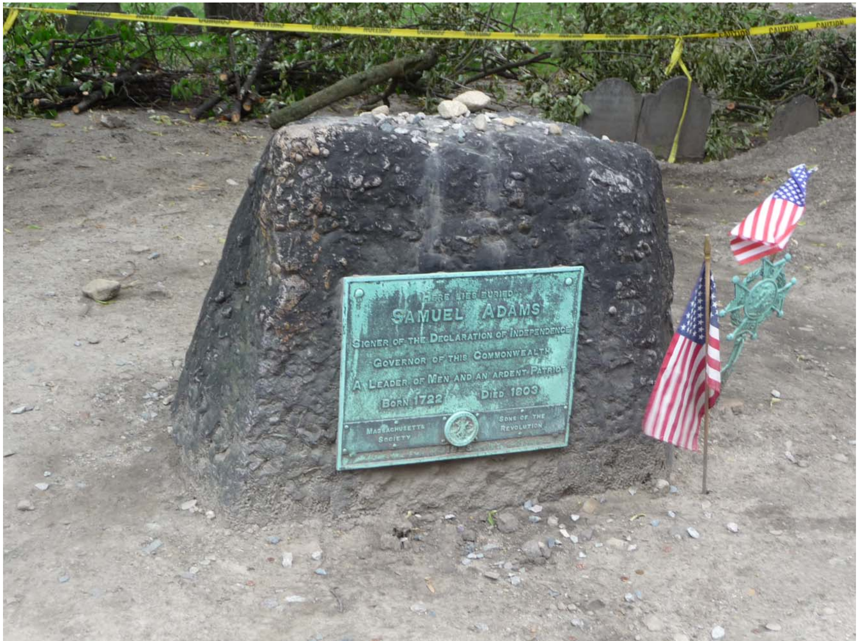
Samuel Adams gravesite.