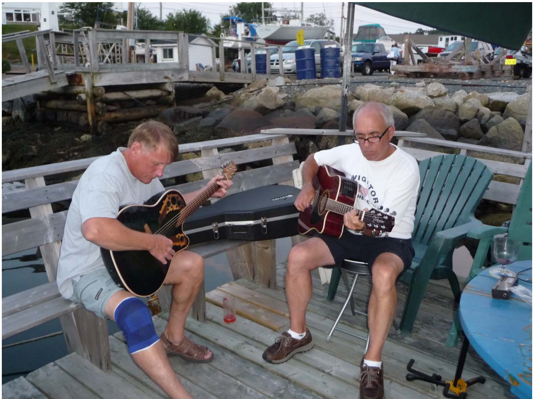
Serious guitar playing.