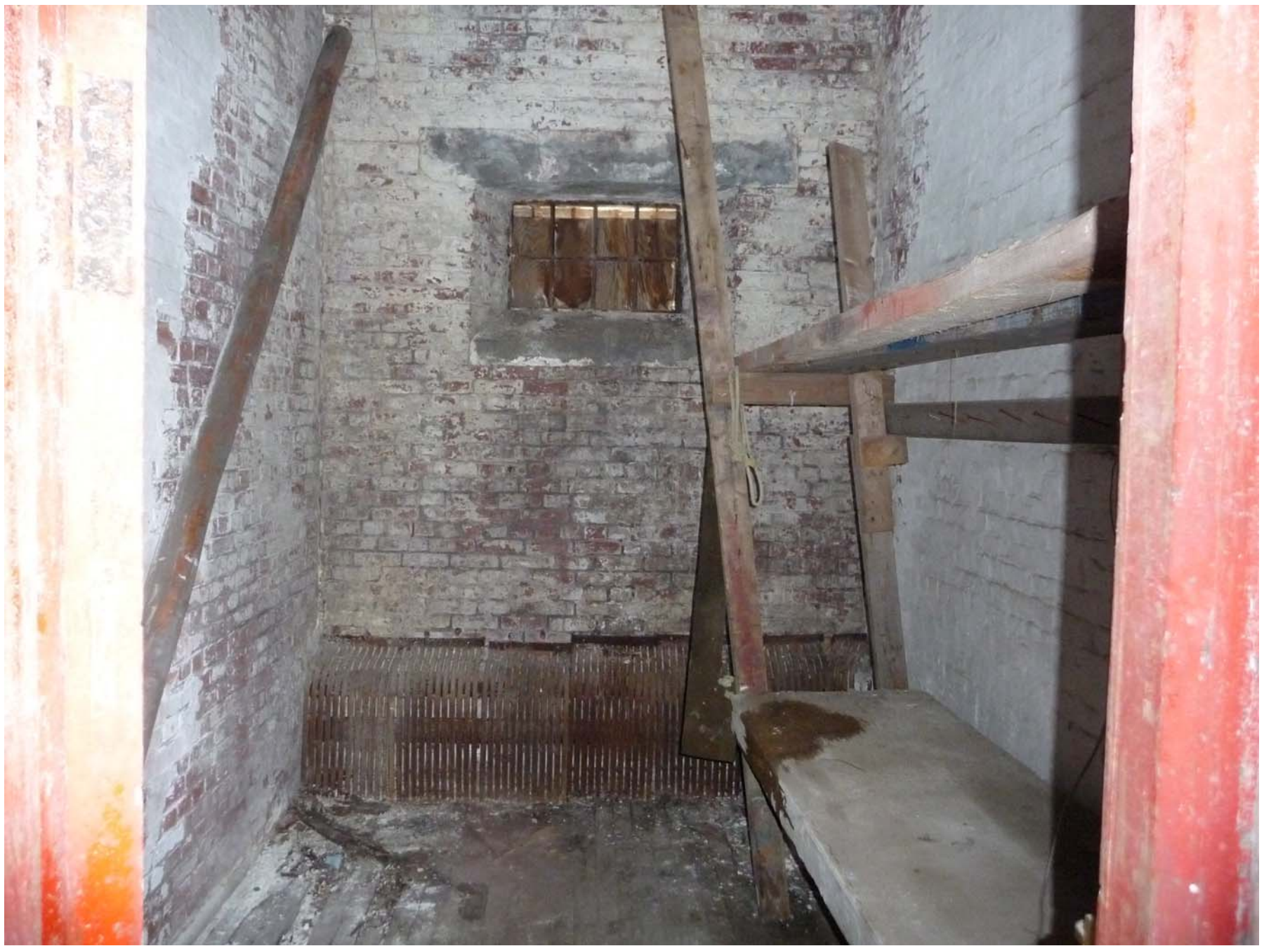
One of the prison cells. Not a nice place to be.