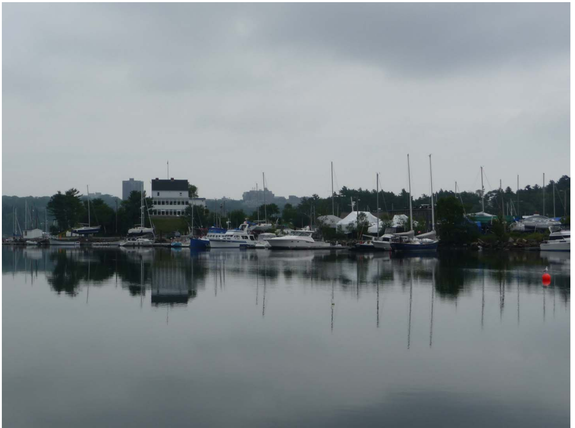
Armdale Yacht Club Halifax. Friendly place.