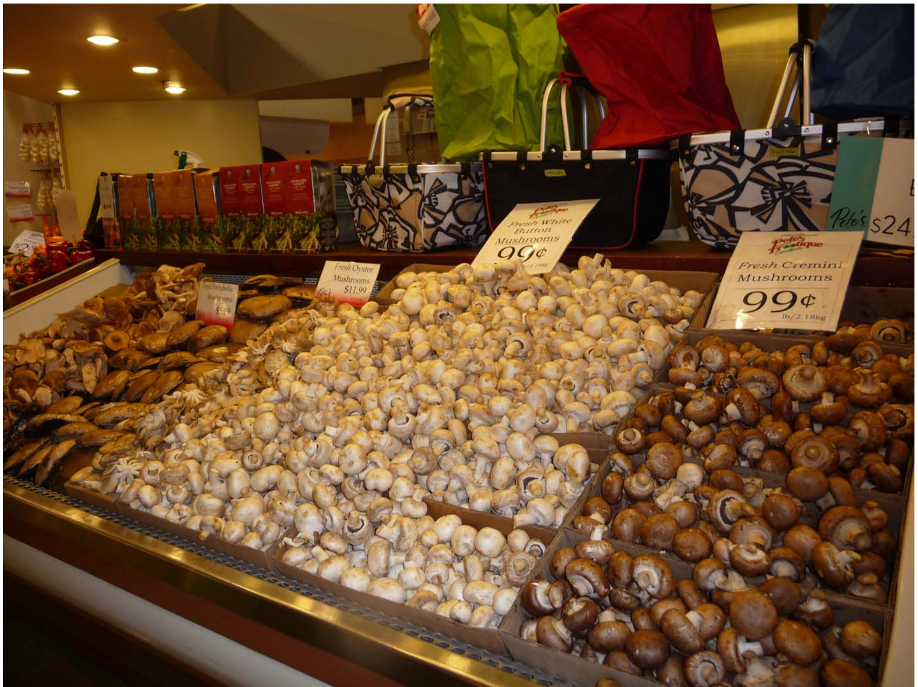
Look at the selection of mushrooms!