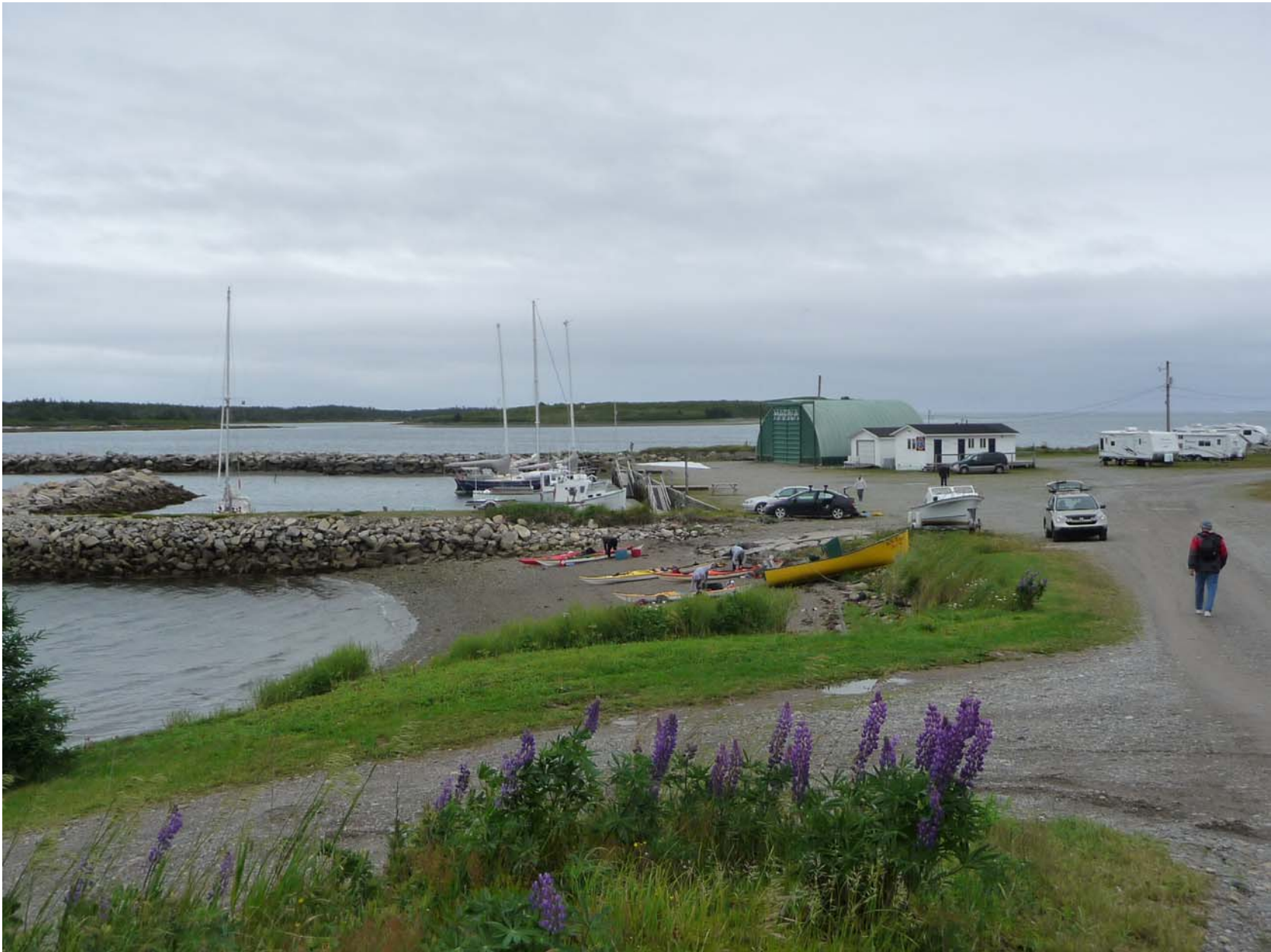
Canso Marina. Small but good showers & laundry.