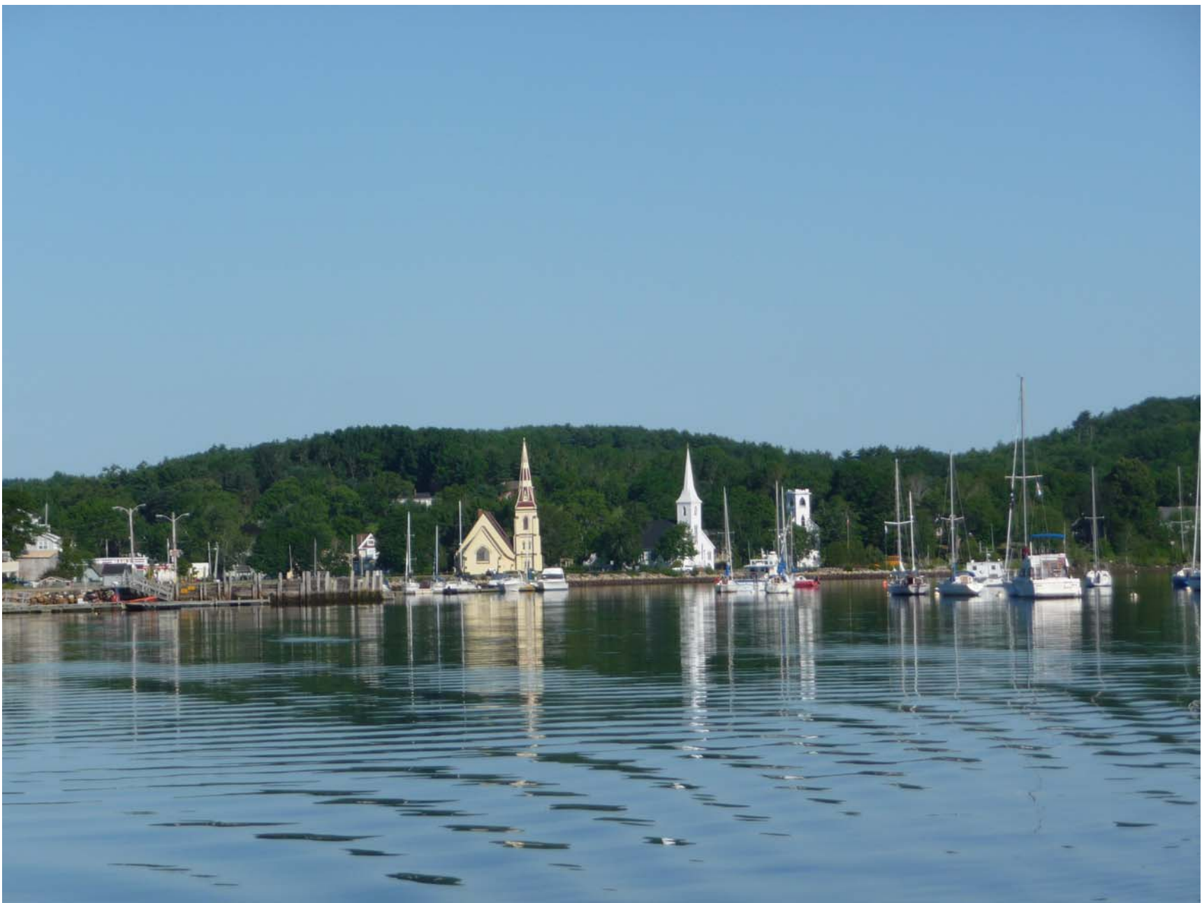
On a mooring buoy in Mahone Bay known for it's 3 churches right in a row.