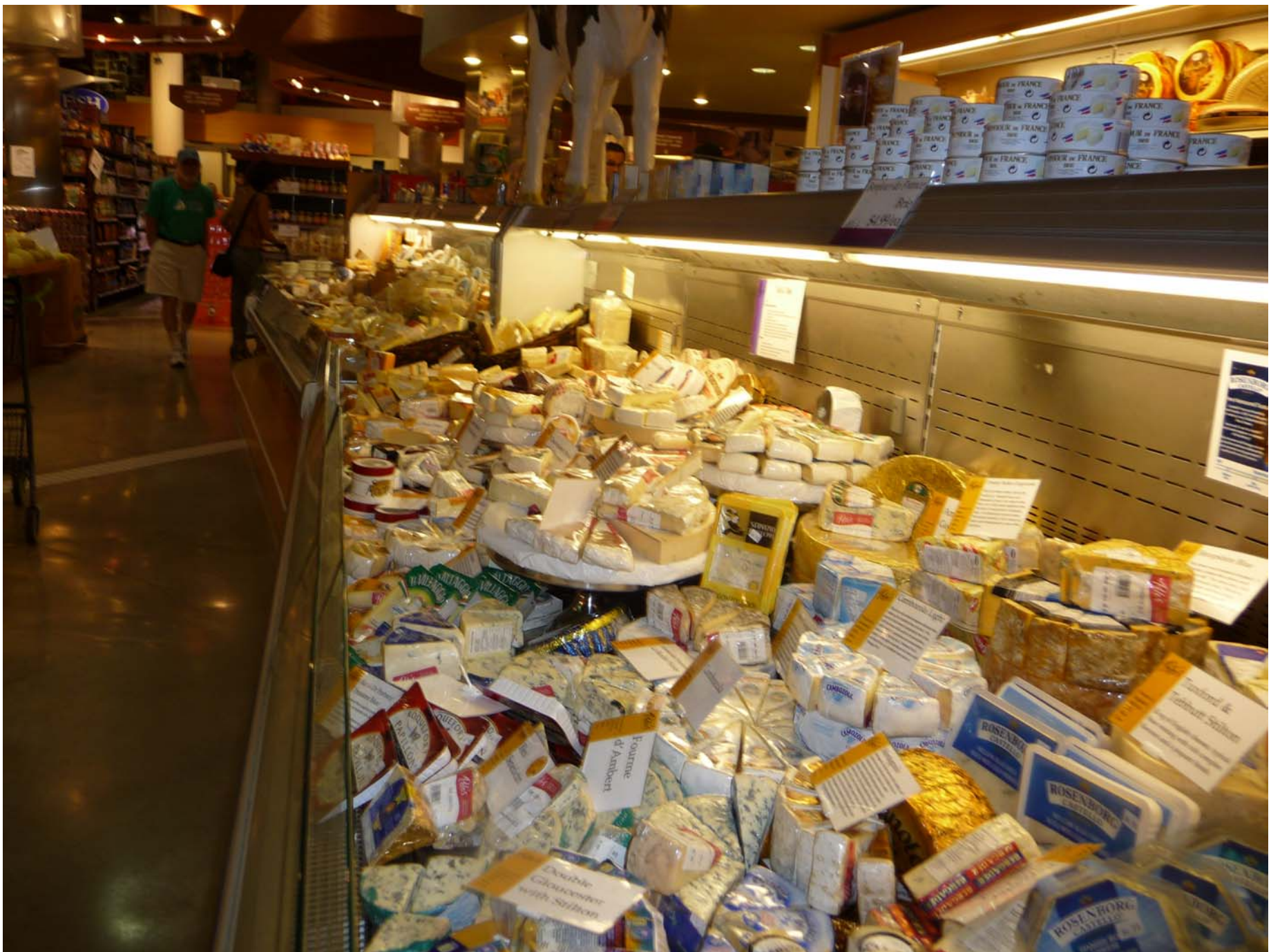
A terrific selection of cheeses at Pete's Frootique.