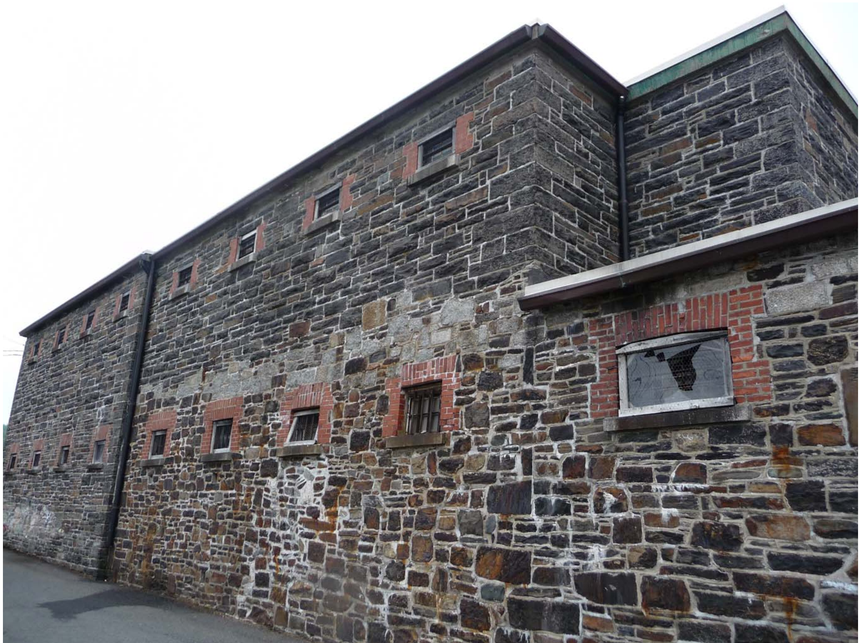
Exterior of the prison which the boaters use for storage now.