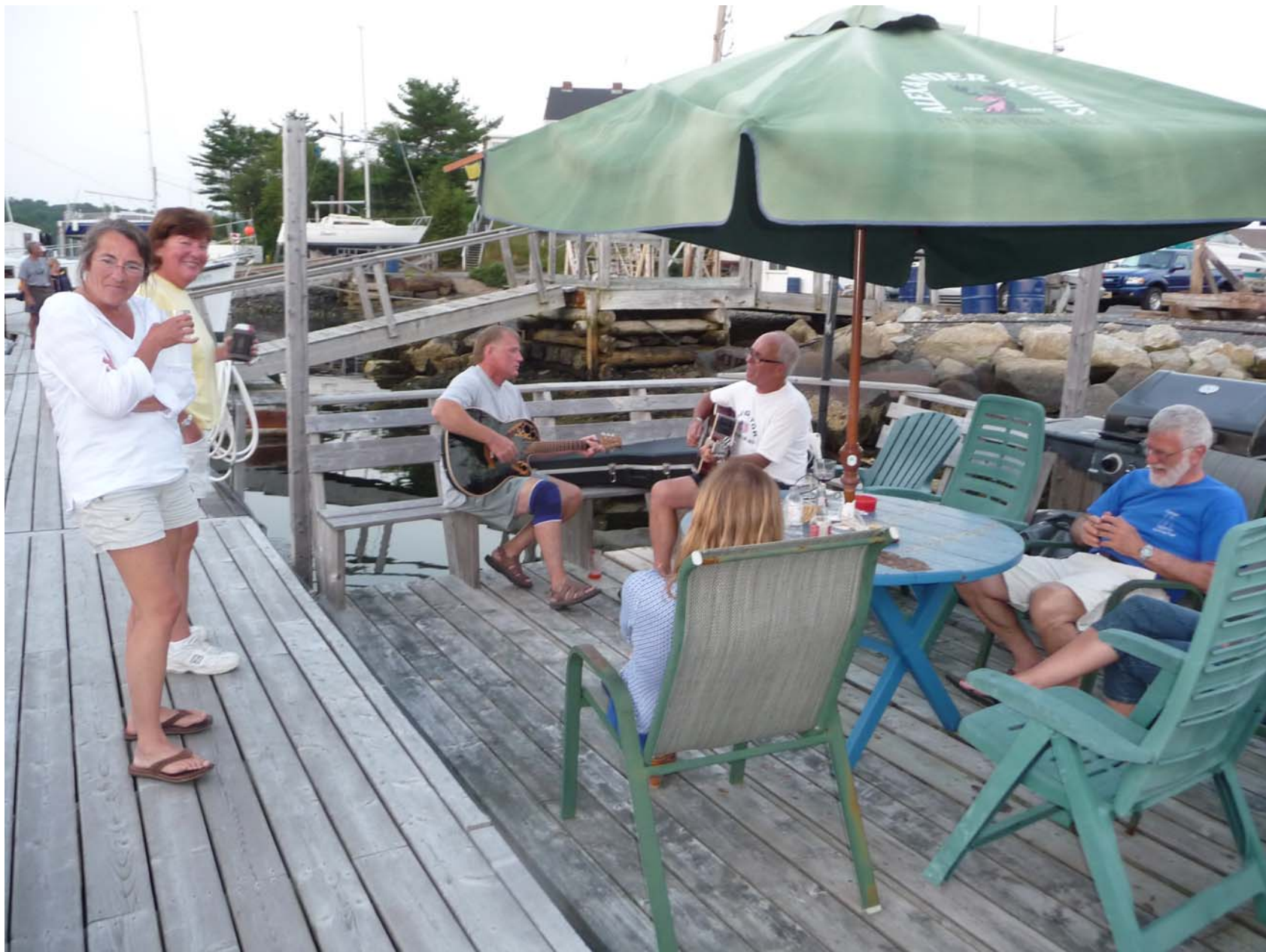
Friday night party on C dock with guitar playing and singing.