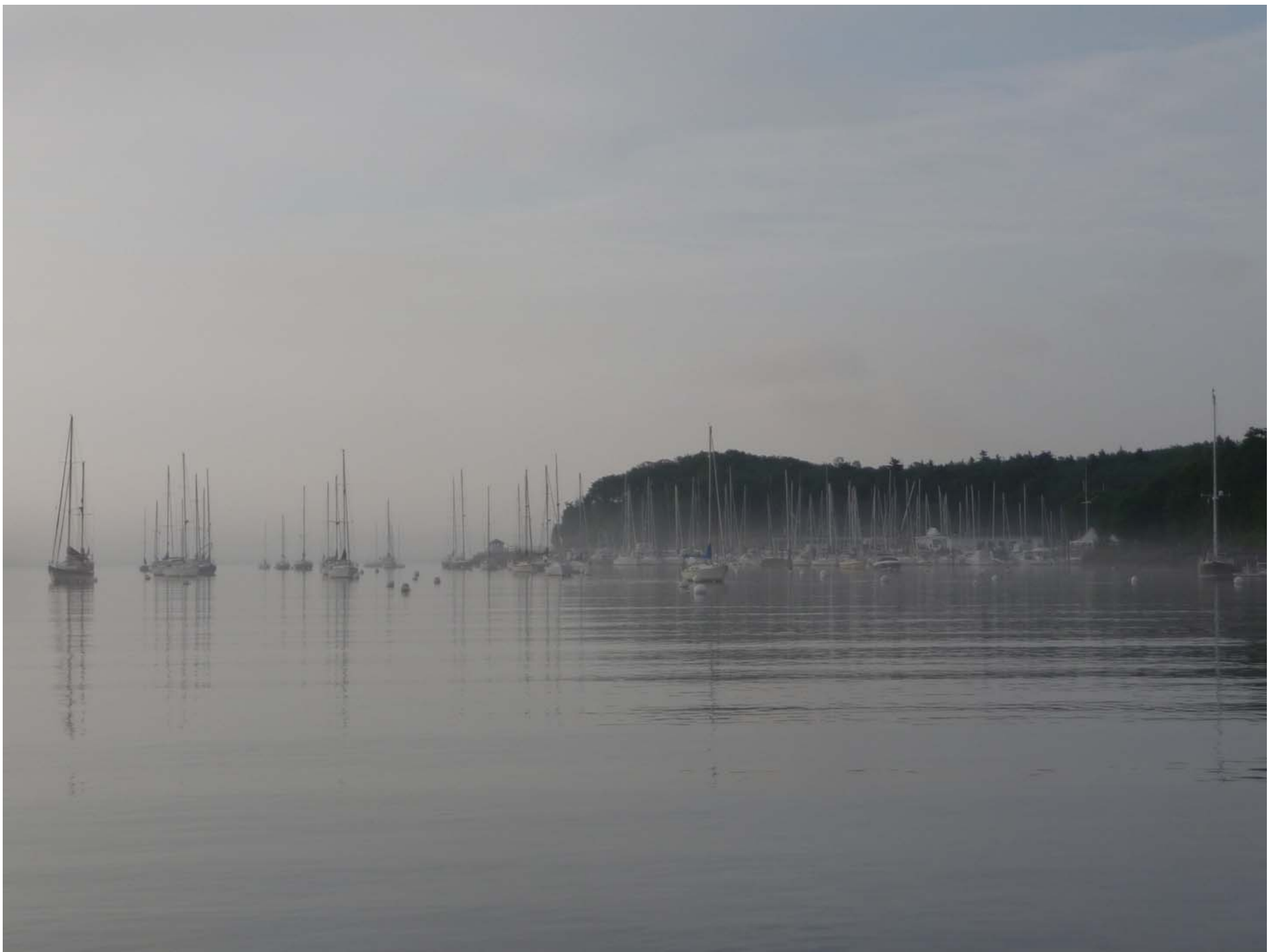
We leave Halifax's West Arm and pass the Royal Nova Scotia Yacht Club.