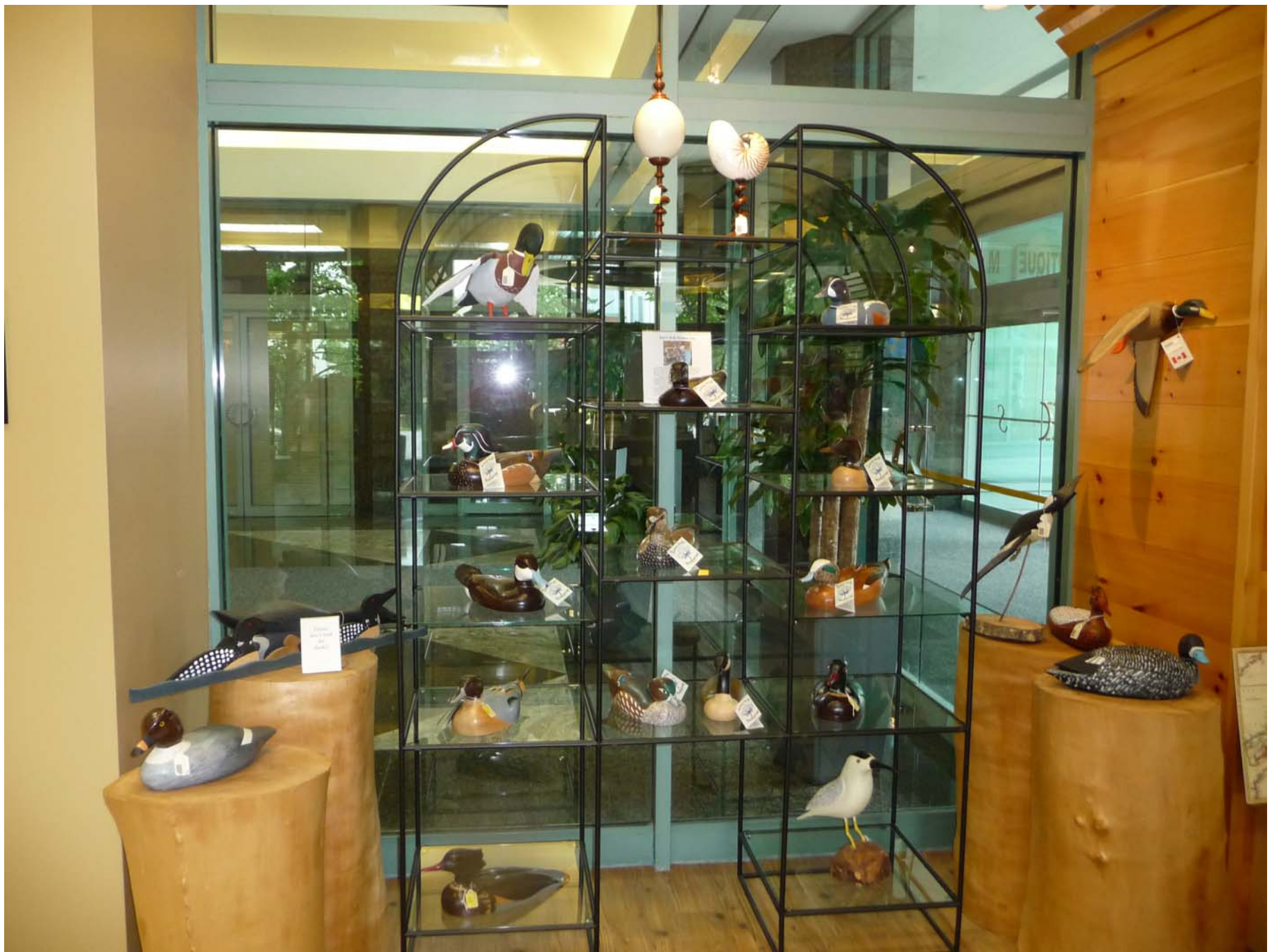
Duck wood carvings in a great bookstore on Lower Water Street.