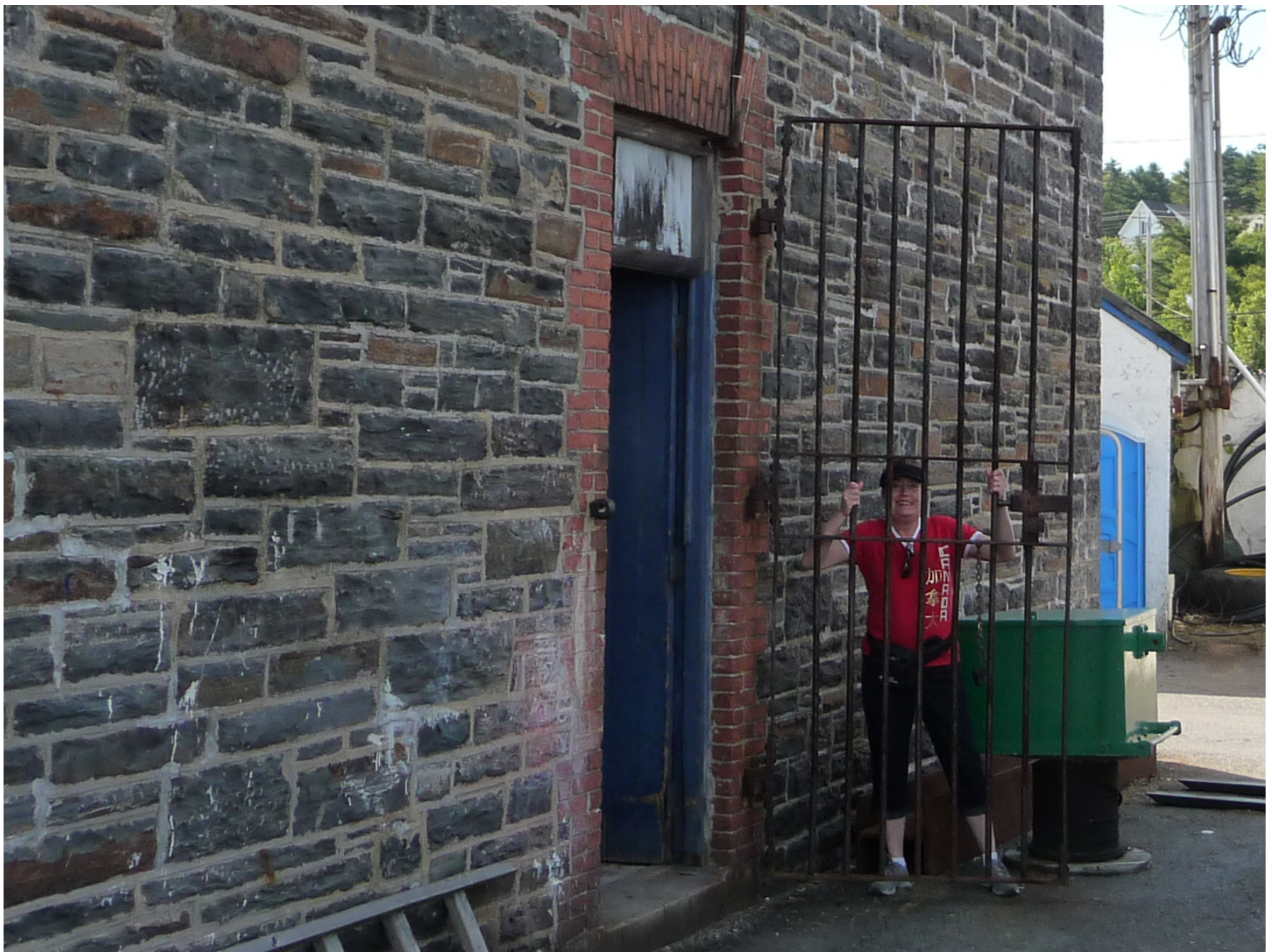
Armdale Y.C. is built on the site of a prison that housed French prisoners during the Napoleonic Wars & American prisoners during the War of 1812.