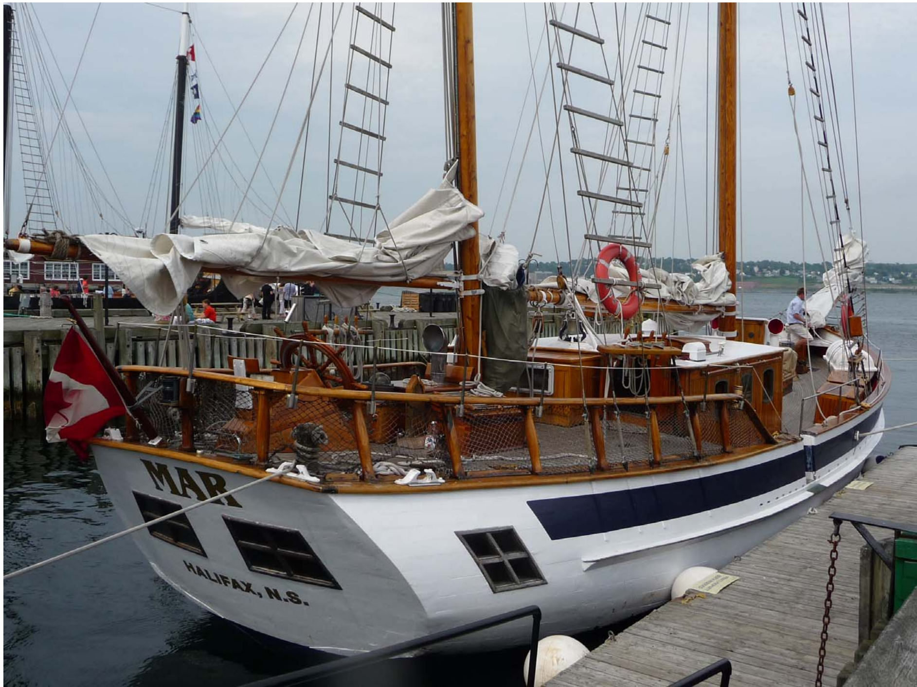
One of the charter boats docked on the wharf.