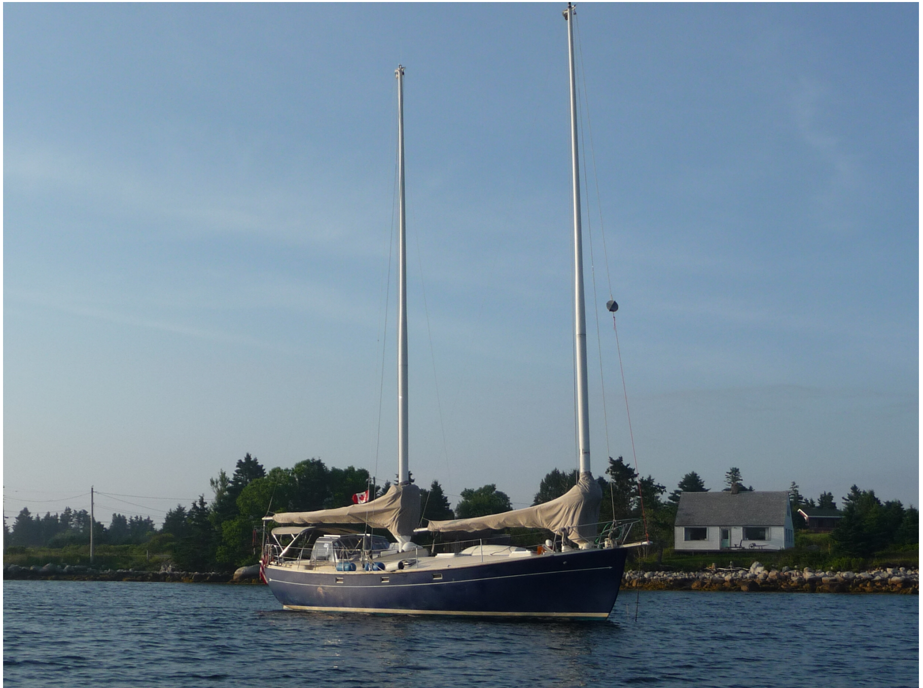
Anchored in Indian Harbor just south of Peggy's Cove.