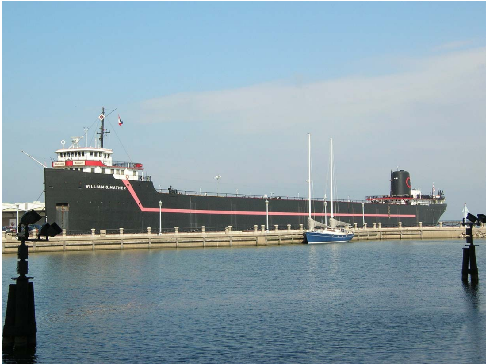
We tie up overnight in the basin by the Rock 'n Roll Hall of Fame.