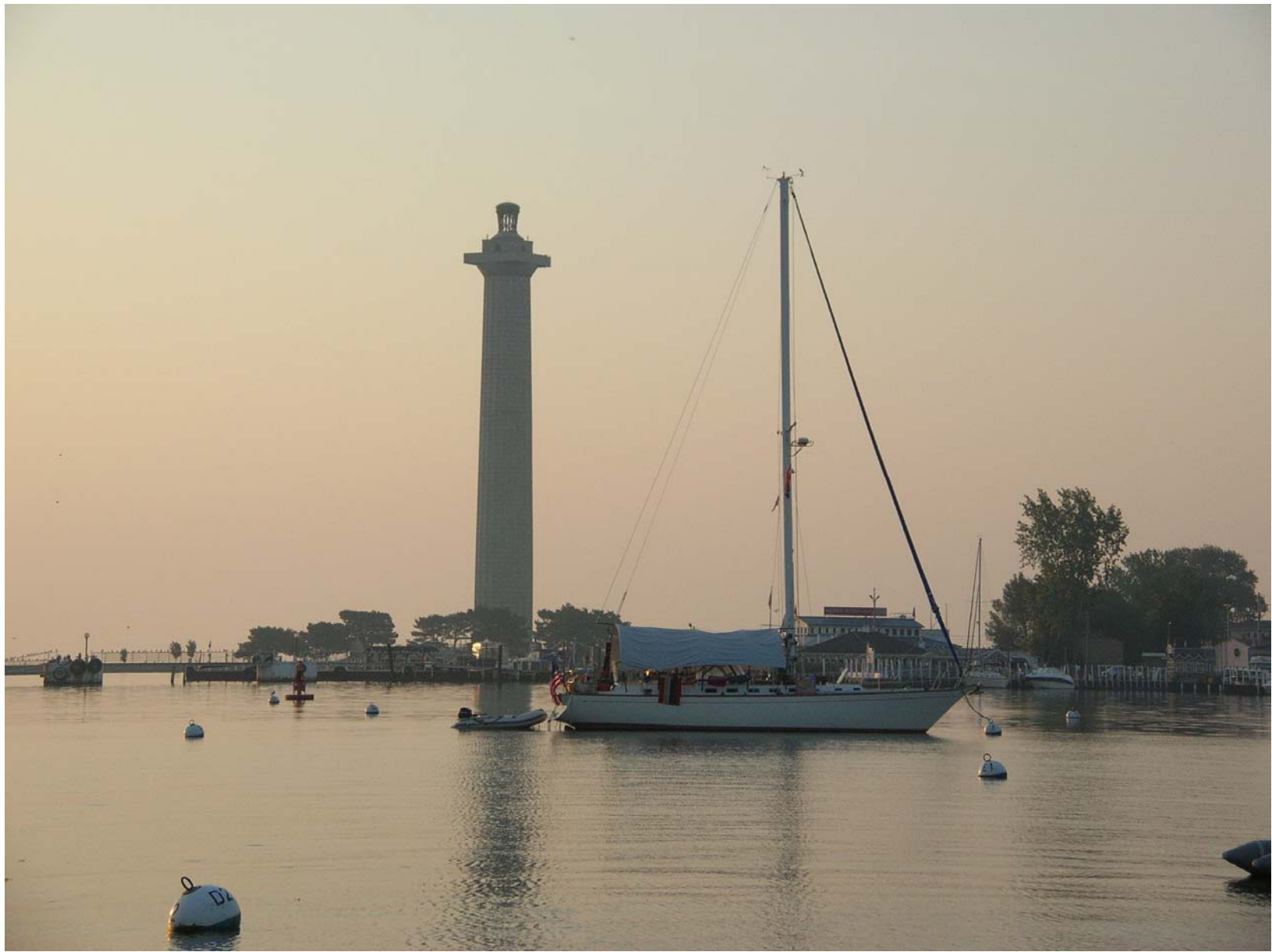
Put In Bay, Lake Erie, Peace Monument