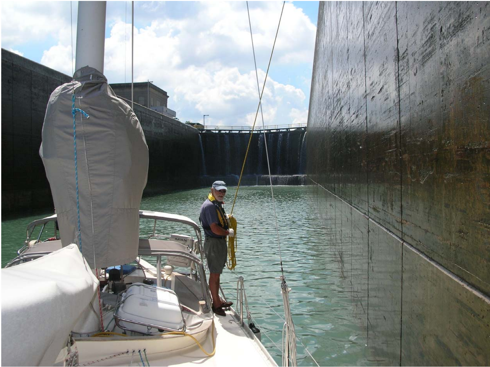
We spend 7 hours going thru the Welland Canal & 8 locks dropping 100 meters (Niagara Falls) on 8/6/08.