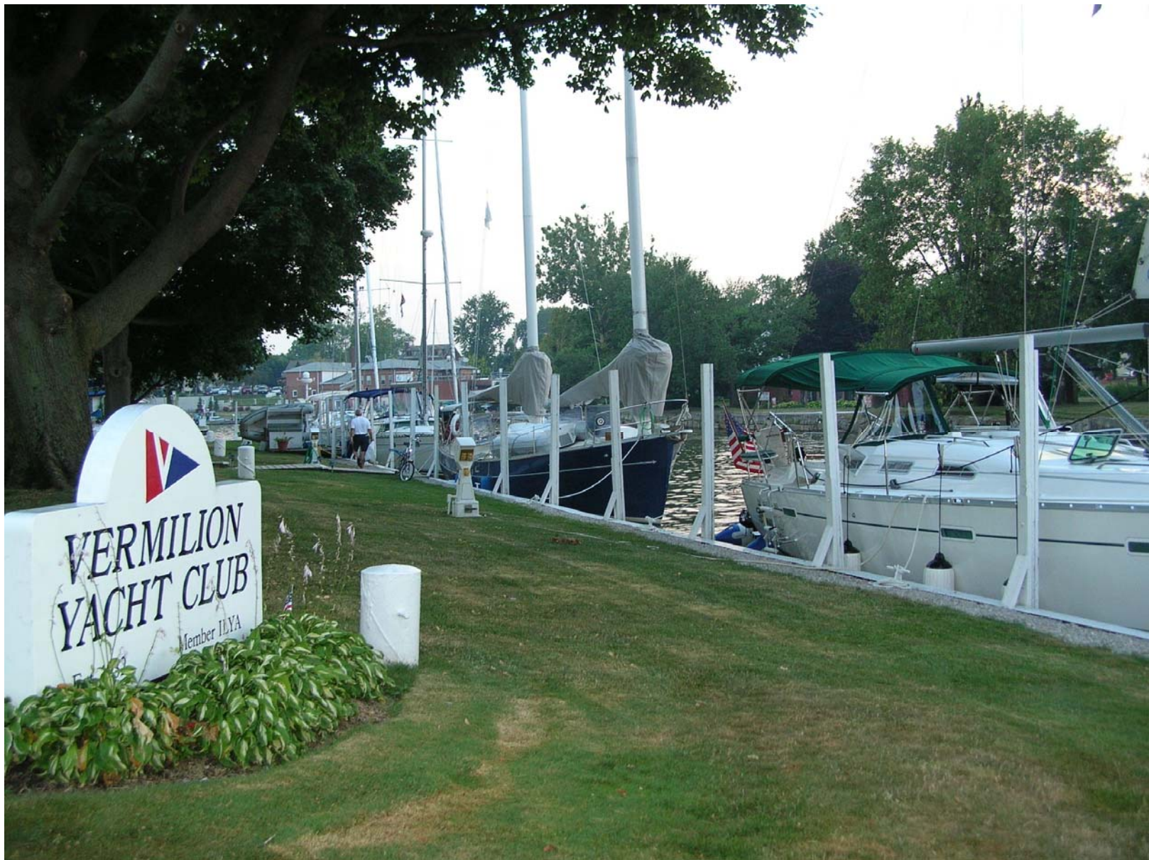
We tie up in front of the Vermilion Yacht Club, south shore Lake Erie