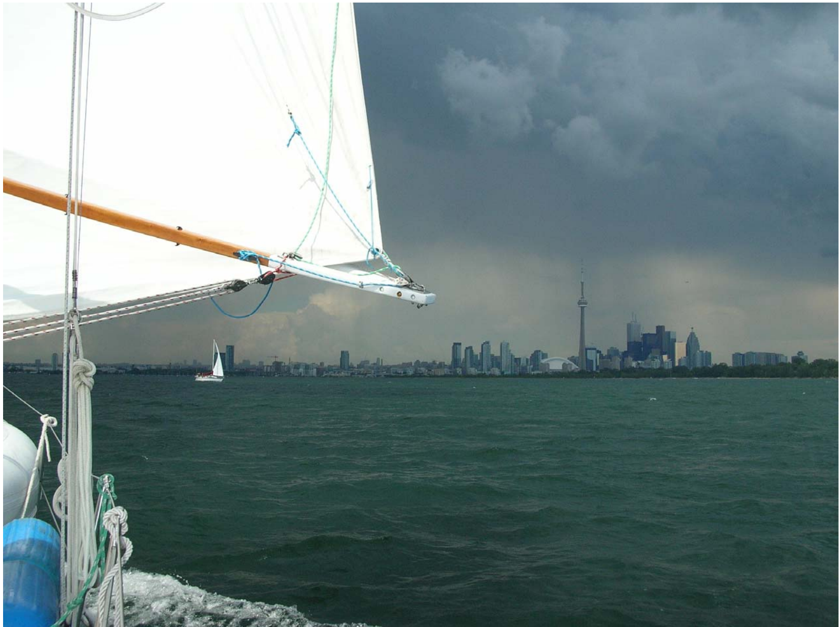
A fine sail (7.2 knot average) from Port Dalousie to Toronto.