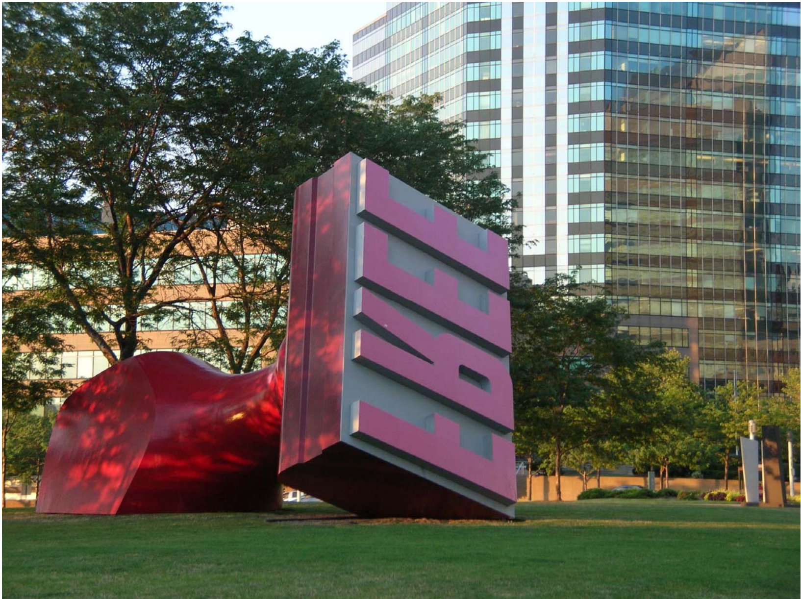
A “FREE” stamp at the Federal Building in Cleveland