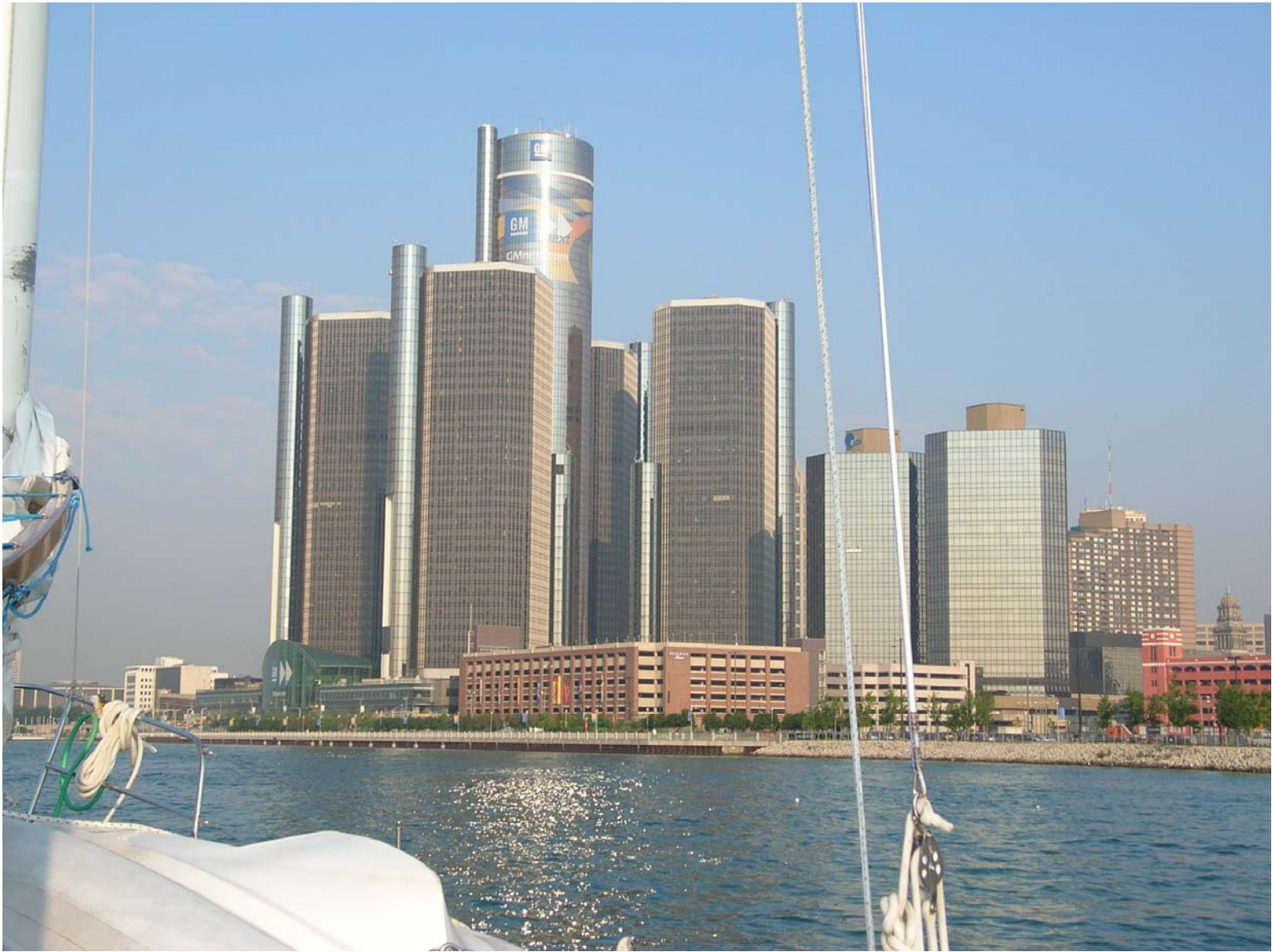
Renaissance Center Detroit