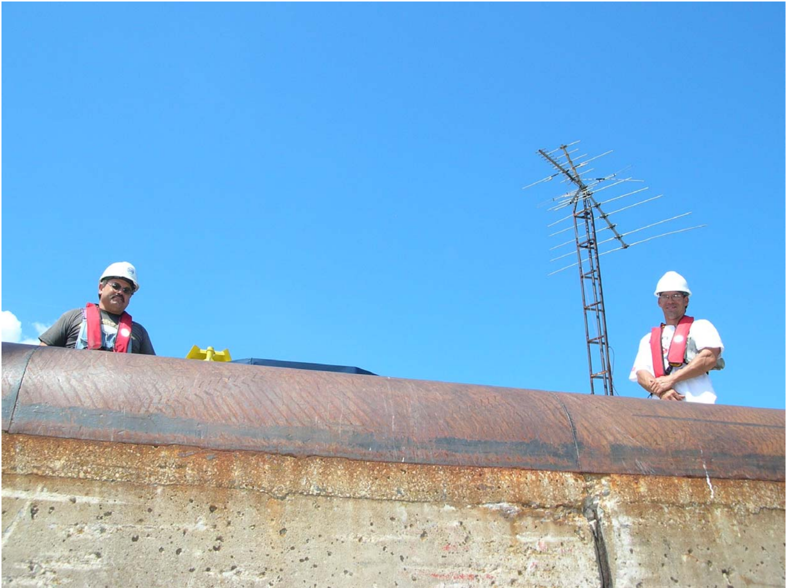
Two of the lock guys in the Welland