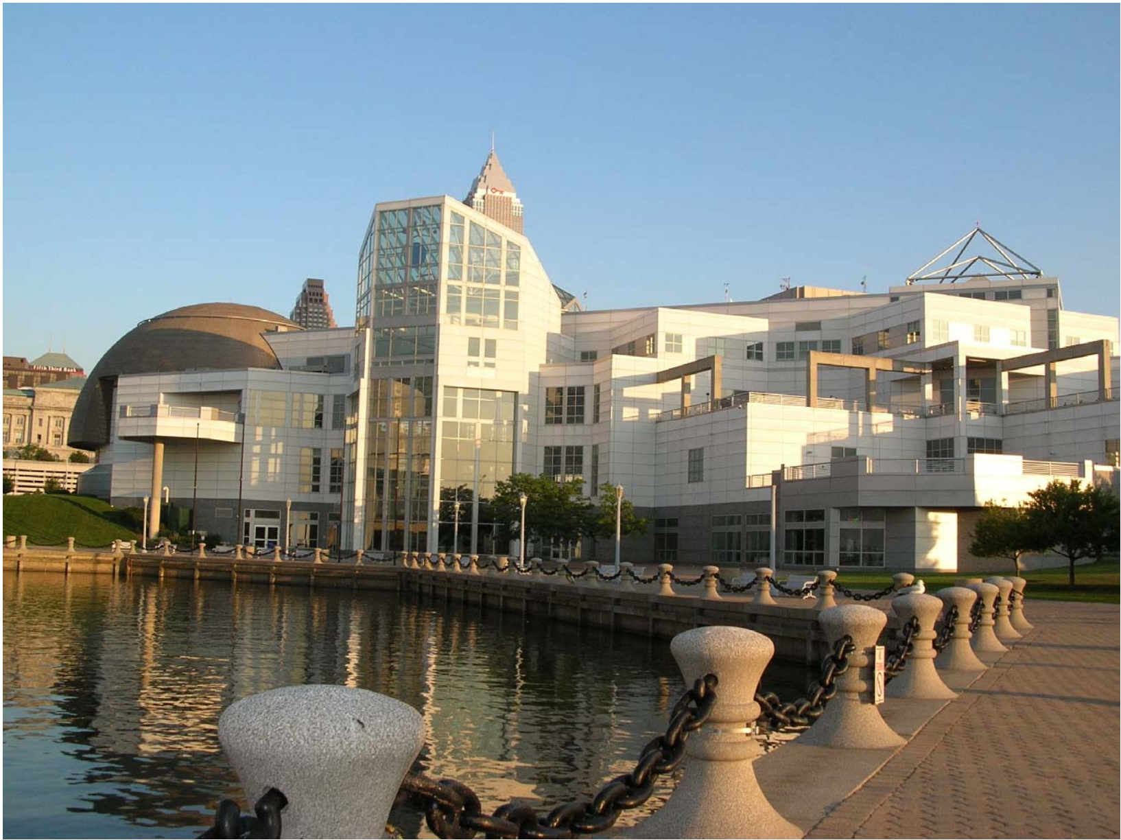
Cleveland's Science Museum next to the Hall of Fame