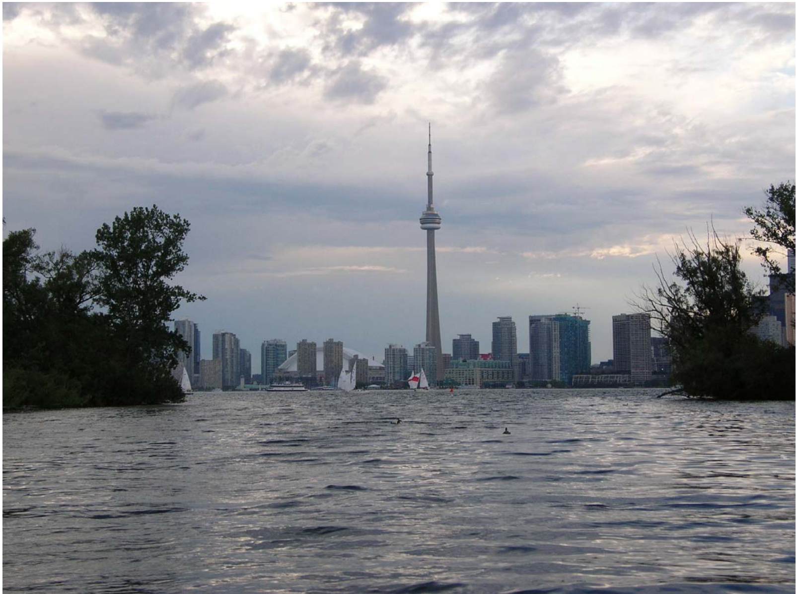
View of the downtown skyline from our boat at Hanlan's Point.