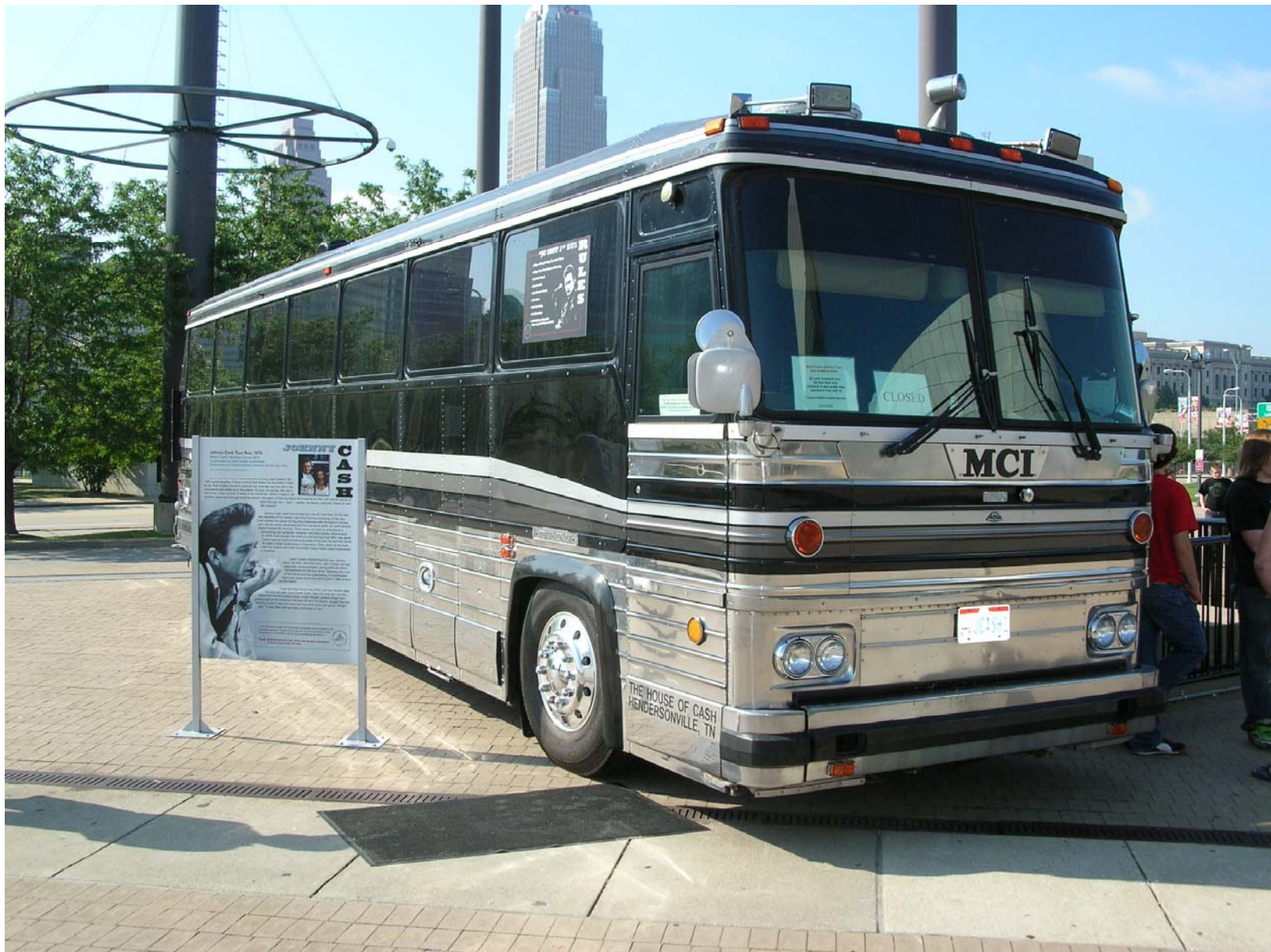
Johnny Cash's bus parked in front of the Hall of Fame