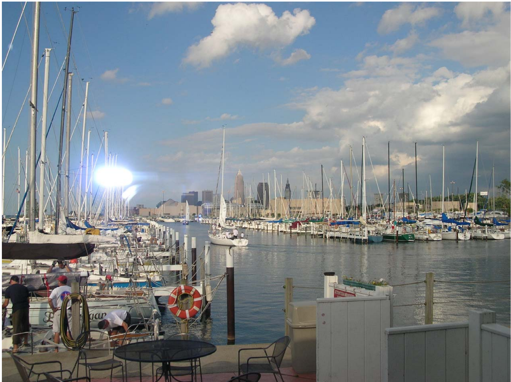
We stay at the Edgewater Yacht Club in Cleveland