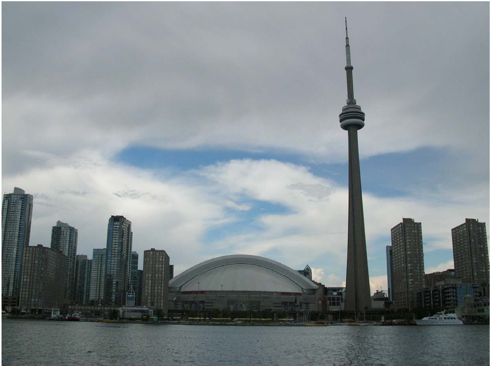
Dramatic downtown Toronto skyline.