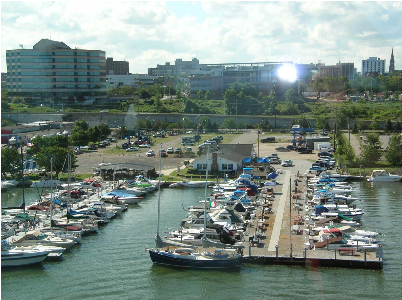
Tied up in Erie, PA, at the Presque Isle Yacht Club