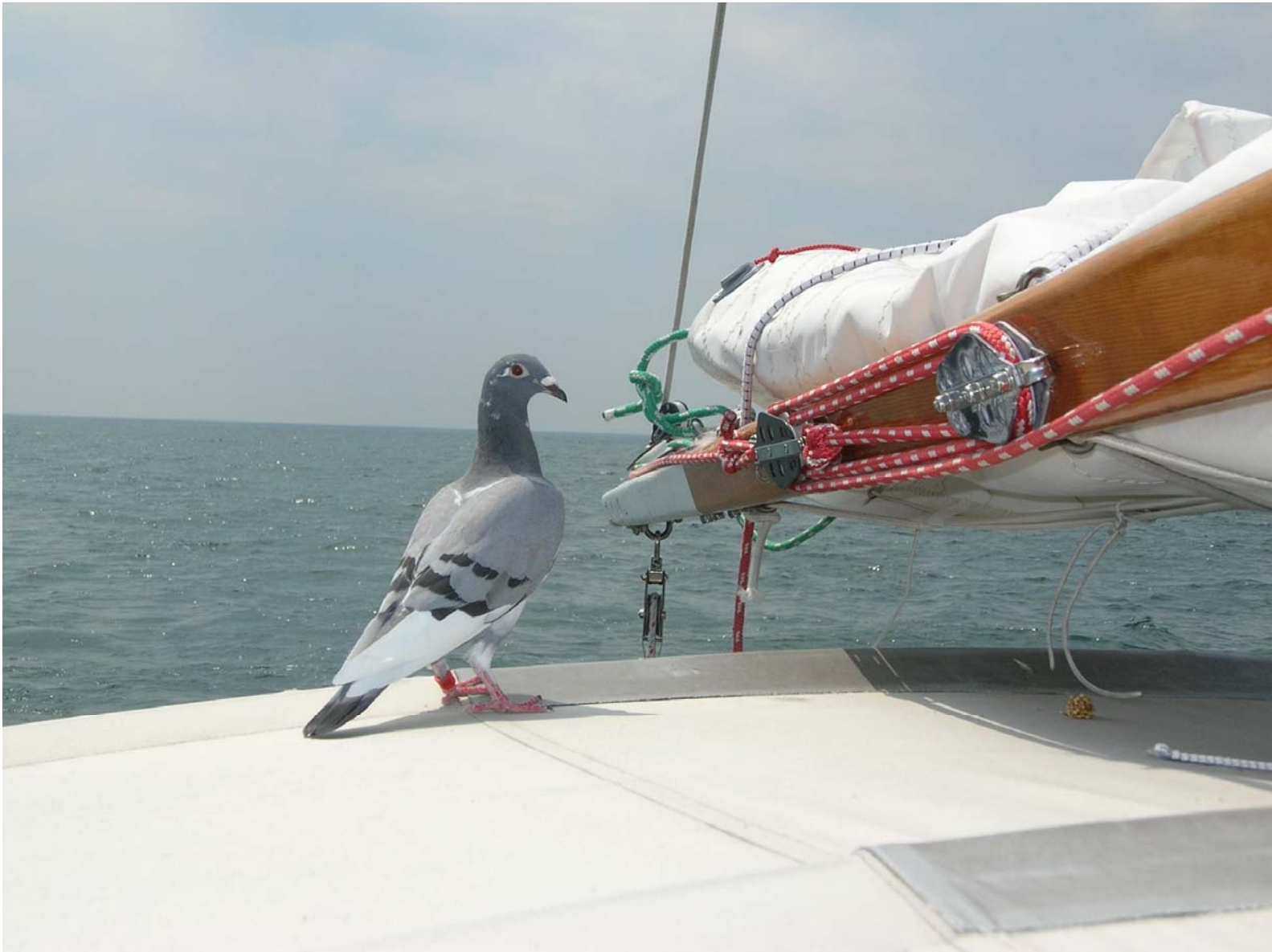
We have a visiting pigeon rest on our boat on the way to Port Colborne, Ontario, as we left Lake Erie.