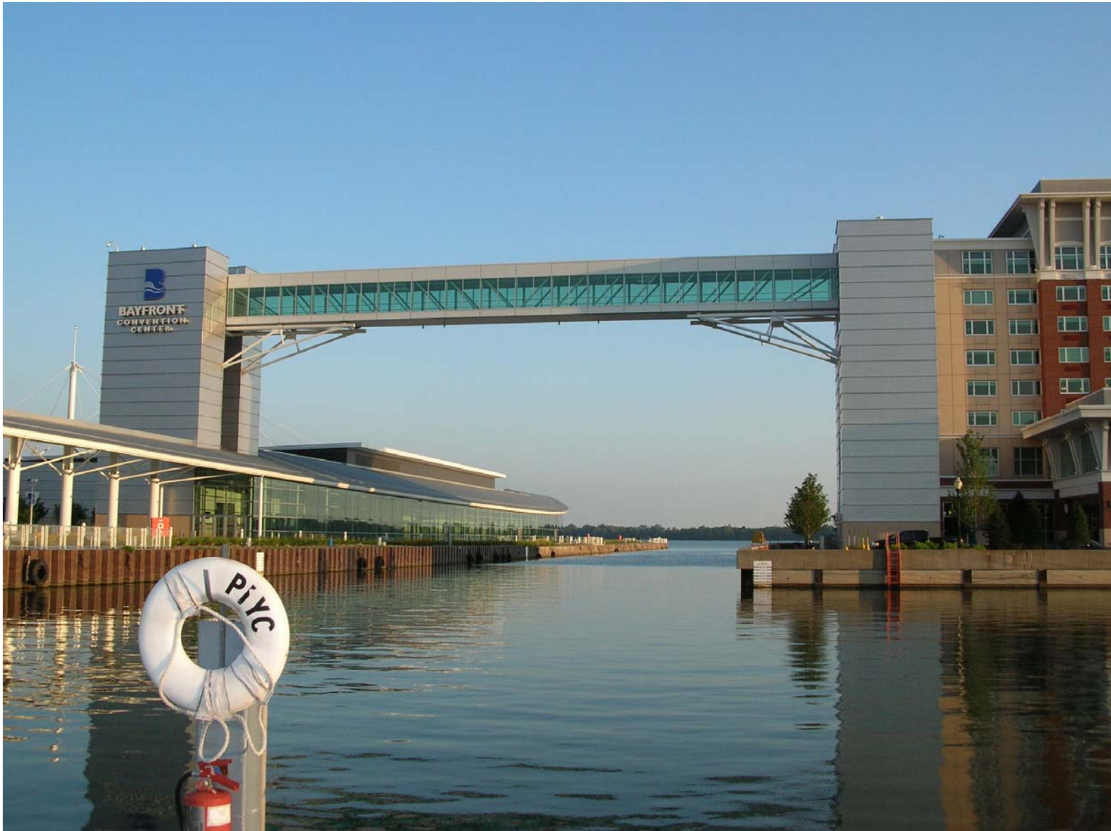
The entrance to the Presque Isle Yacht Club