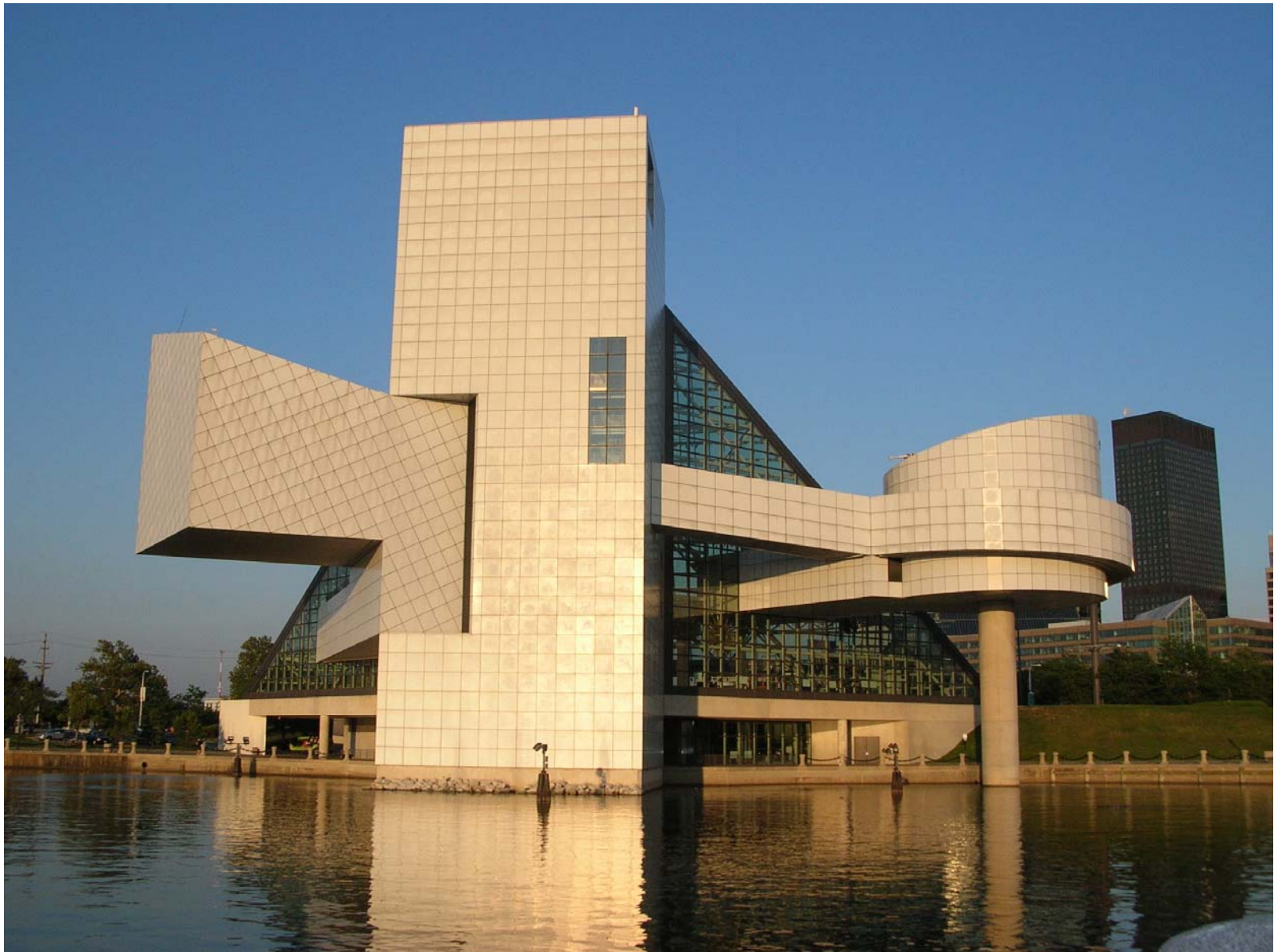
The Rock and Roll Hall of Fame in Cleveland