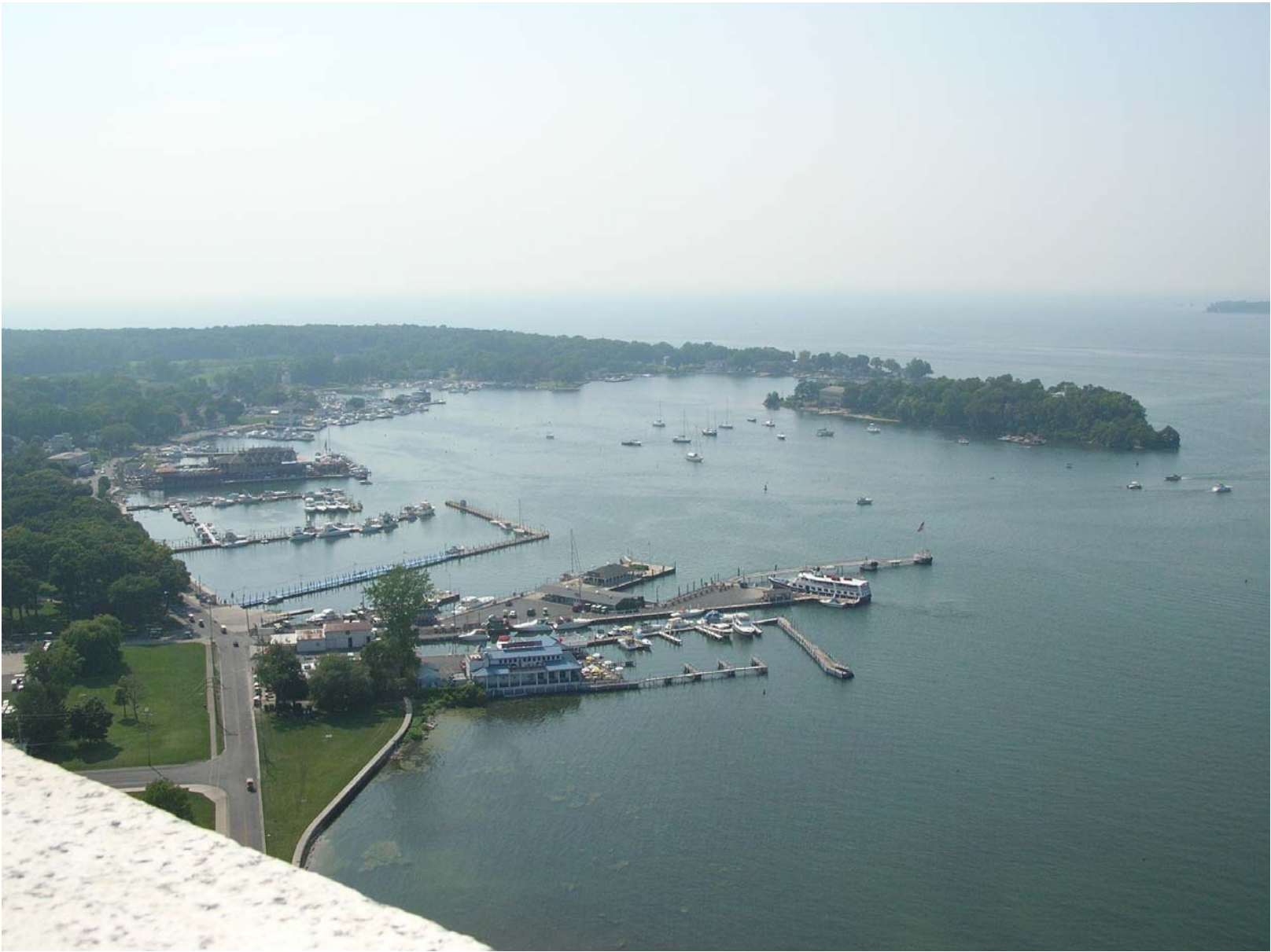
Put In Bay as seen from the top of the Peace Monument