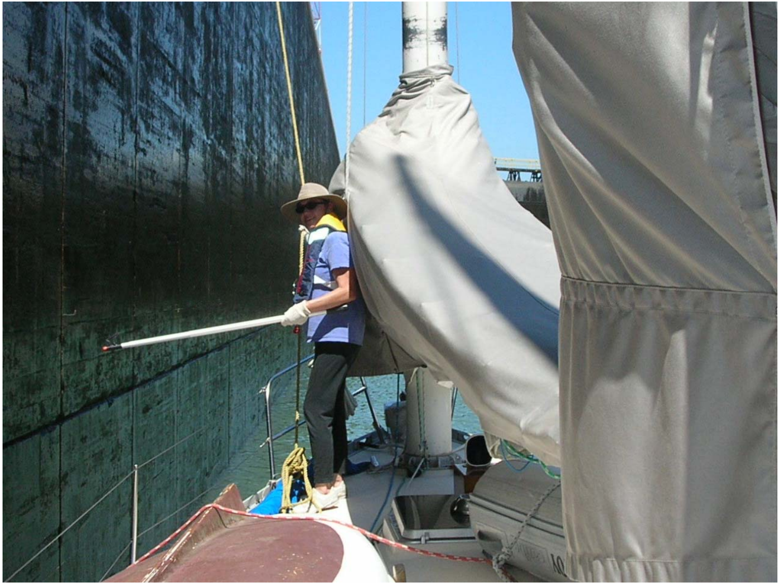
Joyce fending off the lock wall in the Welland Canal