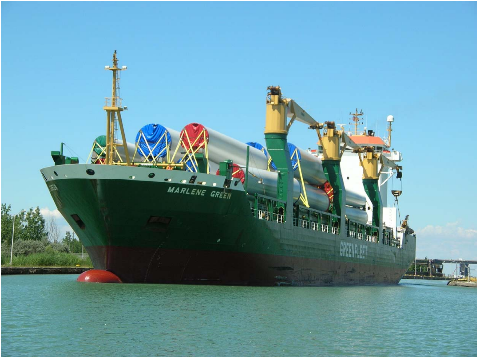
We get close to the Marlene Green carrying wind turbines.