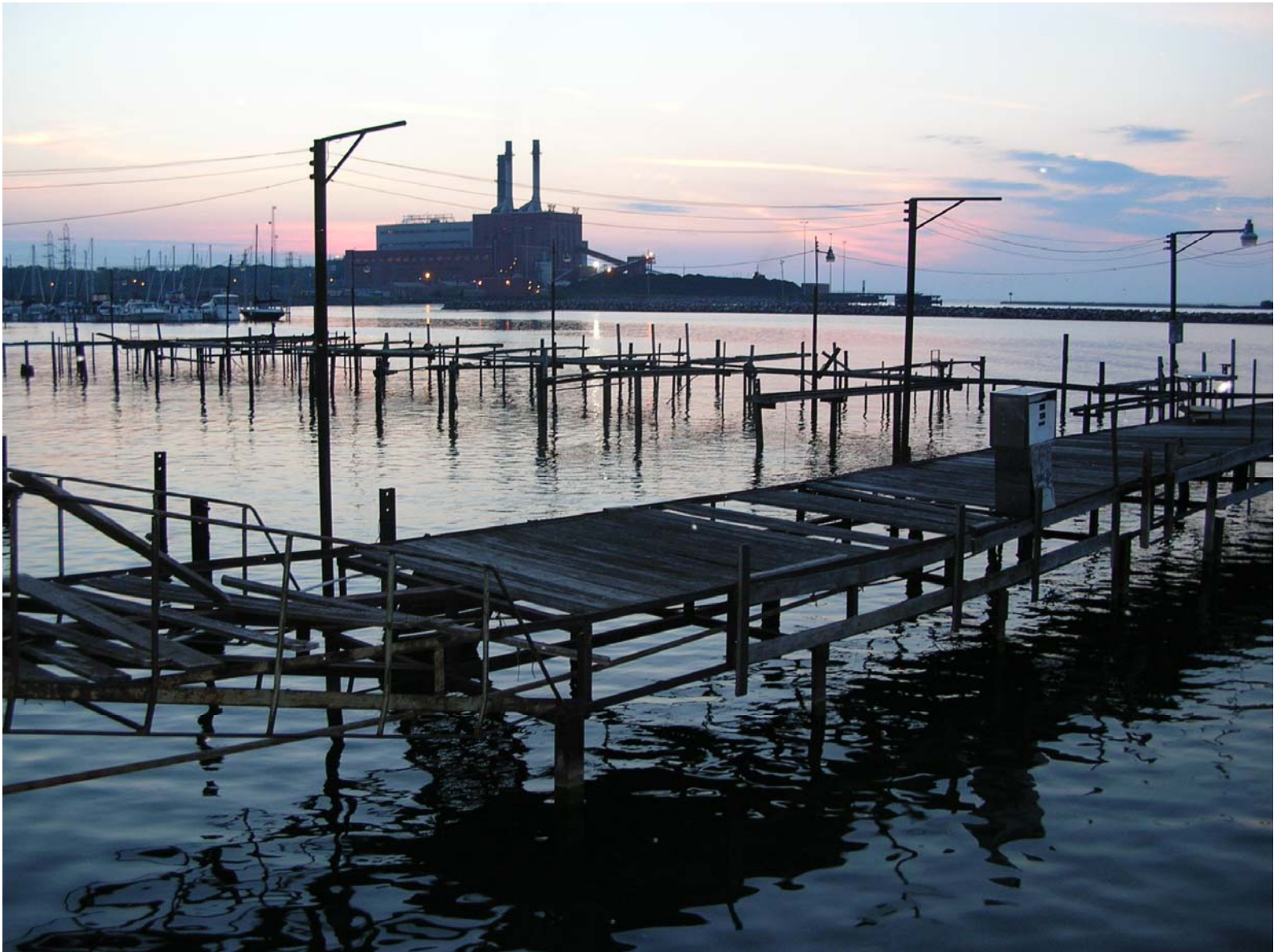
A ghost marina (long vacated) in Dunkirk, NY