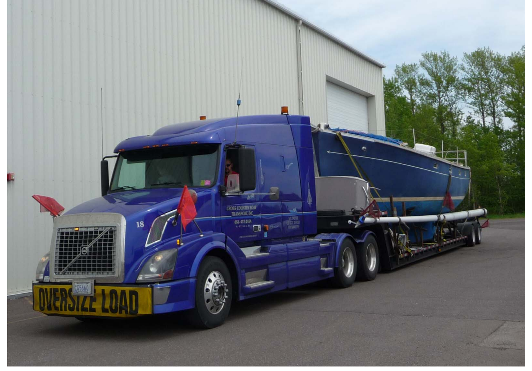
Great to see the boat again! We left Lake Superior in 2008 and after all our travels, it's back!