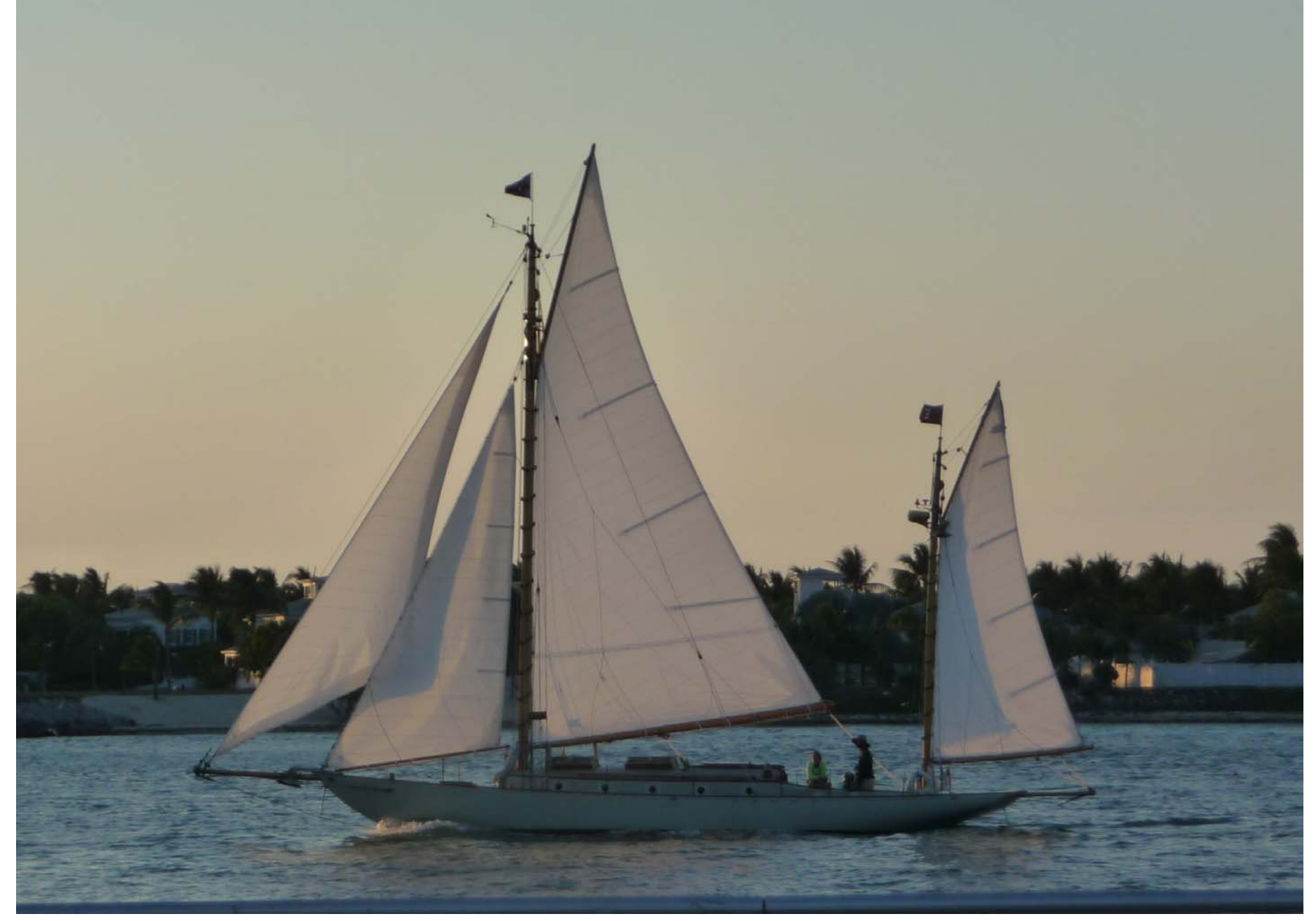
A pretty yawl sailing into the setting sun off Mallory Square.