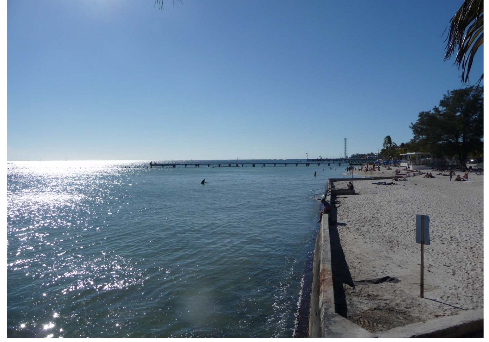
South Beach located by the West Martello Tower.