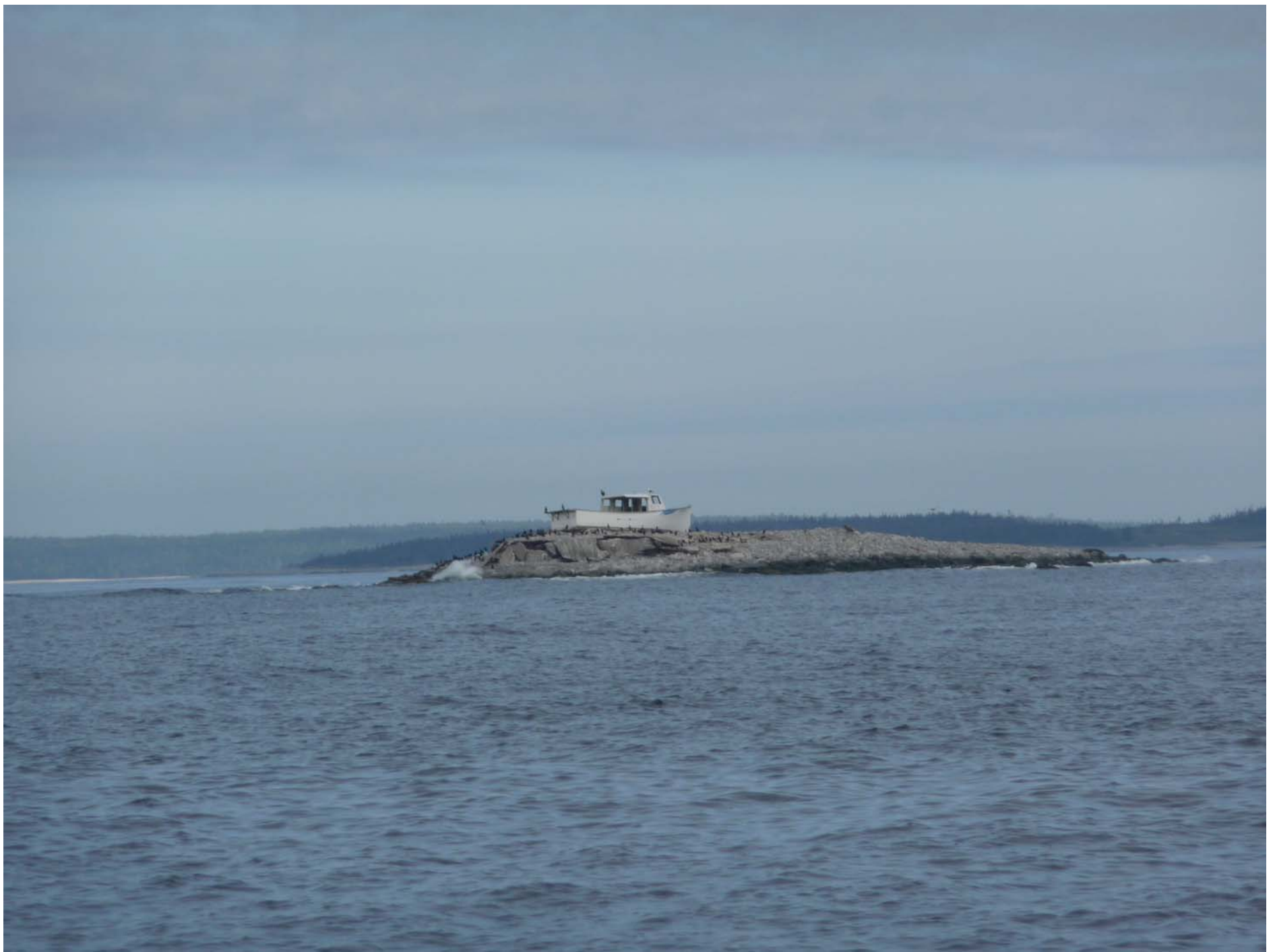
Must've been a bad storm that got this lobster boat on the rocks.