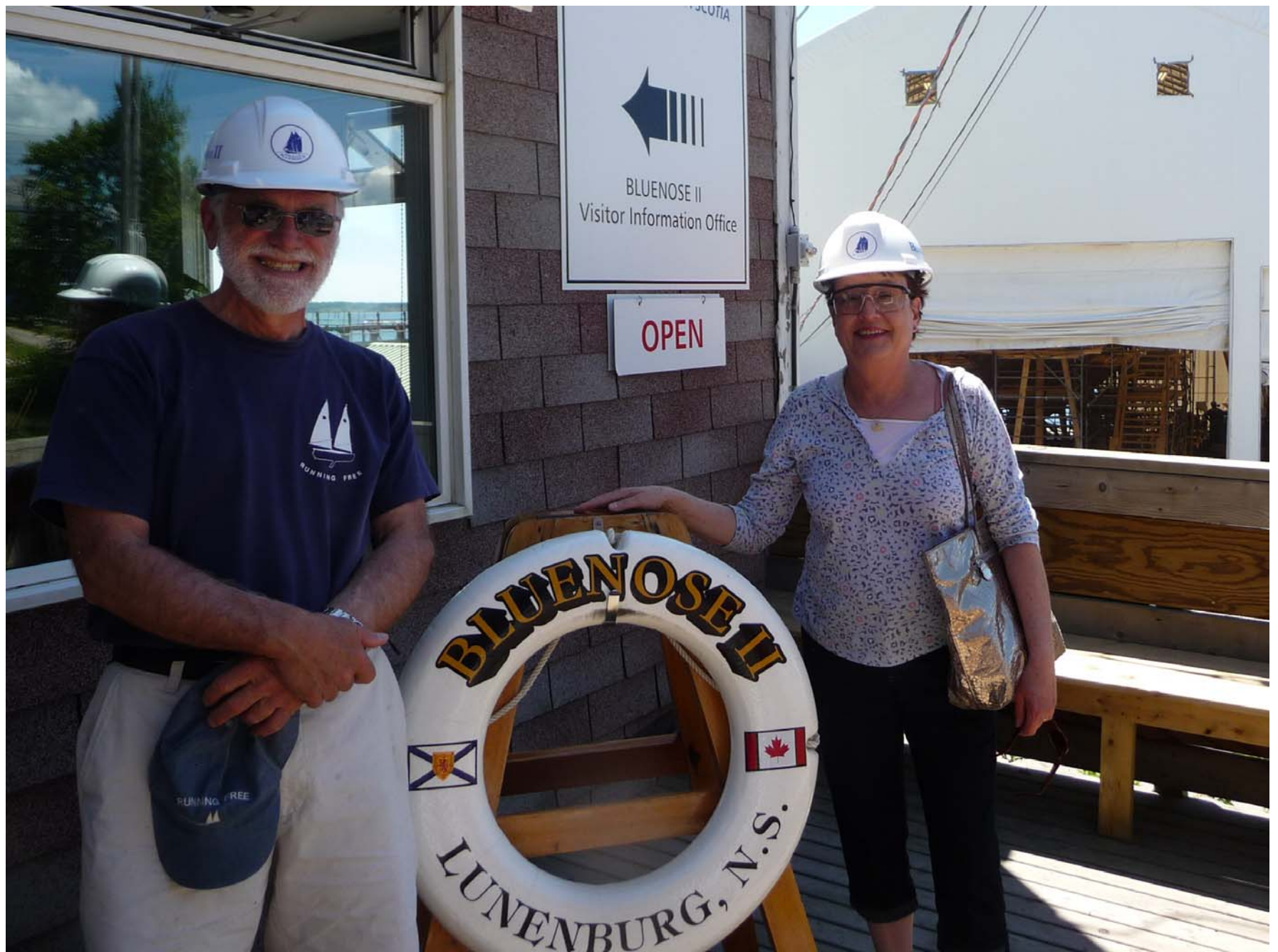
Hardhats & safety glasses required to get a free viewing of the Bluenose II under construction.