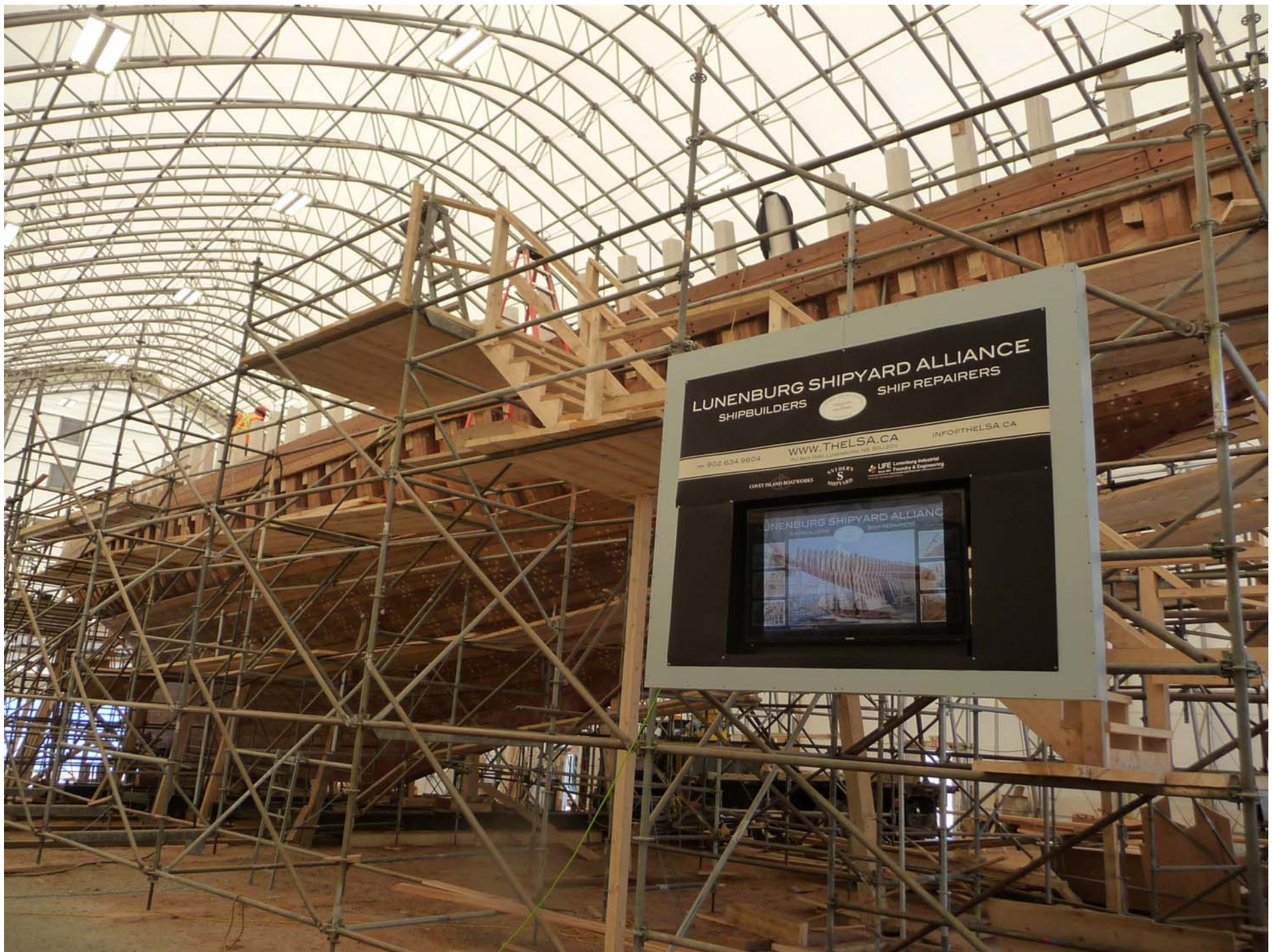
The Bluenose II. Covey Island Boatworks is part of this Shipyard Alliance.