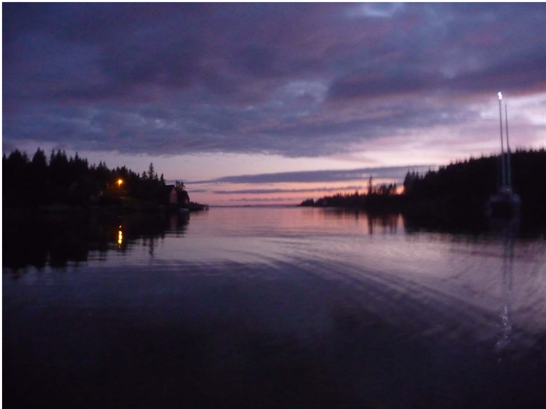
Sunset in the Folly channel. Running Free is at right with it's anchor light on.