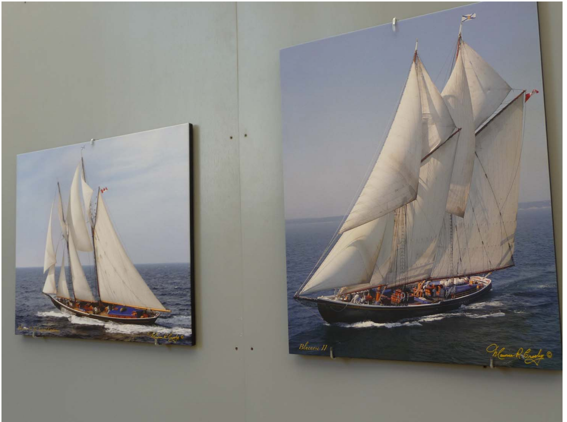
Maurice Crosby's paintings of the Bluenose II.