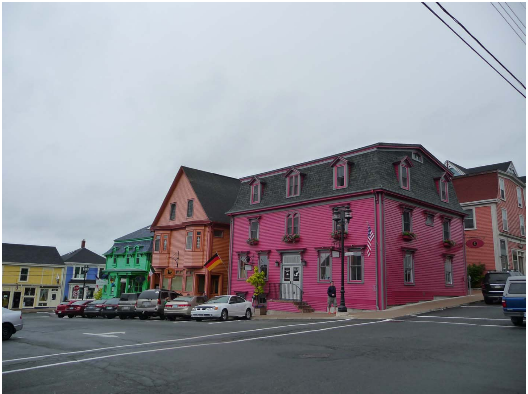
Colorful Lunenburg stores and B & B's.