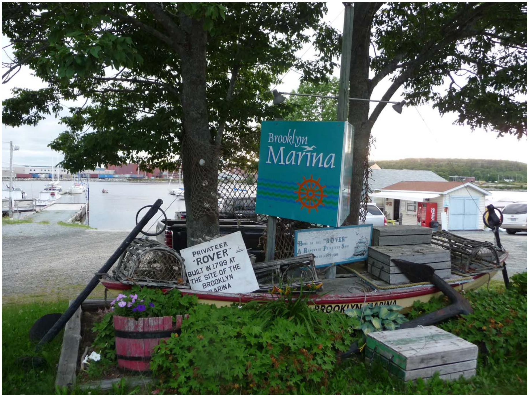
Brooklyn Marina in Liverpool Bay. Canteen to the right in picture.