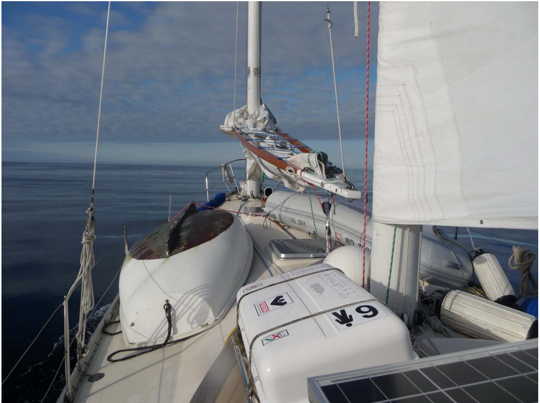
Motoring with mizzen sail up stabilizes the boat. Deck shows our new life raft & solar panels in the foreground.