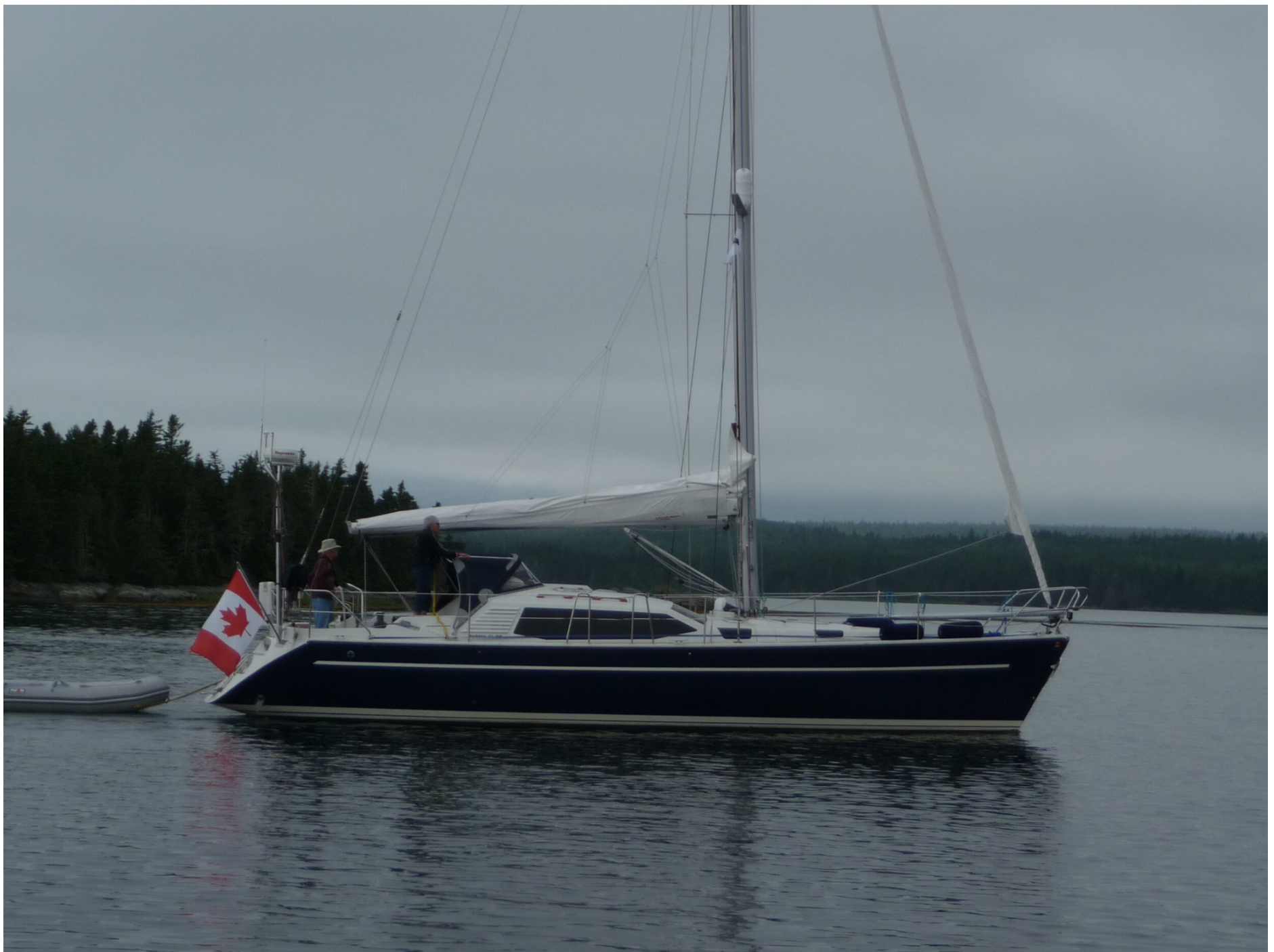
We meet up with friends Rod & Gail Fraser on Nor'easter in Folly Island Channel.