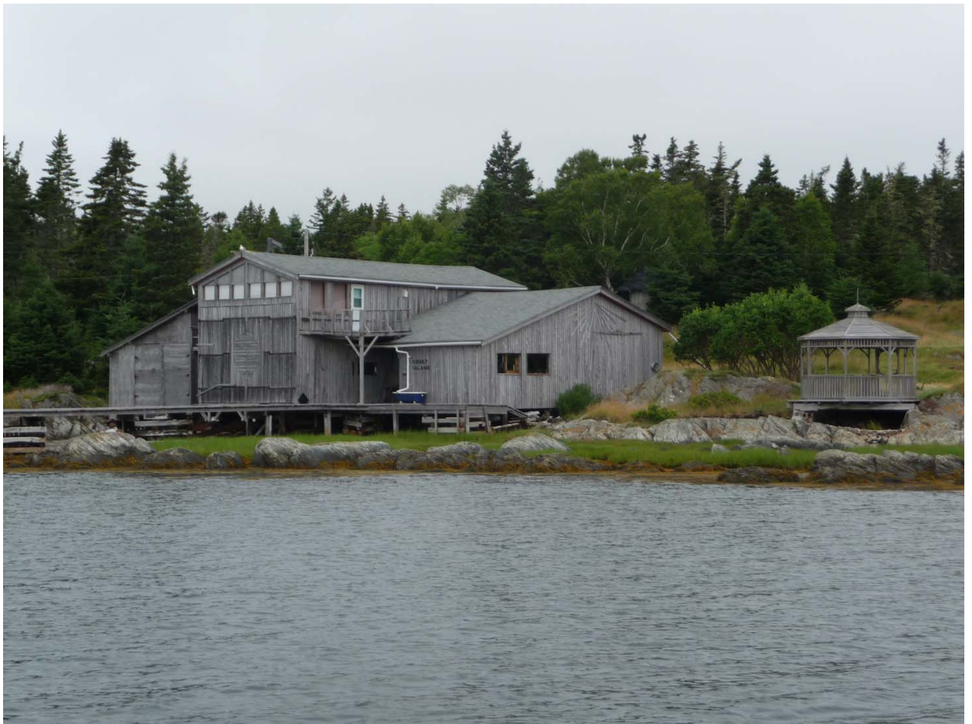
We anchor in front of the old Covey Island Boatworks in Folly Is. Channel.