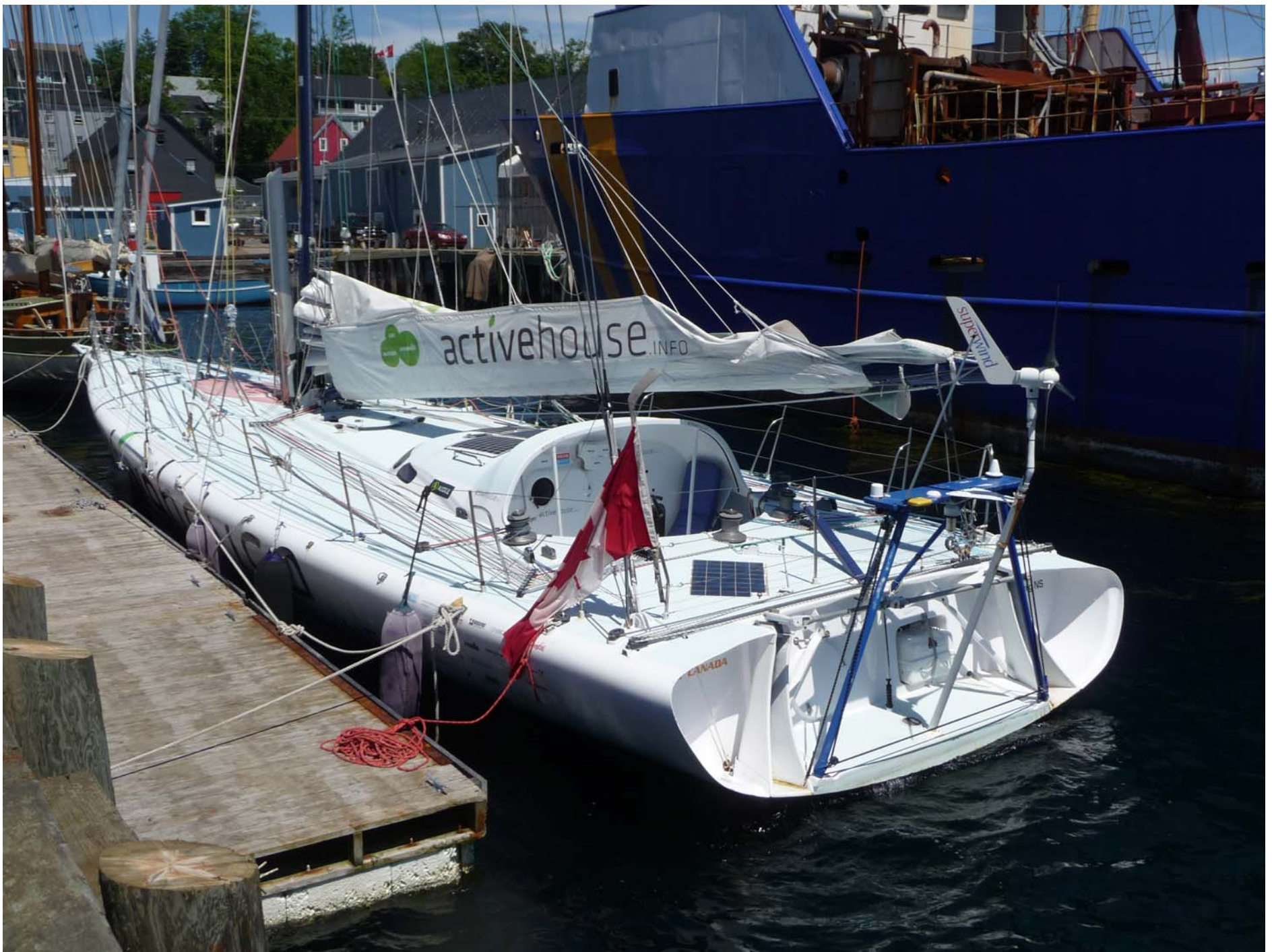
Ocean 60 raceboat, Spirit of Canada, which has been around the world 3 times.