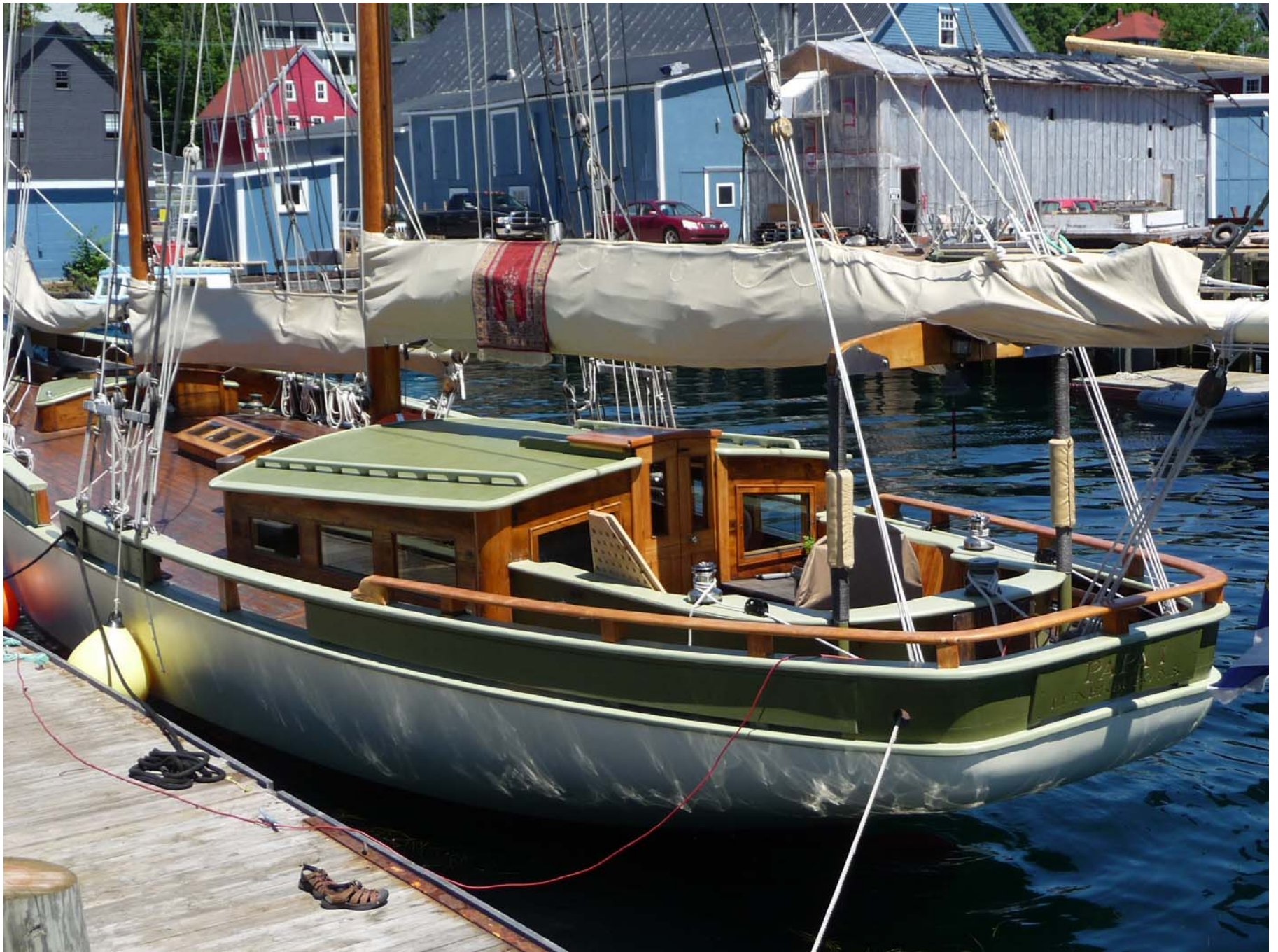
Beautiful stern section of the Papa I. Carved dolphin head on each side of the handrail.