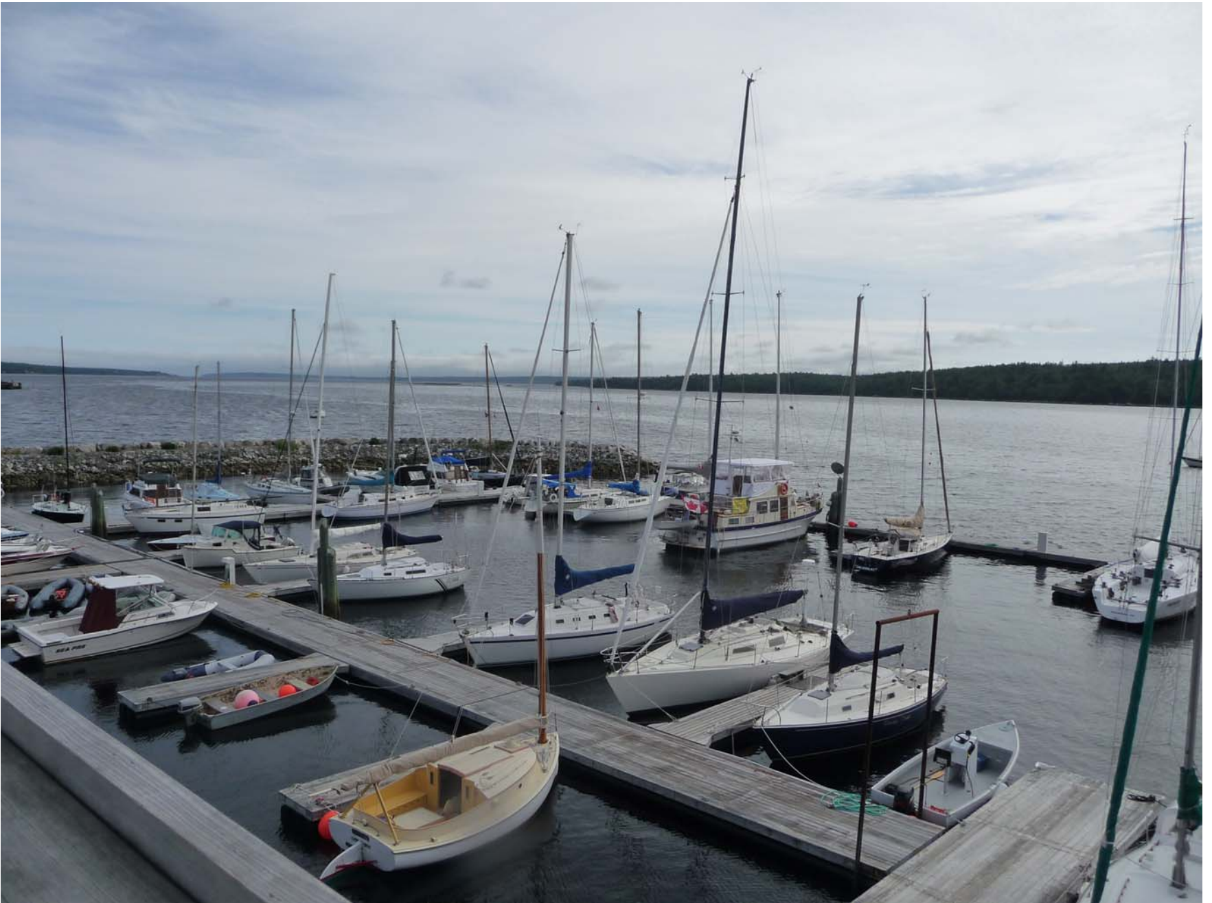
Shelburne Yacht Club. Happy to be there.