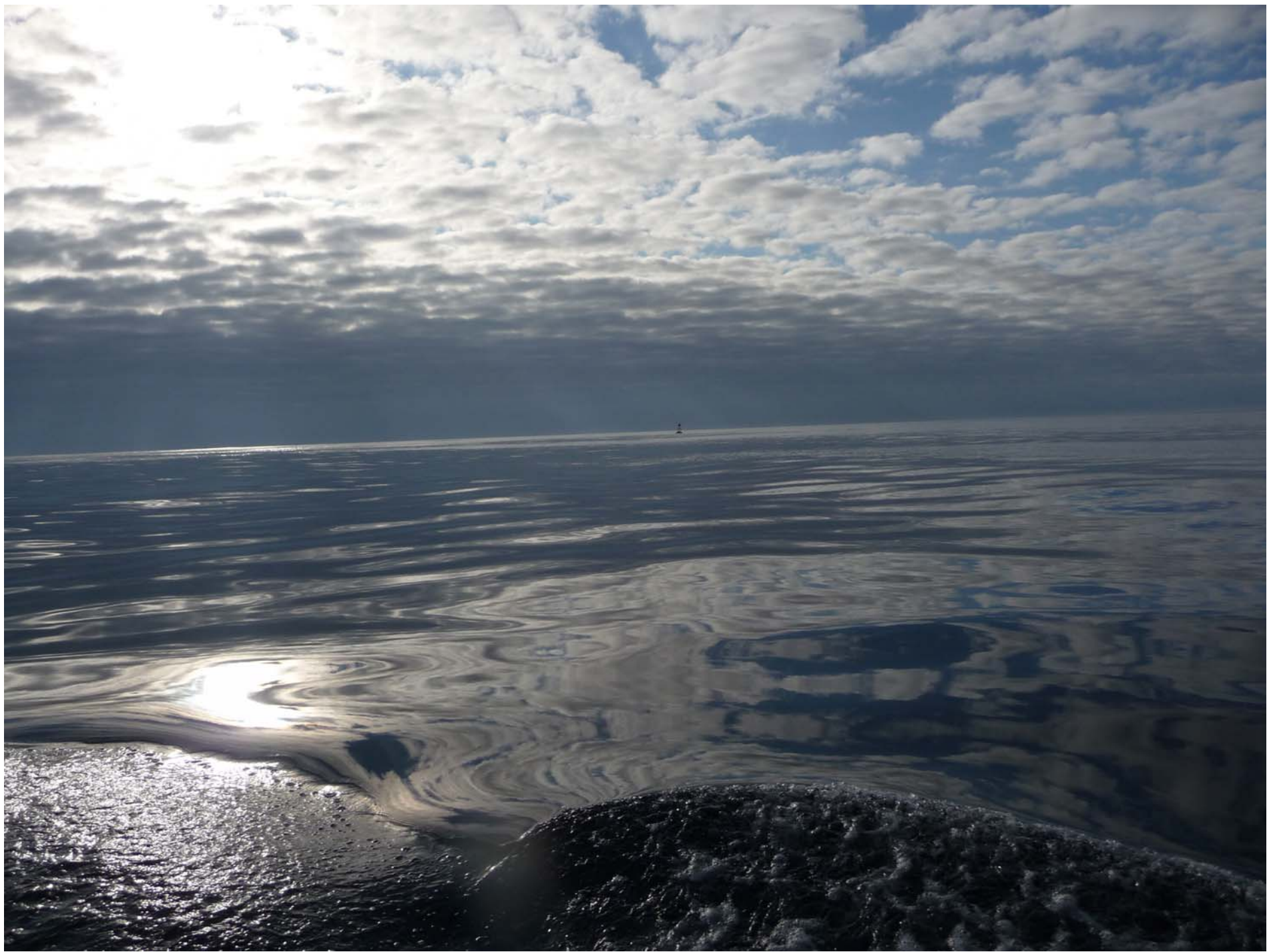
Motor sail to Shelburne. This shows the Atlantic as gentle as a mill pond.