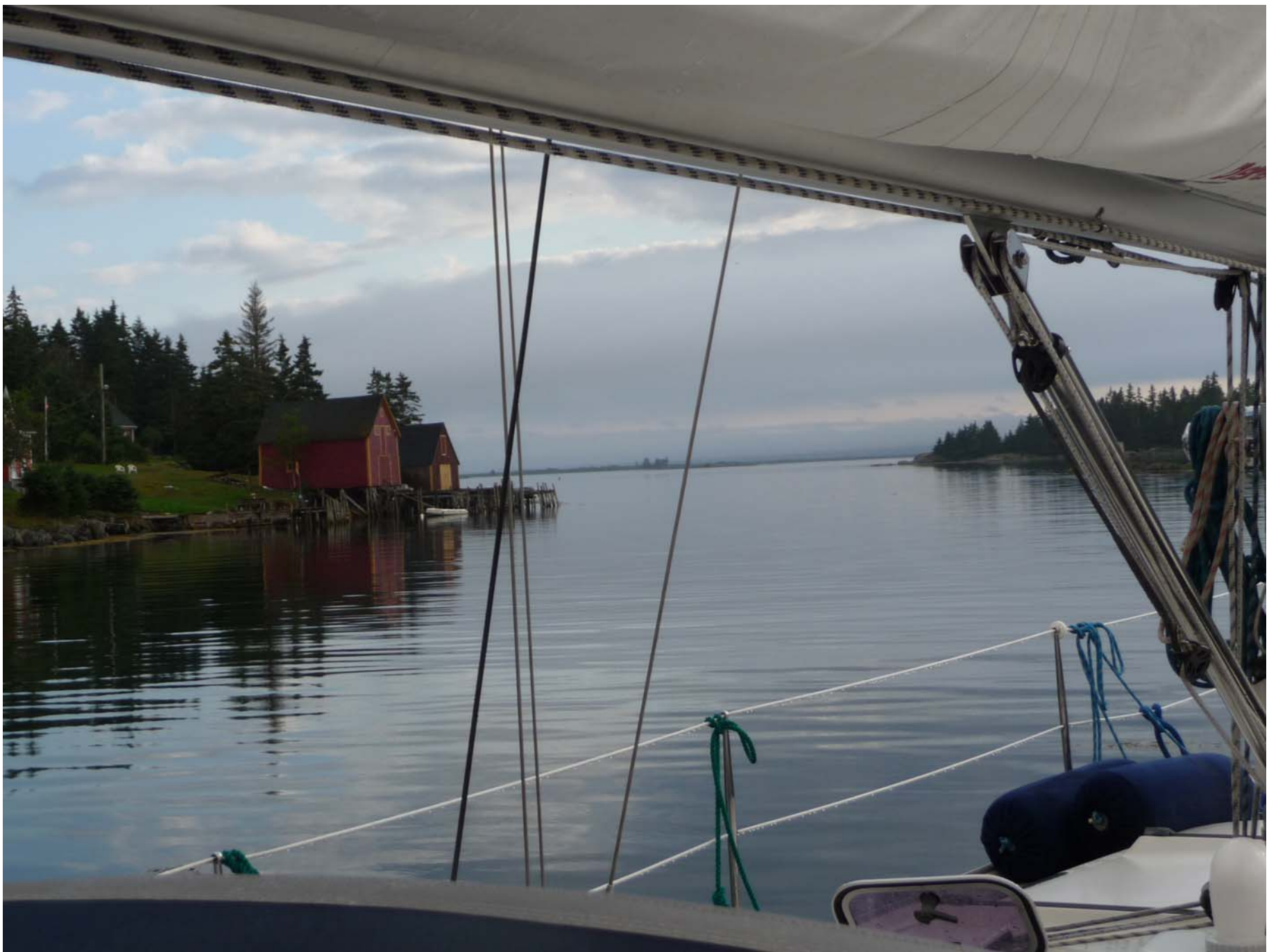
Pretty picture of Folly Island Channel.