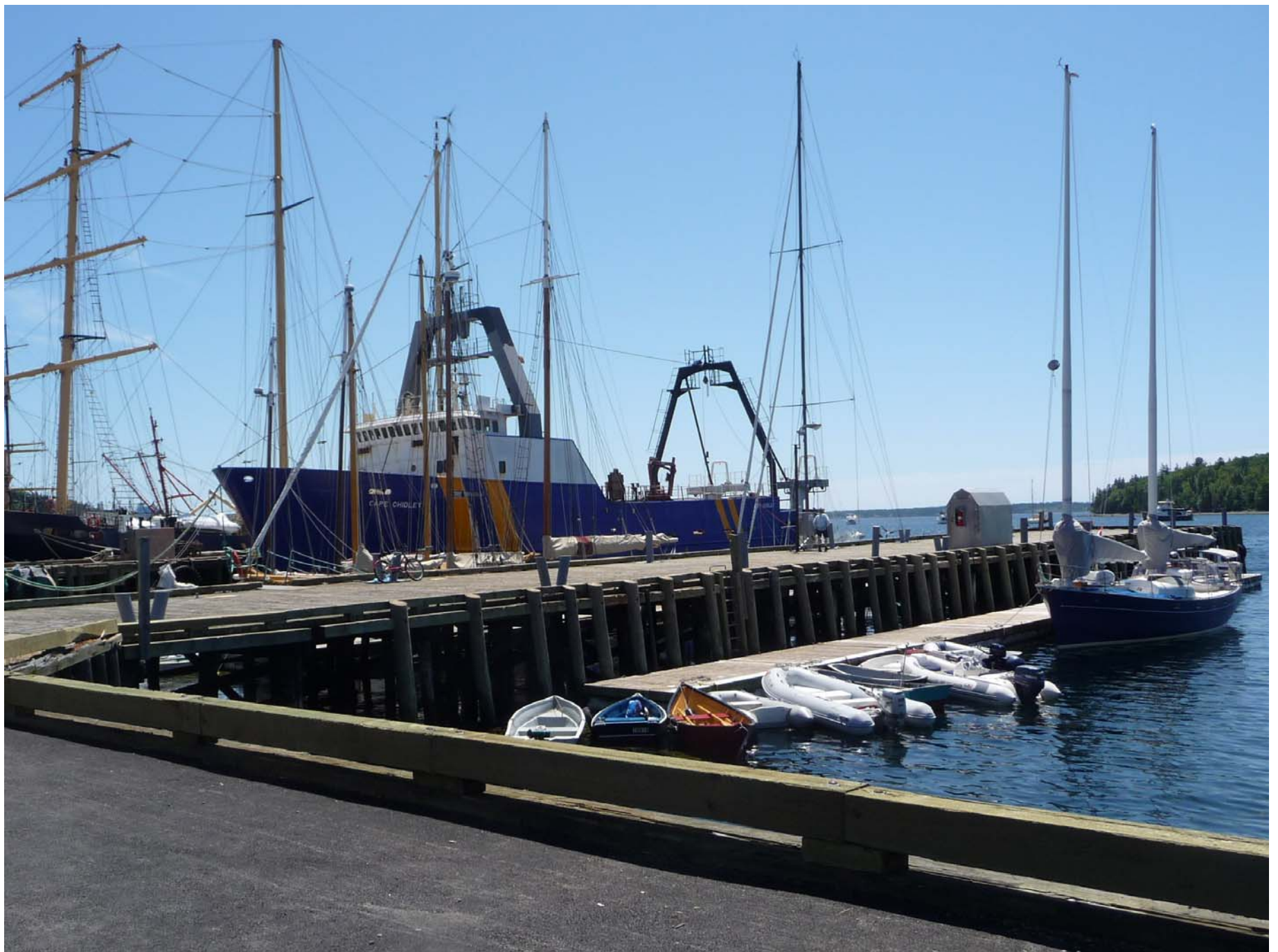
Tied up to the Zwicker wharf at the new floating docks. Papa I is on the other side.