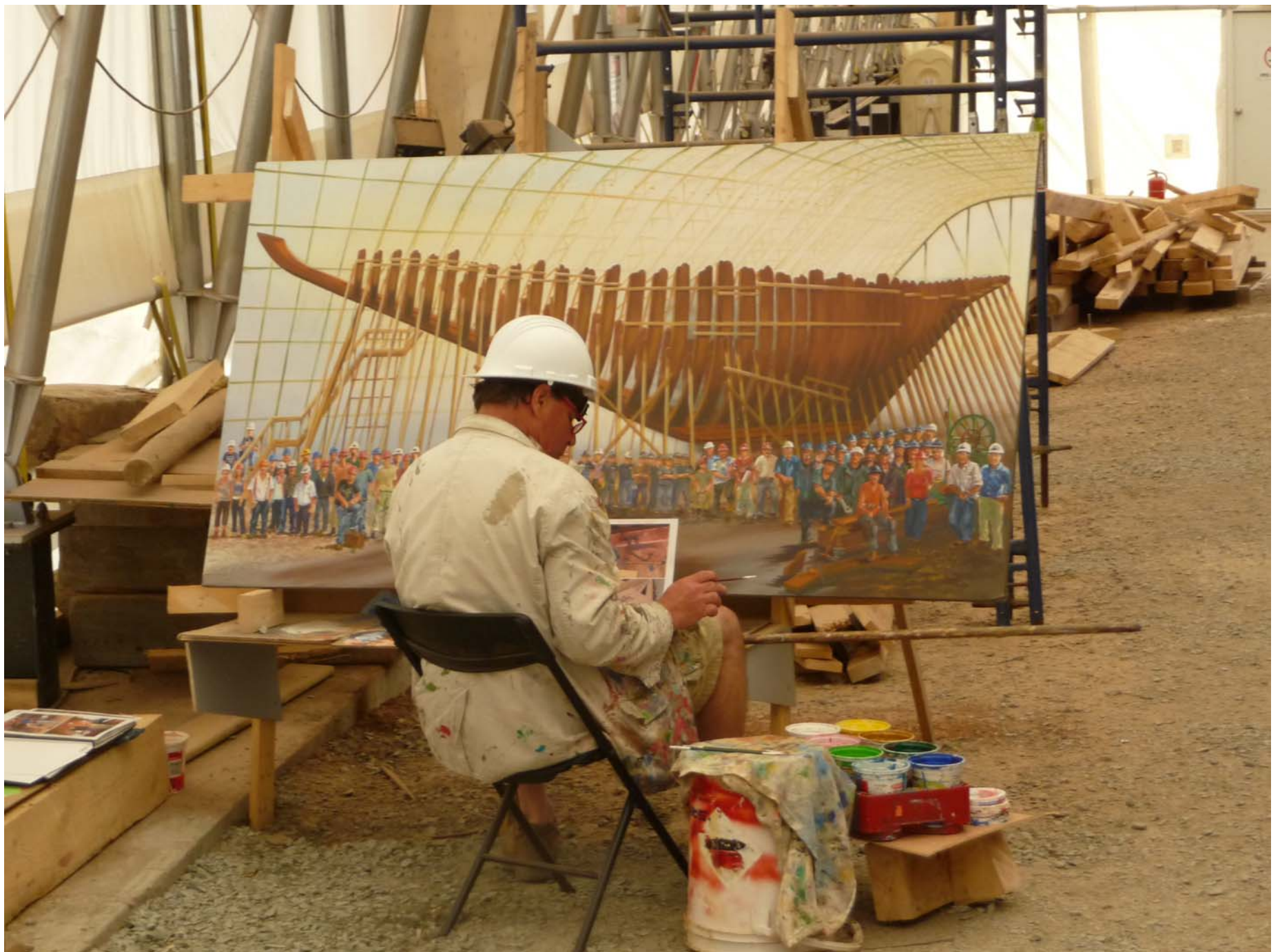
Maurice R. Crosby, official painter of the Bluenose II.