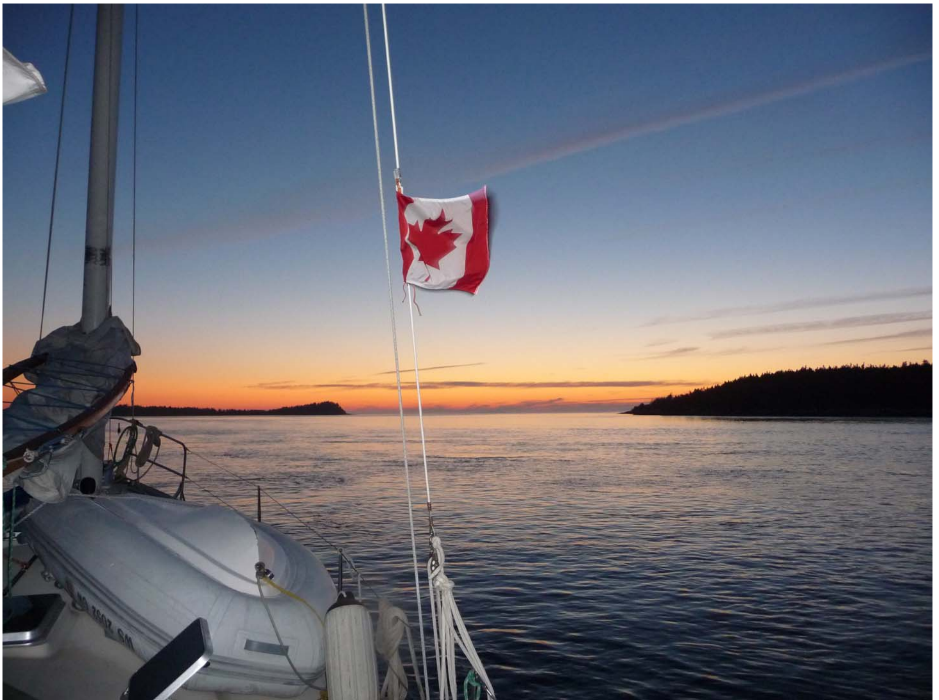
Sunset at anchor by Turpentine Island in the Tusket Islands. Our last night in Canada. Overnight passage to Maine the next day.