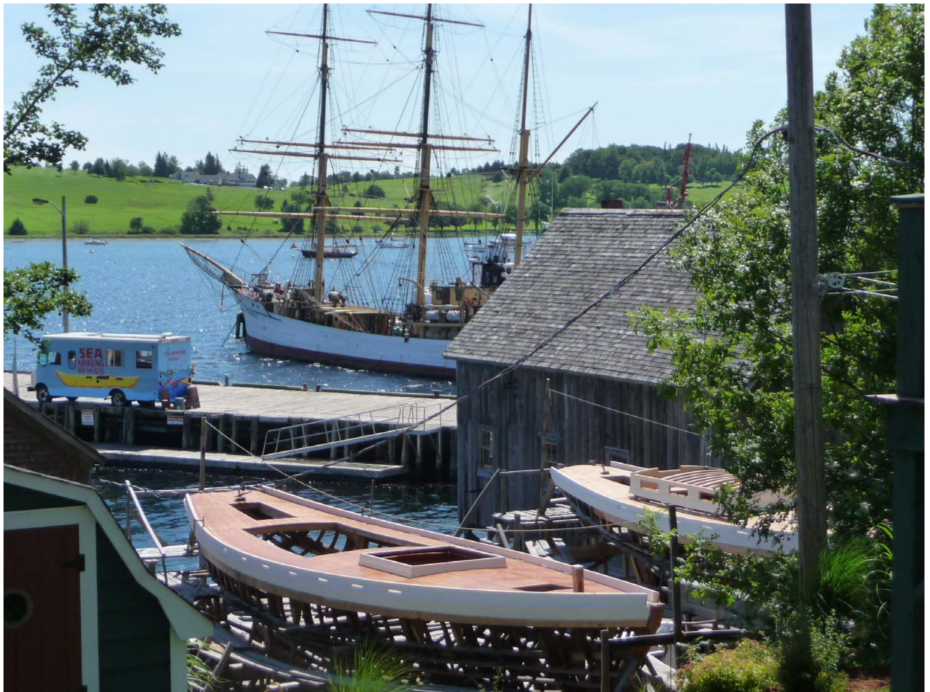
Lunenburg is a boat building mecca. Here are the twin schooners being built that were featured in Wooden Boat Magazine.