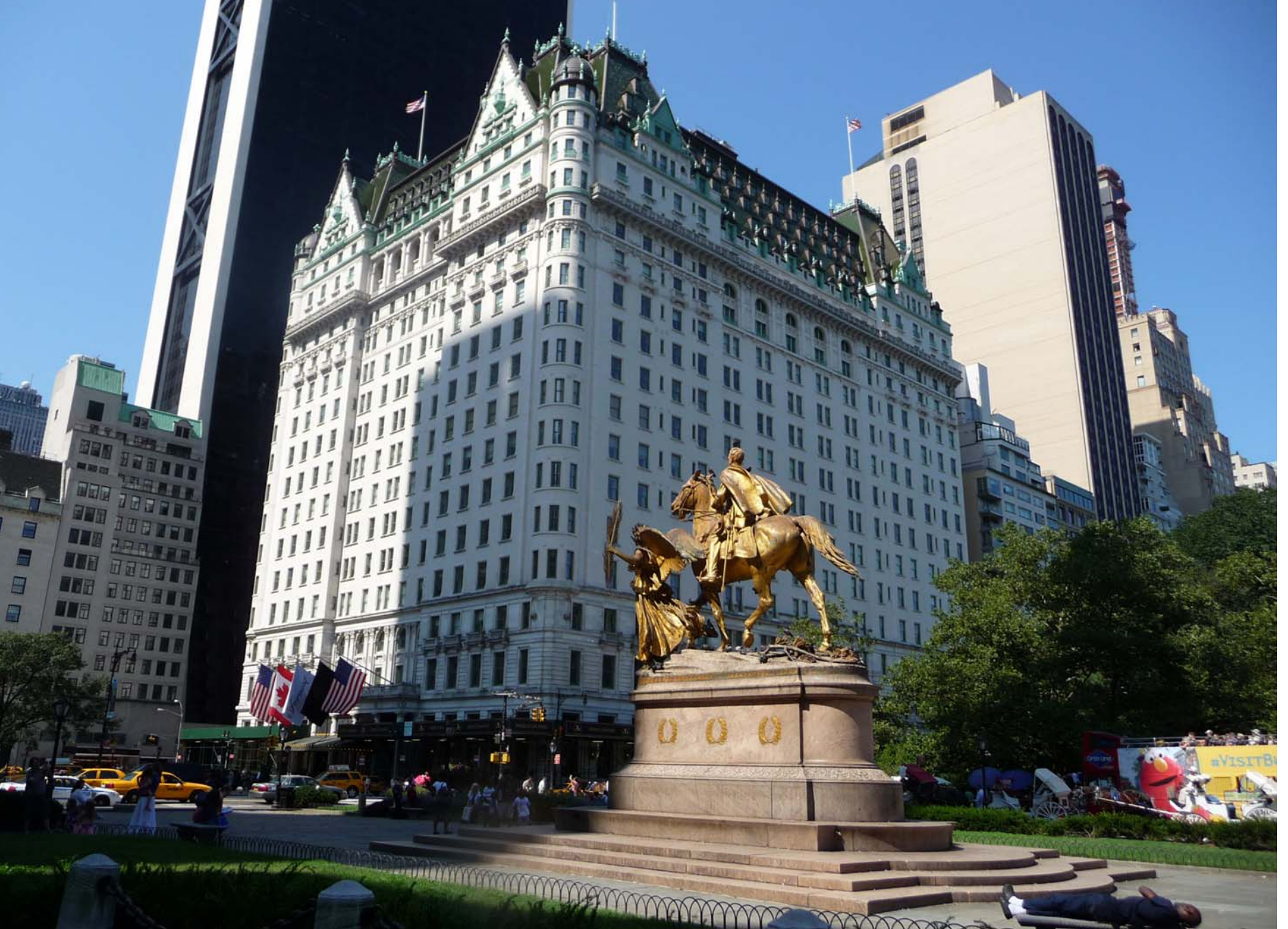
The Plaza Hotel at Fifth Avenue & Central Park South.