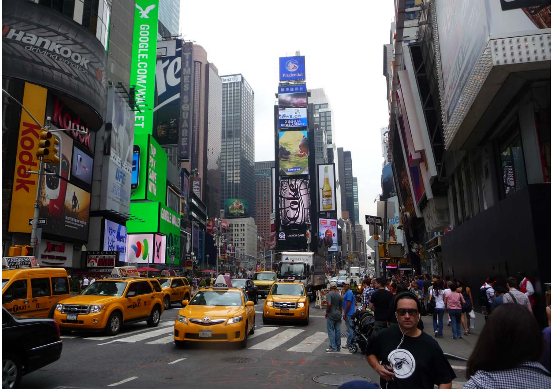
Easy to get a cab in New York.