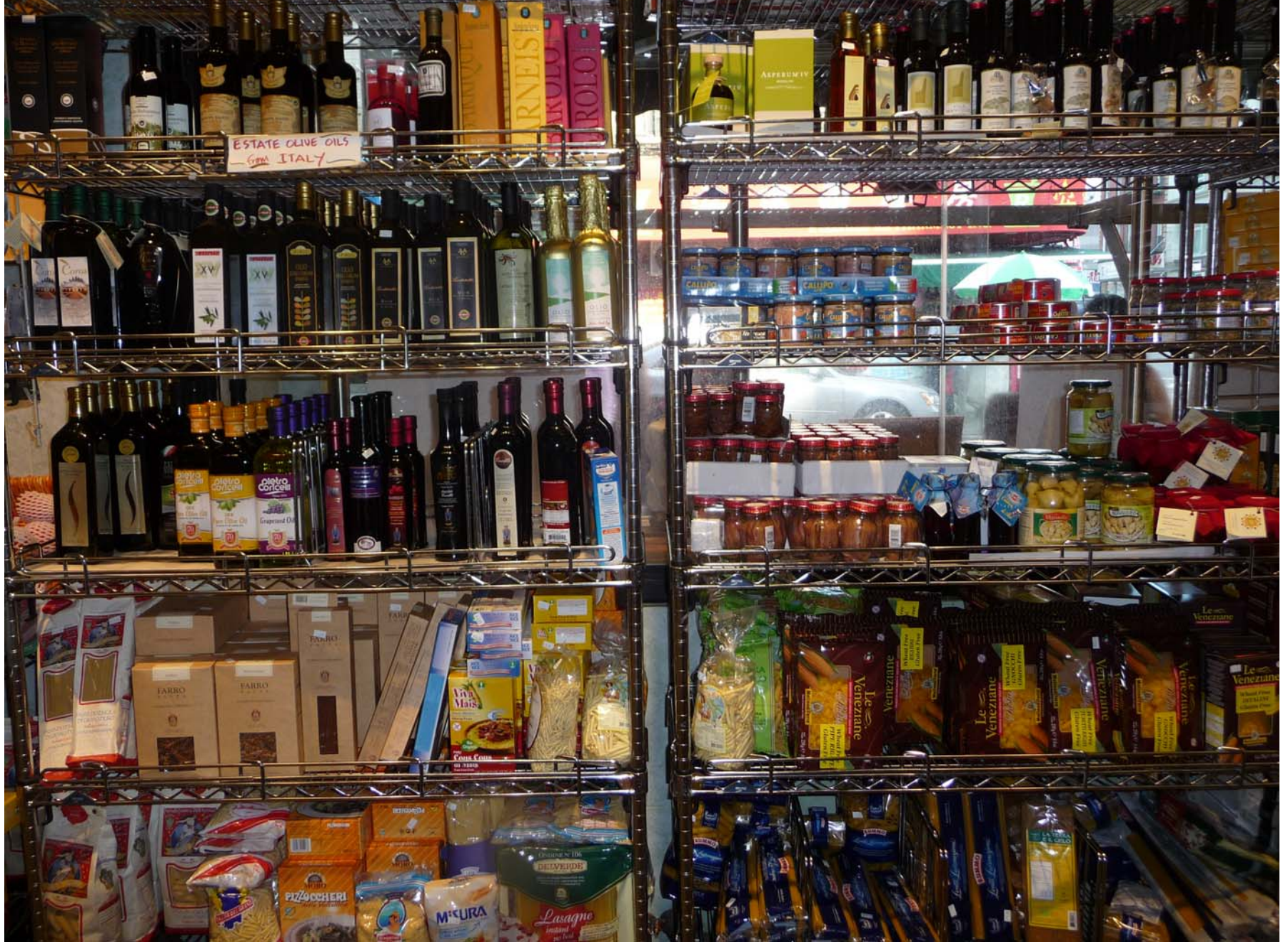
So much to choose from.