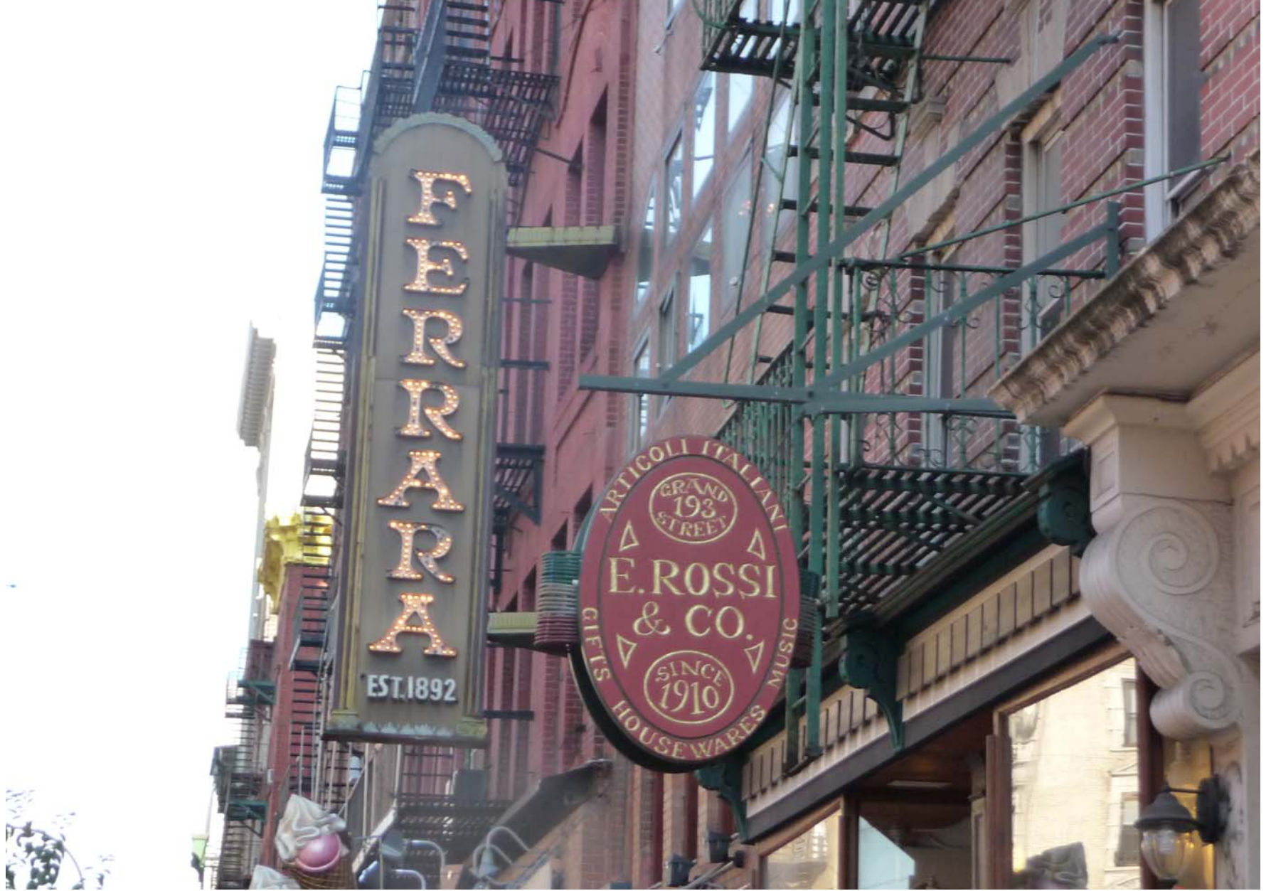
Ferrara's (1892) and E. Rossi's (1910)