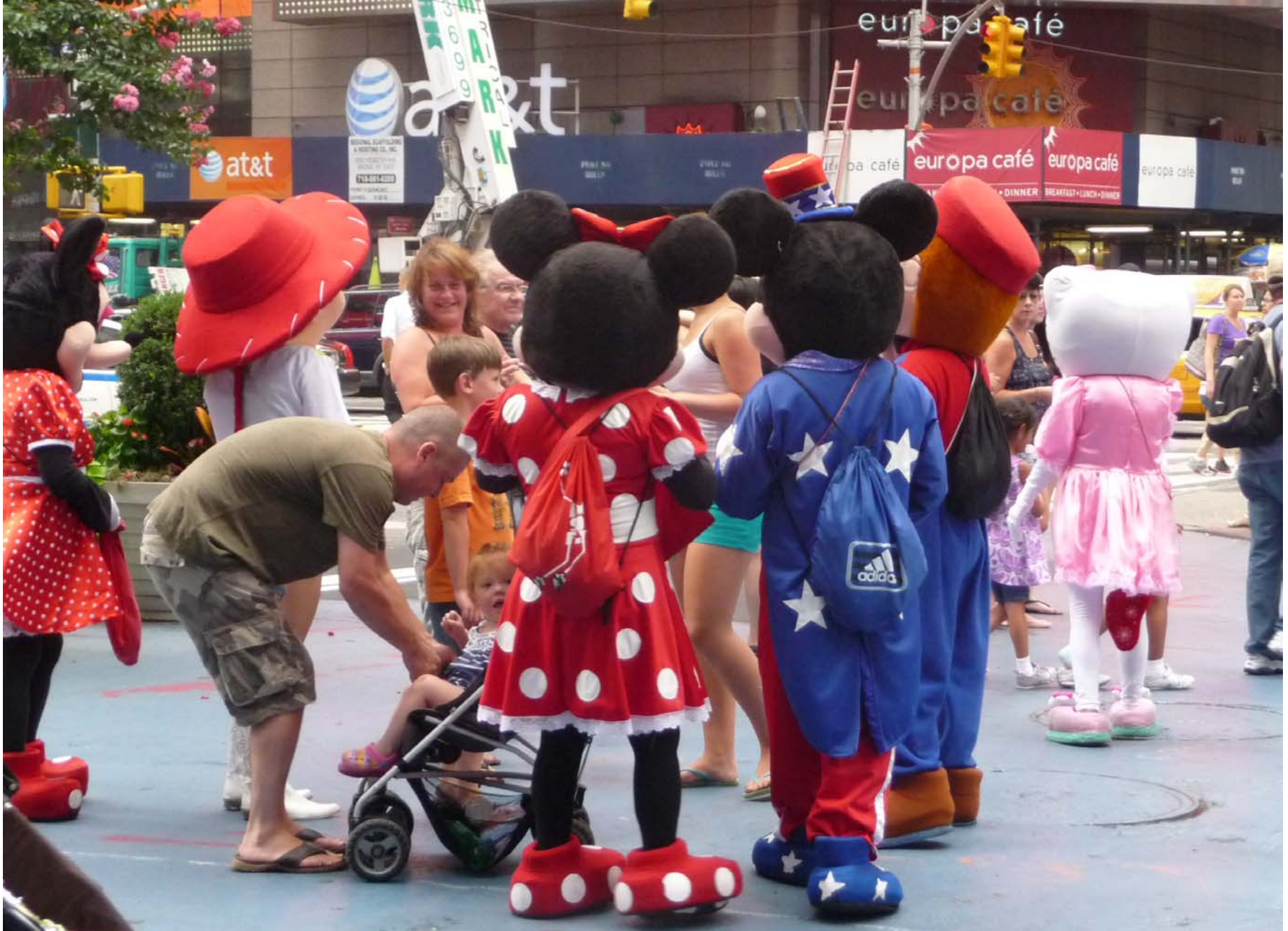
Disney characters make this little girl happy near Times Square.