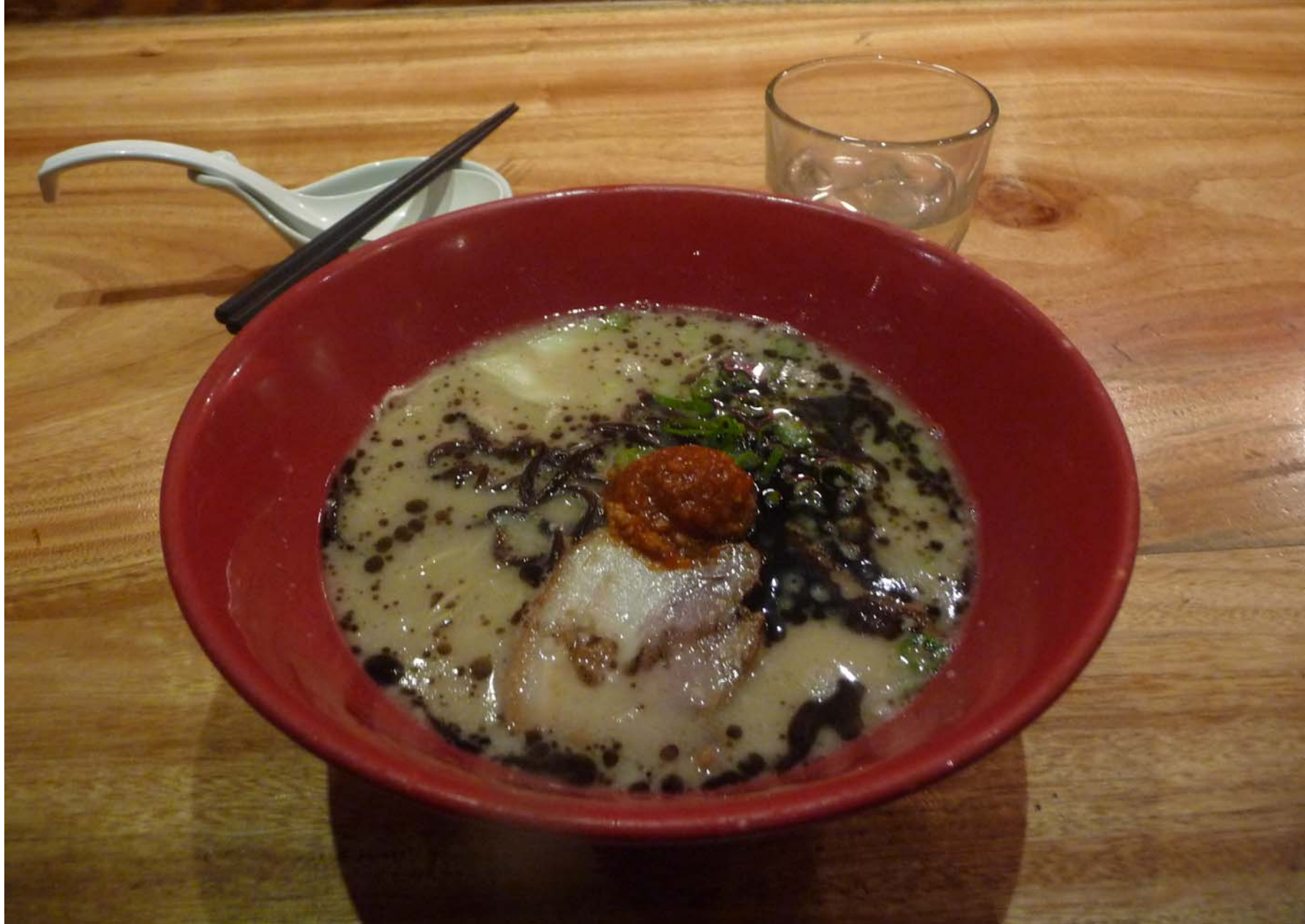
Joyce's bowl of pork ramen. Fresh, yummy ramen noodles.