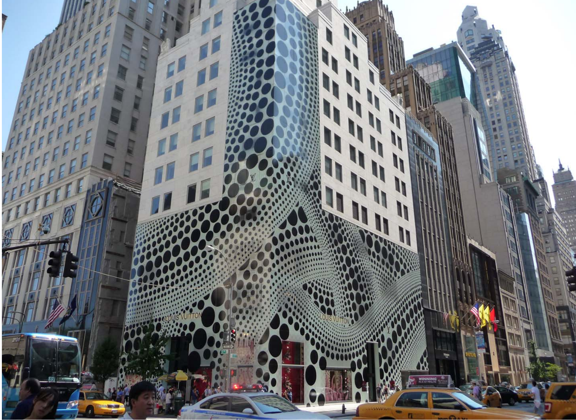
Unique building facade on Fifth Avenue.