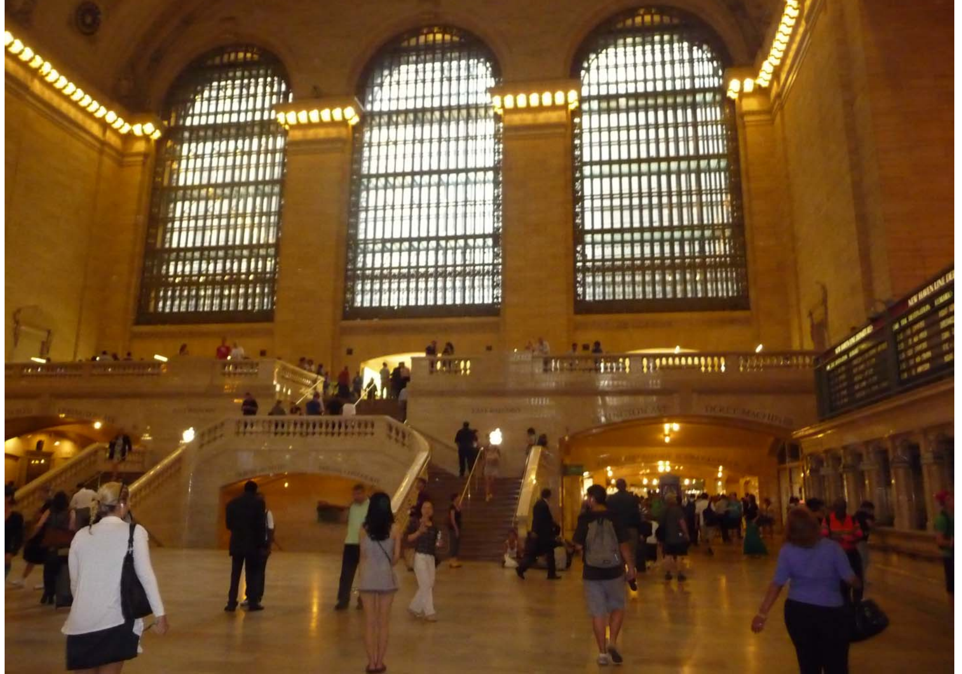
Inside Grand Central Station.