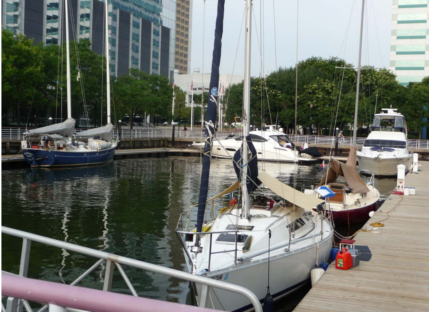
Inside the basin at the Newport Marina. Nice place.