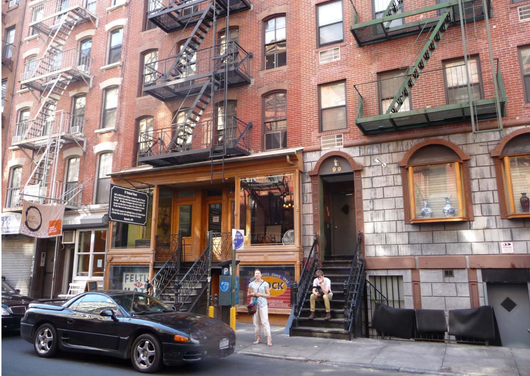
97 Orchard Street tenement building.