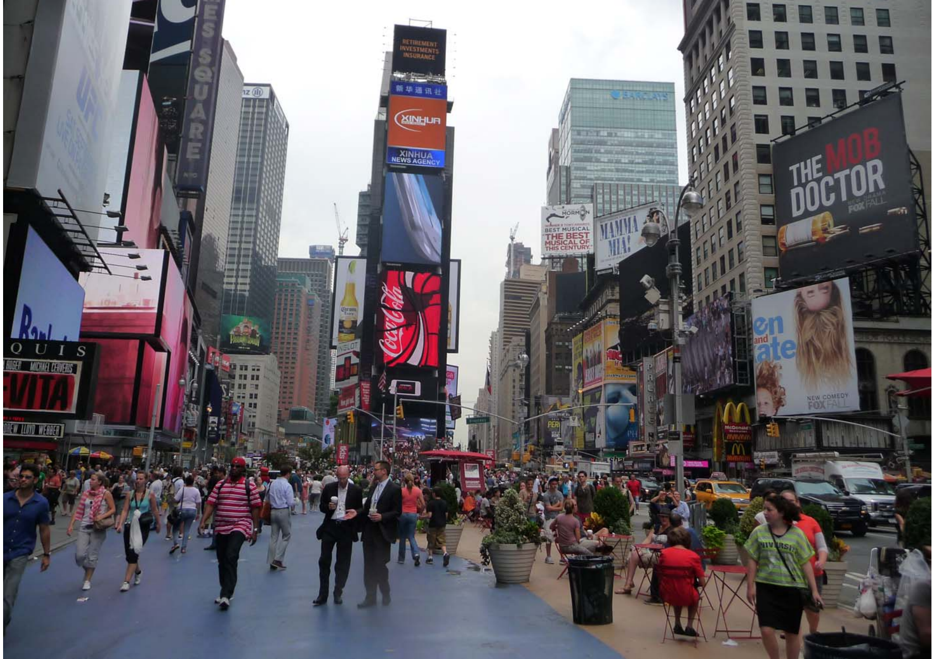
Busy Time's Square.