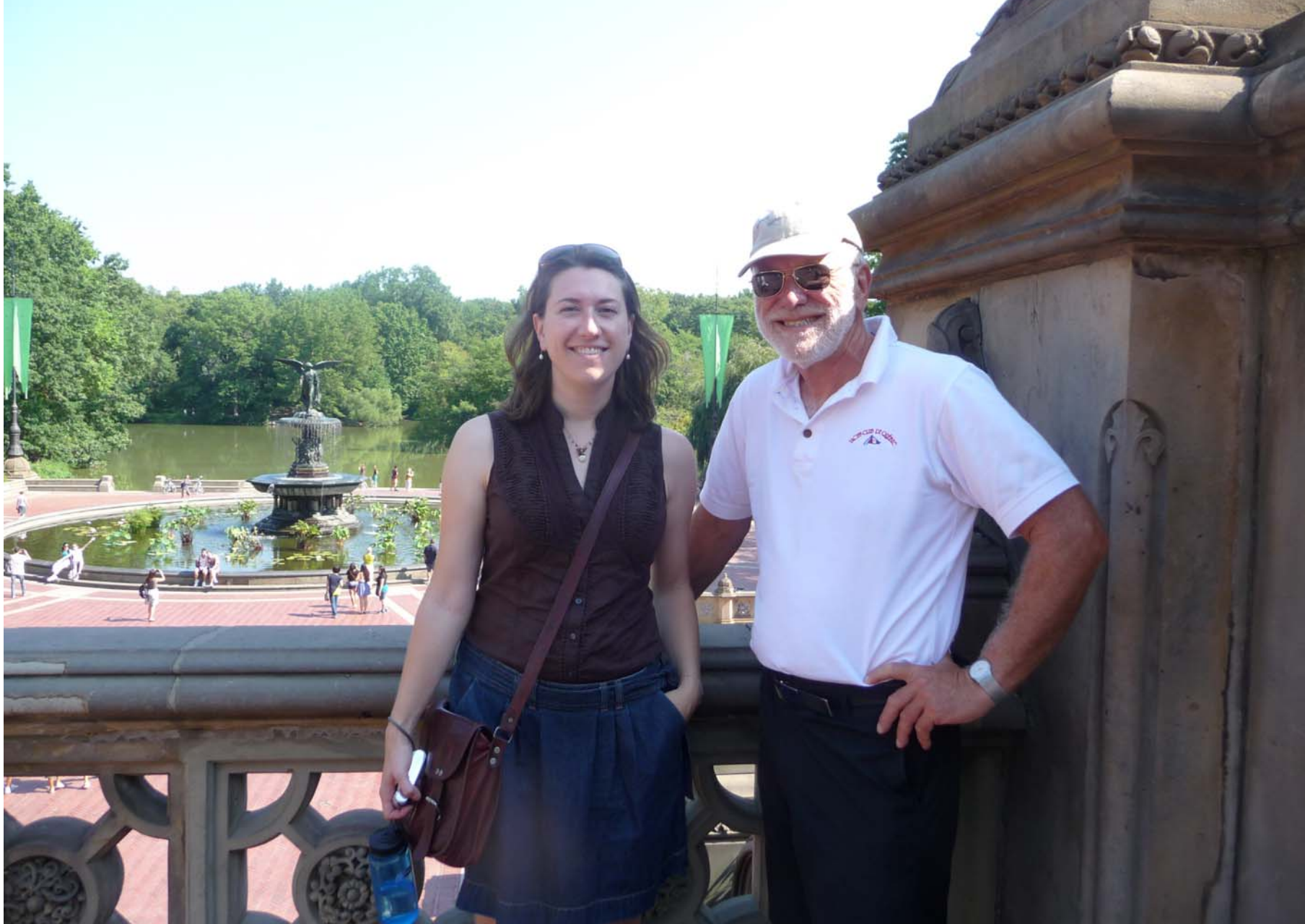
Central Park on a Sunday at the Bethesda Fountain & Terrace.