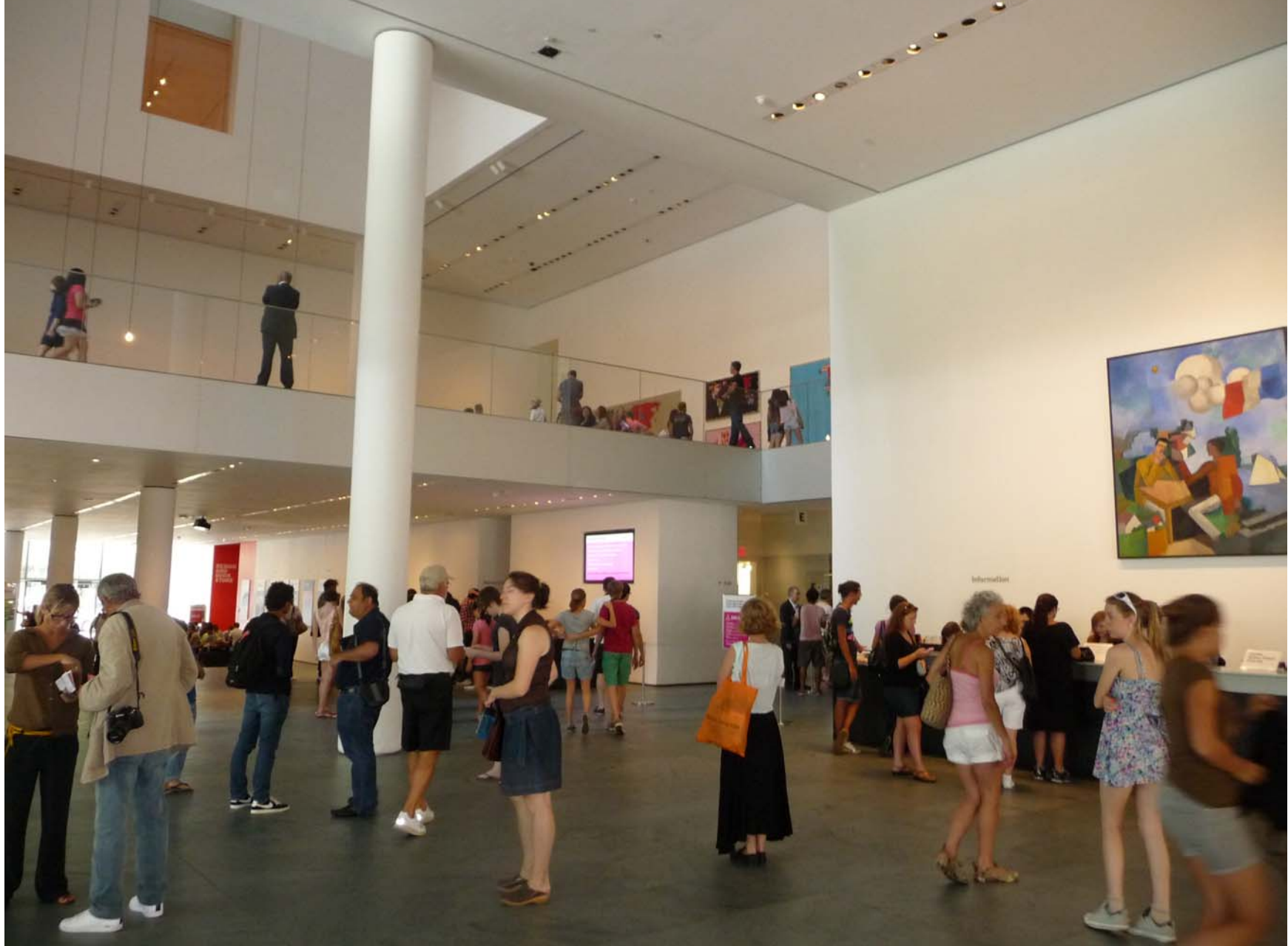
Lobby of the Museum of Modern Art, M.O.M.A.