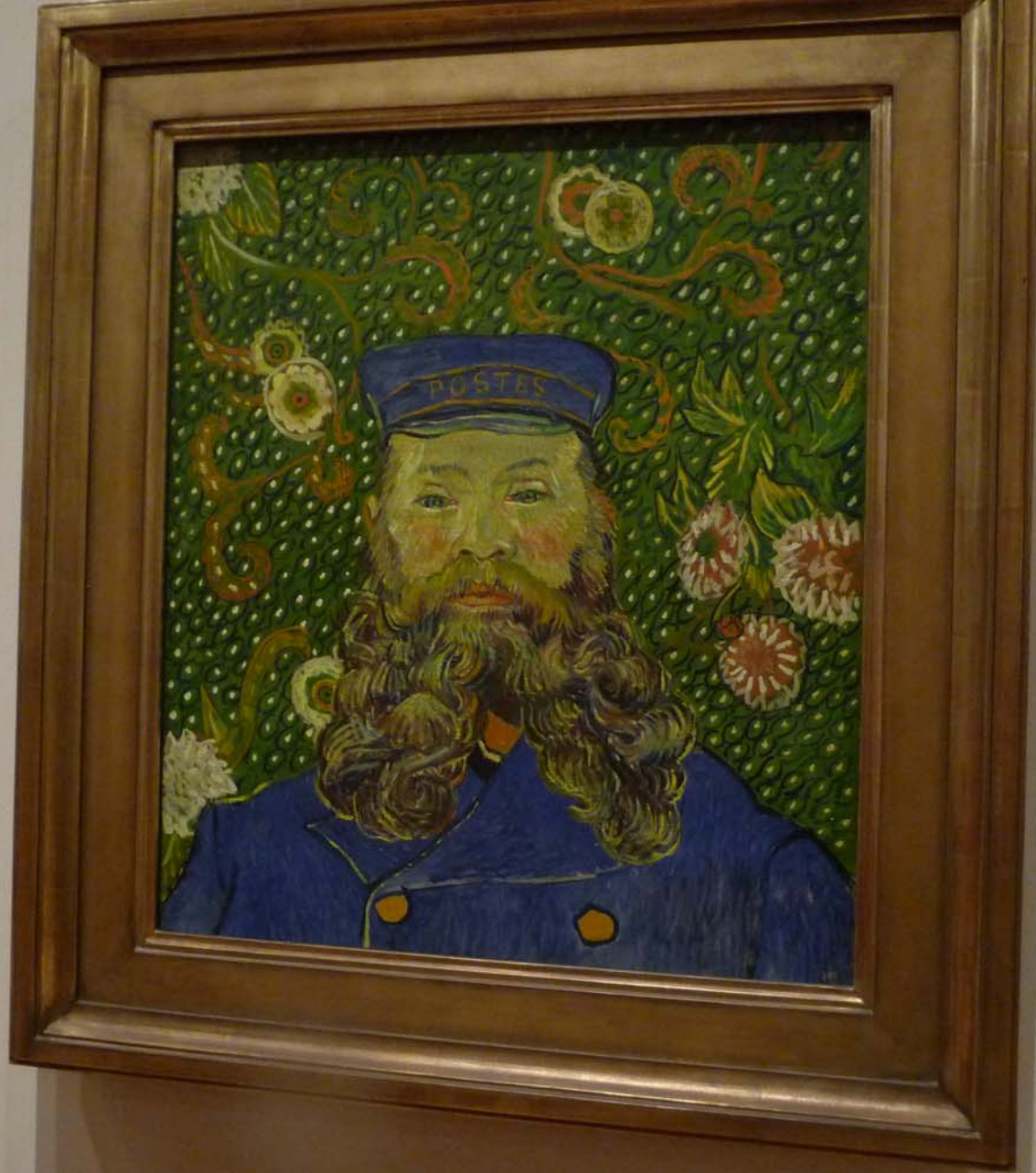
The Postman by Van Gogh.