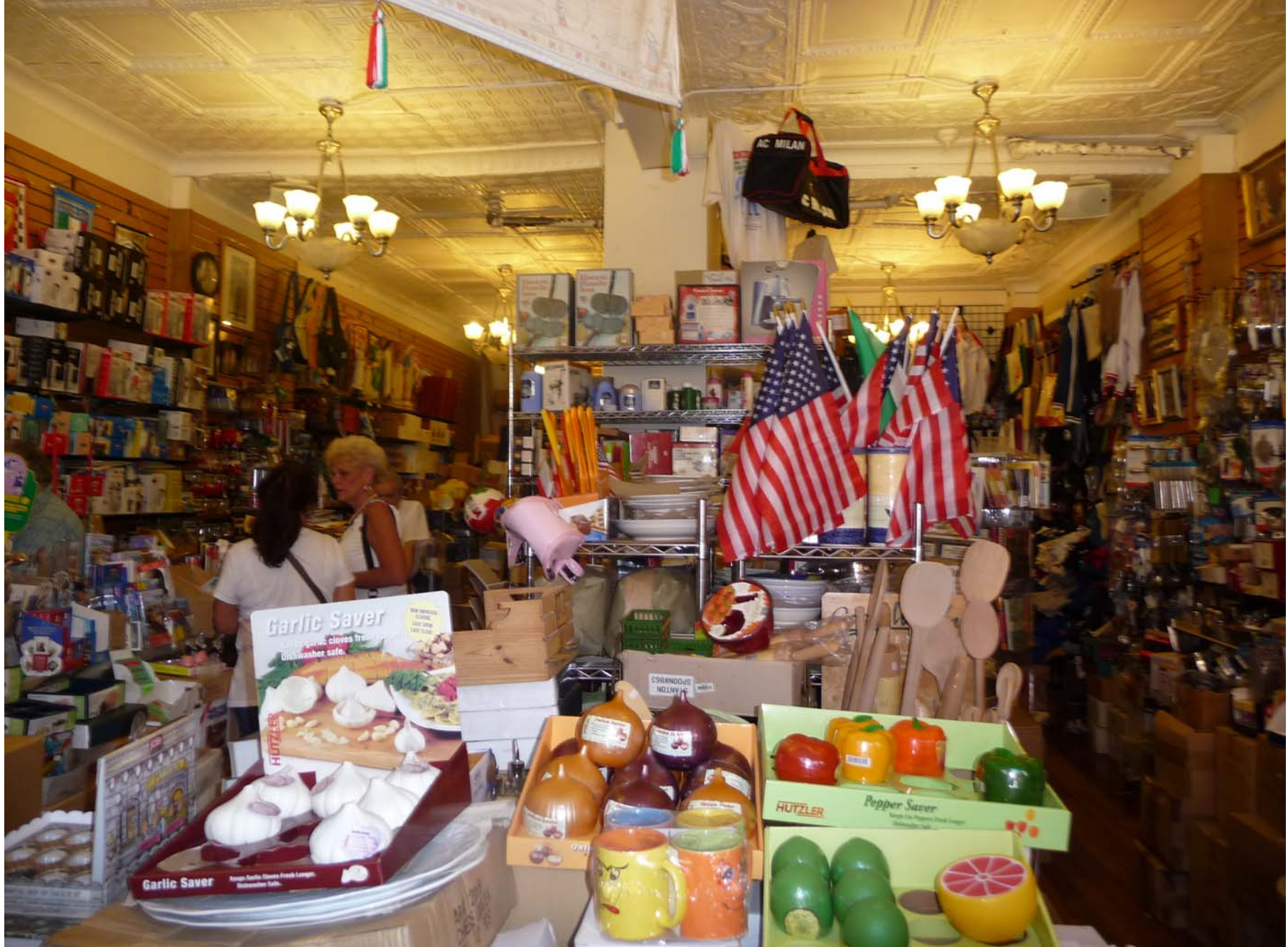
Inside the packed E. Rossi's.