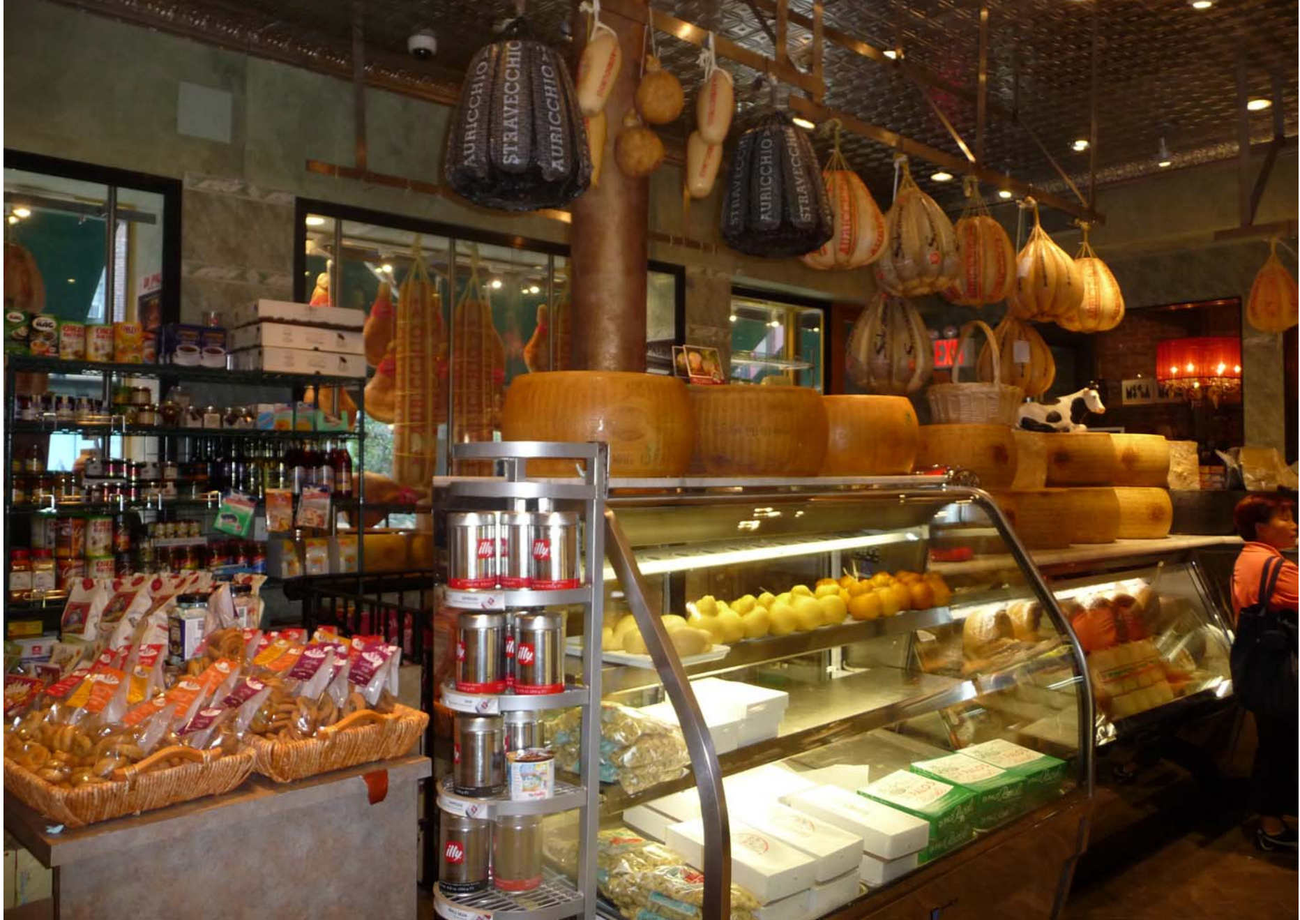
Inside De Palo's.