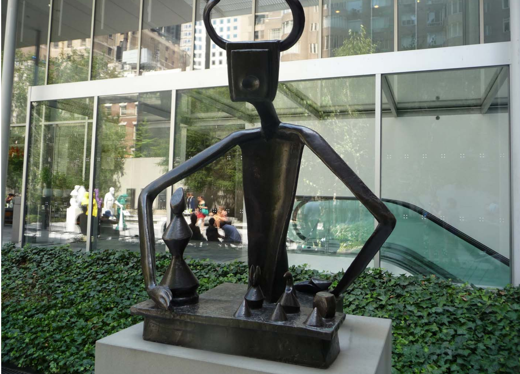
MOMA's Sculpture Garden.