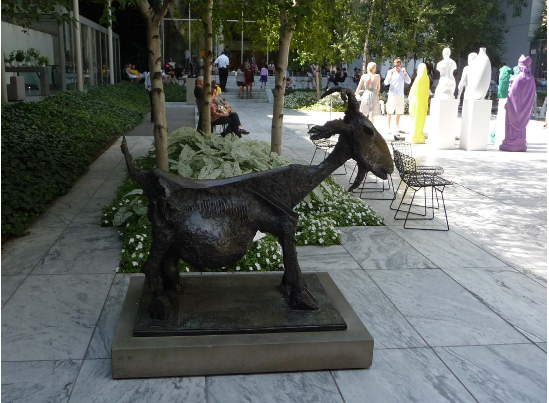
Picasso's goat sculpture.