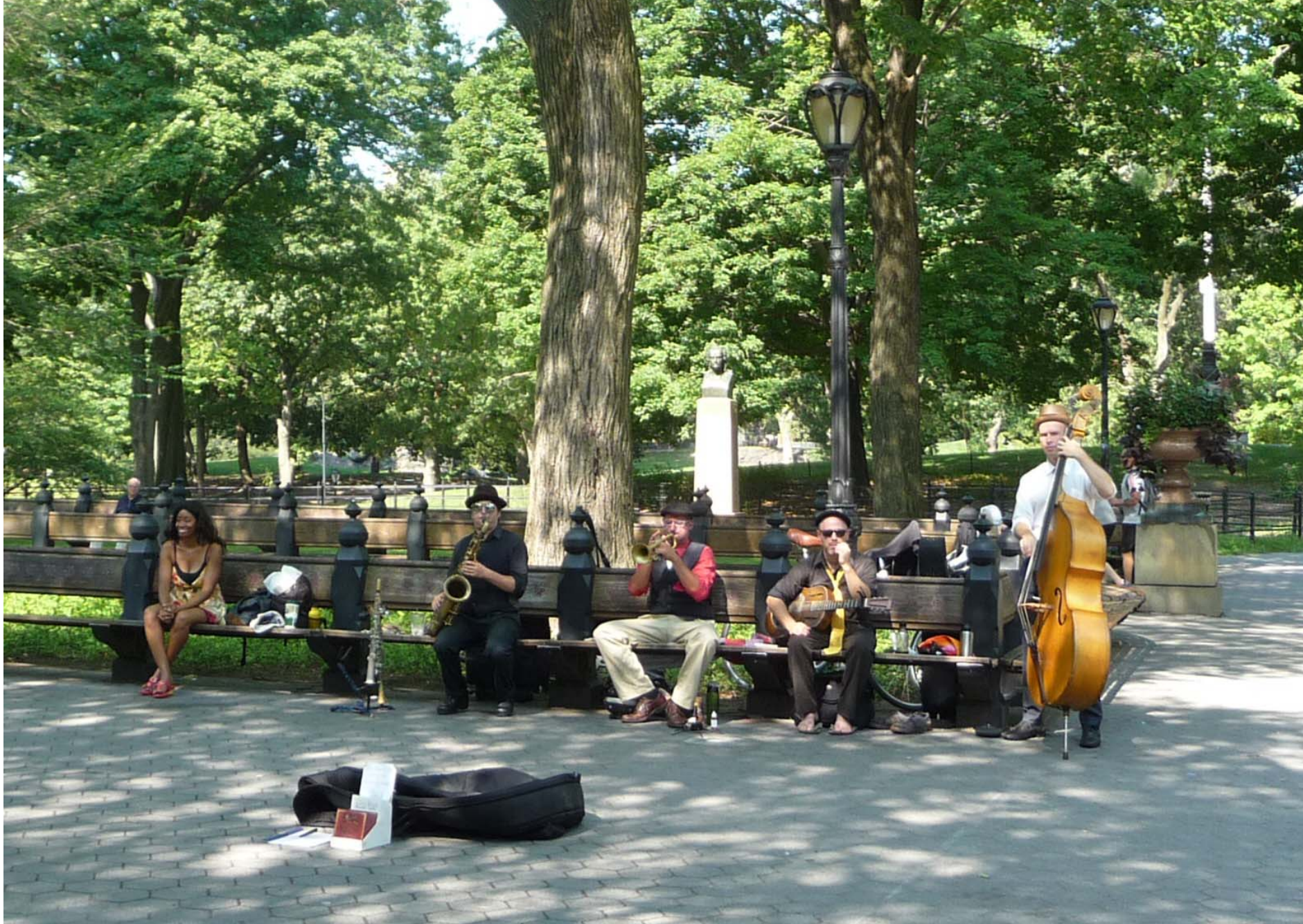
A very relaxed jazz quartet in Central Park on Sun., Aug. 12 th .