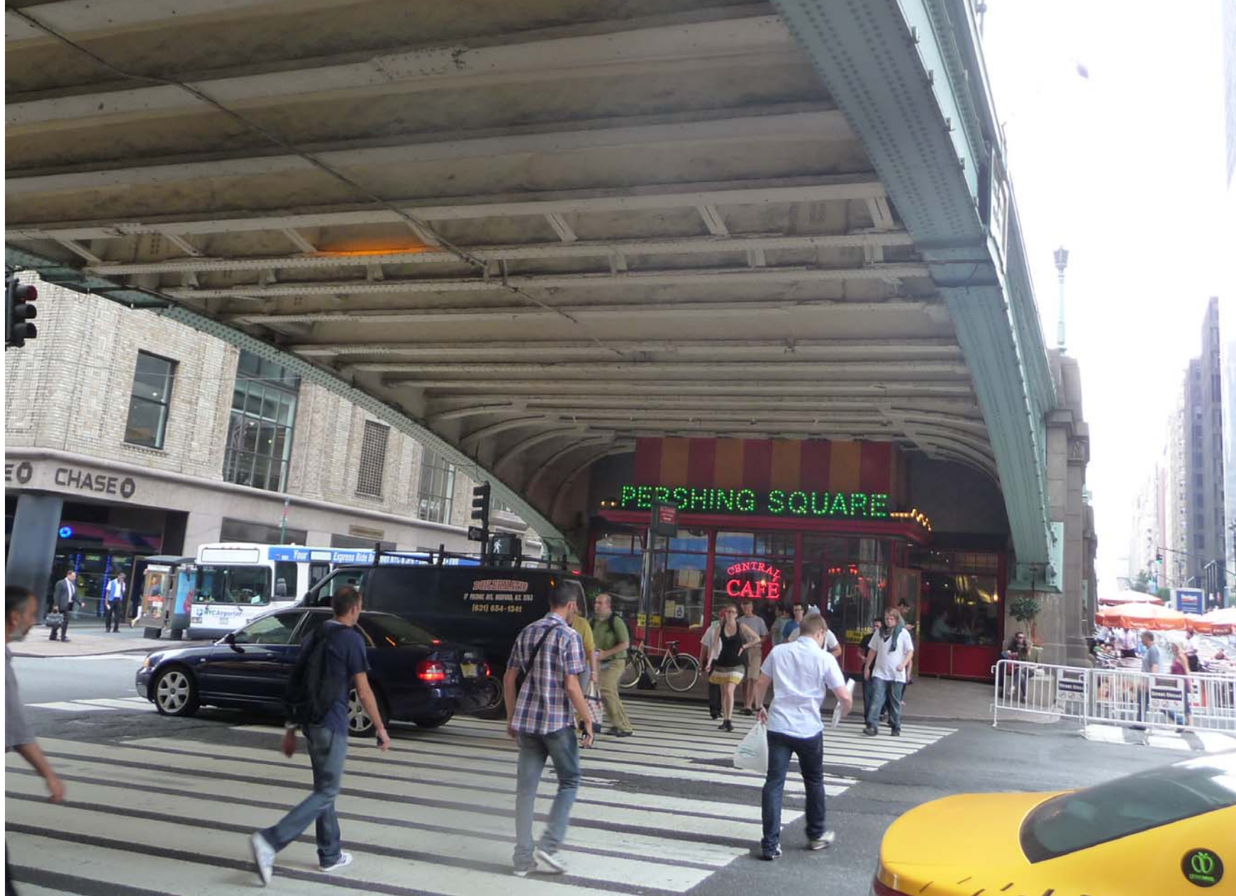
We have lunch at Pershing Square Restaurant which is tucked under Park Ave. next to Grand Central Station.