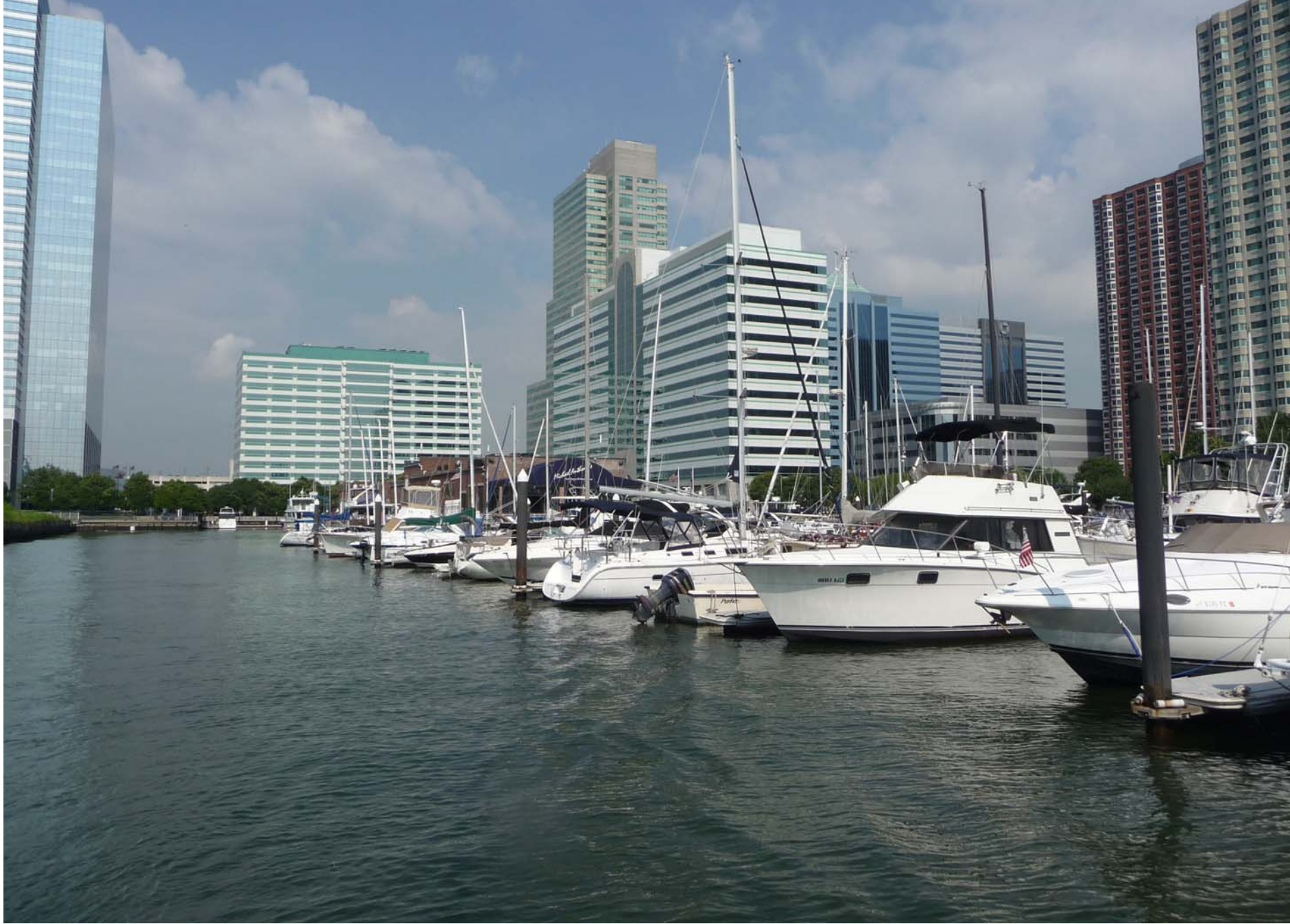
Saying “so long” as we motored out of the Newport Marina.