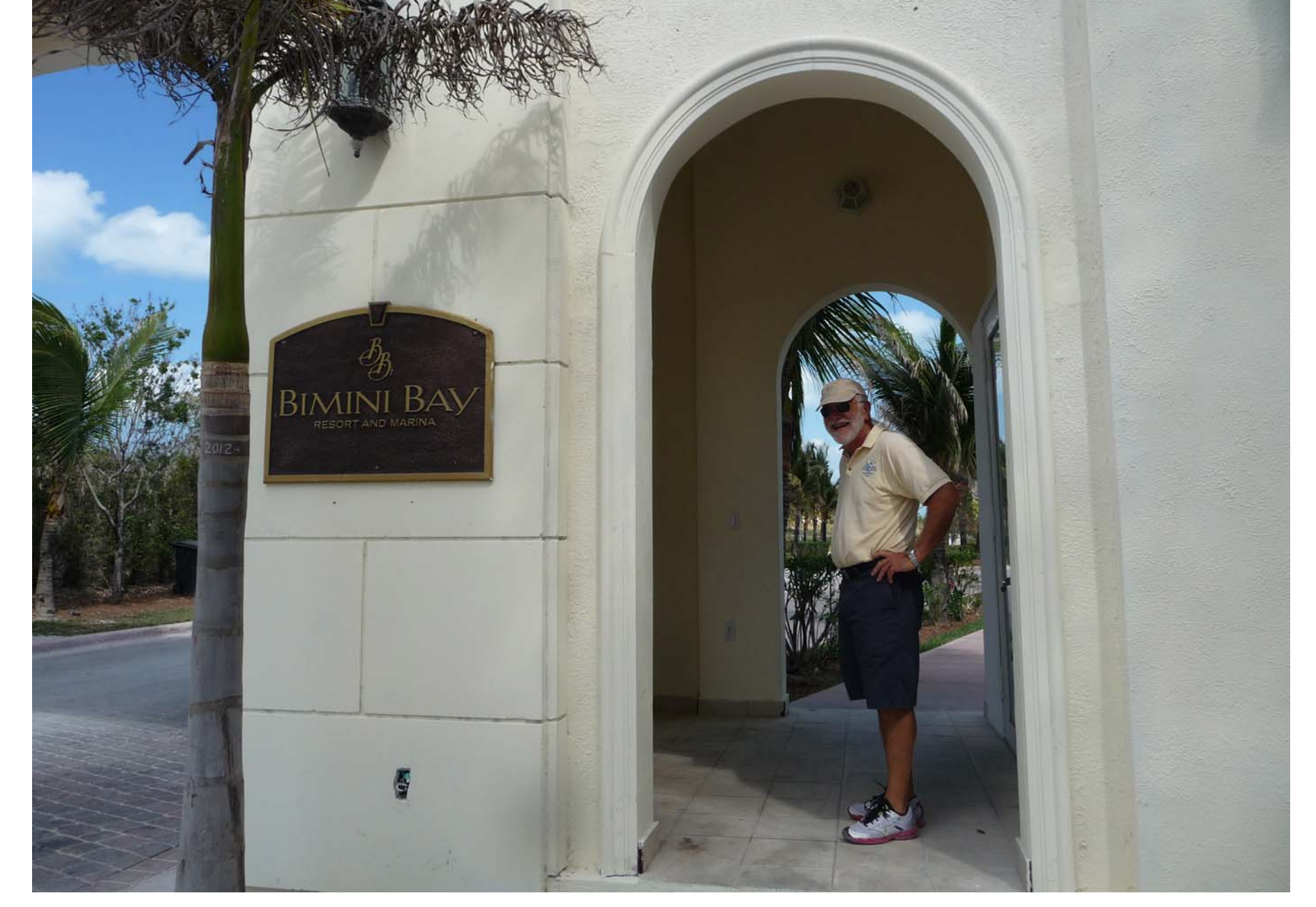
We take a long walk up to the Bimini Bay Resort.