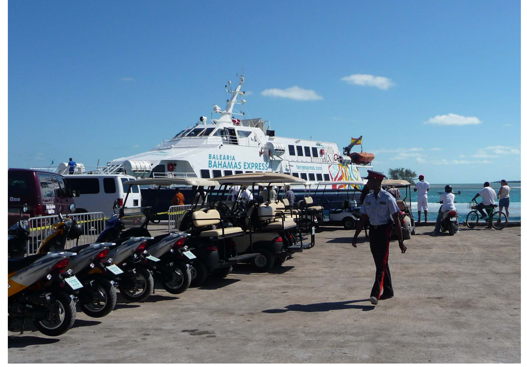
Here comes the ferry full of tourists who will stay at the exclusive Bimini Bay Resort on the north end of the island.