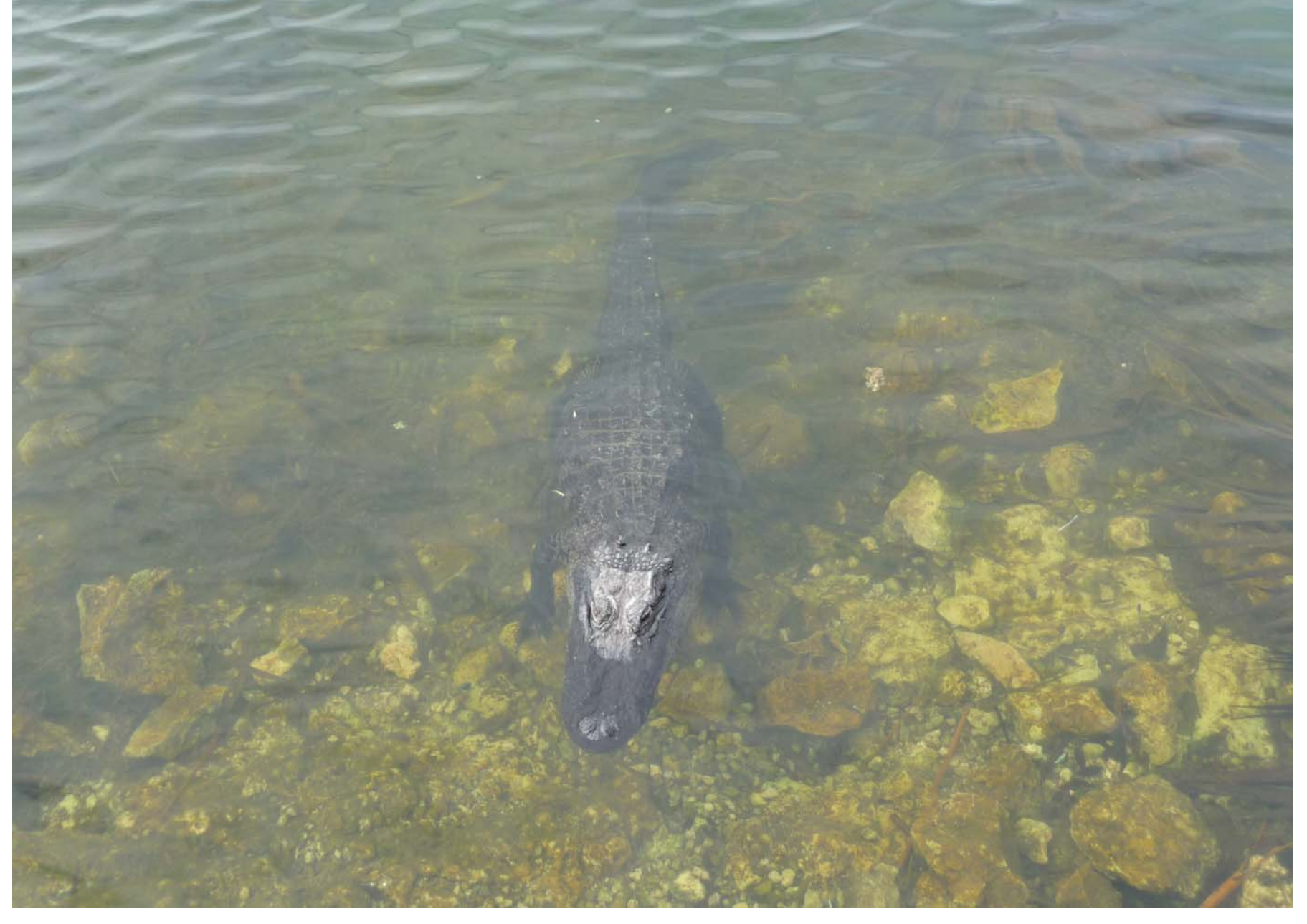
Here's the alligator. It didn't move a muscle and must've been waiting for a handout.