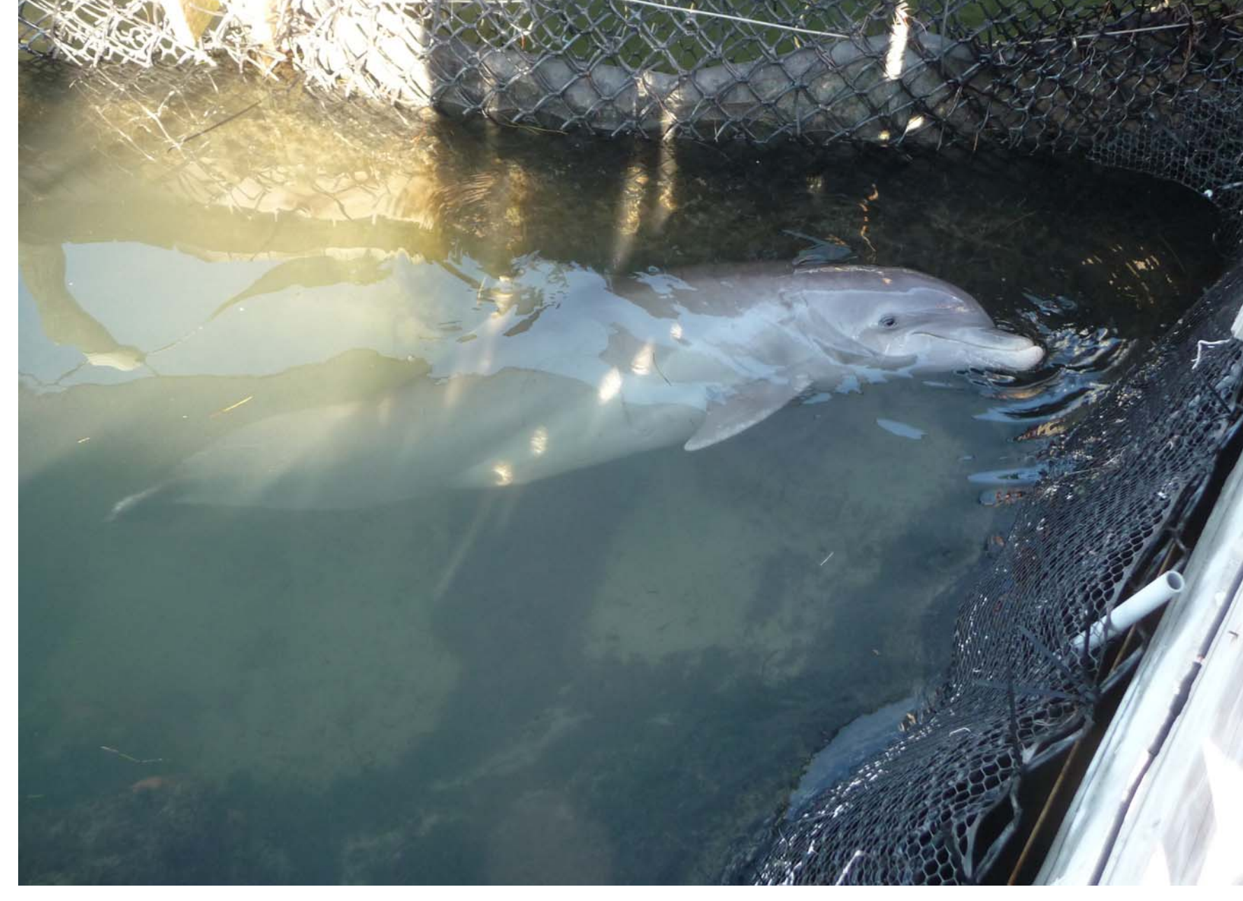
Jocko the dolphin is at the Center because he was injured by a shark. Here he is "people watching" as we watch him.