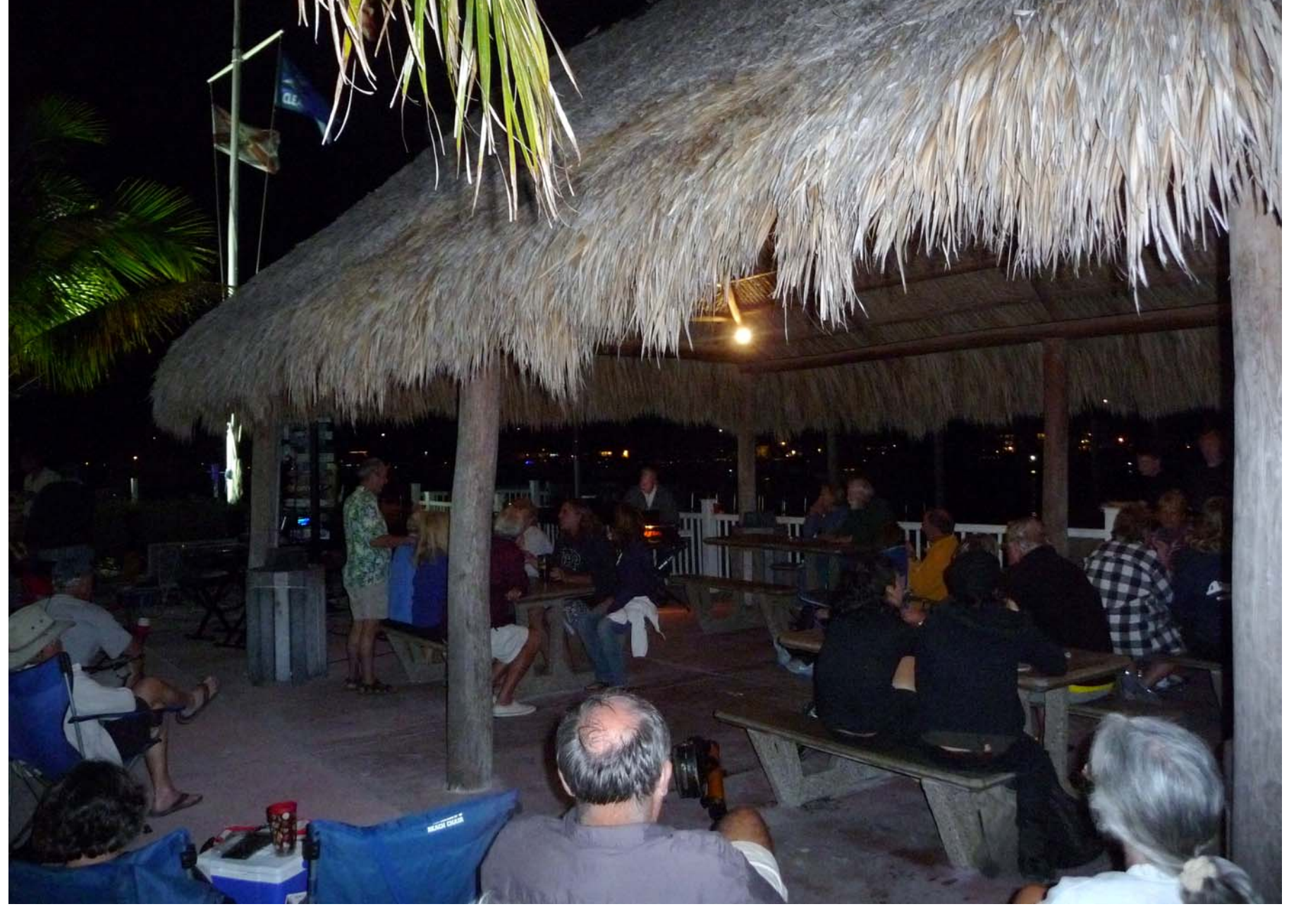
Saturday night jam session with some talented musicians/singers at the marina's Tiki Hut.