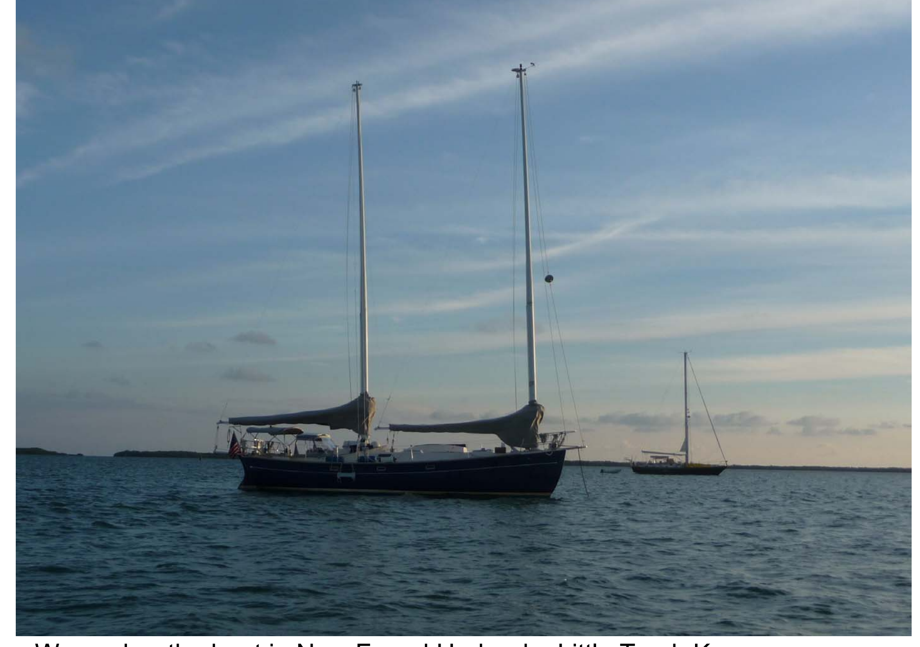
We anchor the boat in New Found Harbor by Little Torch Key on our way down to Key West.