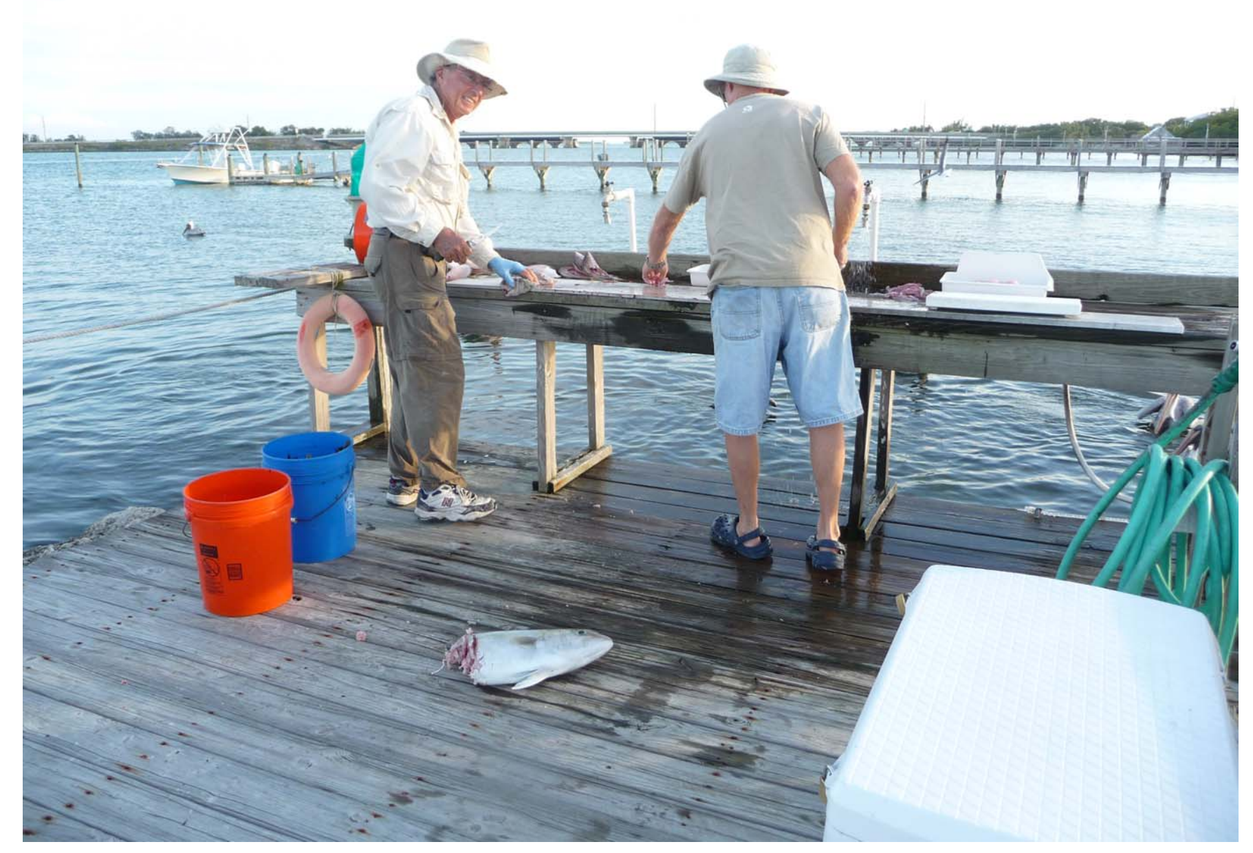
All that was left of this Amberjack was the head after a shark got the rest of the body before the guys could haul it into the boat.