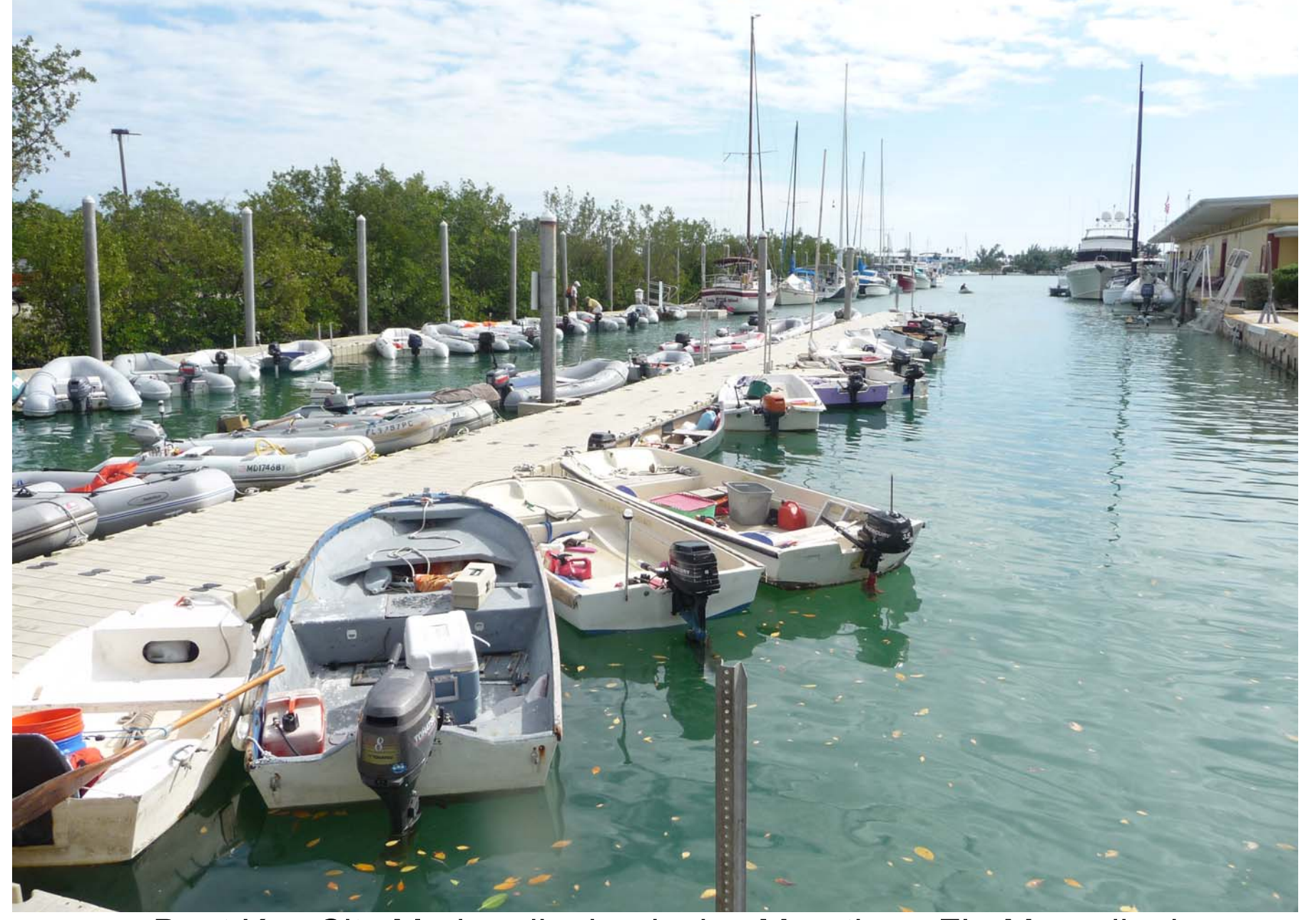
Boot Key City Marina dinghy docks, Marathon, FL. More dinghy docks further out. Over 220 moorings, so many dinghies!