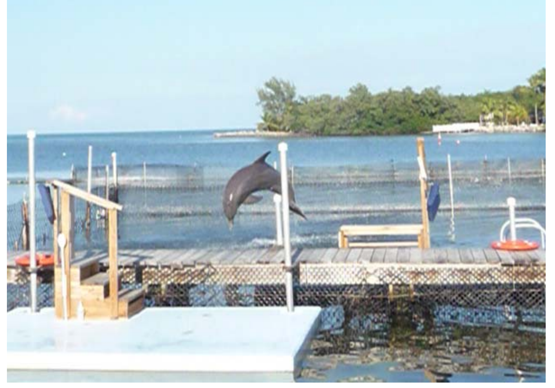
Feeding time at the male dolphin pen with them doing tricks along with being fed.