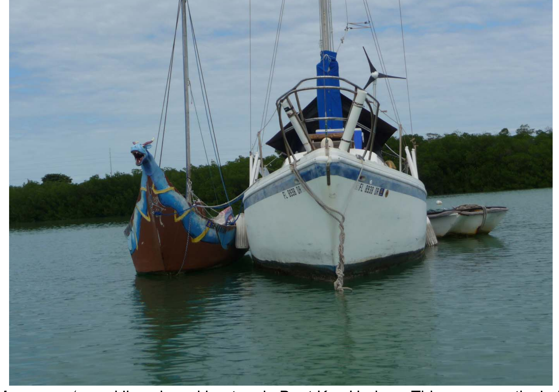
Many year 'round live aboard boaters in Boot Key Harbor. This was a particularl interesting couple of boats. Lots of barnacles and a very twisted anchor line.