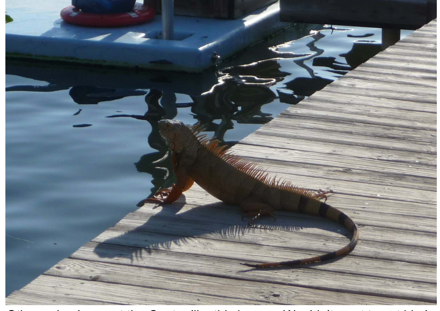
Other animals are at the Center like this iguana. Wouldn't want to pet him!