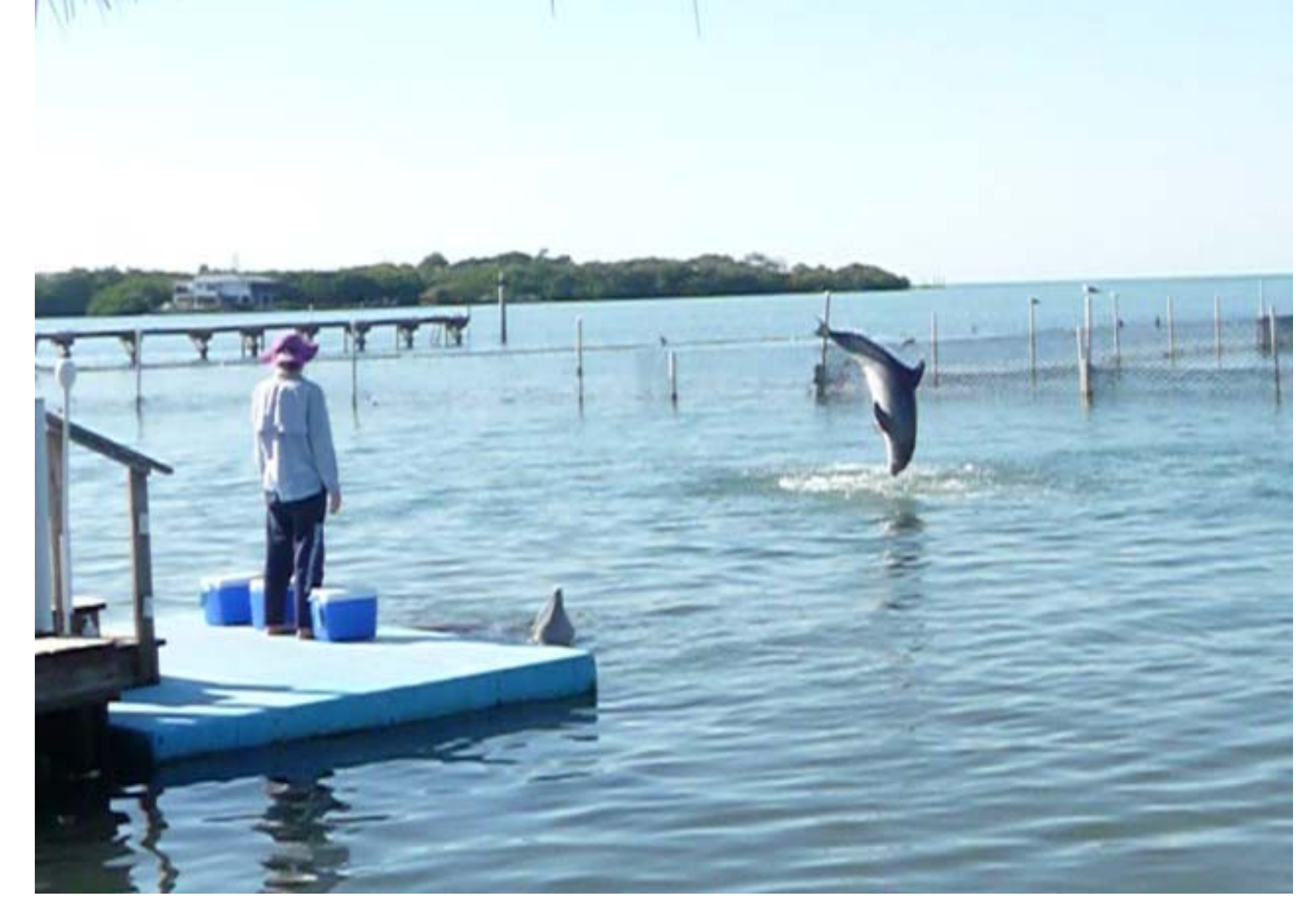
The dolphin show at the Research Center.