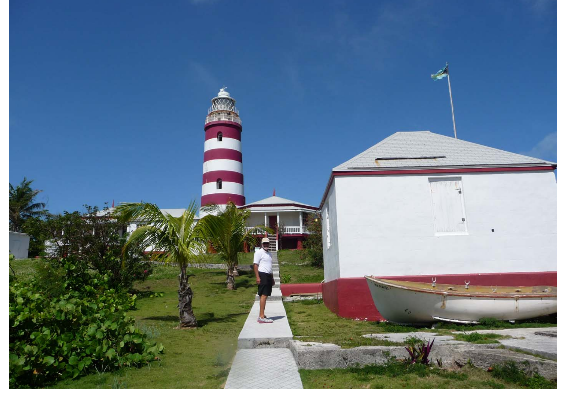
We tour the famous Hope Town Lighthouse.