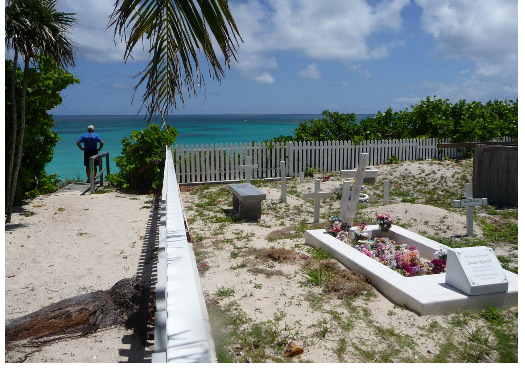
The historic cemetery overlooks the Atlantic with a beautiful beach below.