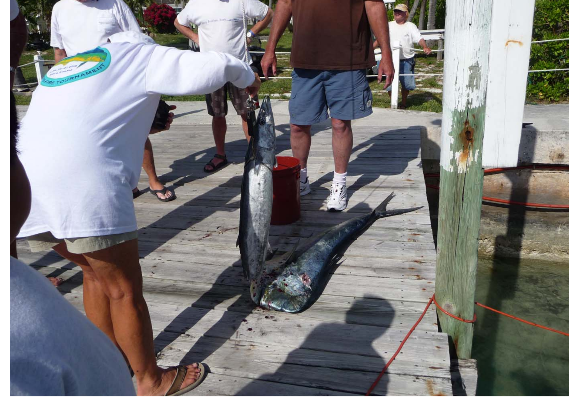
Fishing contest. Here they are weighing in their catch.