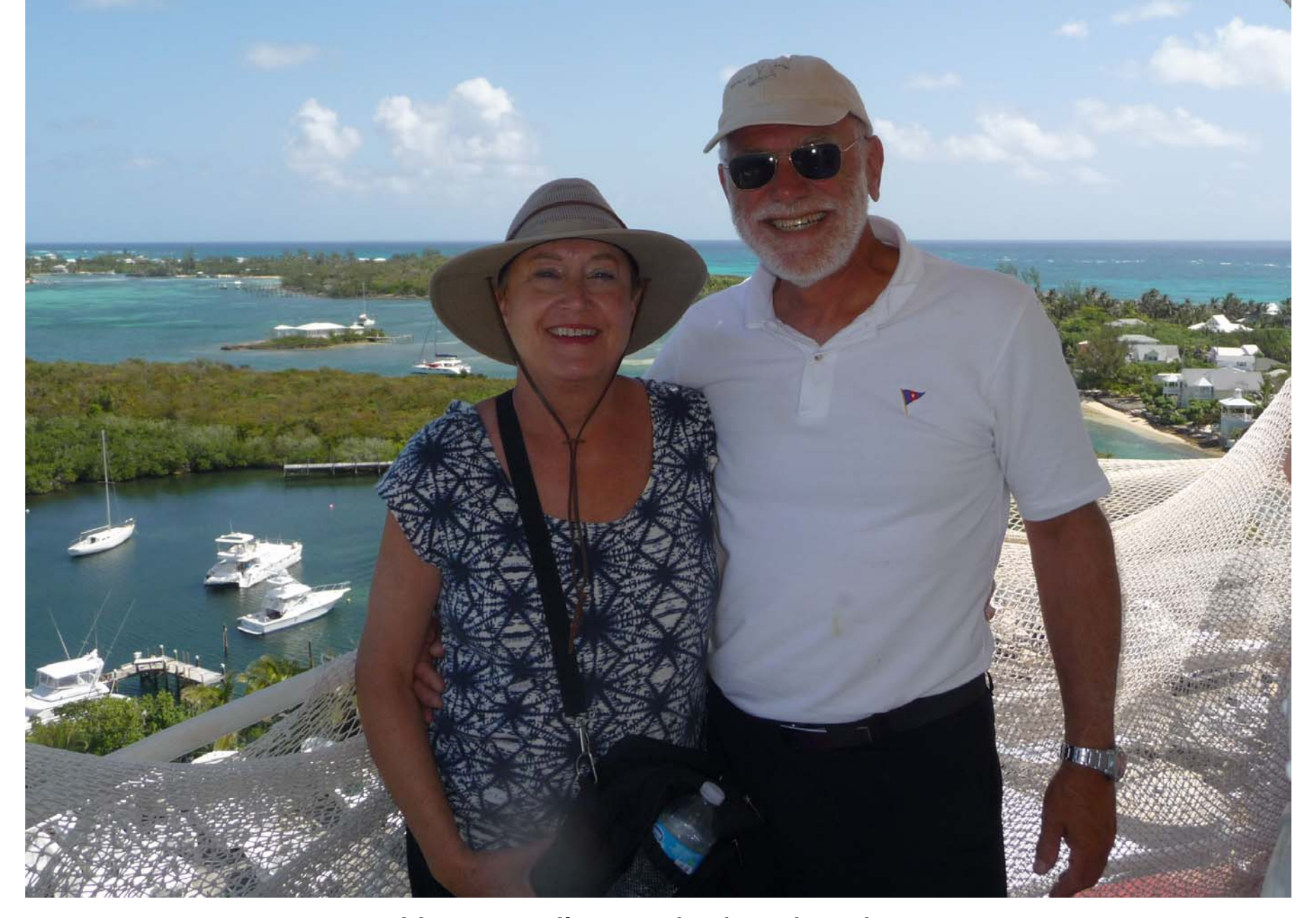
Happy sailors enjoying the view.