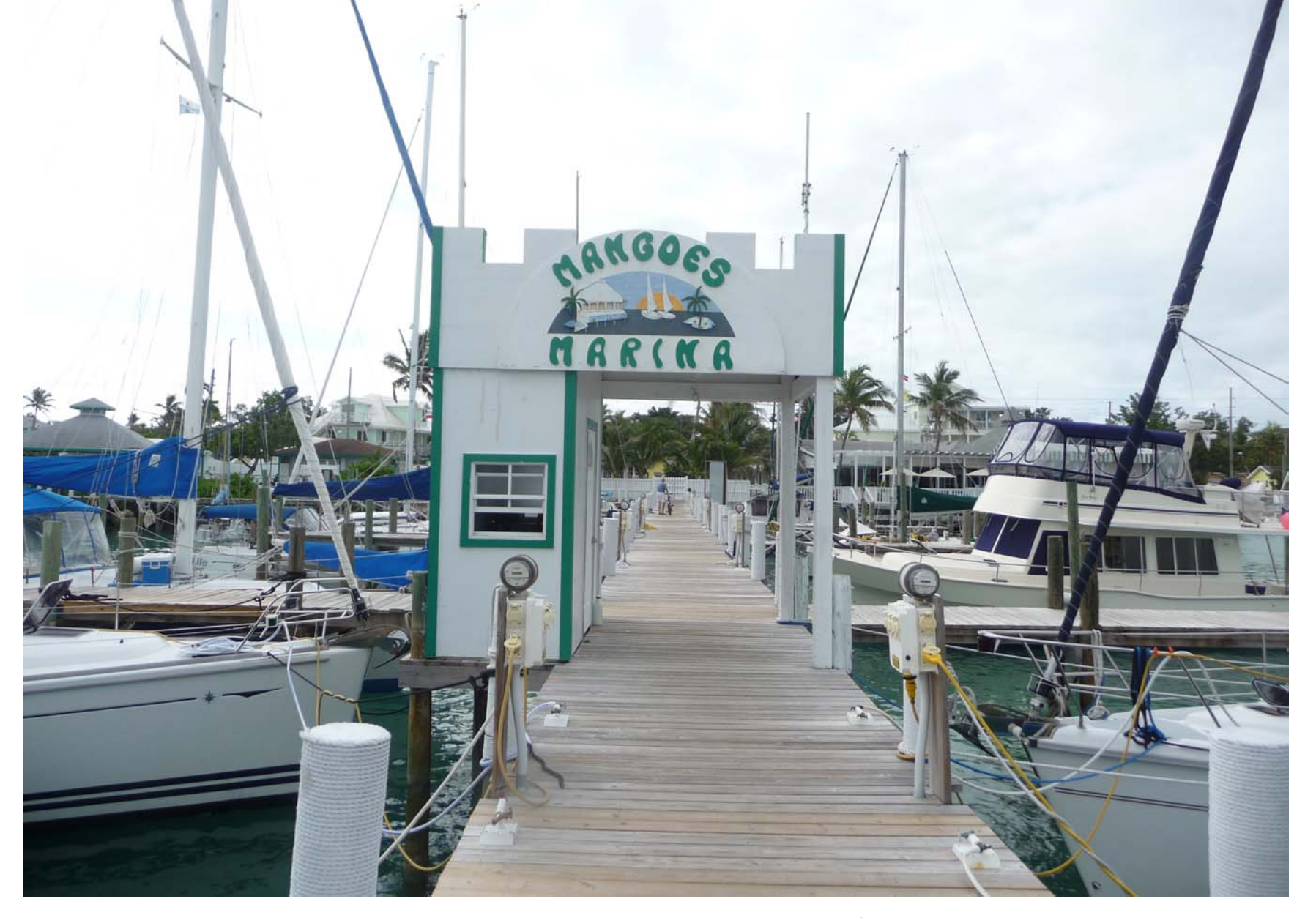
We stay at Mangoes Marina in Marsh Harbour for a week, April, 2013. We finally got our mail package after 11 days.