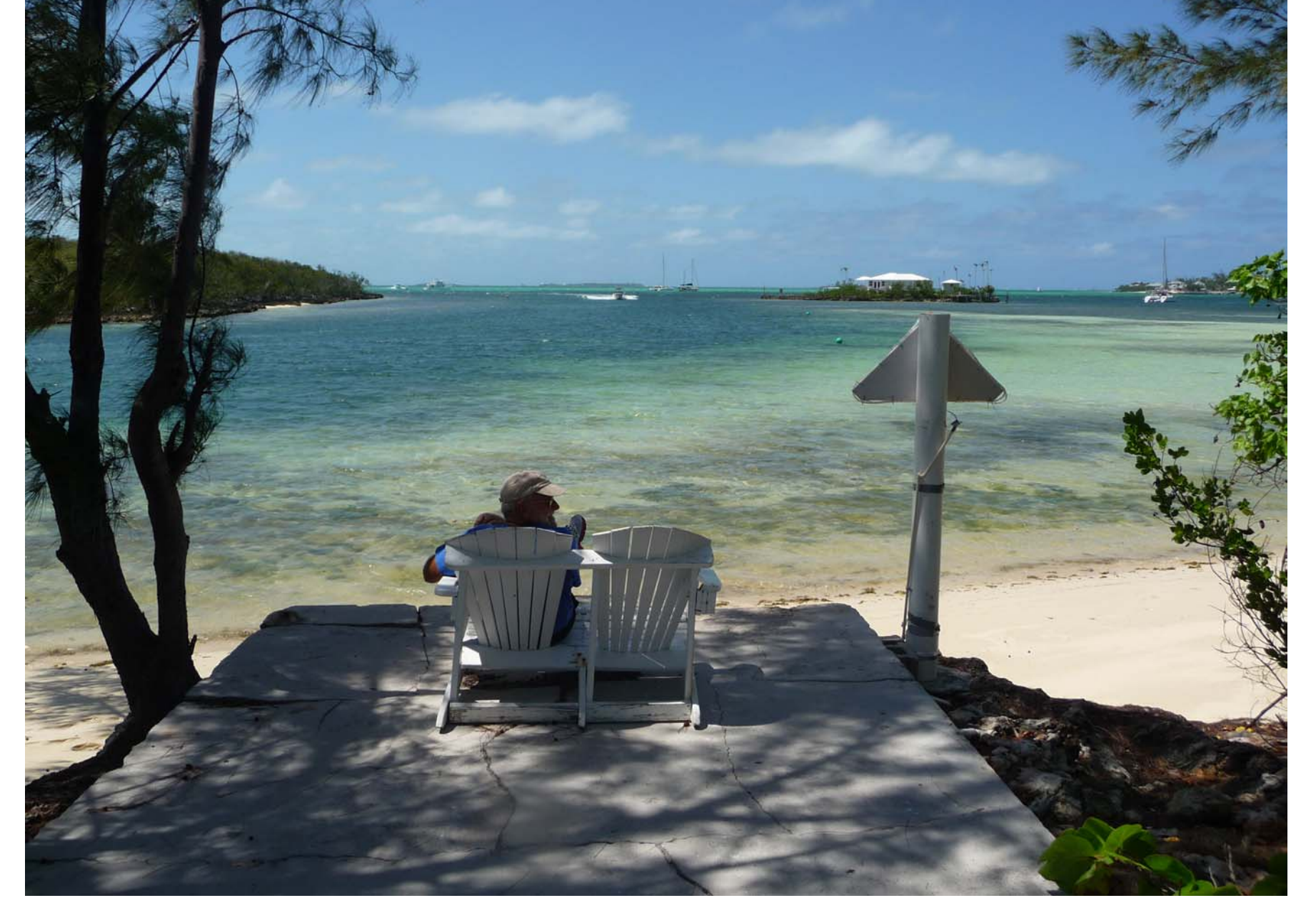
Carl watching the harbor entrance.