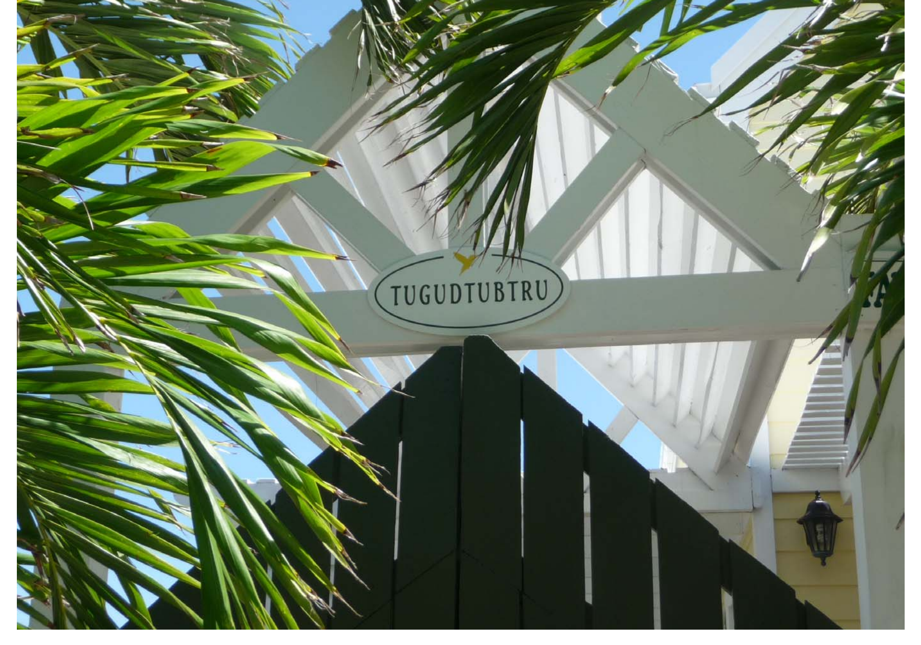
Sign on one of the colorful cottages in town.