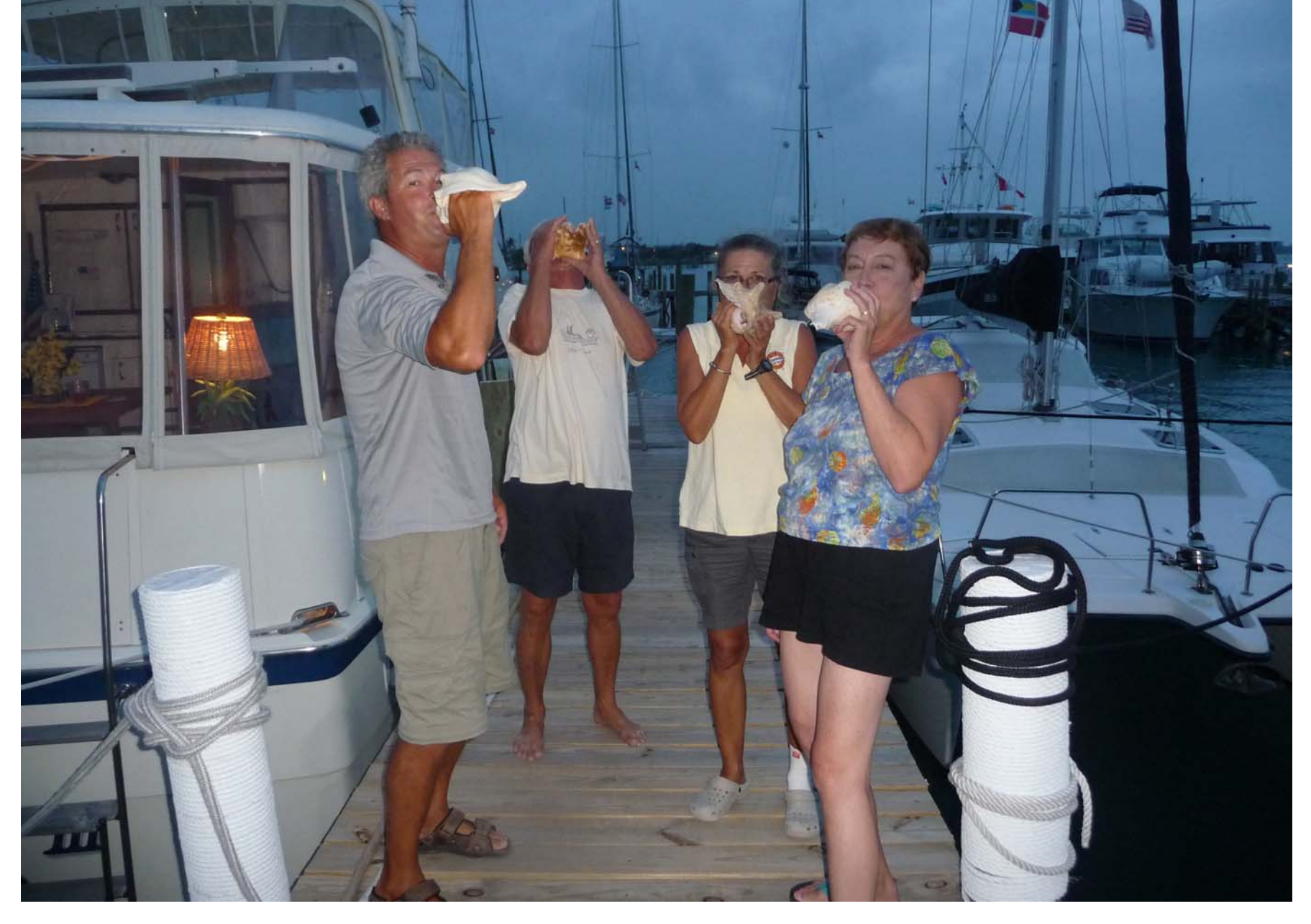
Every night at sunset we blew our conch horns at the end of the dock.