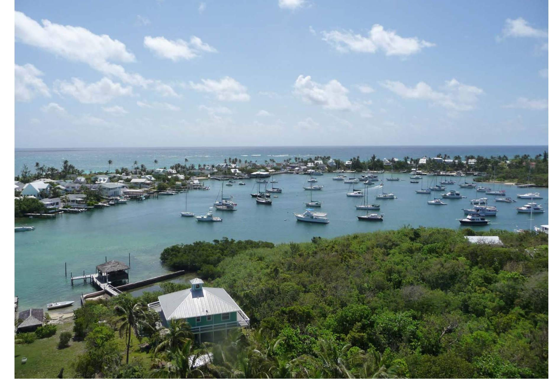
Beautiful Hope Town Harbour.