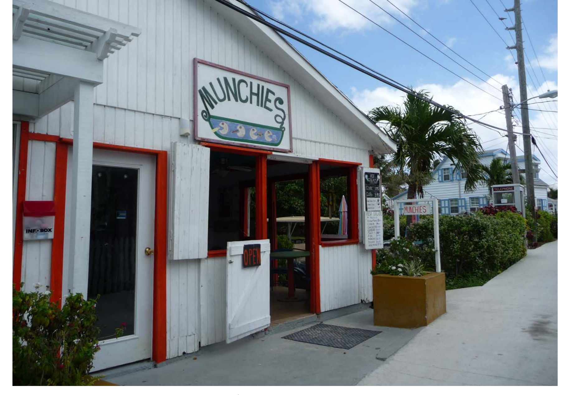
Lobster burgers for $6.50 at Munchies. Yum.