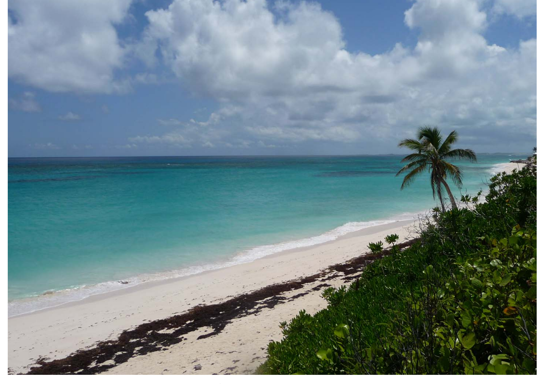
The beautiful beach at Hope Town.