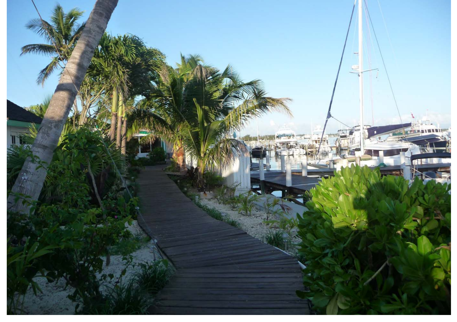
Lots of tropical plants at Mangoes Marina.