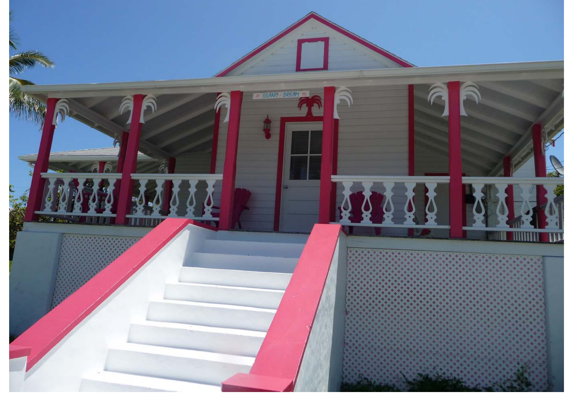
The pretty "Island Dream" house.