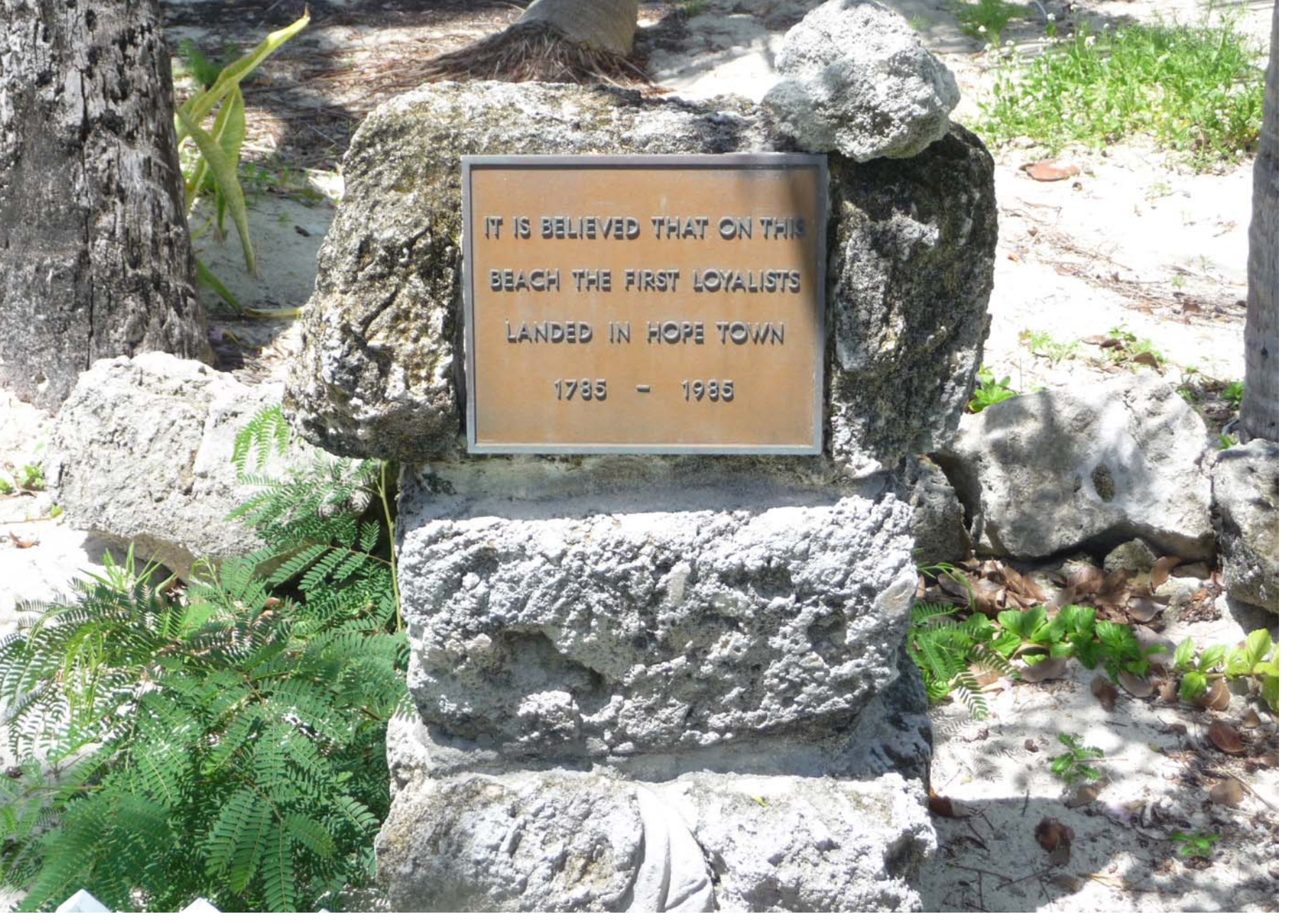
Hope Town, settled by Loyalists in 1785.