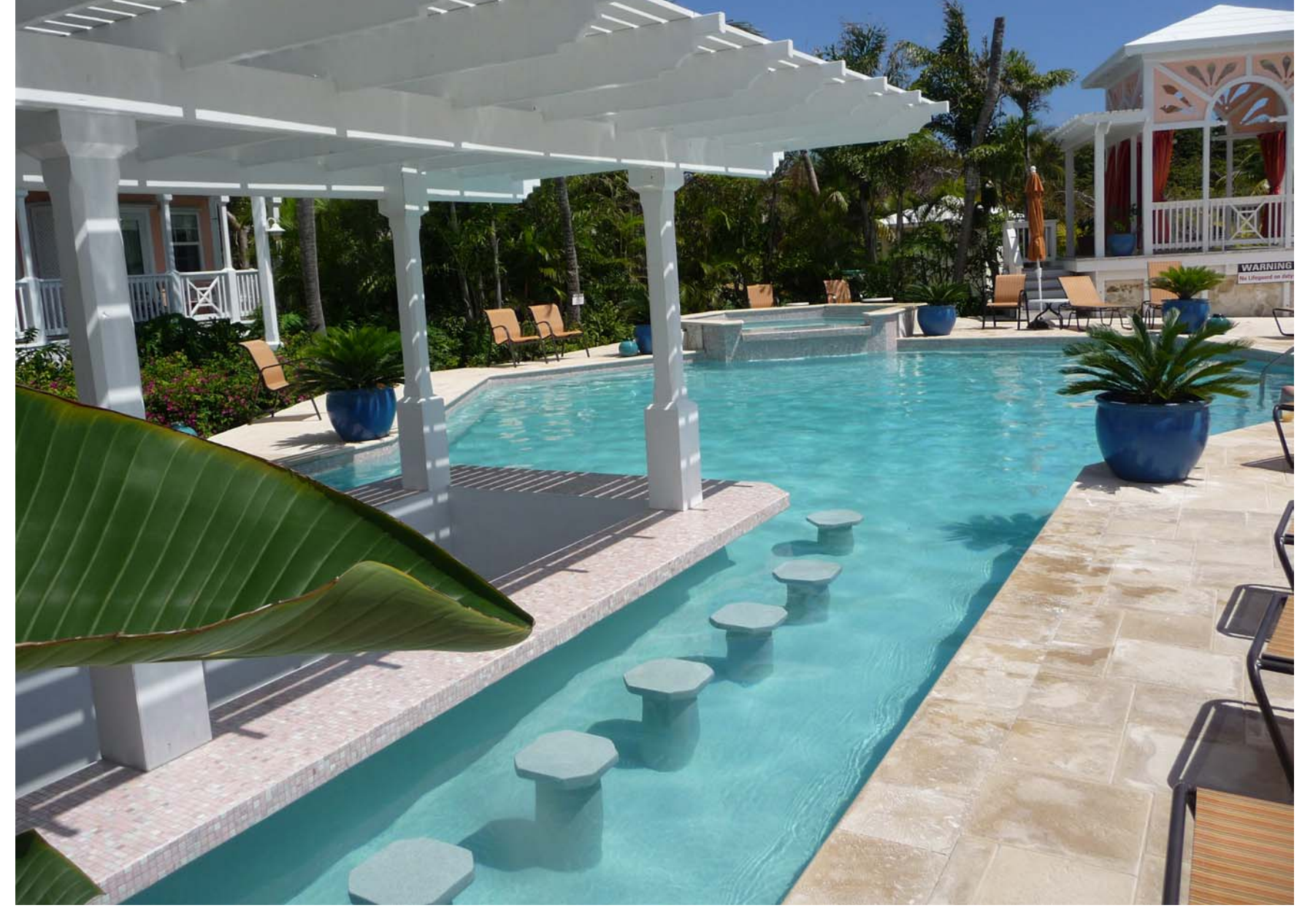
We take the dinghy over to the fancy and new Hope Town Inn & Marina and were impressed!