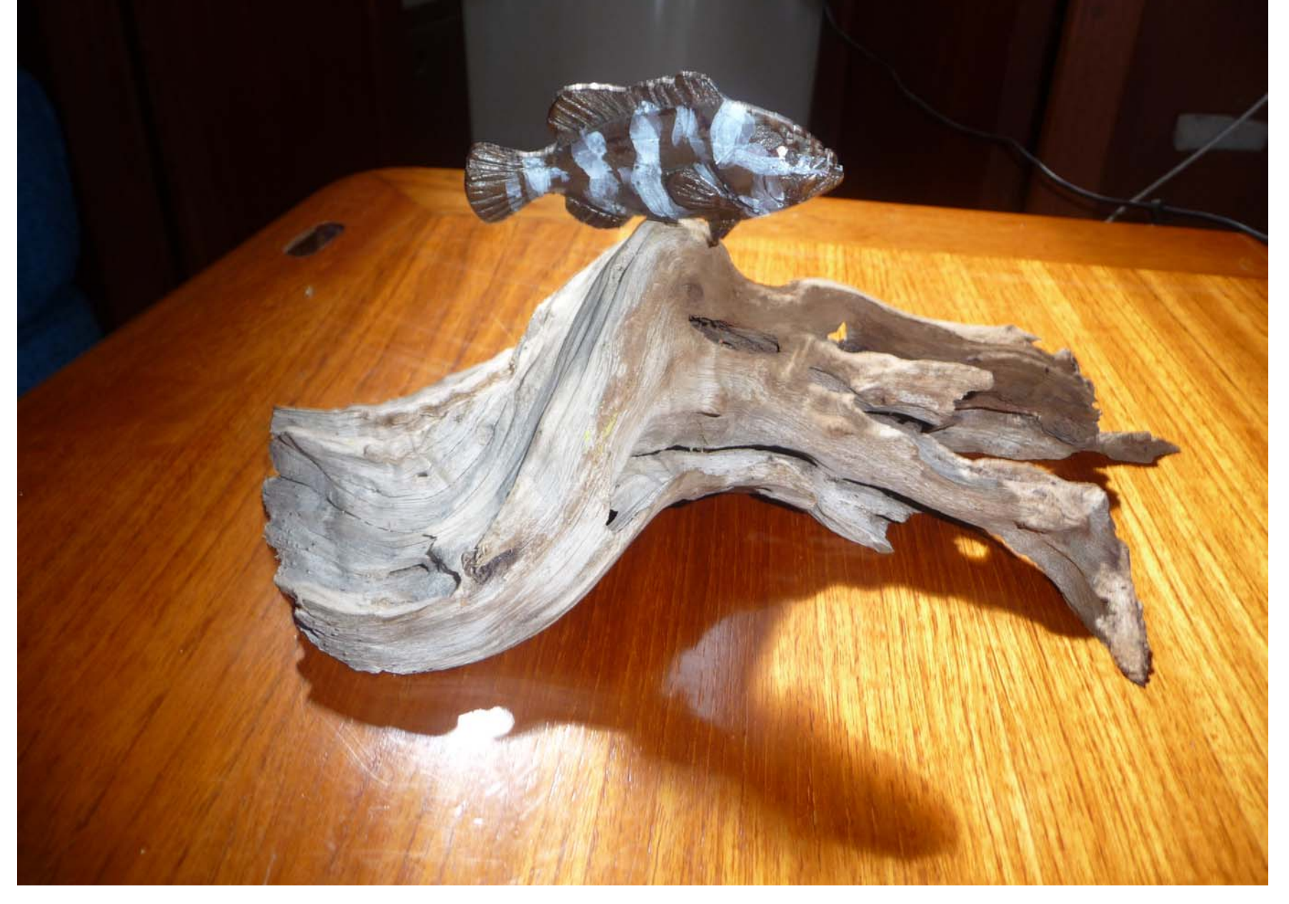
Bronze Nassau grouper sculpture from The Johnston Studio, Little Harbour, Abaco.