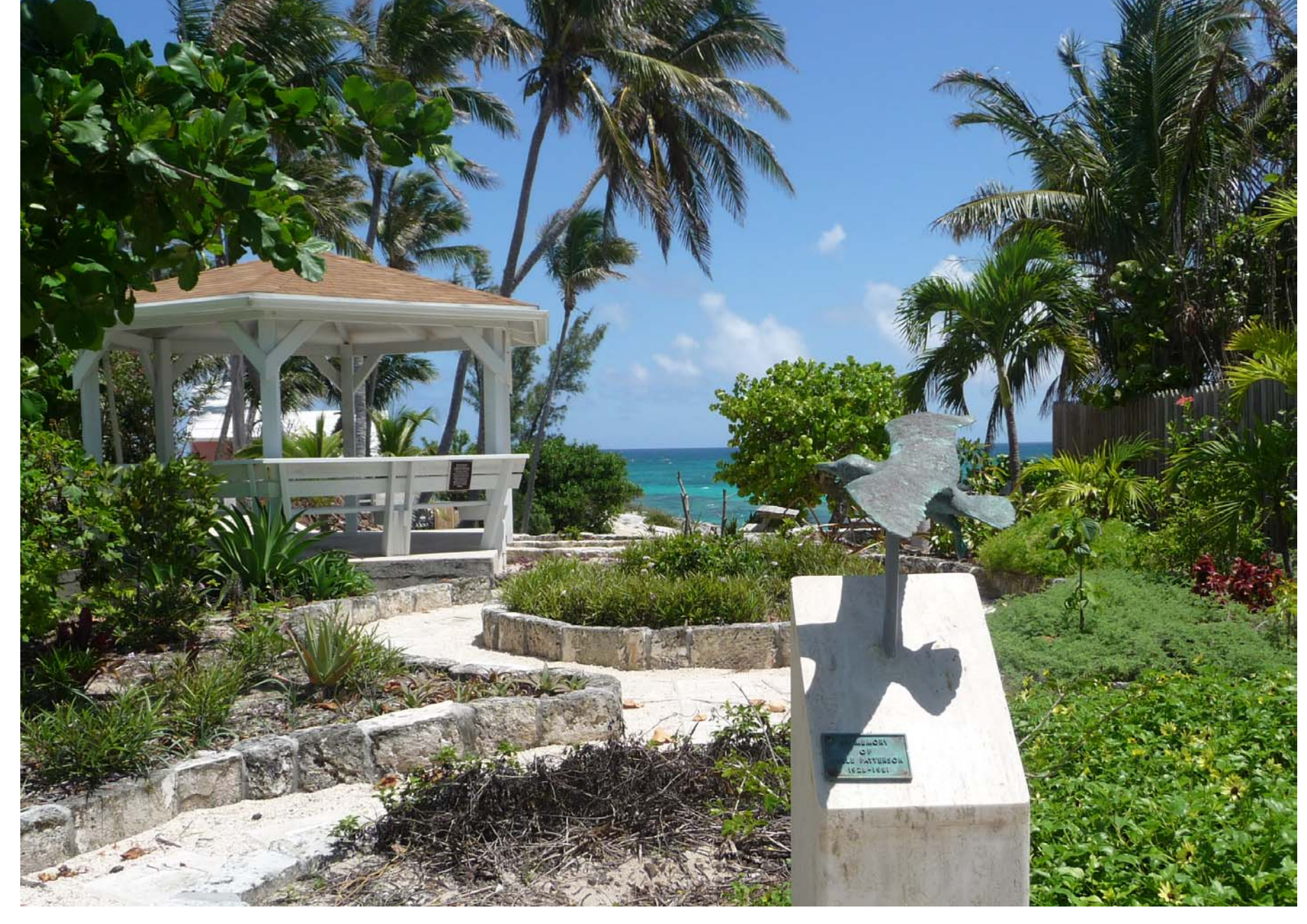
A memorial garden overlooking the Atlantic.