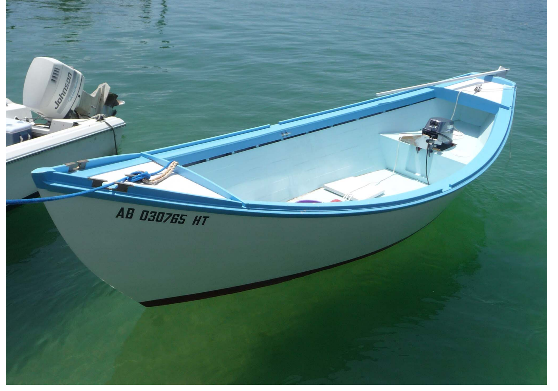
A pretty dory skiff in Hope Town.