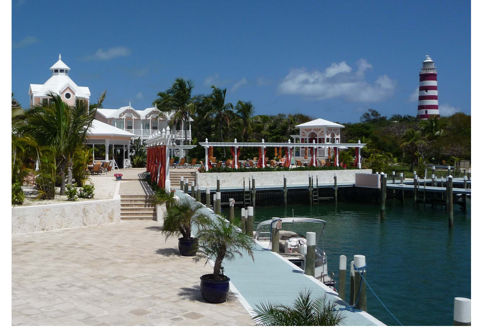
Hope Town Inn & Marina.