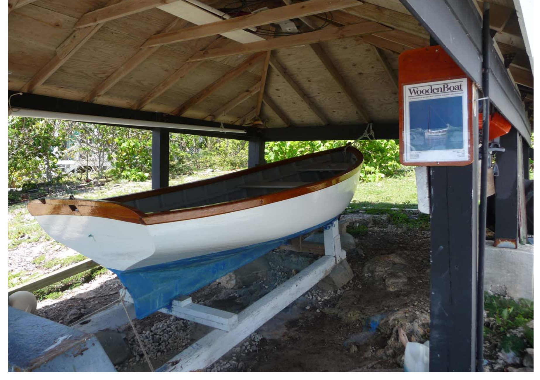
A beautiful dory featured in Wooden Boat Magazine.