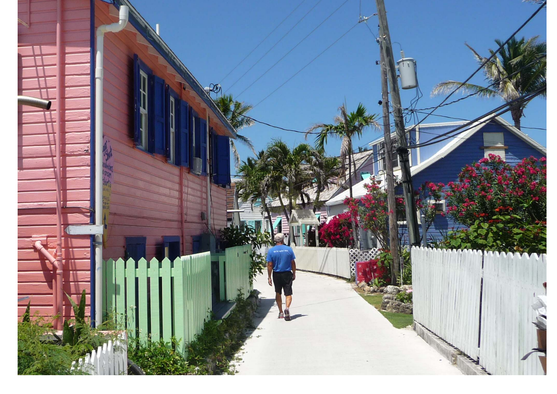
One of the two roads. Colorful houses are everywhere.