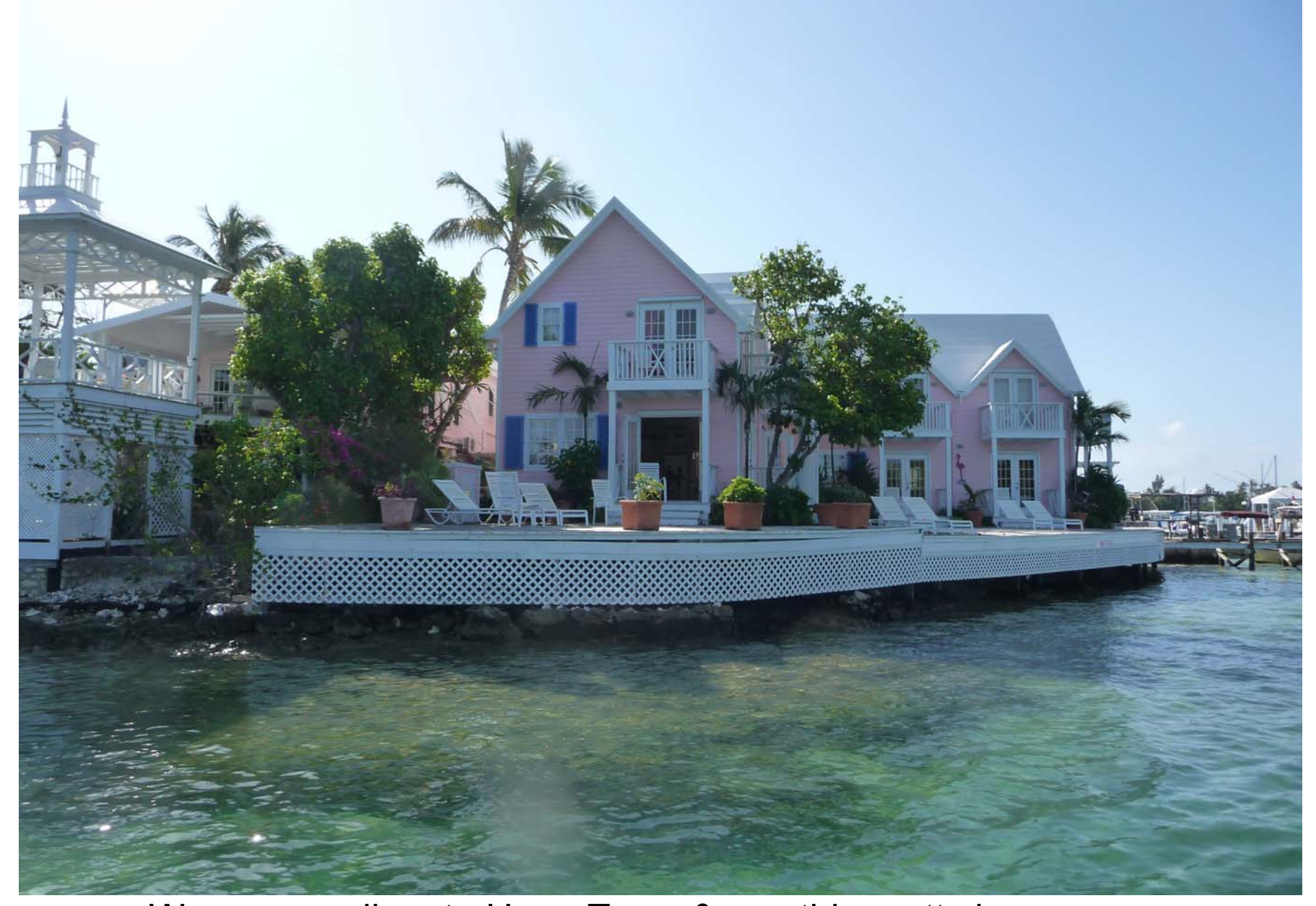
We say goodbye to Hope Town & see this pretty house as we leave the harbor.