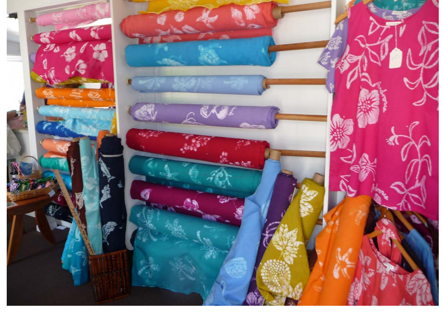
The wonderfully colorful Androsia batik fabric for sale at a shop in Man-O-War. They are printed on Andros Island.