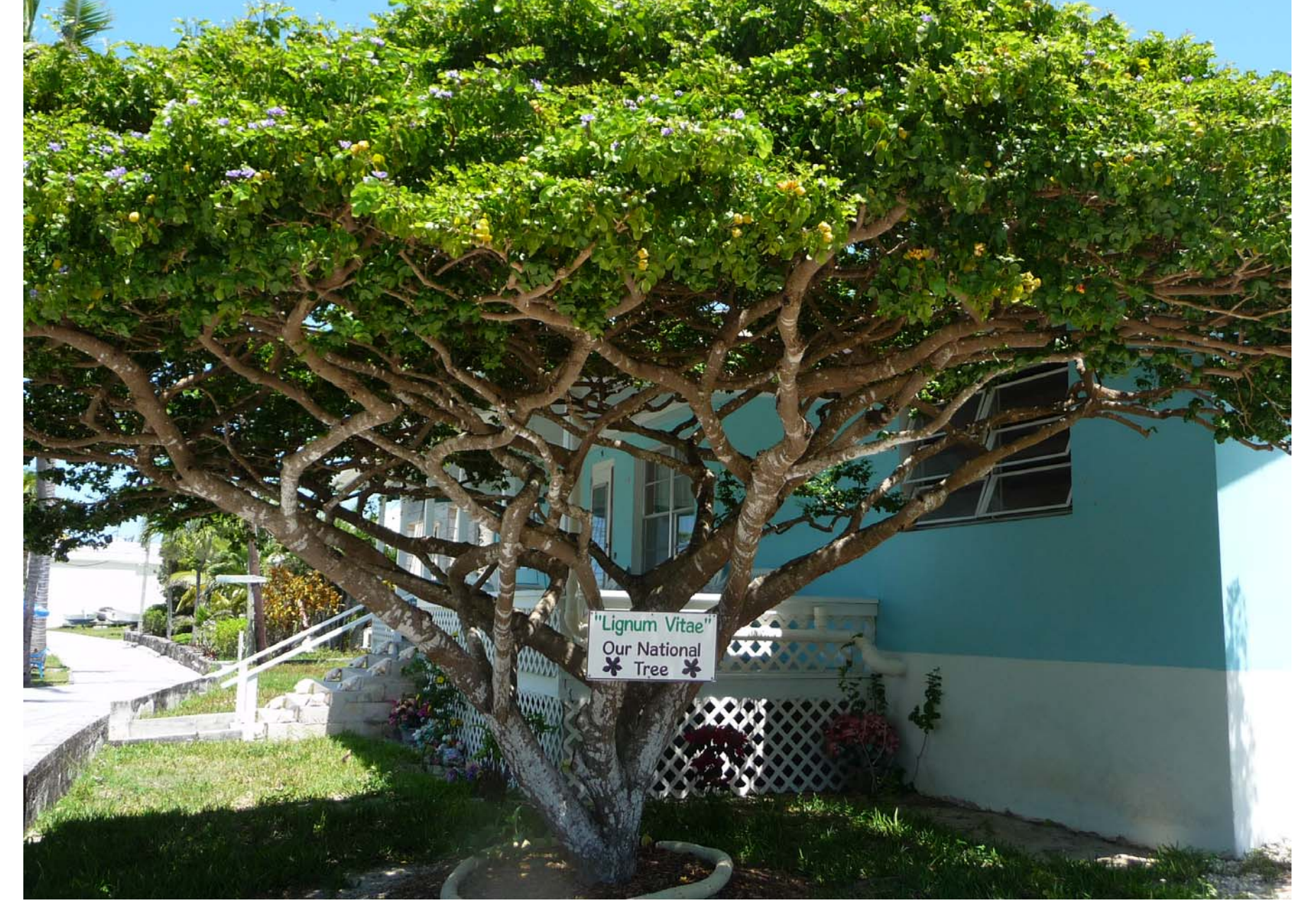
The national tree, the Lignum Vitae.