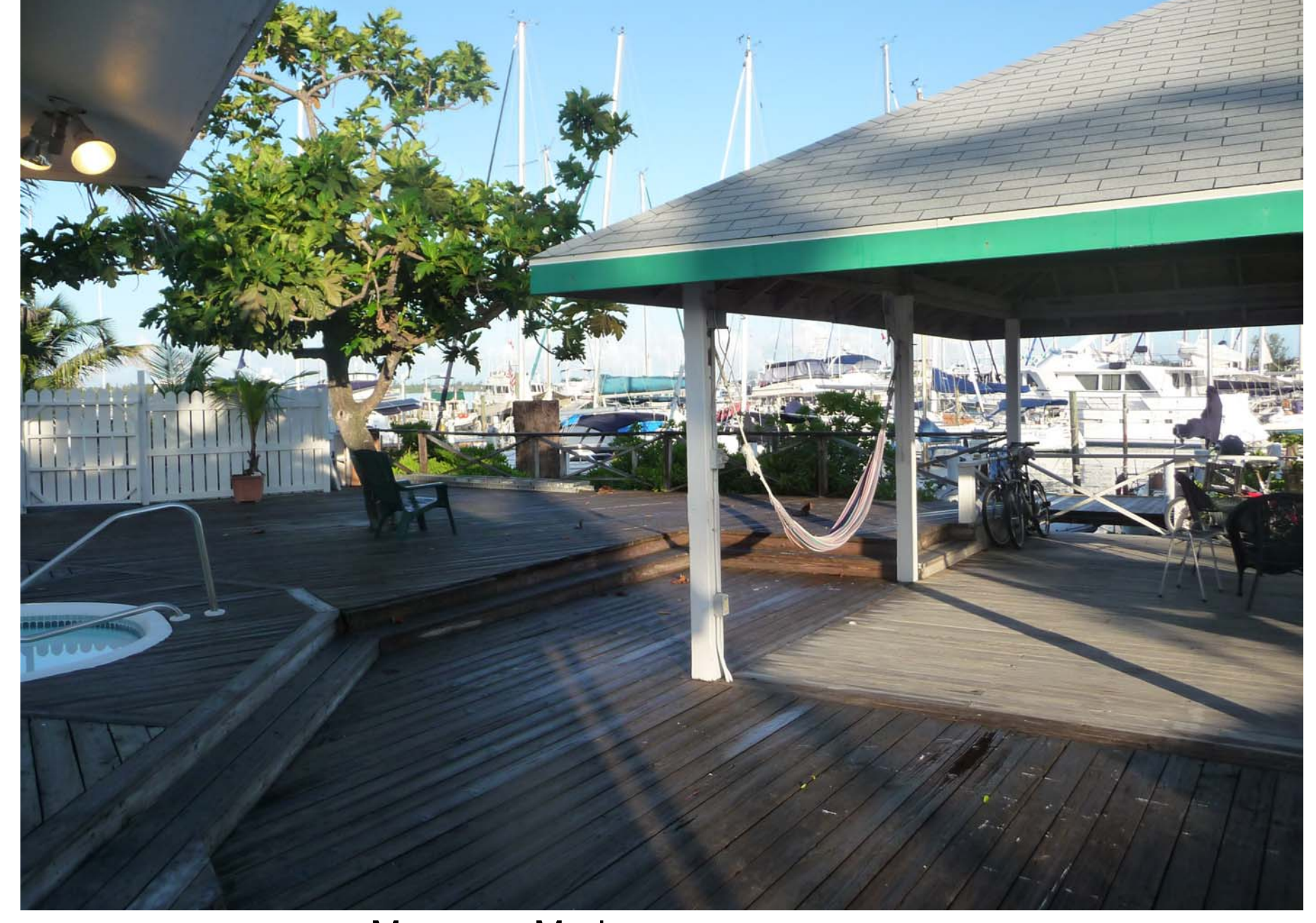
Mangoes Marina scene.