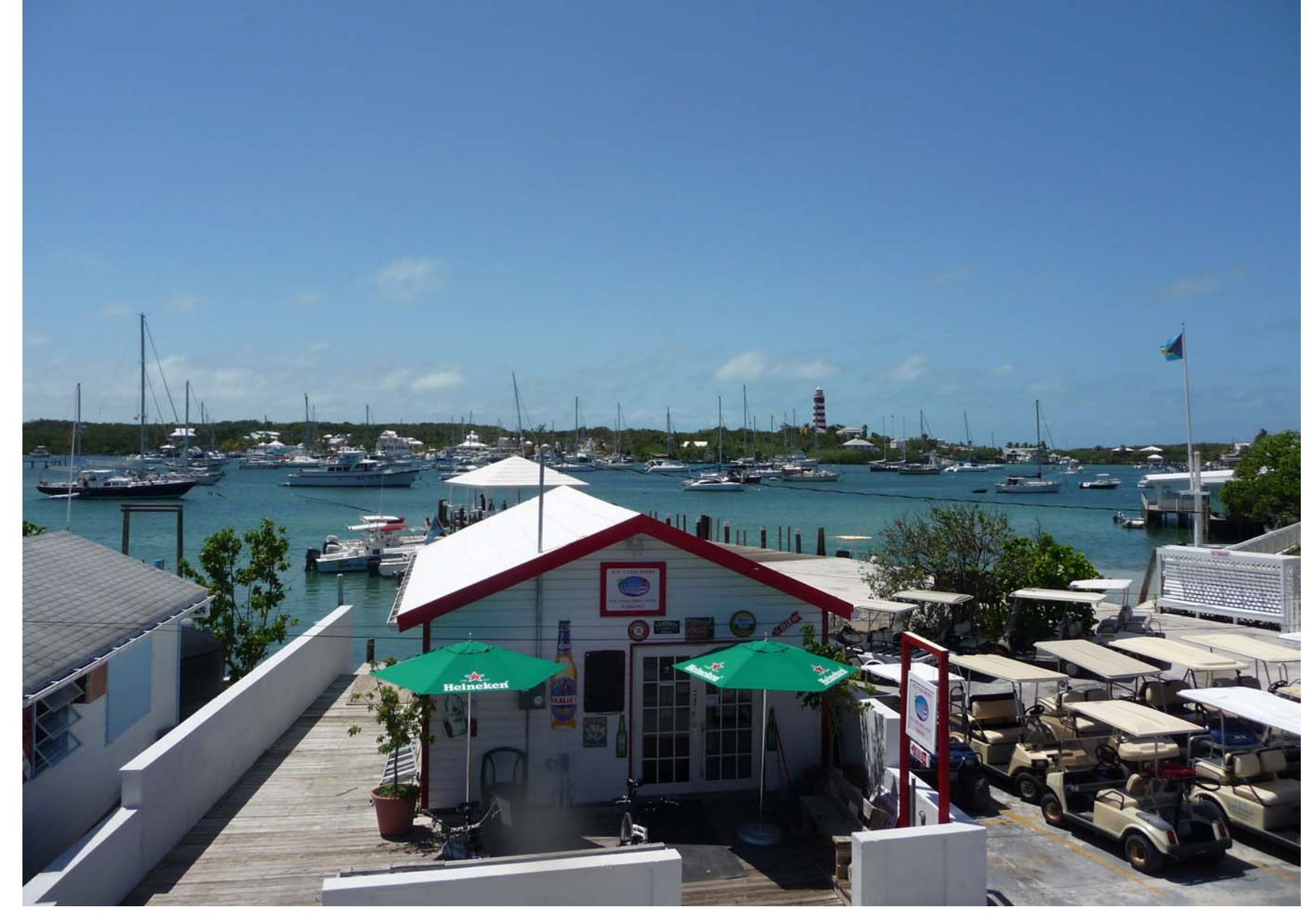
The liquor store in Hope Town has a great wine selection. Mostly golf carts are driven on the island.