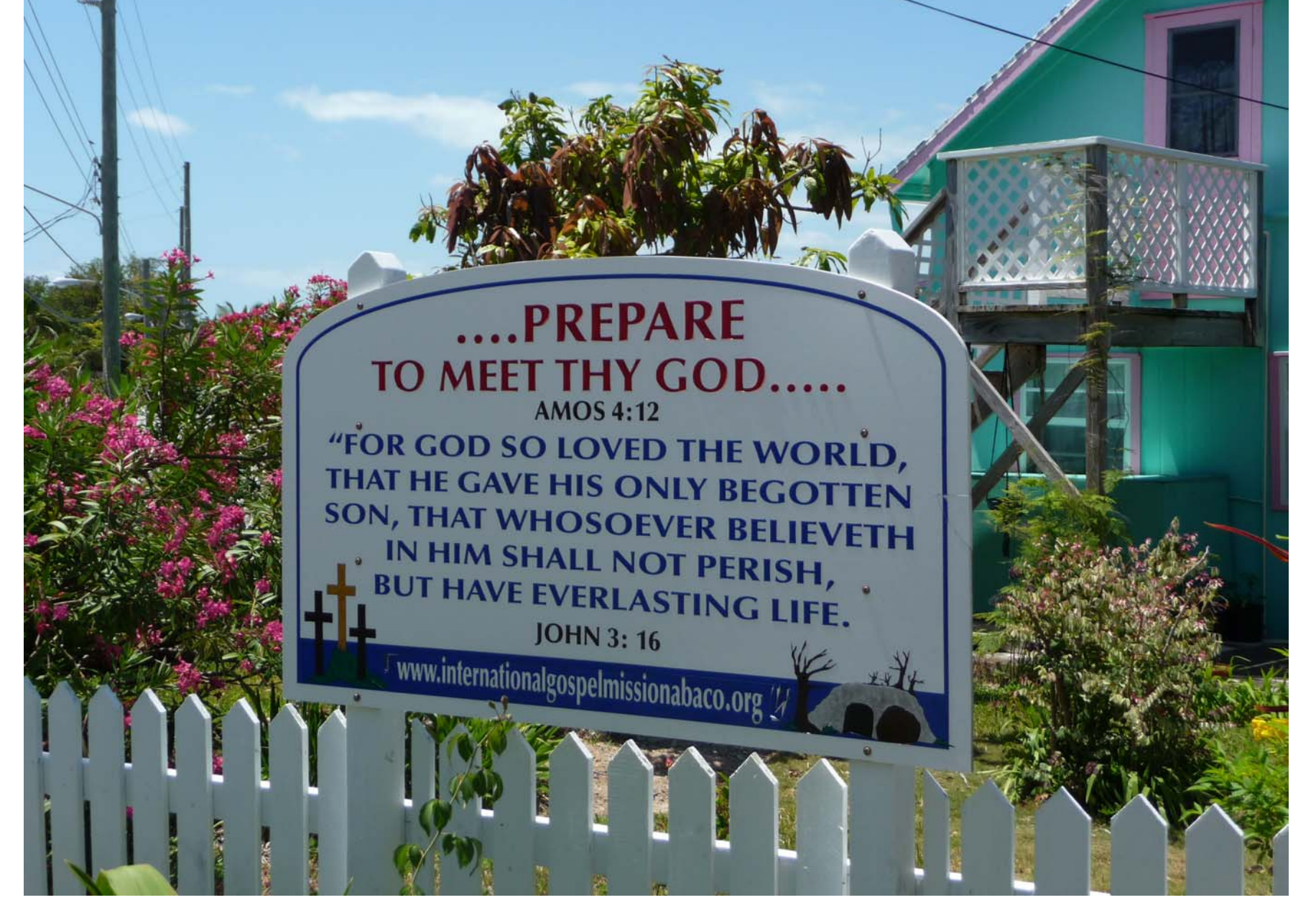
Every Abaco island has Bible verse signs like this.