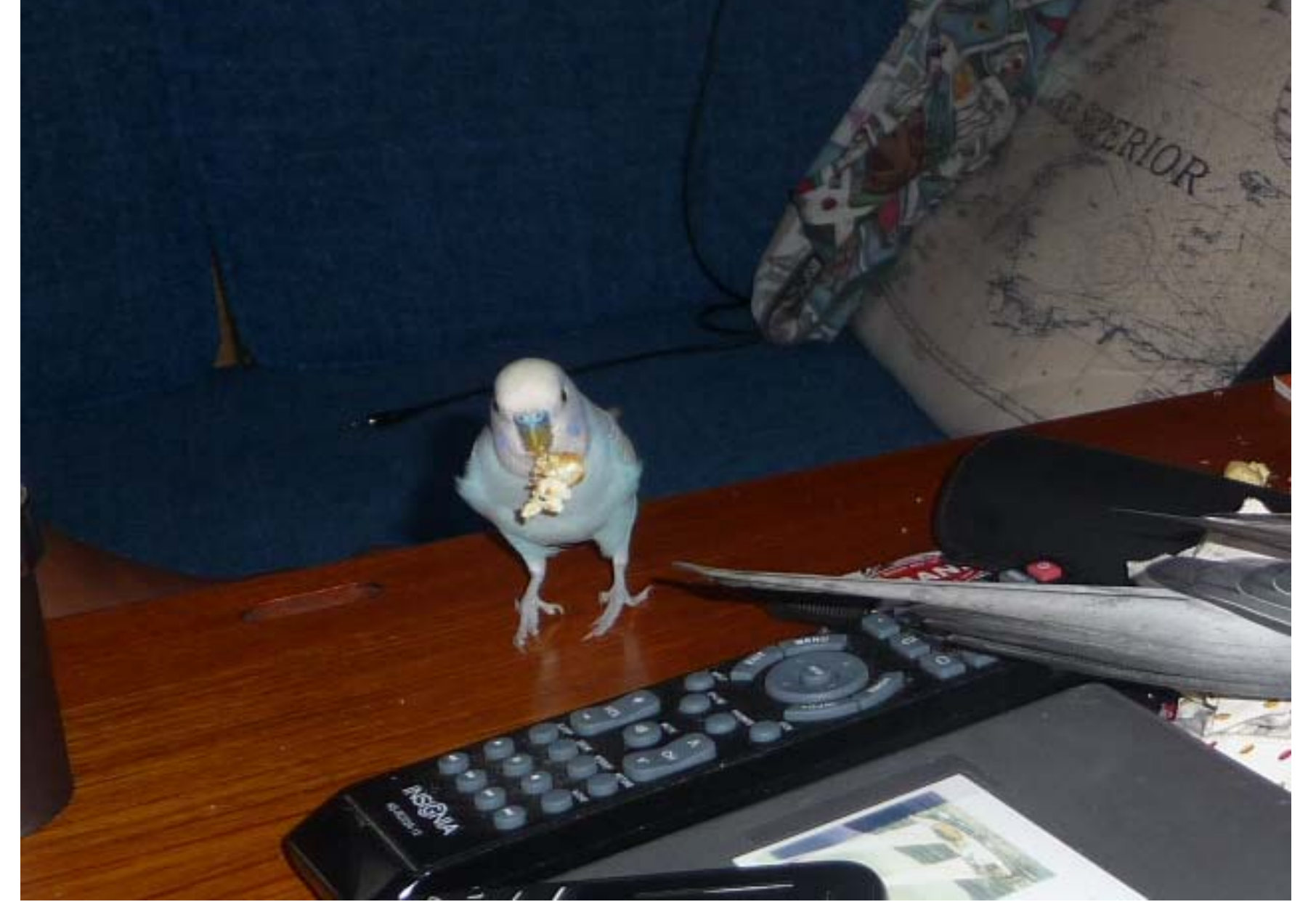
Our little Pepper the parakeet snacks on some popcorn. He's the bird that flew out of our boat in the Exumas and we got him back—sheer luck.