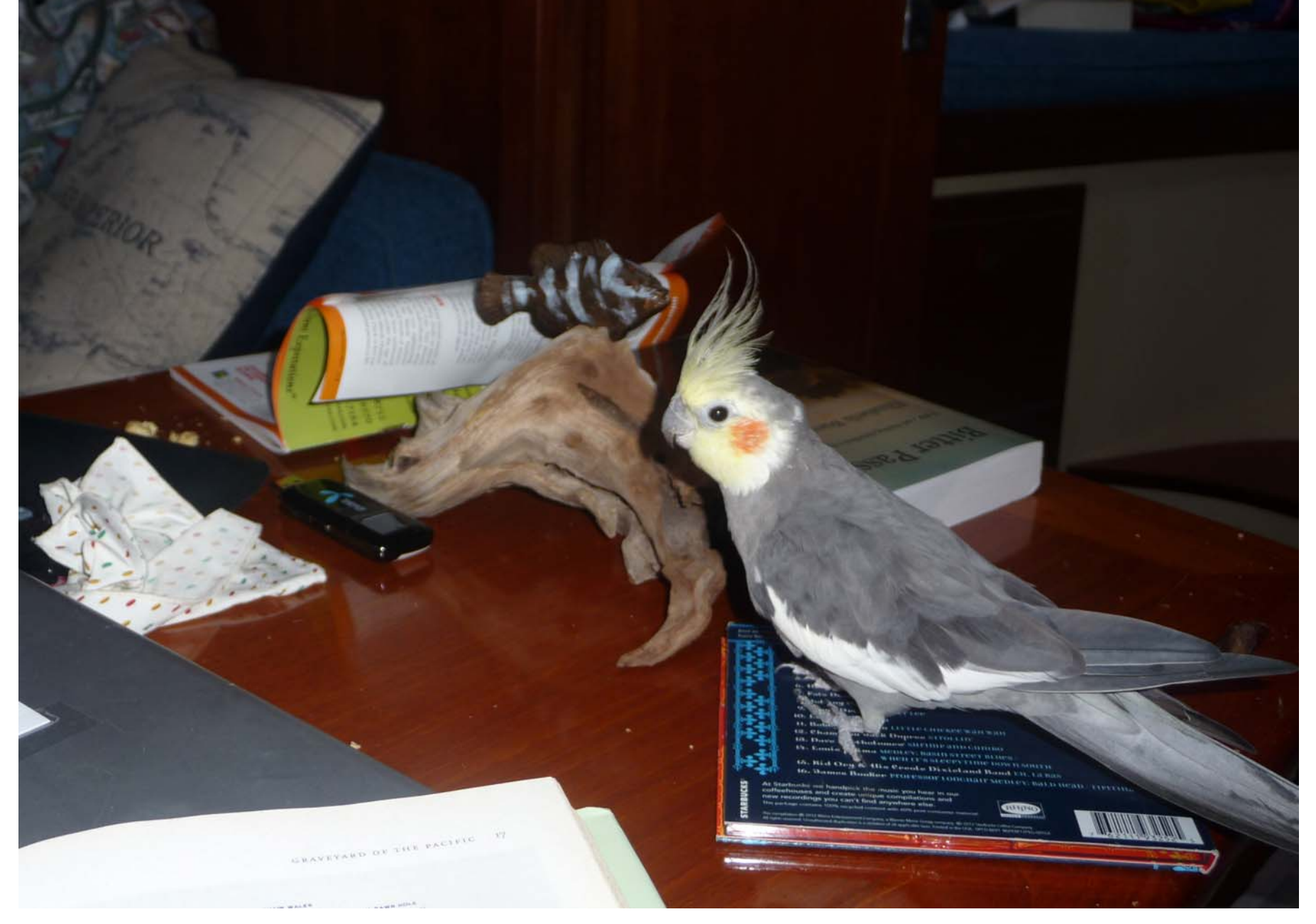
Quinn the cockatiel gets gutsy and explores the table.