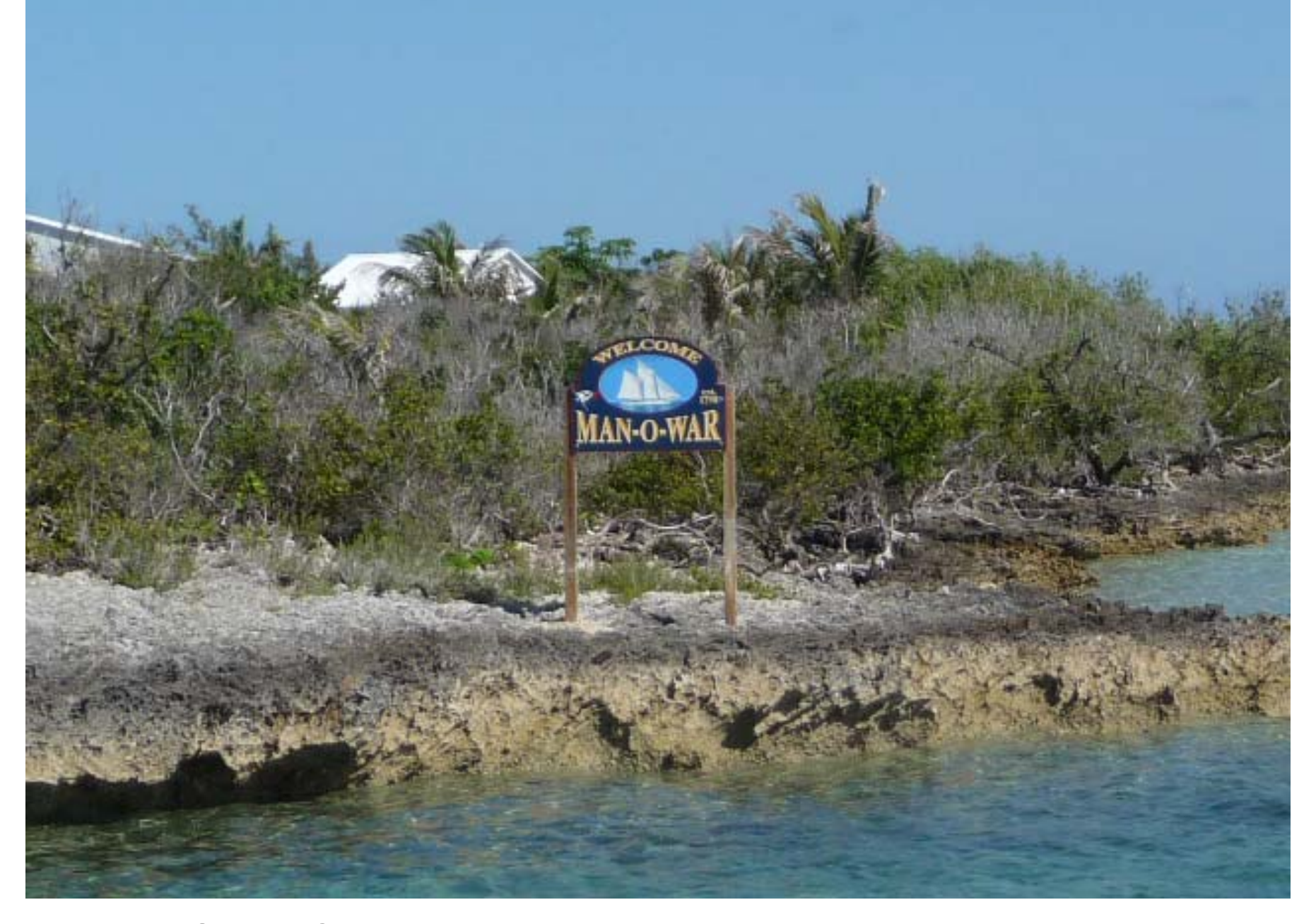
Man-O-War Cay entrance. Another Loyalist town. No booze here!