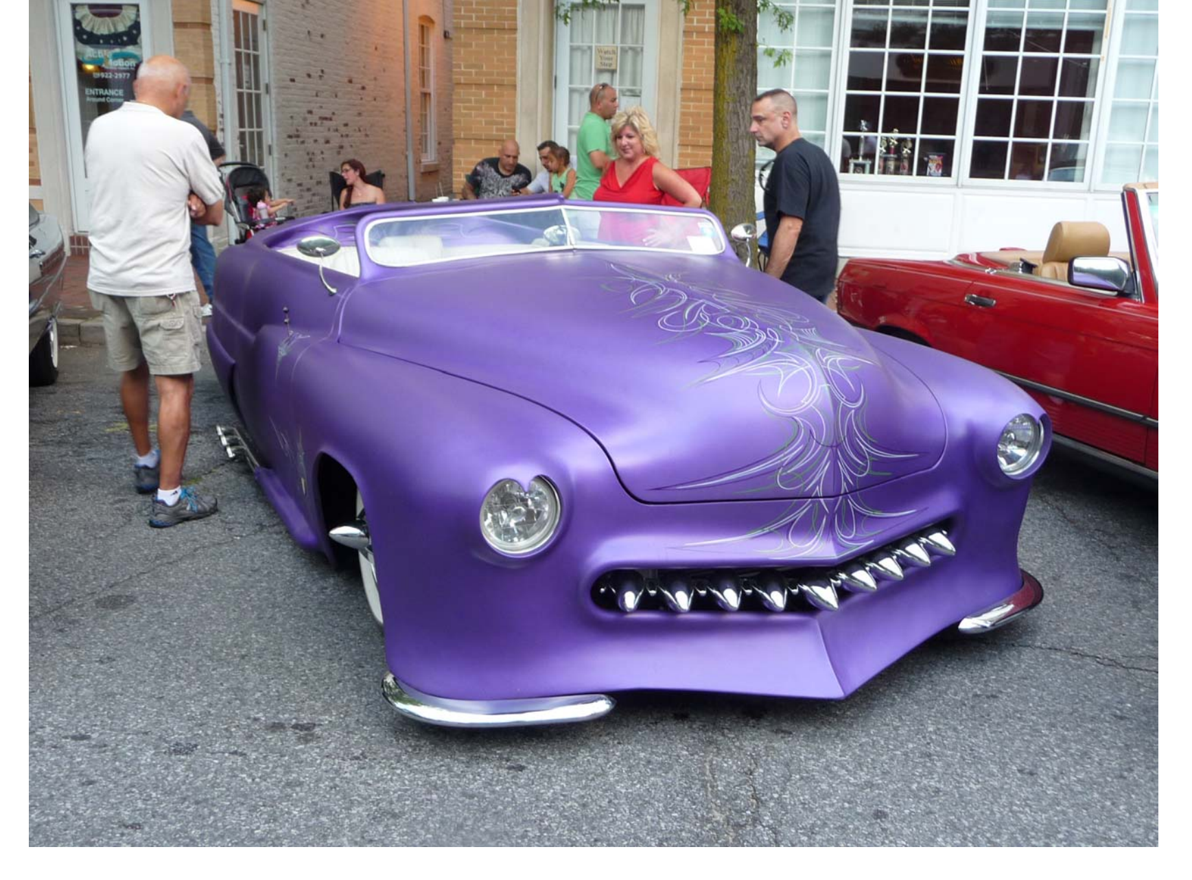
Custom car. They could raise & lower it. An eye catcher for sure.