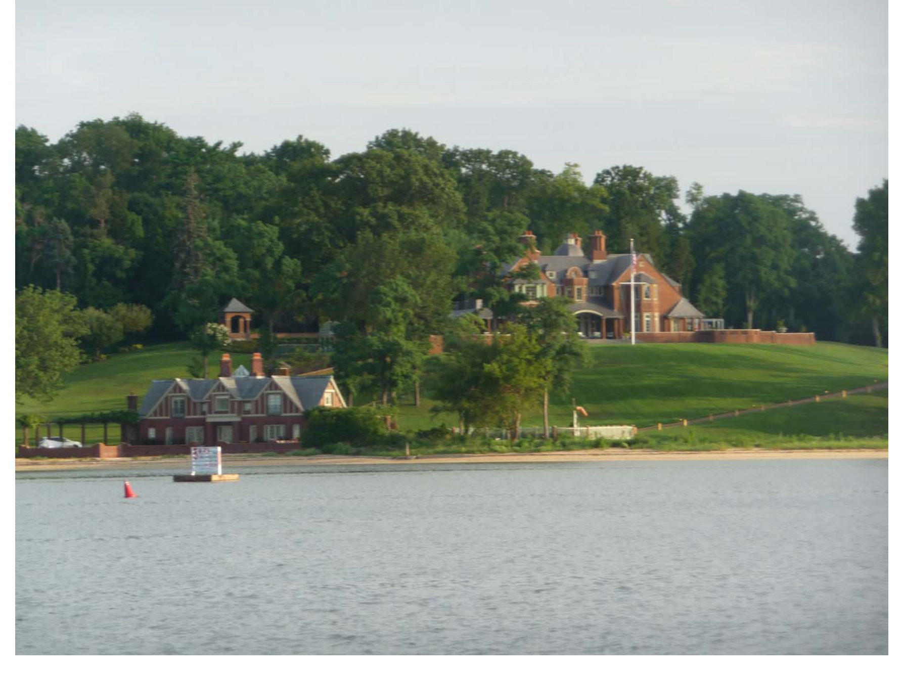
This is Billy Joel's mansion & 10,000 sq.ft. beach house in Oyster Bay.