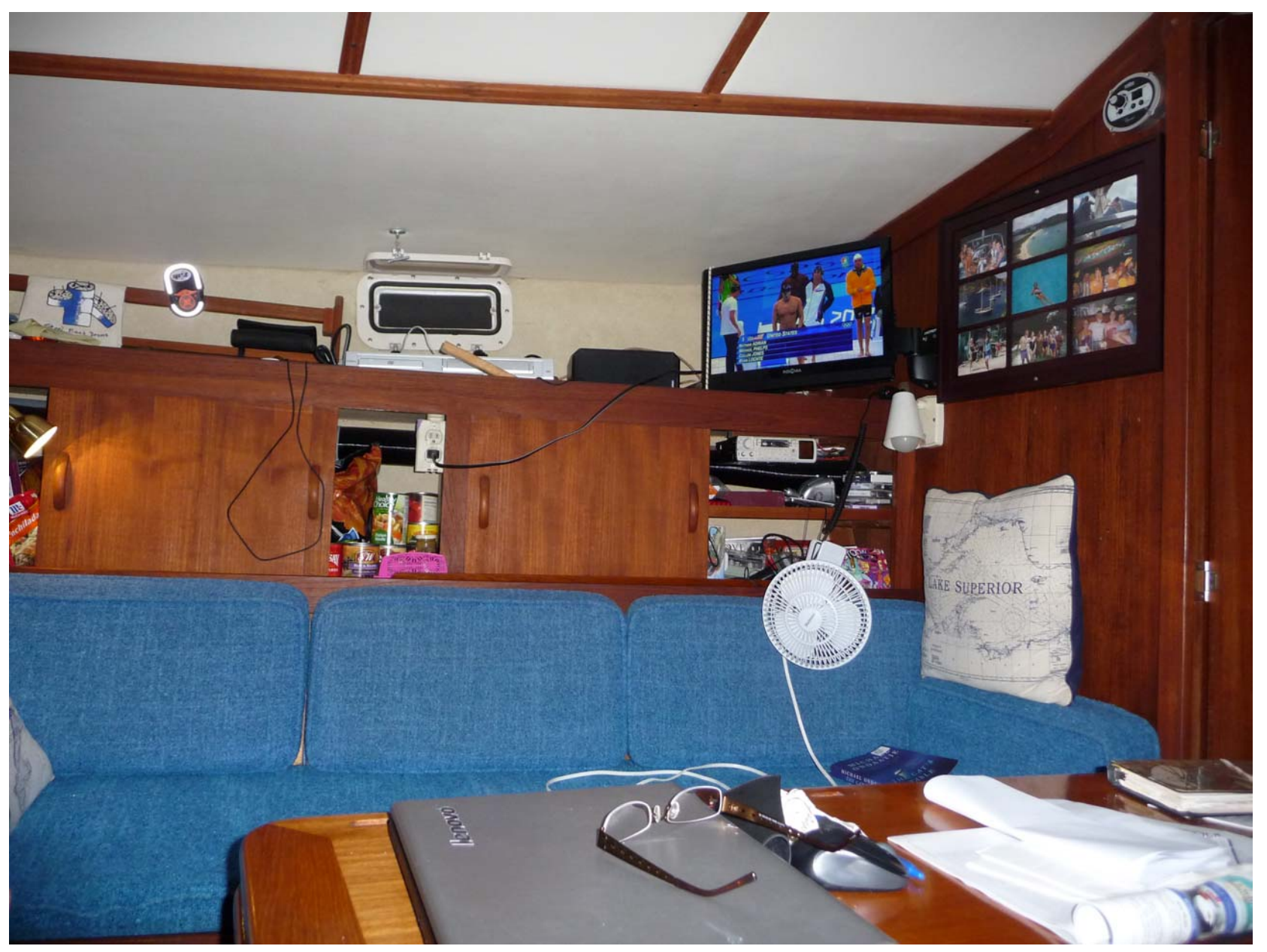
We're enjoying watching the Olympics on our boat. This was the men's aquatic relay race on July 29.