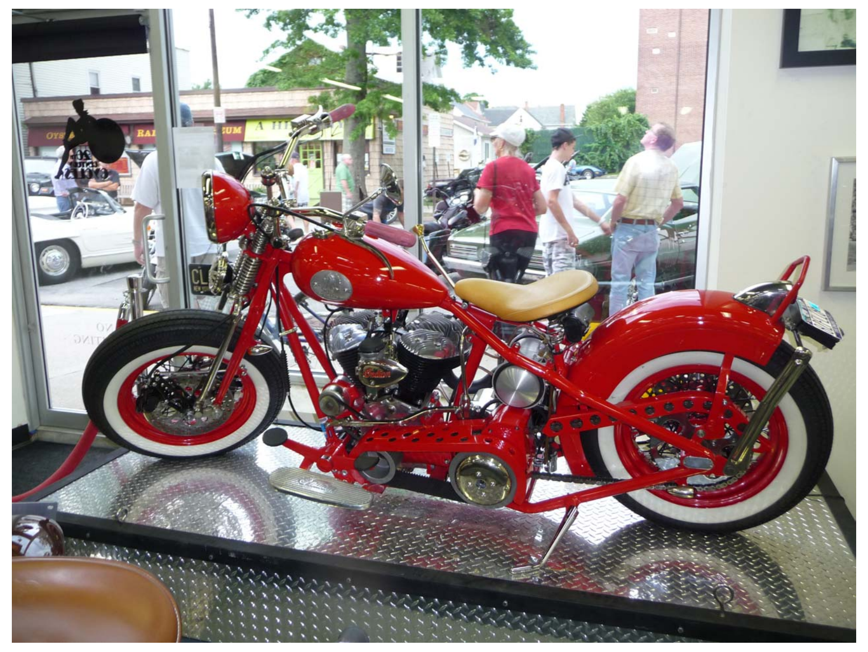
A cool custom Harley/Indian hybrid.