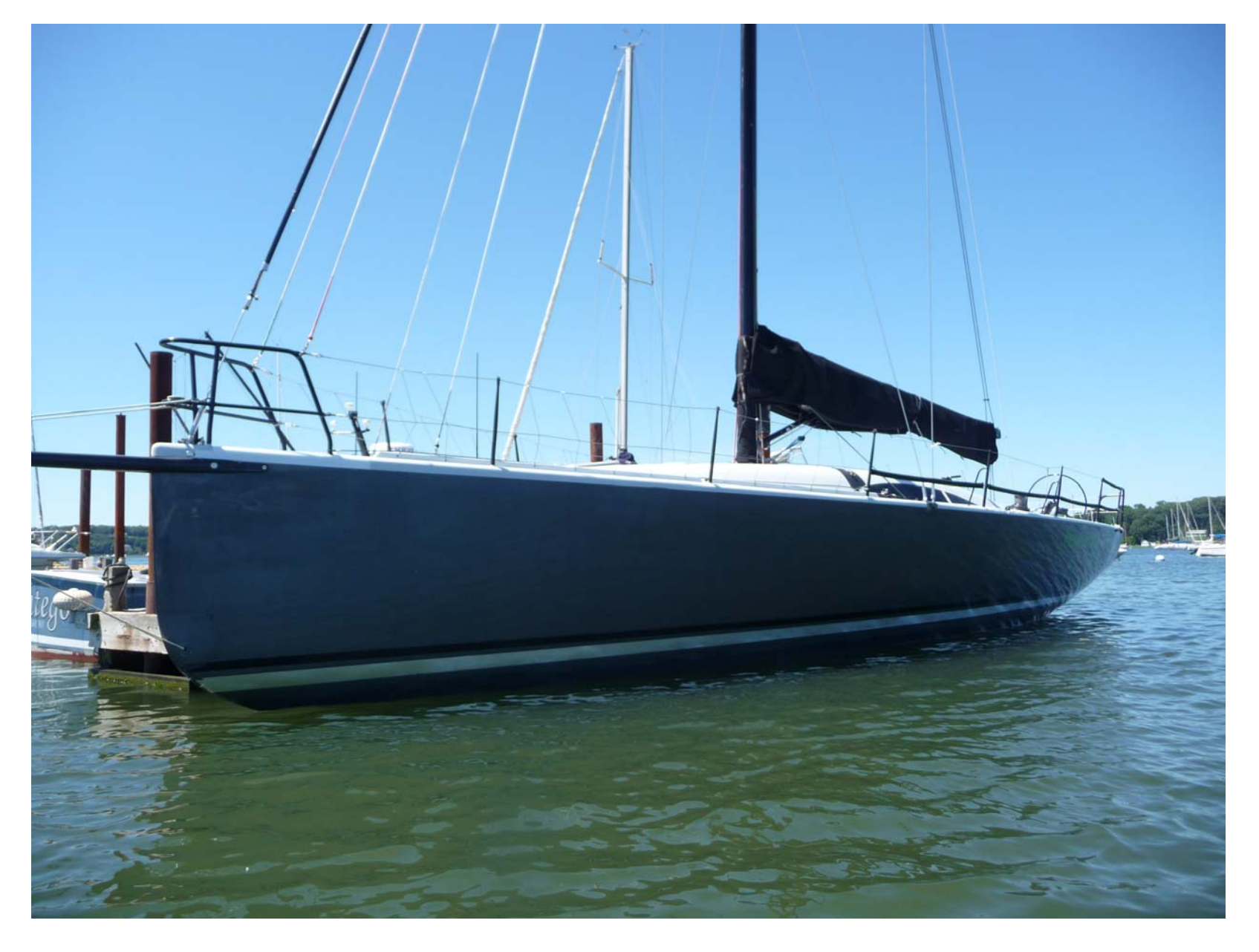
This is one of Oakcliff's racing sailboats, Temptation . It had just won Newport Race Week sponsored by the N.Y. Yacht Club.