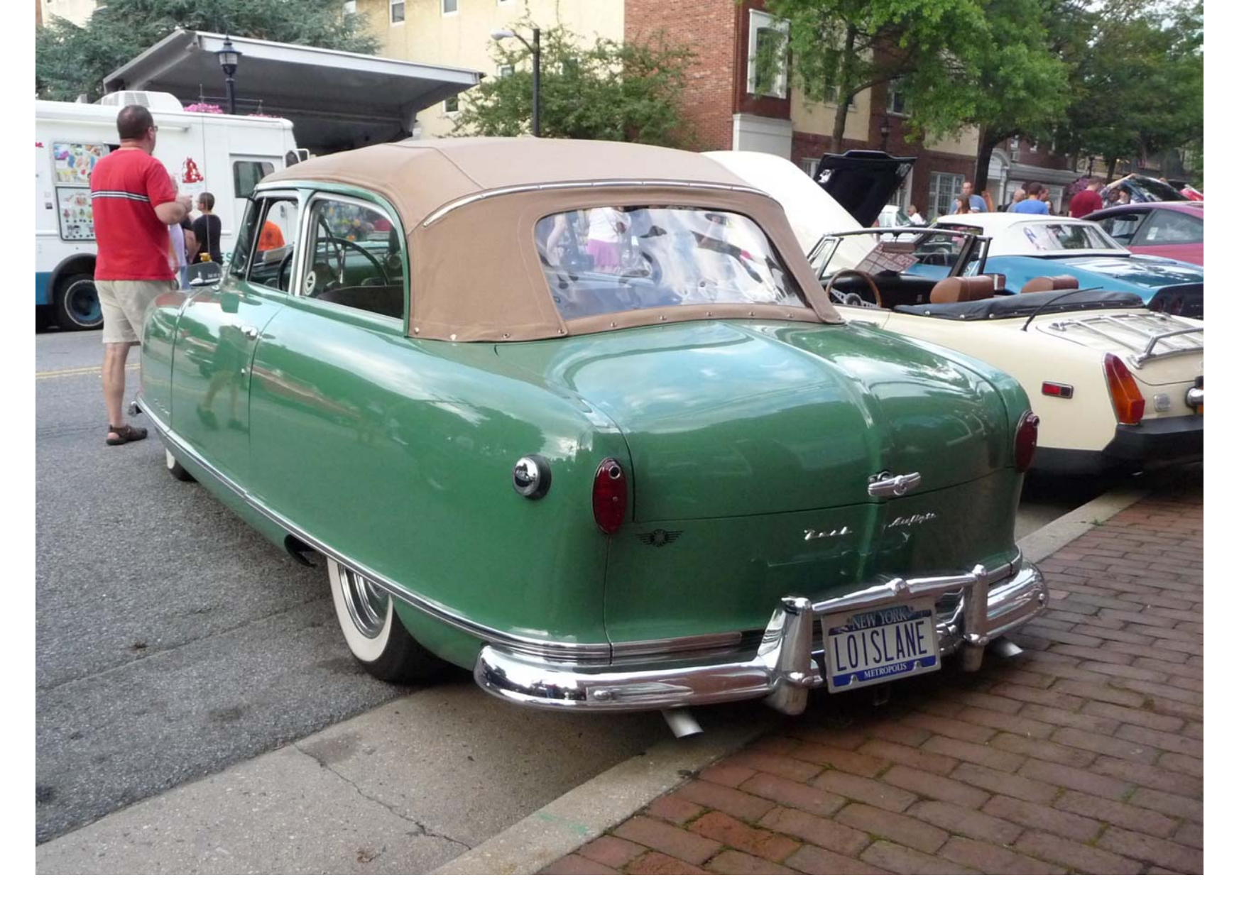
Classic Nash Rambler convertible. Like the vanity plate?