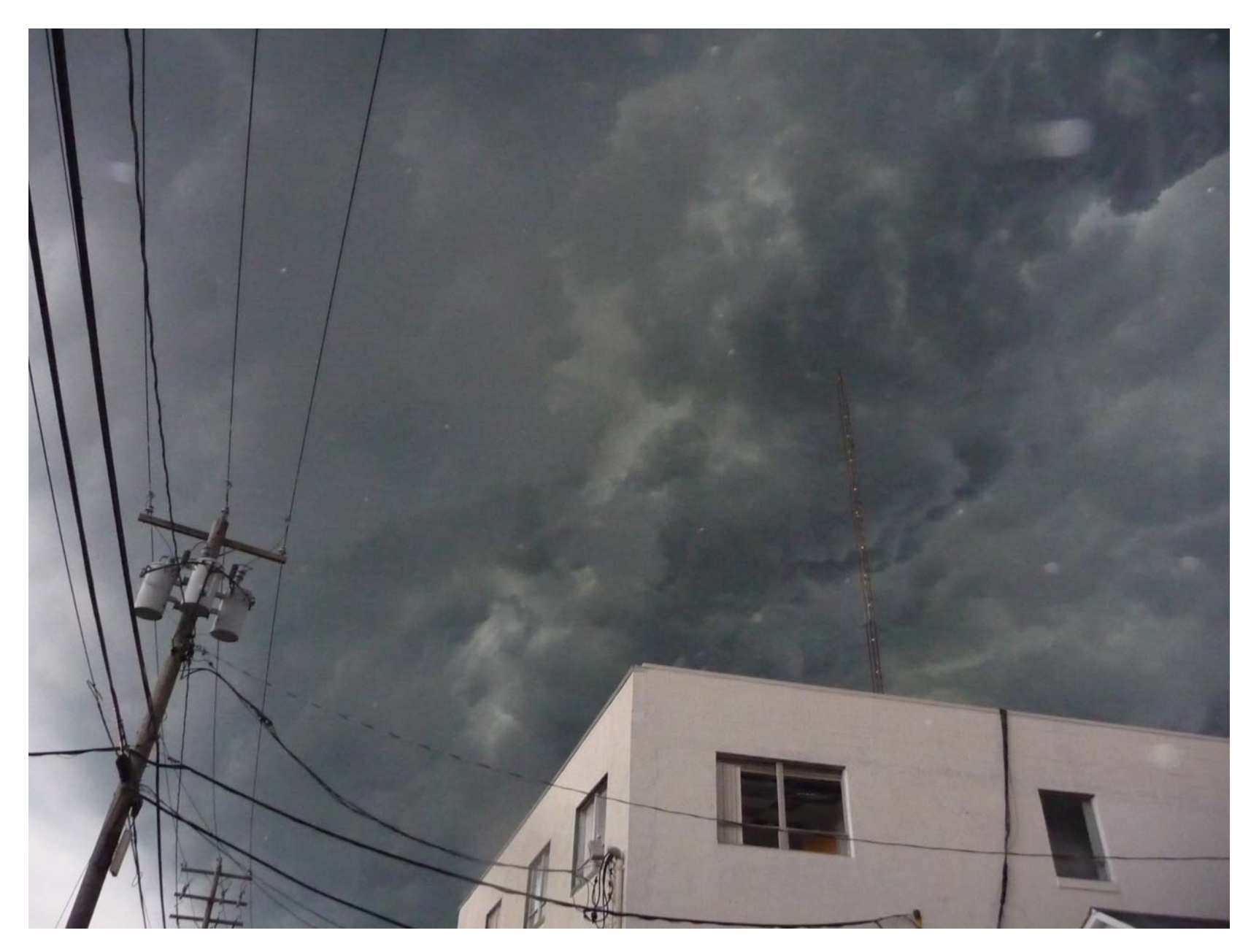
Plenty of rain & wind but thankfully no tornadoes.