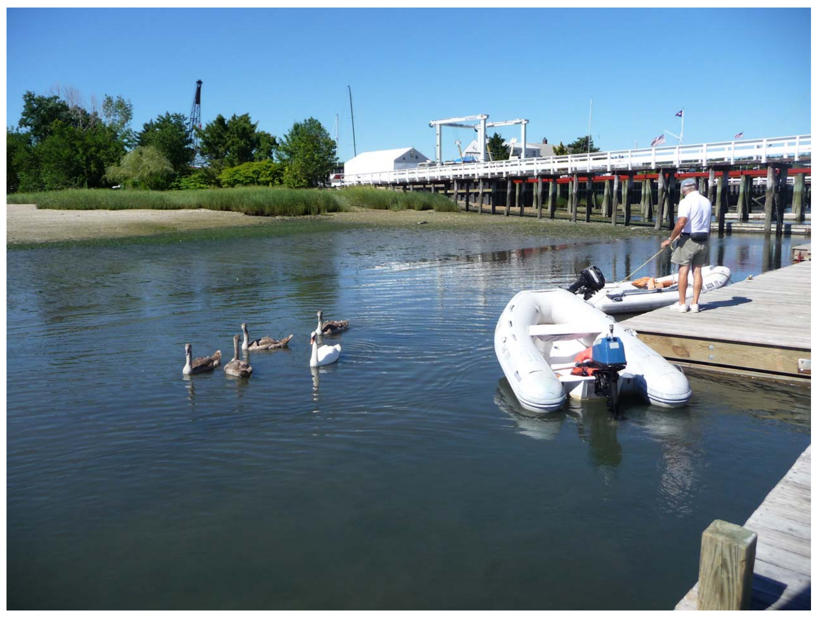
Low tide in Oyster Bay—even the dinghy ran aground as we came in to the dock. We were greeted by the resident swan family.