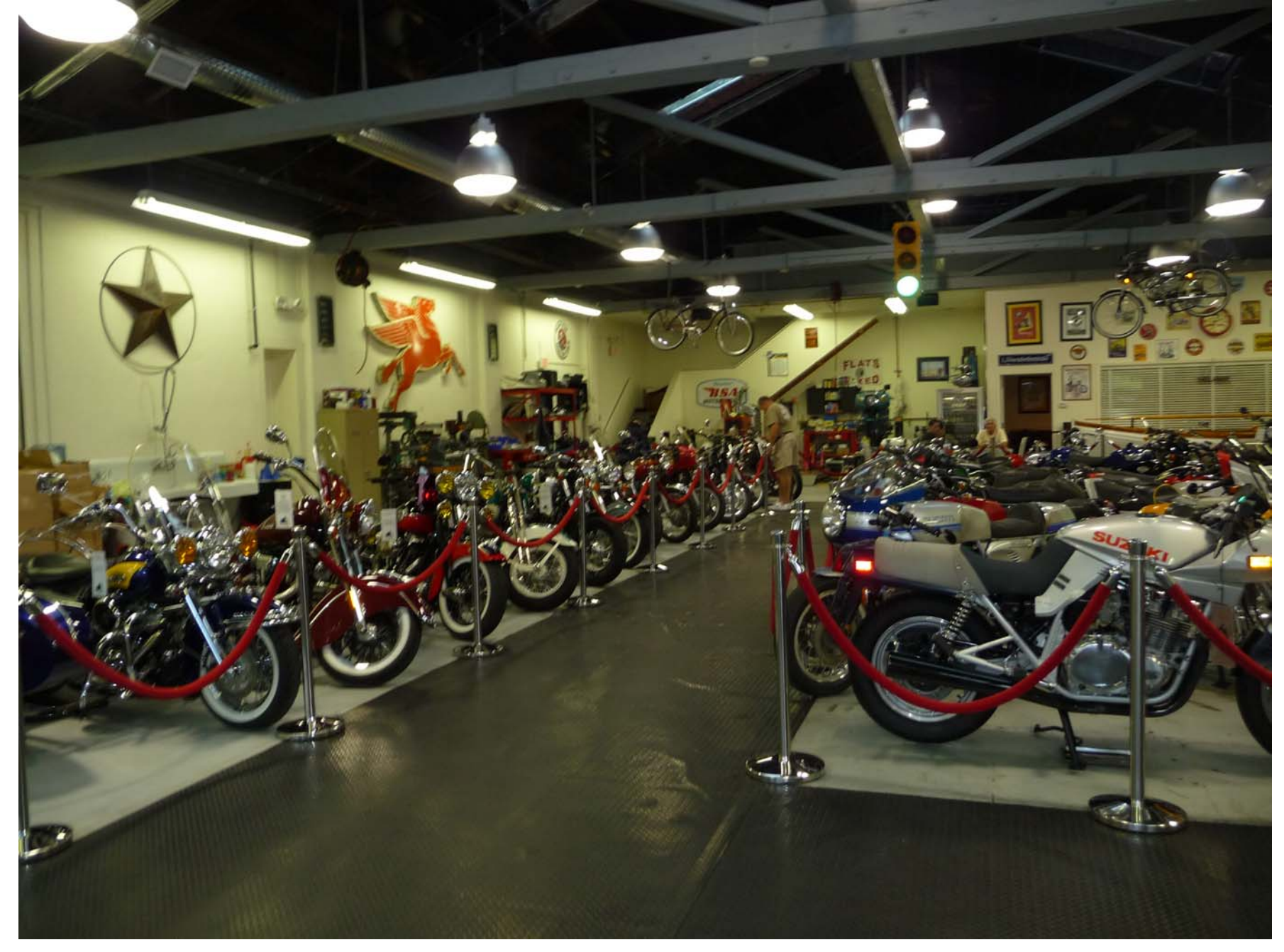
Inside the motorcycle museum.