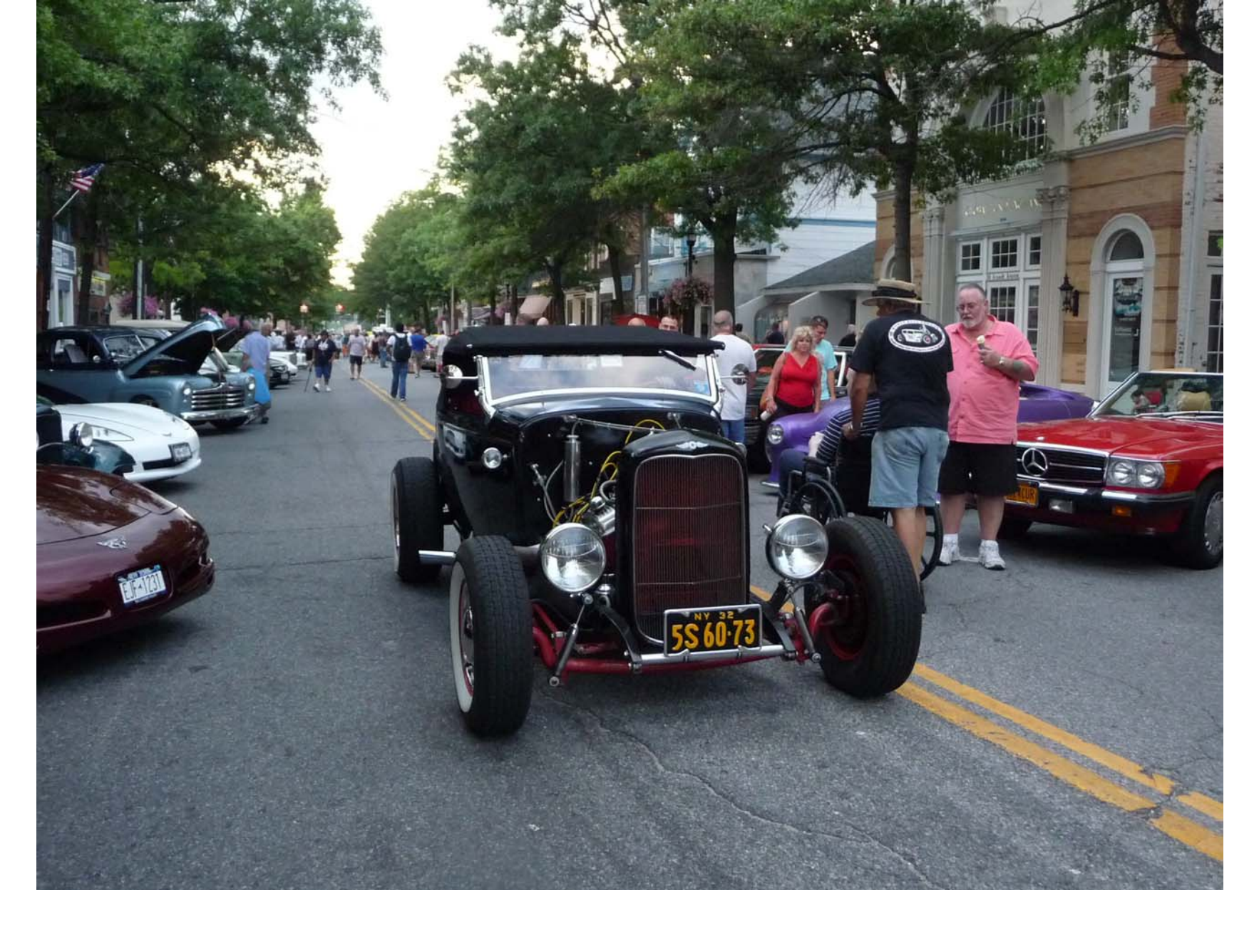
We enjoy "Cruise Night" in Oyster Bay.