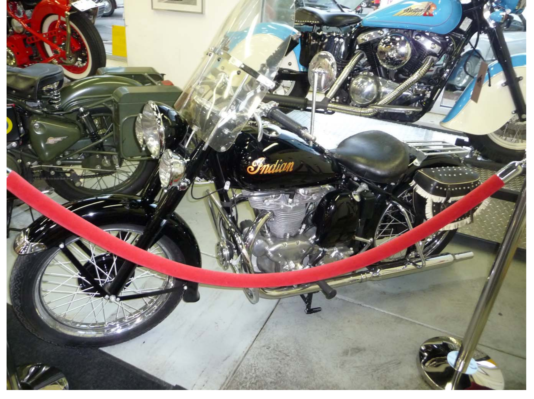
Indian's answer to the British post war motorcycle invasion.