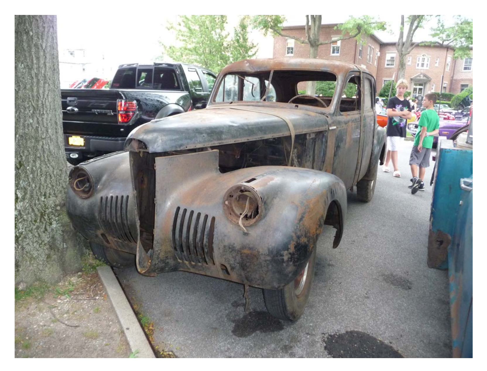
Just a little fixer upper at the car show.