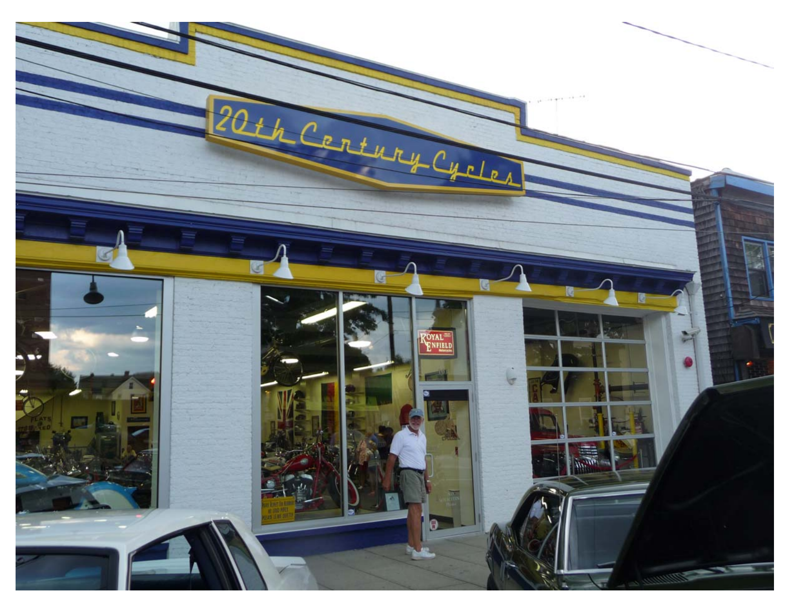
Billy Joel's motorcycle museum in Oyster Bay.