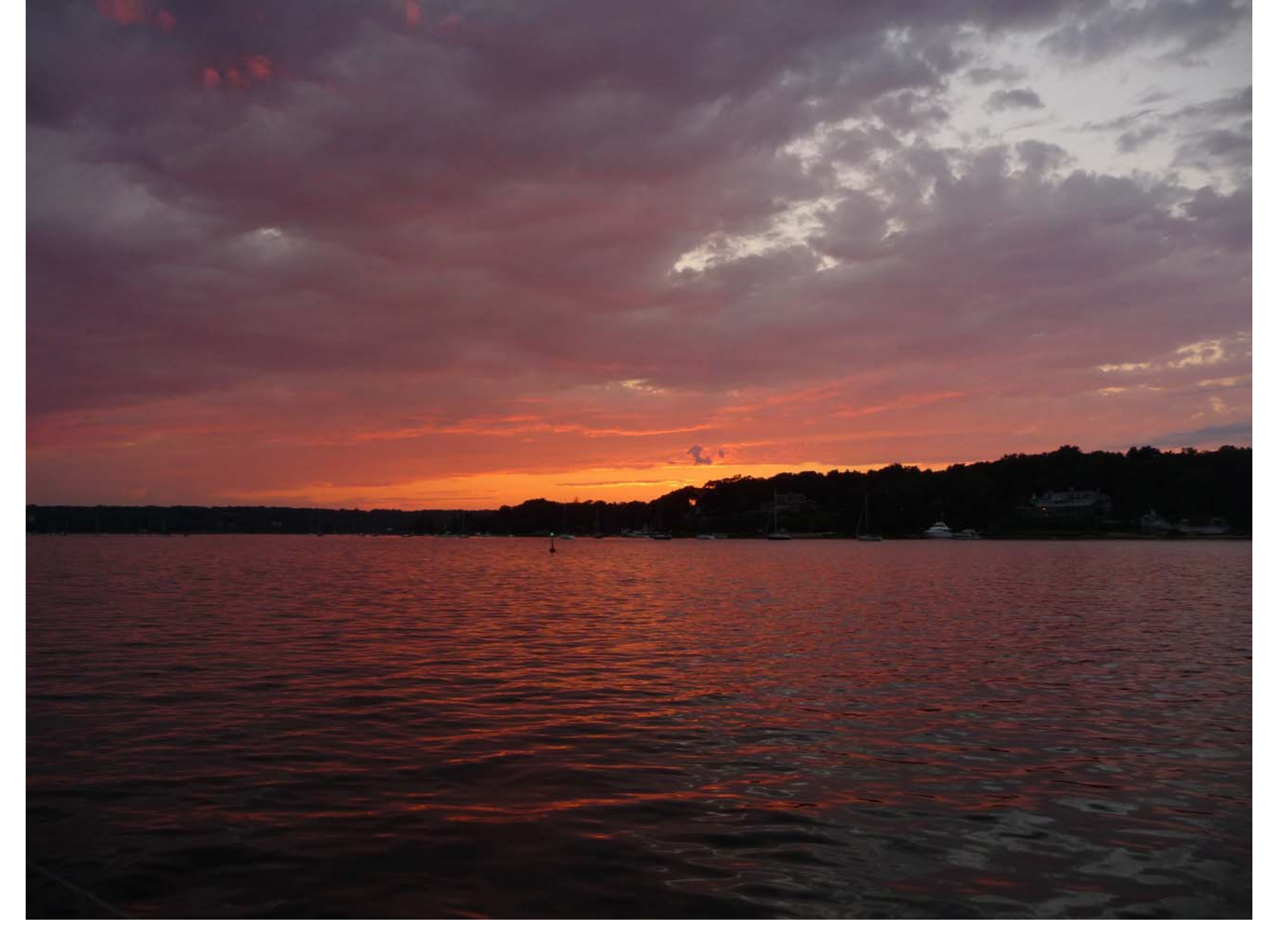
Pretty sunset in Oyster Bay.