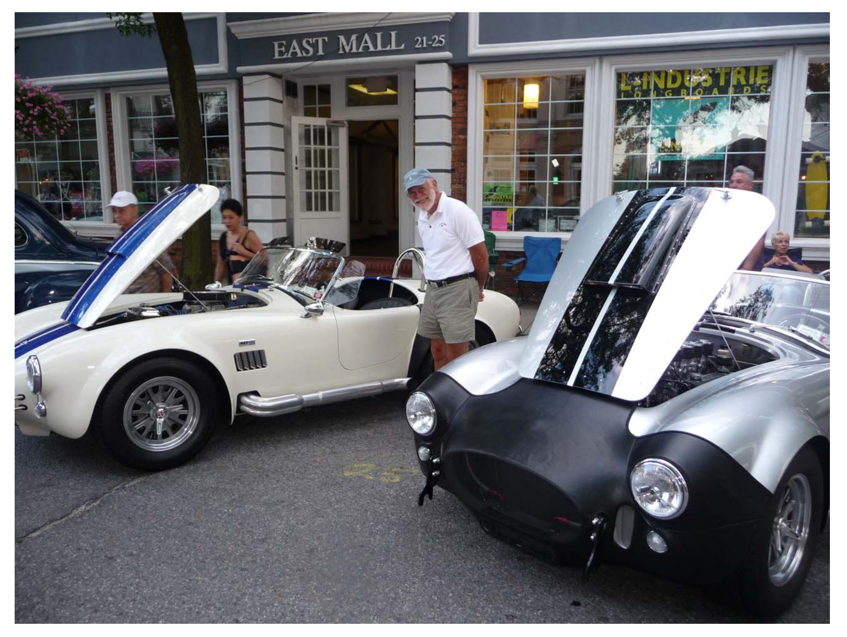
Two very expensive Shelby Cobra's from the '60's.