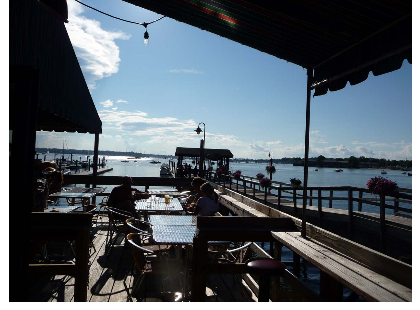
Louie's is an experience not to be missed in Port Washington.