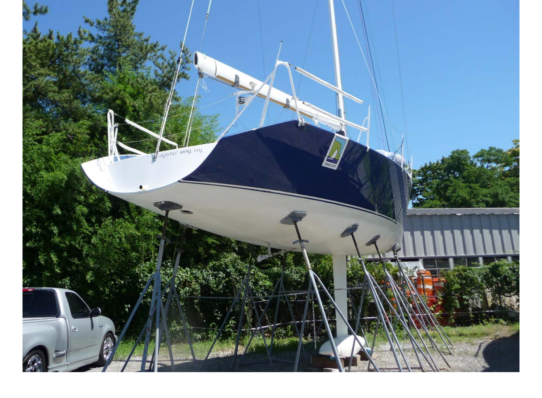
Another Oakcliff racing machine. This one is waiting on a rudder.