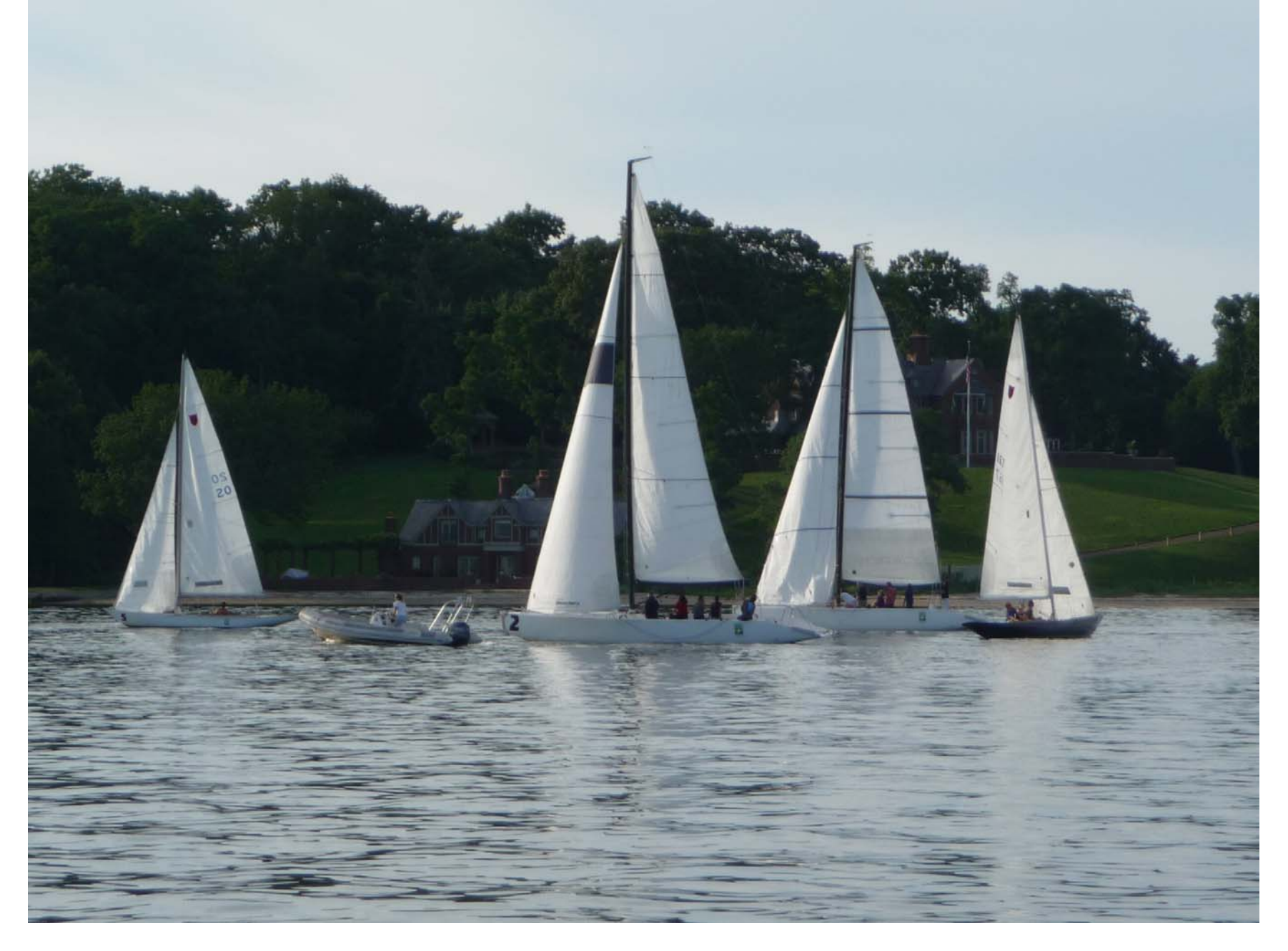
More Oakcliff sailboats in Oyster Bay.