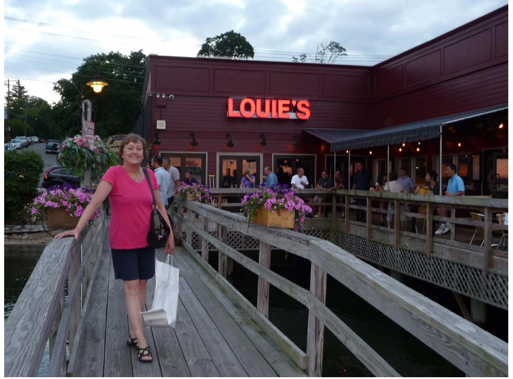
We take the dinghy to Louie's Oyster Bar & Grill for an excellent seafood dinner. They have their own dock for boaters.