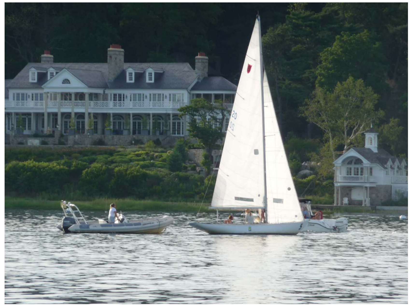
Oakcliff's Swedish Match 40's sailing on a windless evening. Dawn is in the RIB giving assistance if needed.