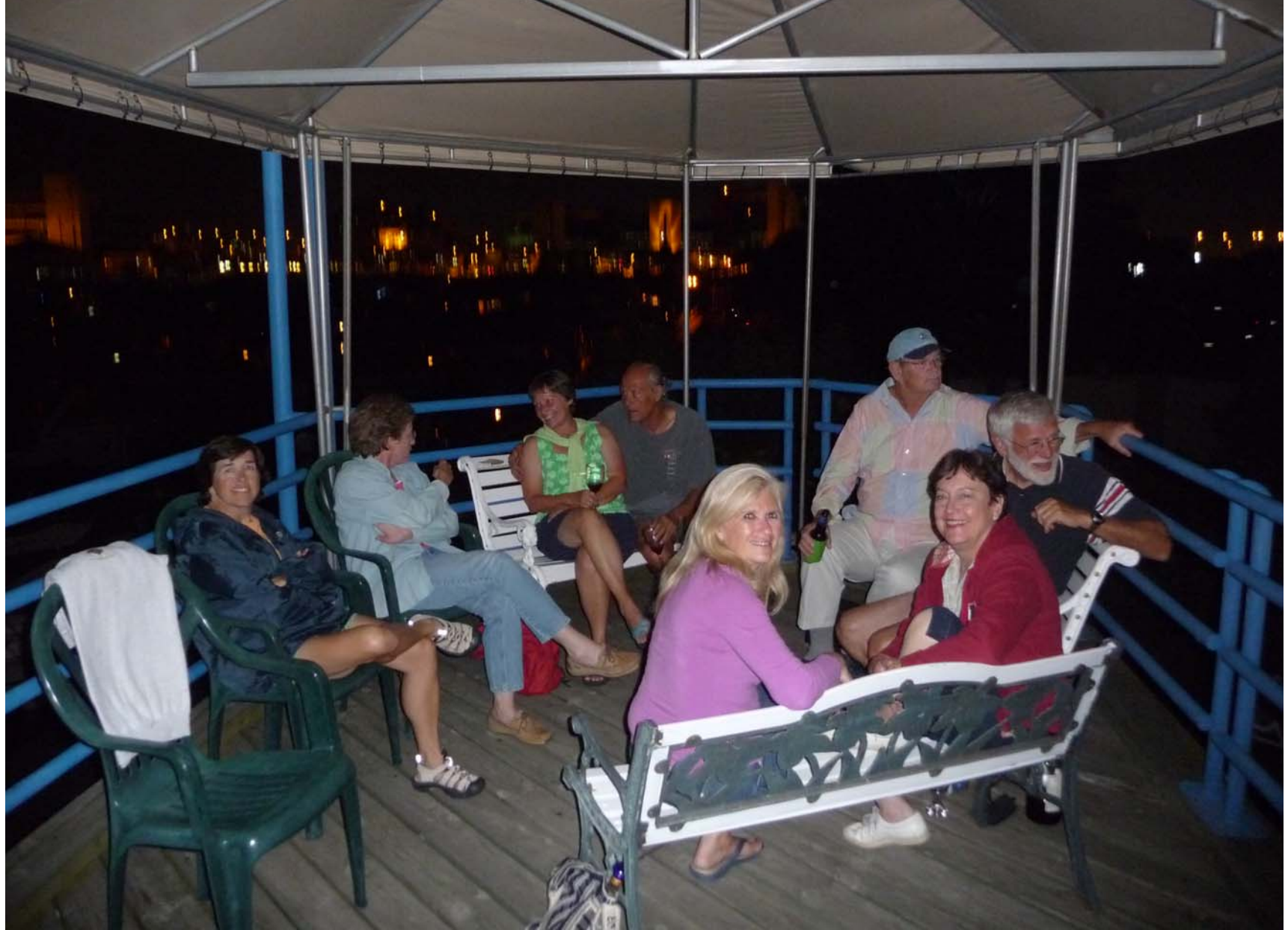
Gazebo group at Marina de Quebec watching the Quebec history slideshow projected on the expansive grain elevators by the marina.