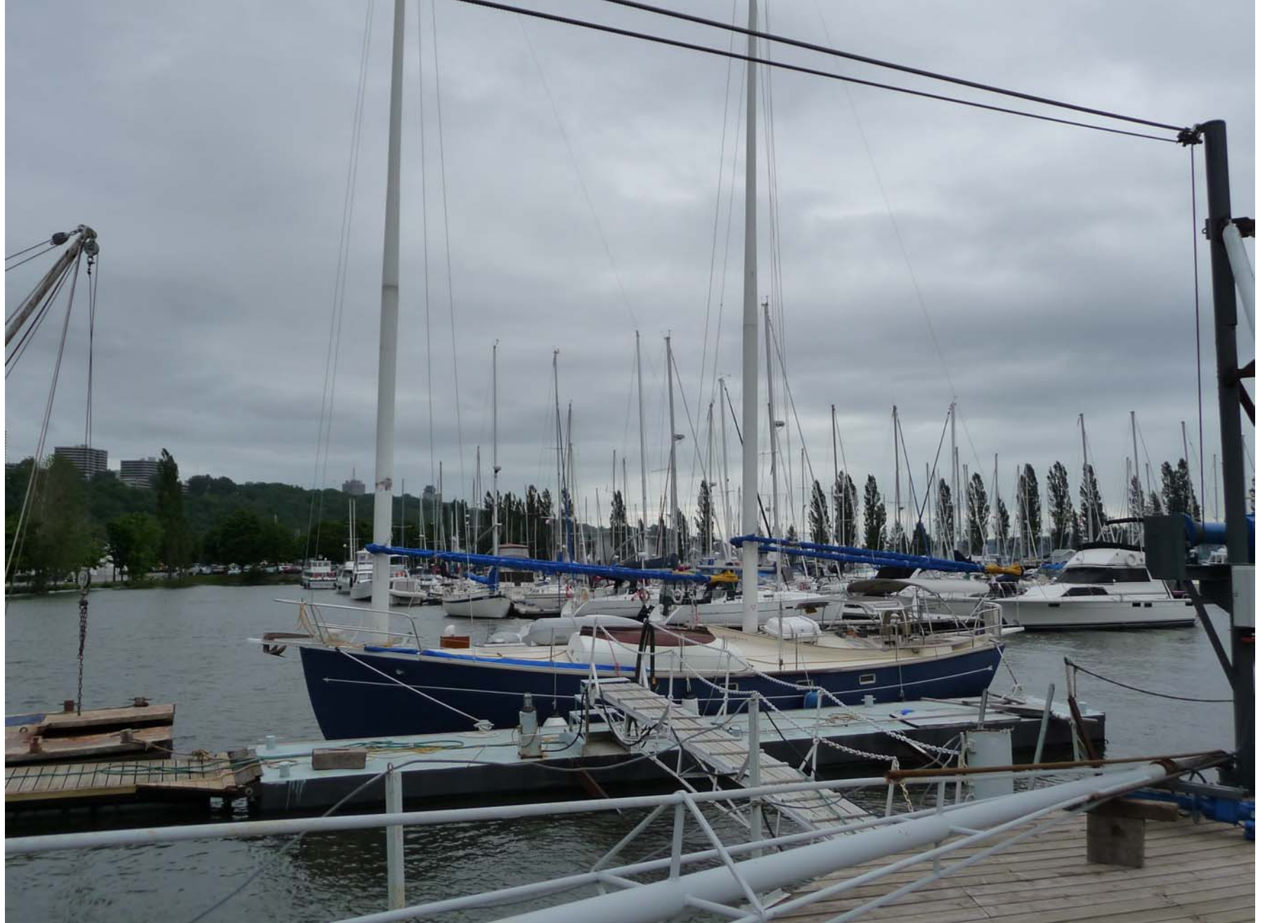
Running Free docked at the Yacht Club de Quebec waiting to be pulled out of the water on July 24.