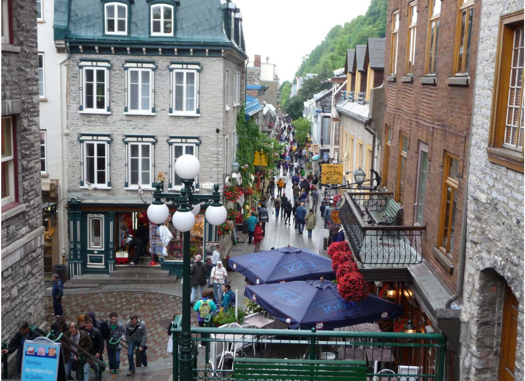
A typical street in 'old town' Quebec City.