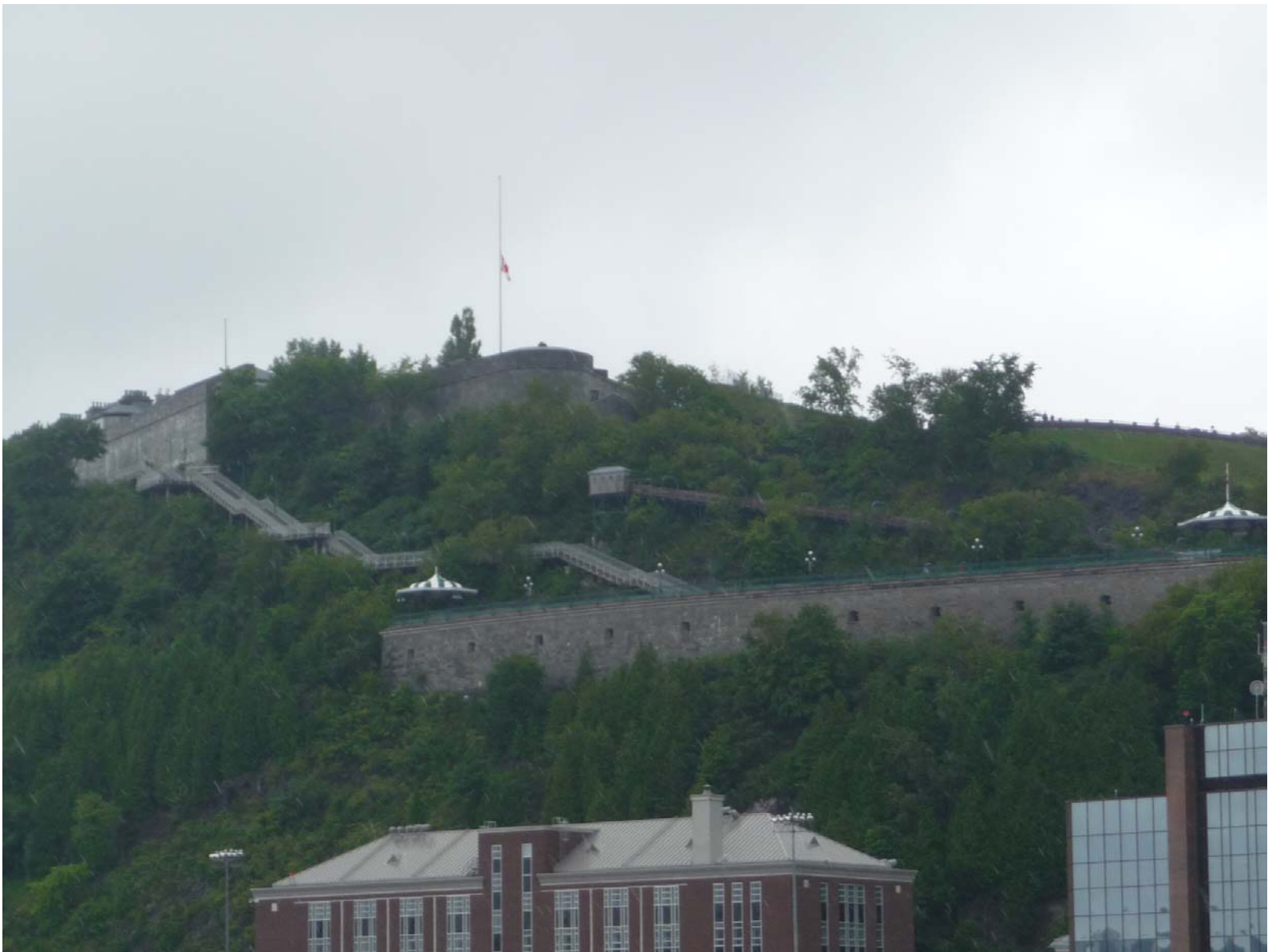
The Citadelle above the “Plains of Abraham” battlefield where the French lost to the British 250 years ago. It is known as the Gibraltar of America.