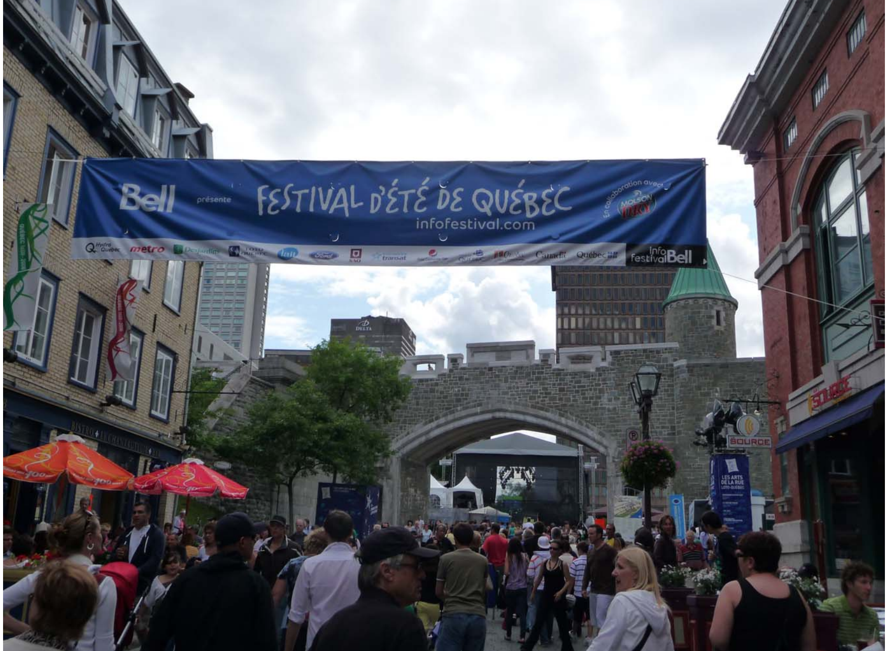
Busy Rue Sainte-Jean.