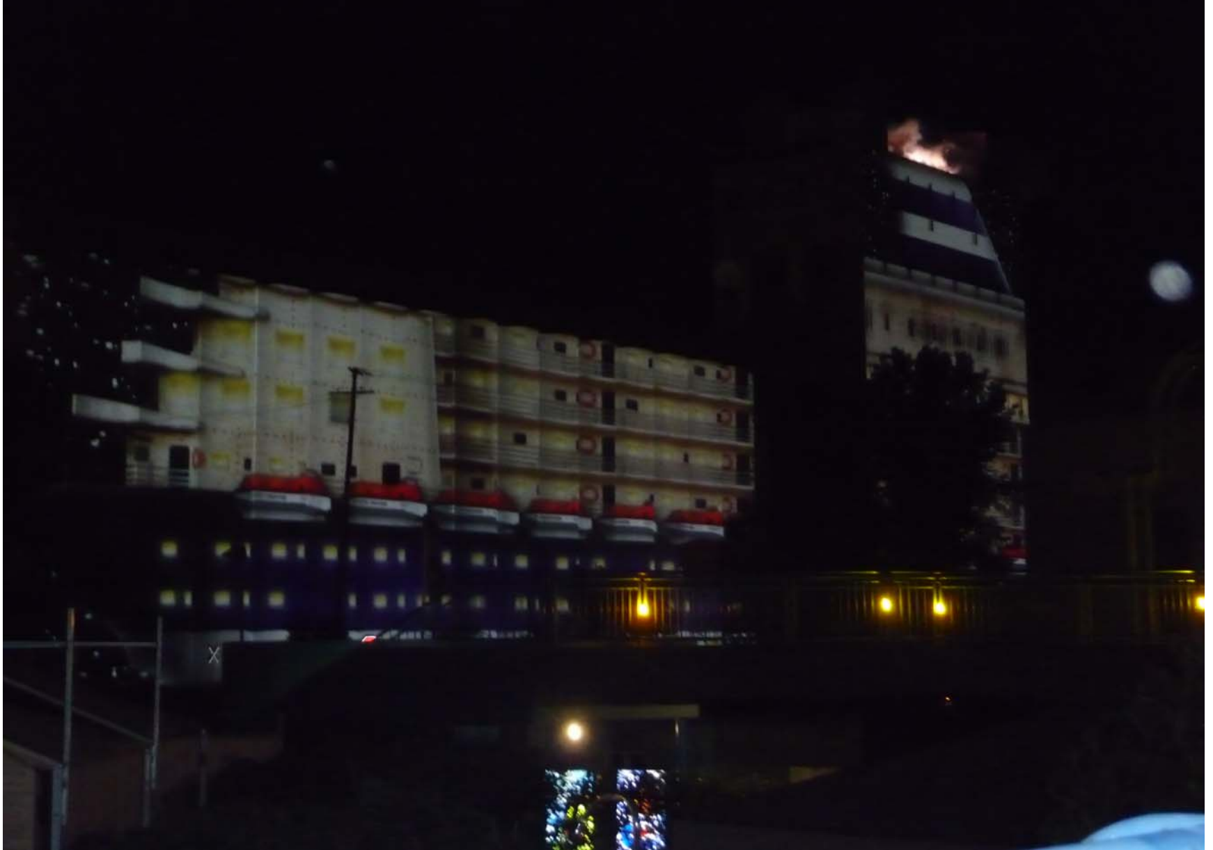
Here's a ship in the show with the smokestack puffing smoke.