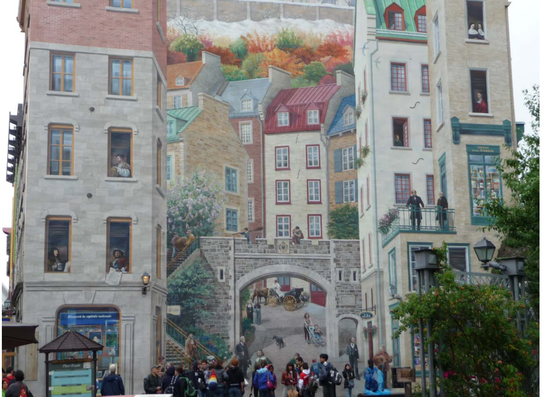
The Mural of Quebecers illustrating 400 years of Quebec history on Notre-Dame Street.