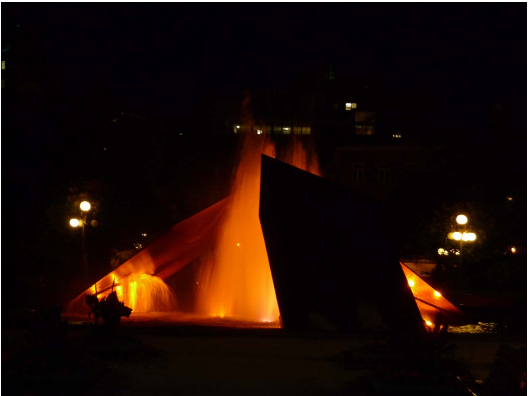
This is the same fountain at night by the train station. Dramatic!