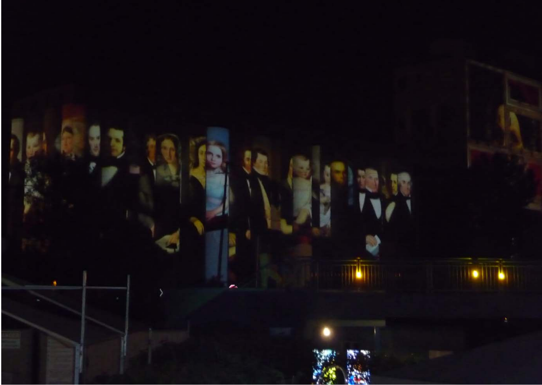
Famous people in Quebec's 400 year old history.