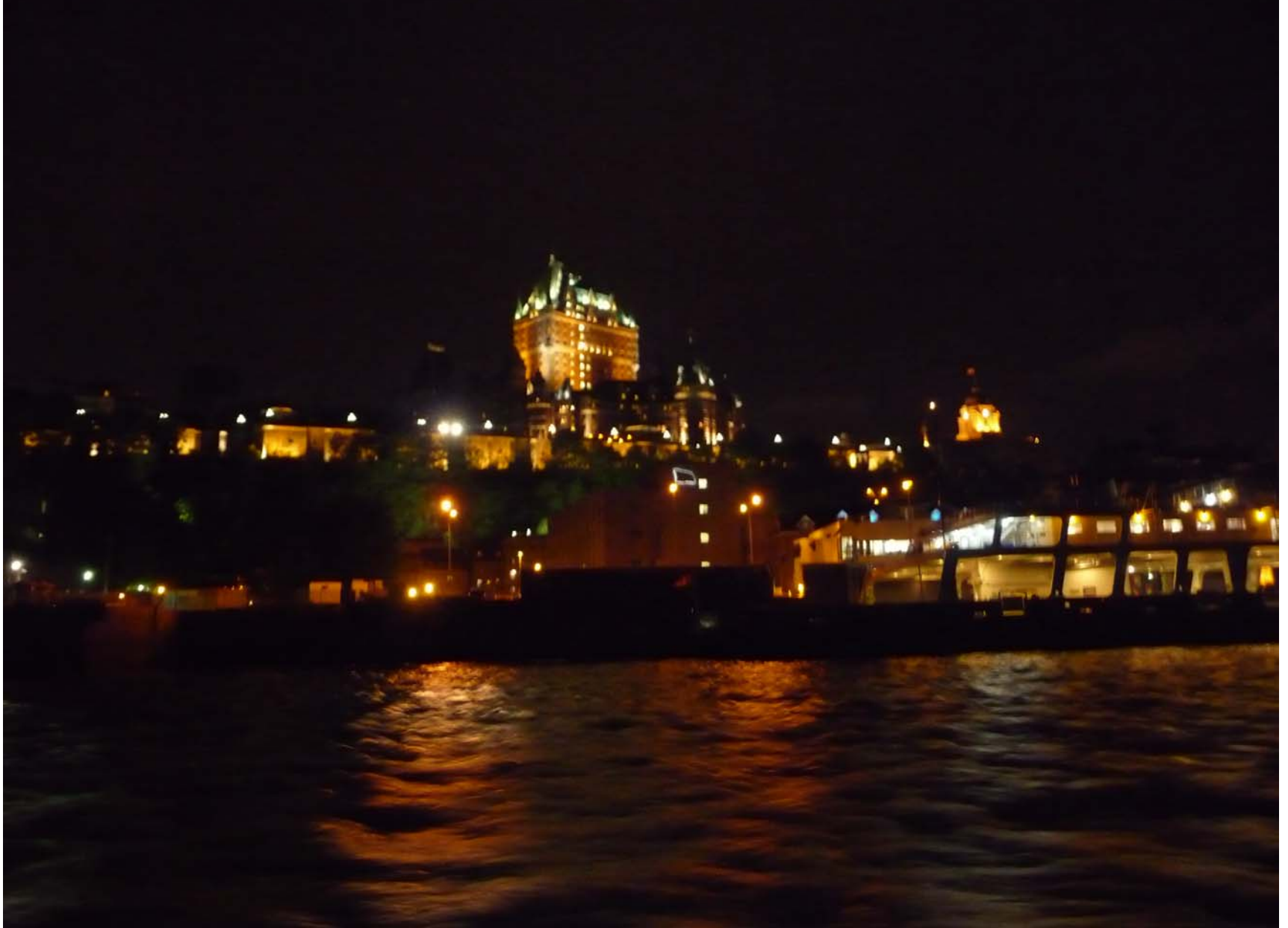
Our arrival in Quebec City at night with the Frontenac Hotel all lit up.