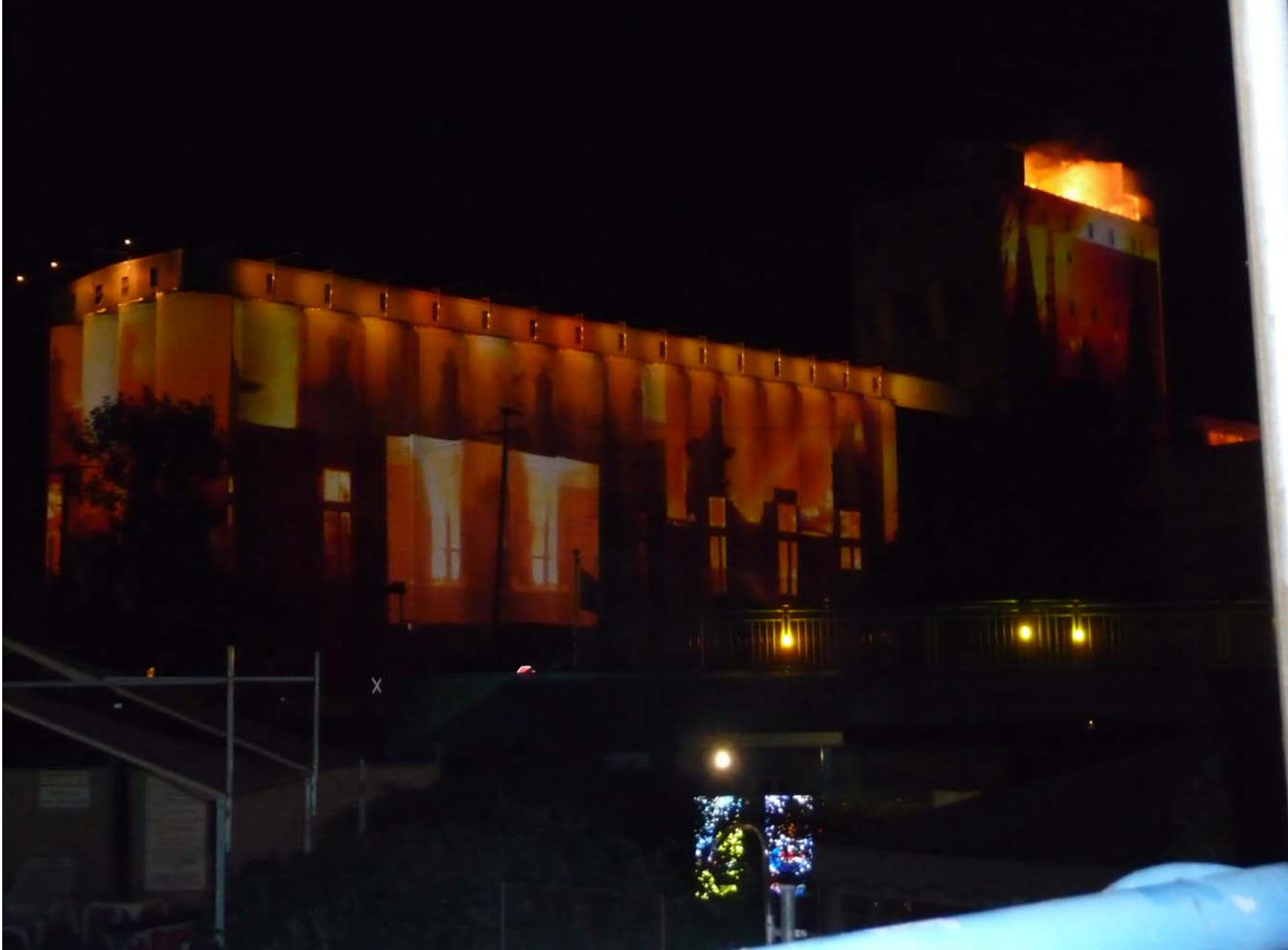
The grain elevator show with even a fake fire!