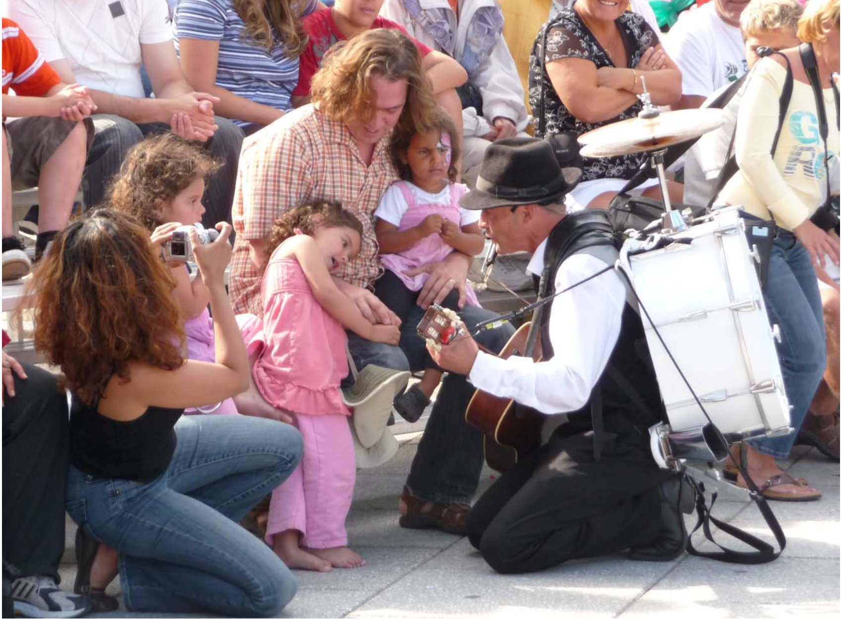
A street performer entertains triplet girls by Hotel Frontenac.