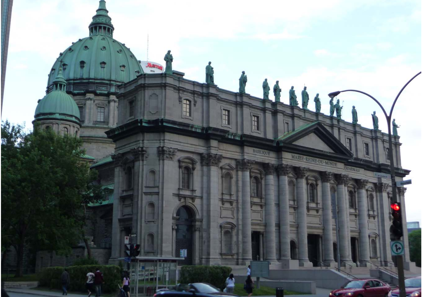
Front view of the Basilique Marie Reine du Monde next to our hotel.