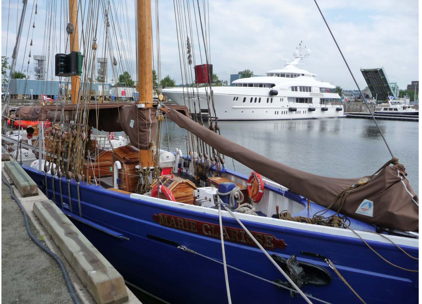
The schooner Marie Clarisse & mega yacht Blue Moon behind.