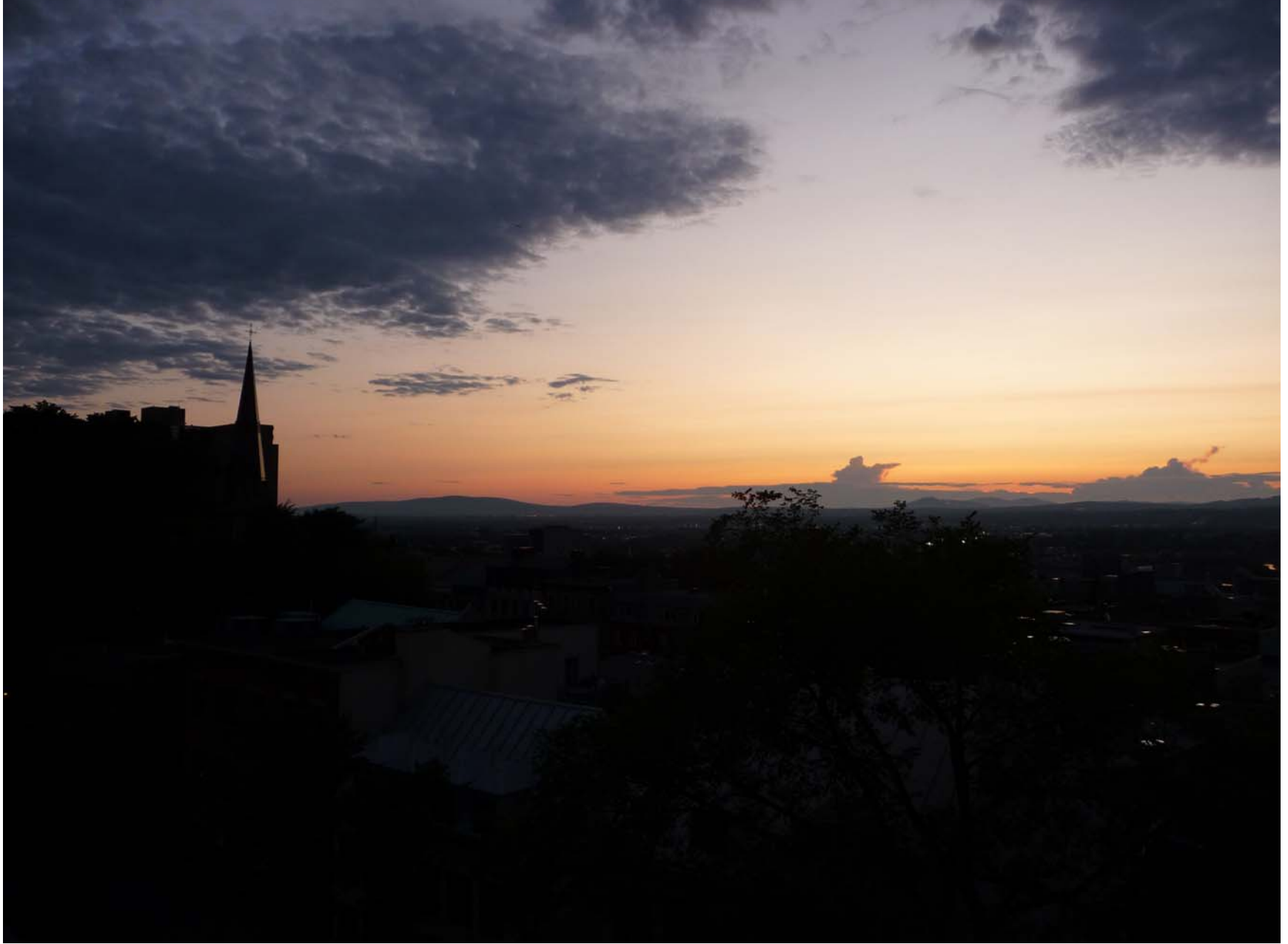
Sunset from the Centre des Congres de Quebec.