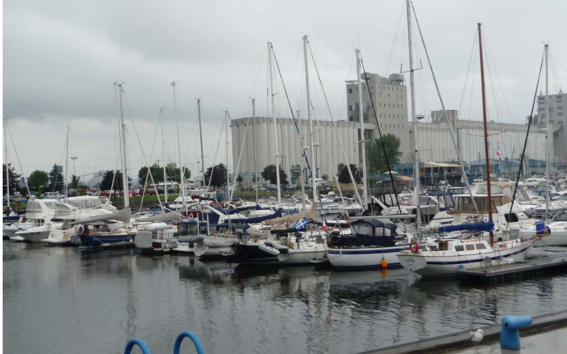
Running Free (left side) at Marina de Quebec on a rainy day, July 19, 2009.