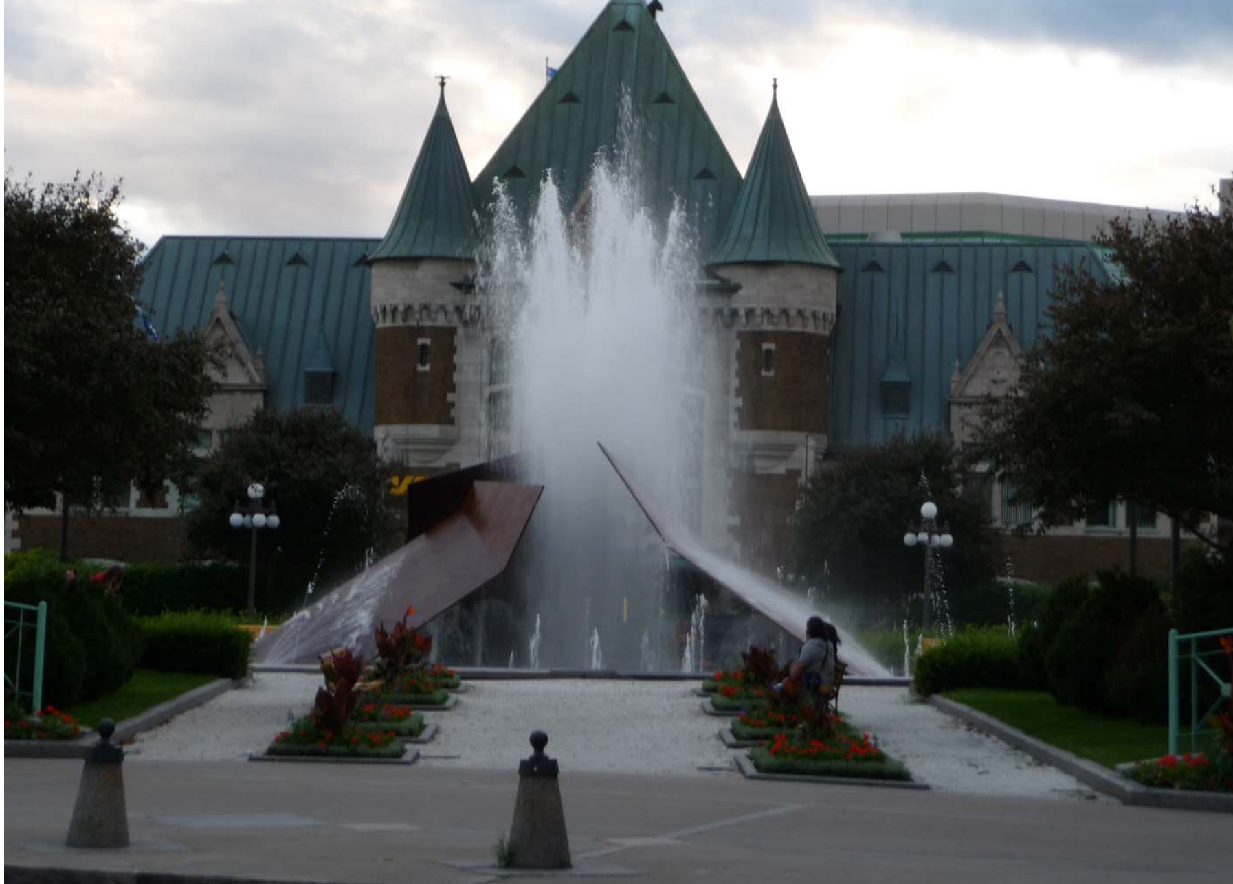
Fountain by the Gare du Palais (train station).