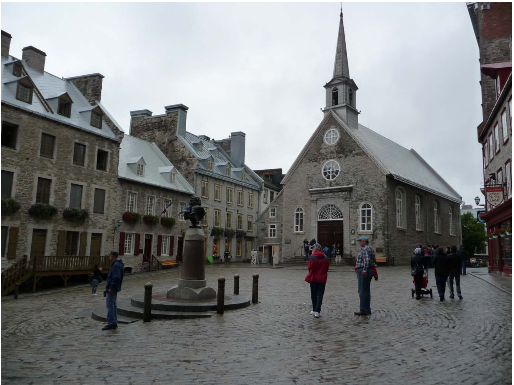
Notre-Dame-des-Victoires Church (1688), Place Royale.