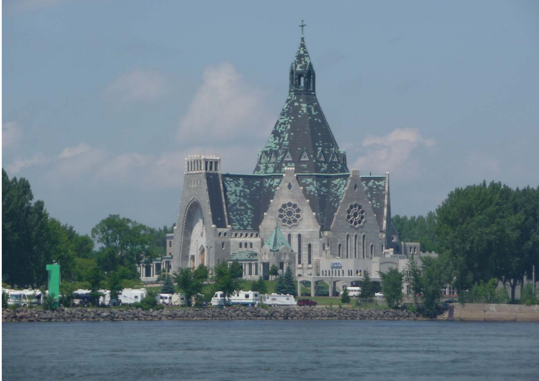
Wonderful old church by Trois Rivières.