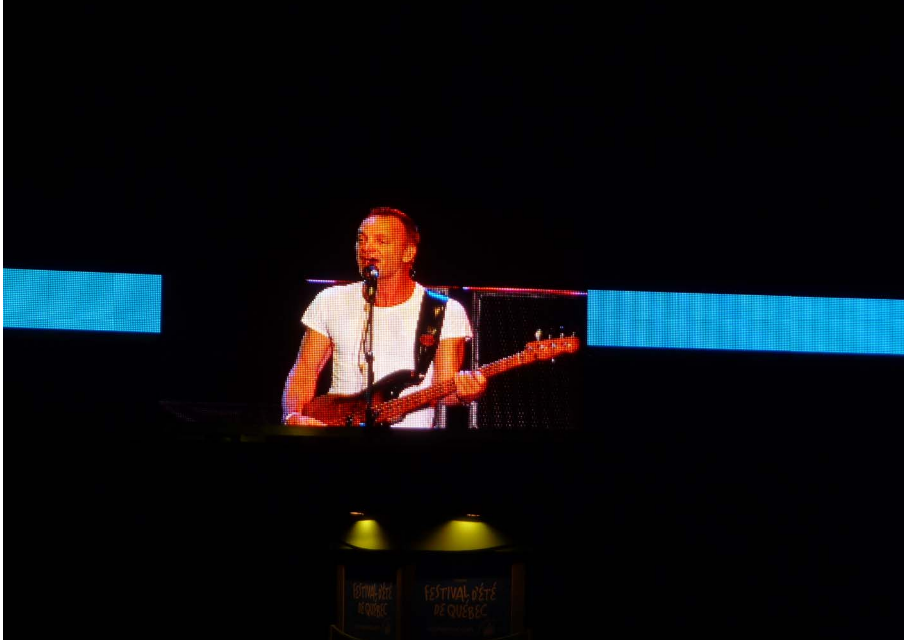
Another photo of Sting on the jumbo-tron screen.