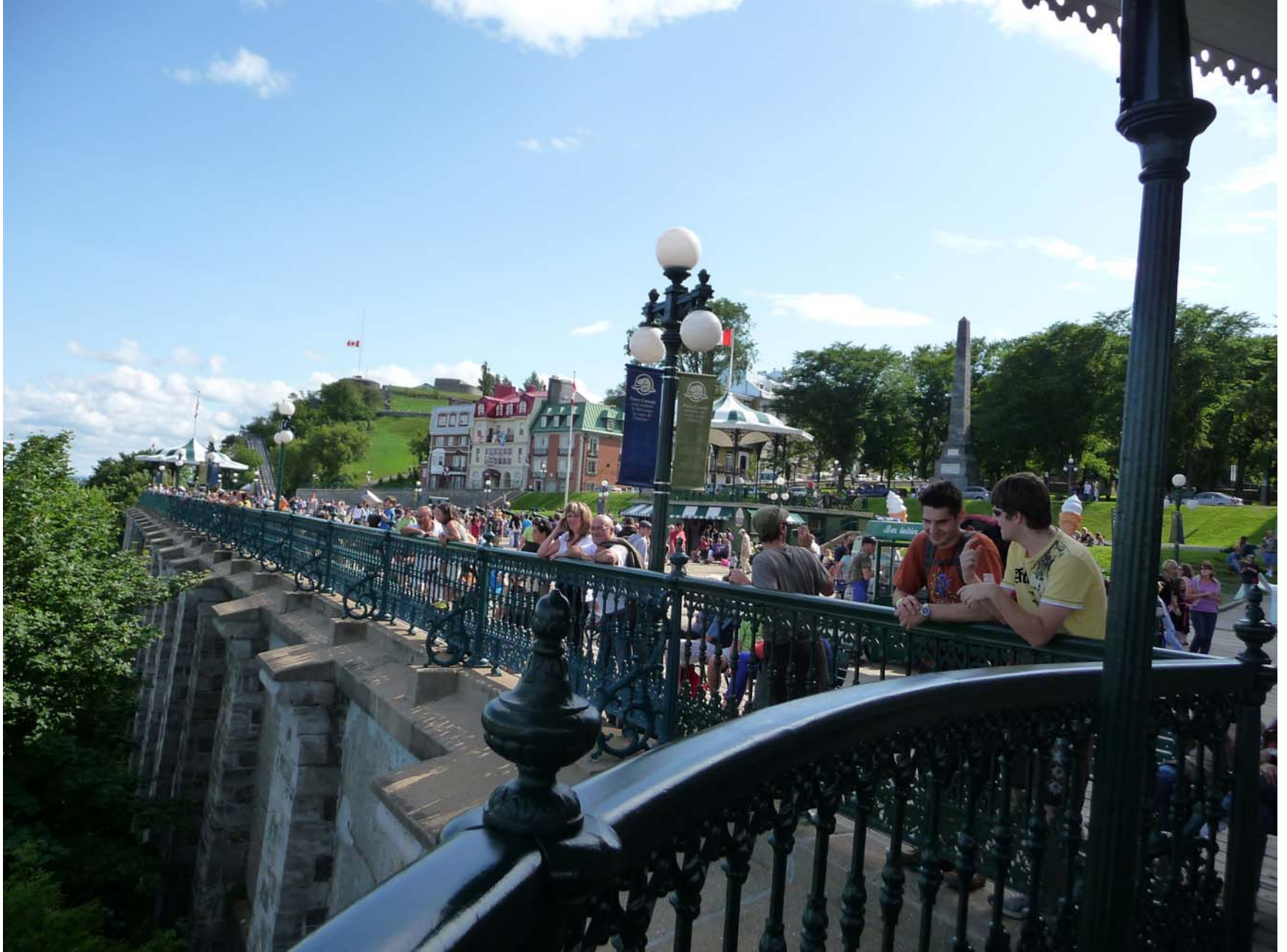
The promenade in front of the Fairmont Le Chateau Frontenac.