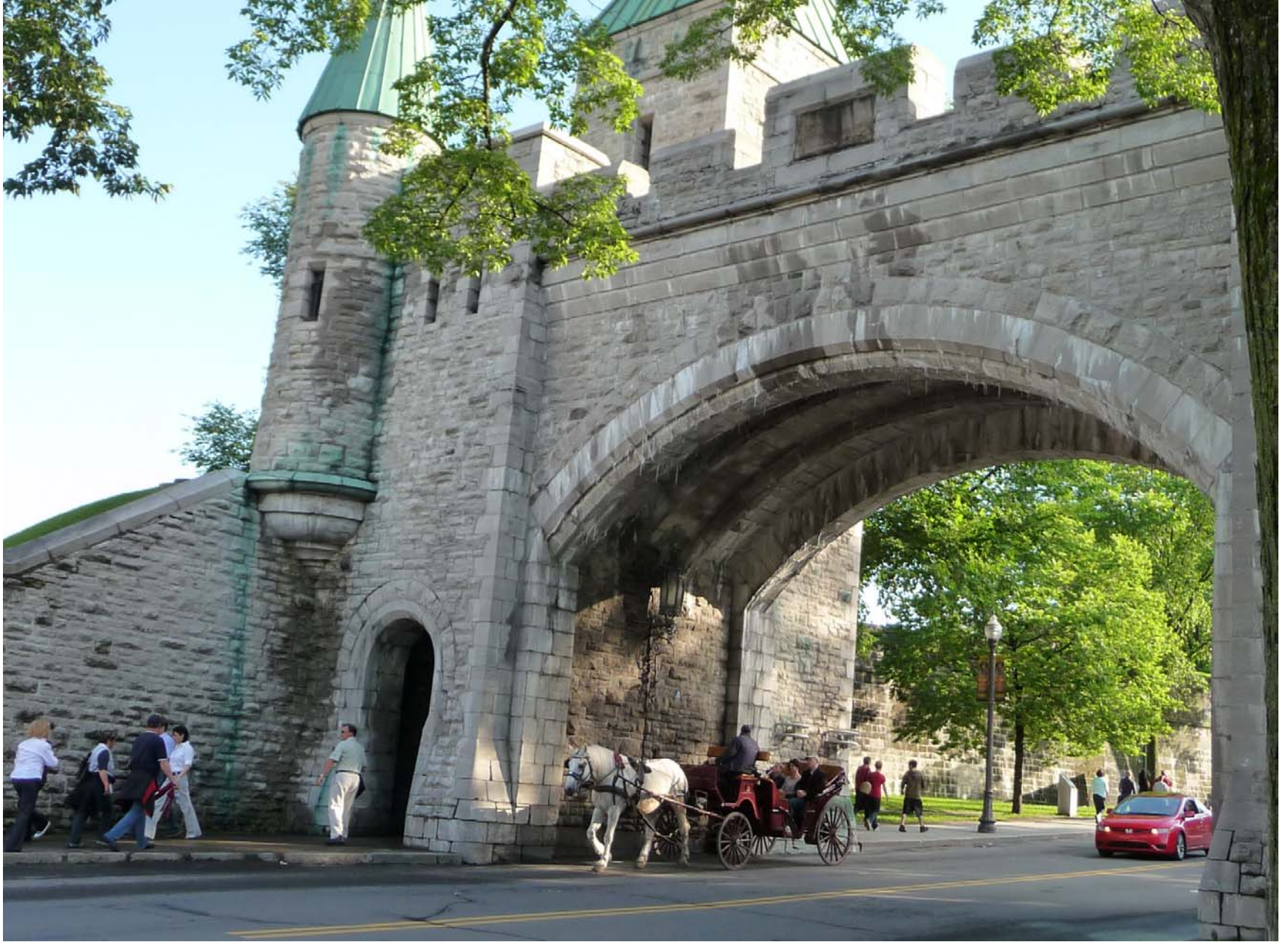
Porte Saint-Louis on Grande Allee Est which is part of the Citadelle.