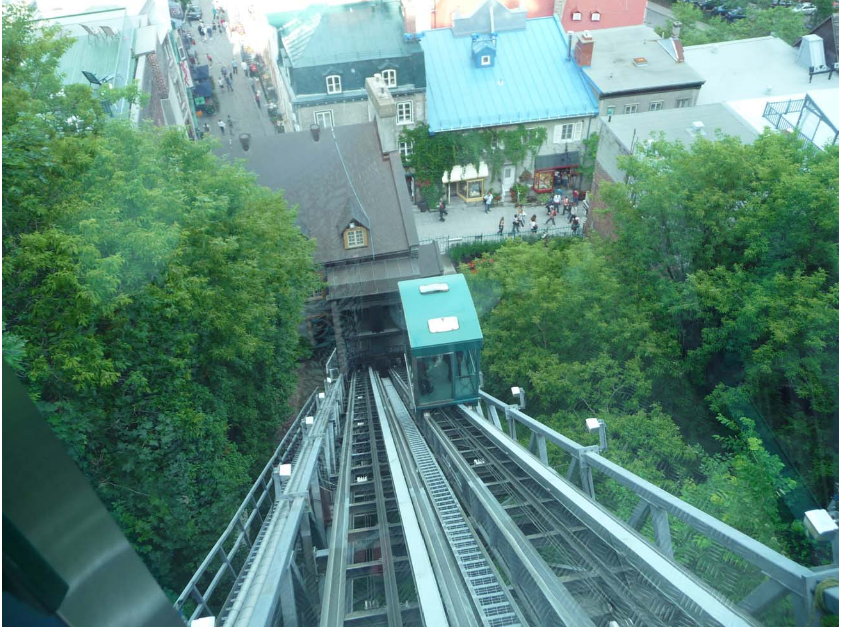
Riding up to the city ramparts on the Funiculaire with one going down.