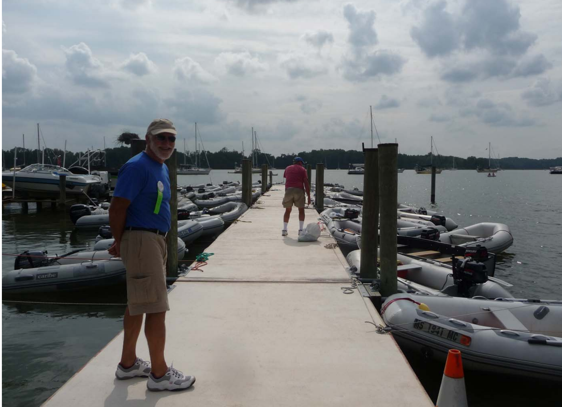
Just a few inflatable dinghies at the Camp Letts dock. 69+ boats came & anchored for the GAM.