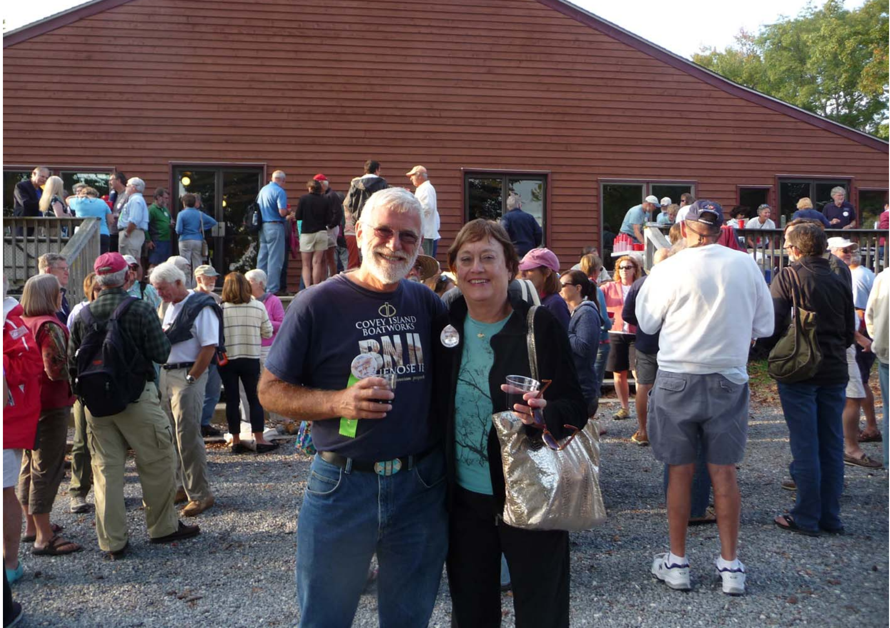
Saturday night happy hour before the barbecue.