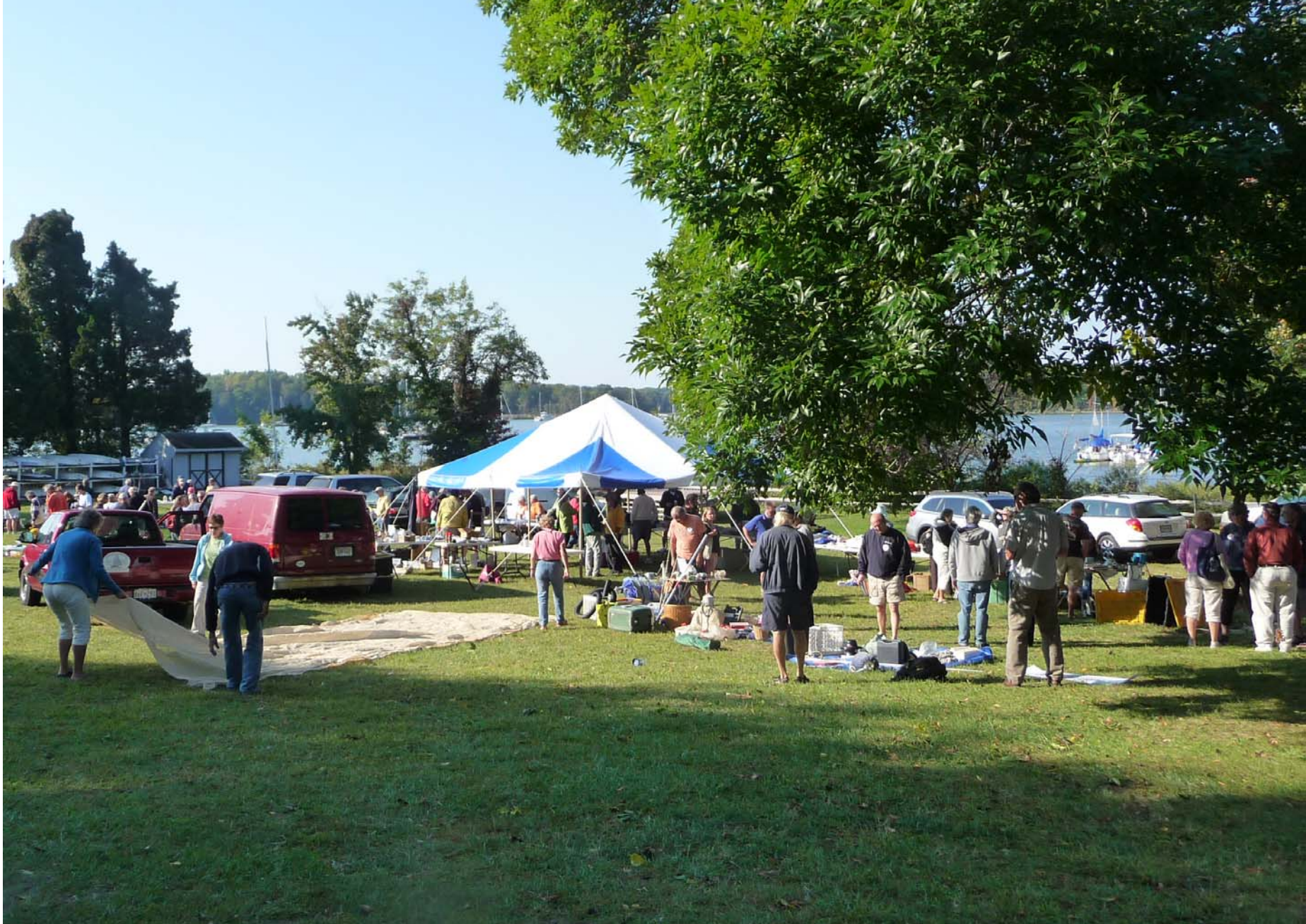
Flea Market put on by the GAM participants.