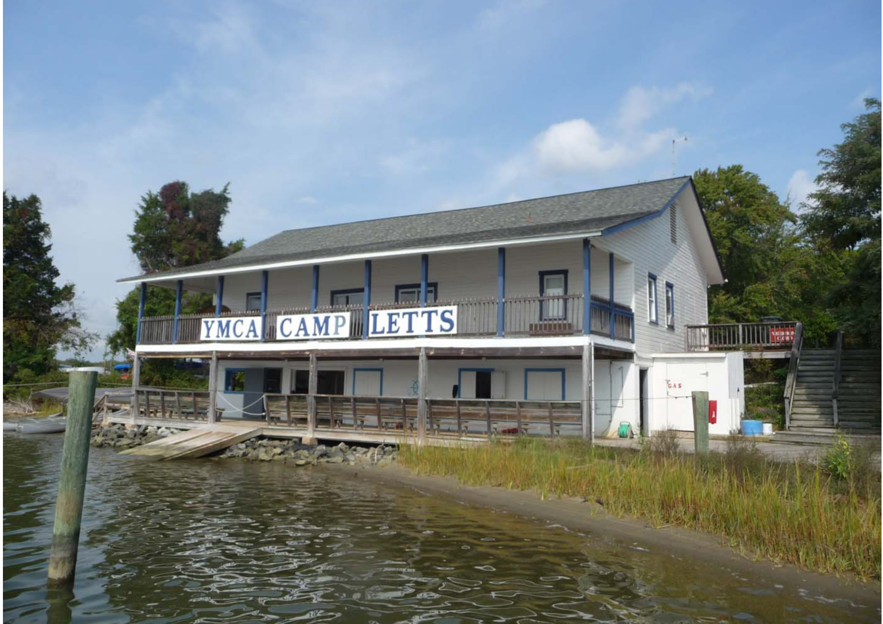
We attend the Seven Seas Cruising Assoc.GAM at Camp Letts in the Rhode River, Sept. 27-29, 2012.