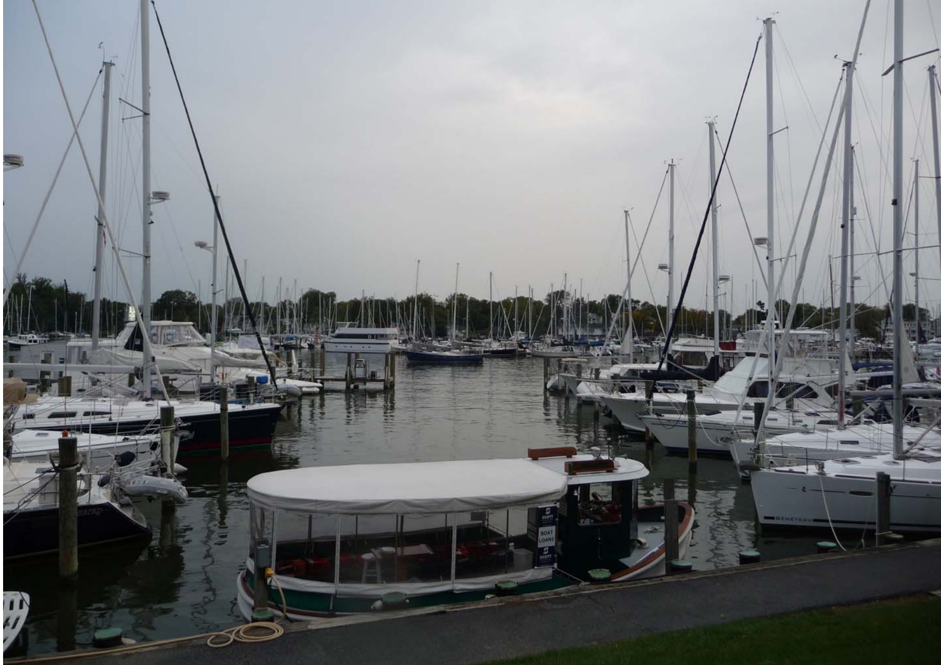
Running Free is anchored out in the middle of this picture taken from Annapolis Landings Marina.