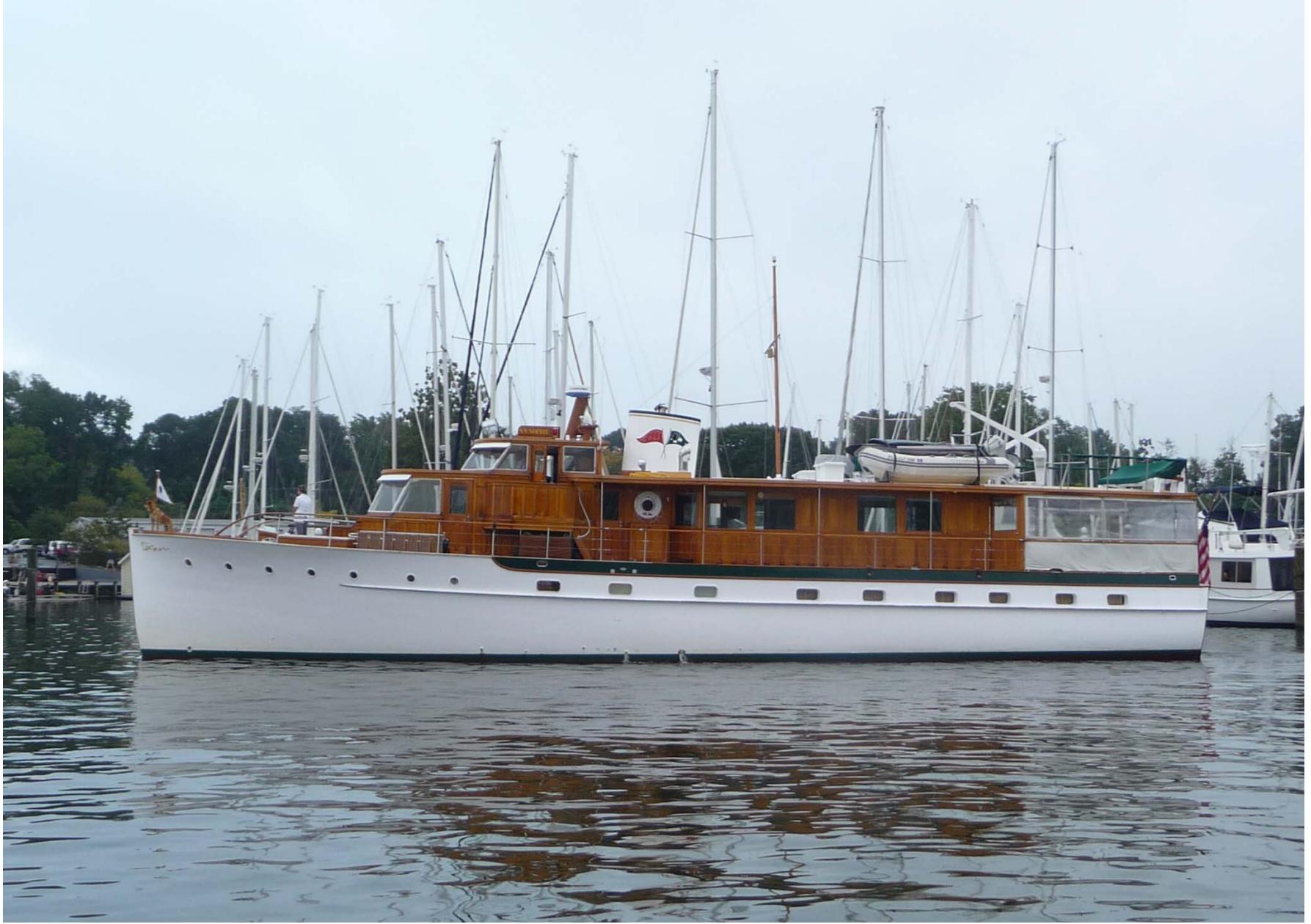
S.S. Sophie , 80' Trumpy built in 1947, owned by Fox News announcer Greta van Susteren. Docked across from us at the Annapolis Landings Marina fuel dock, Oct. 2. Gorgeous yacht.