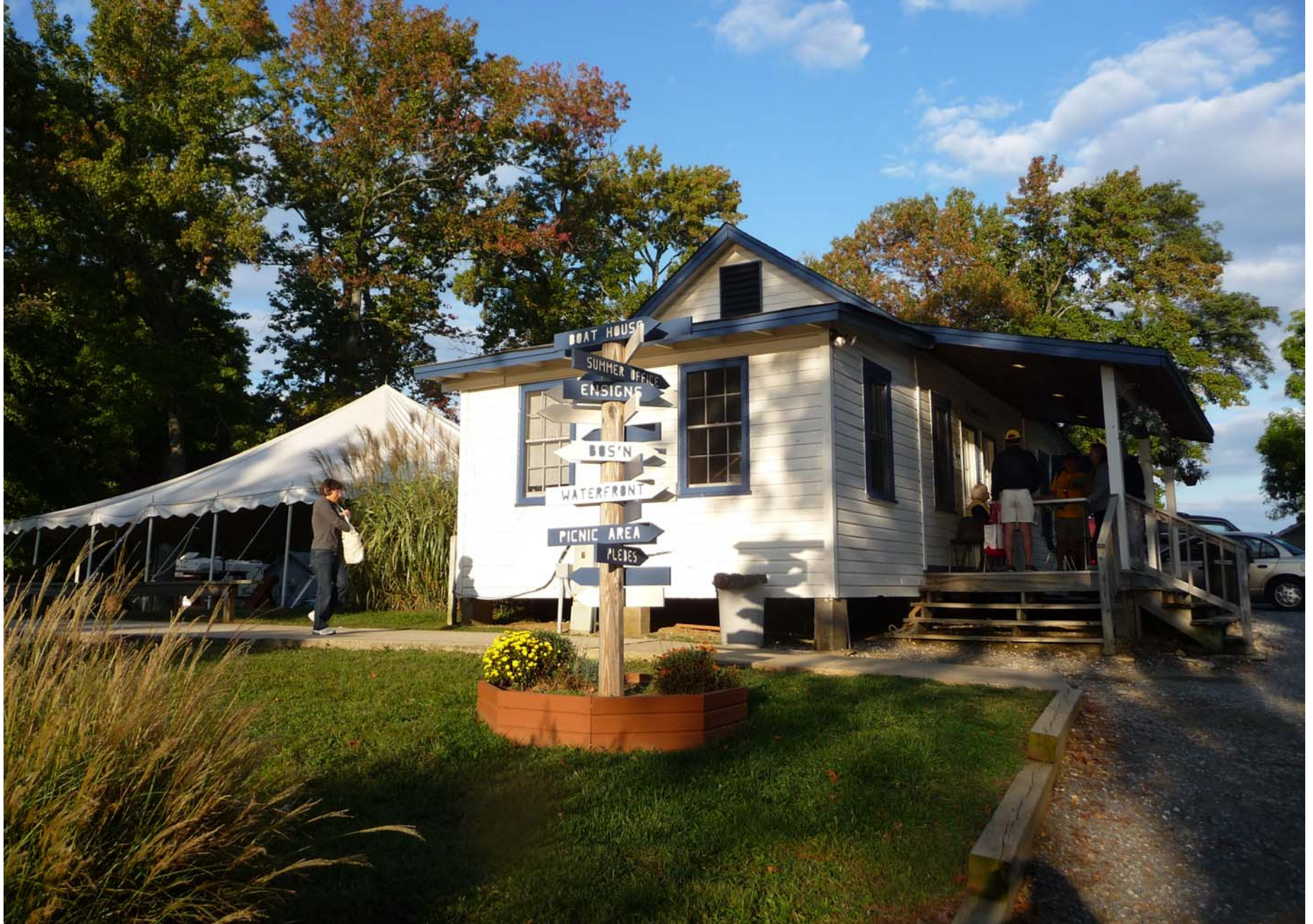
This was the GAM headquarters' building at Camp Letts.