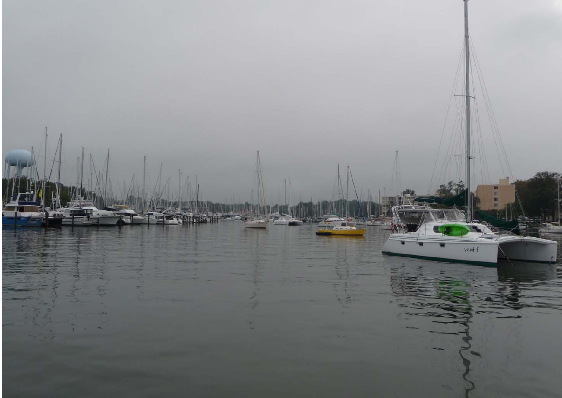
Oct. 2 was a very rainy day in Annapolis' Back Creek.