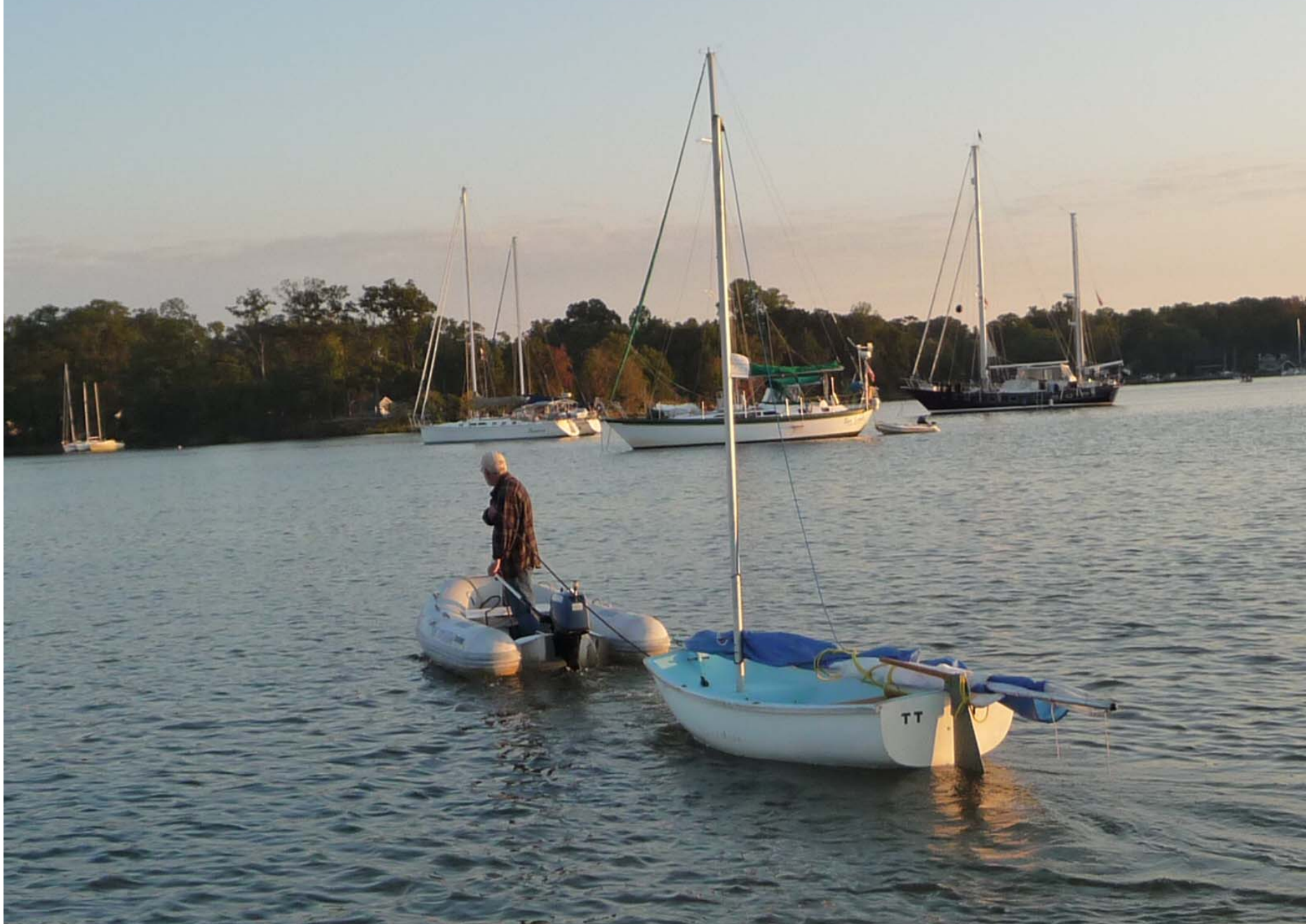
Carl tows the Whaler sailing dinghy back to the boat. It didn't sell at the flea market.