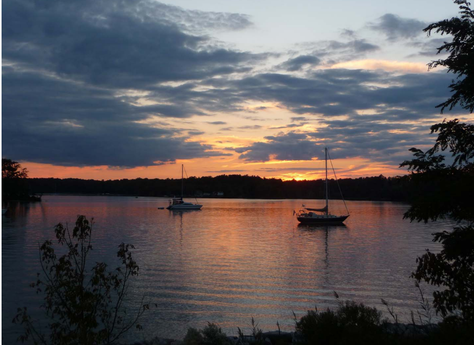
A lovely sunset on the night of the full moon.