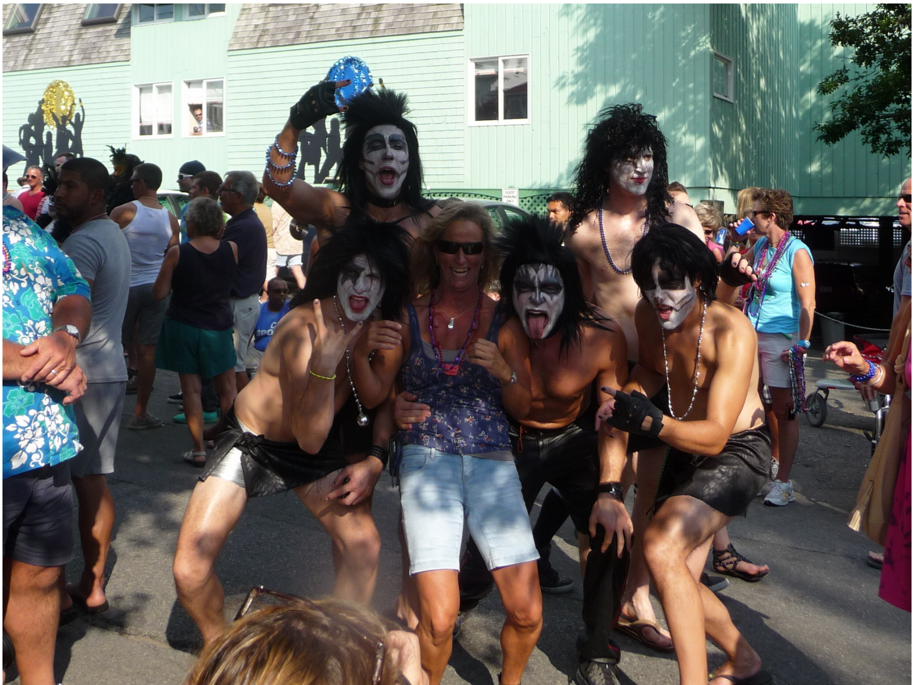
KISS wannabees in the parade.