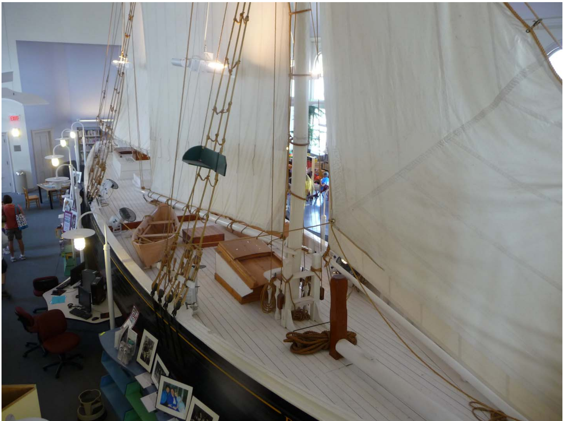
The Provincetown library's 60 foot model of the schooner Dorothea Rose .