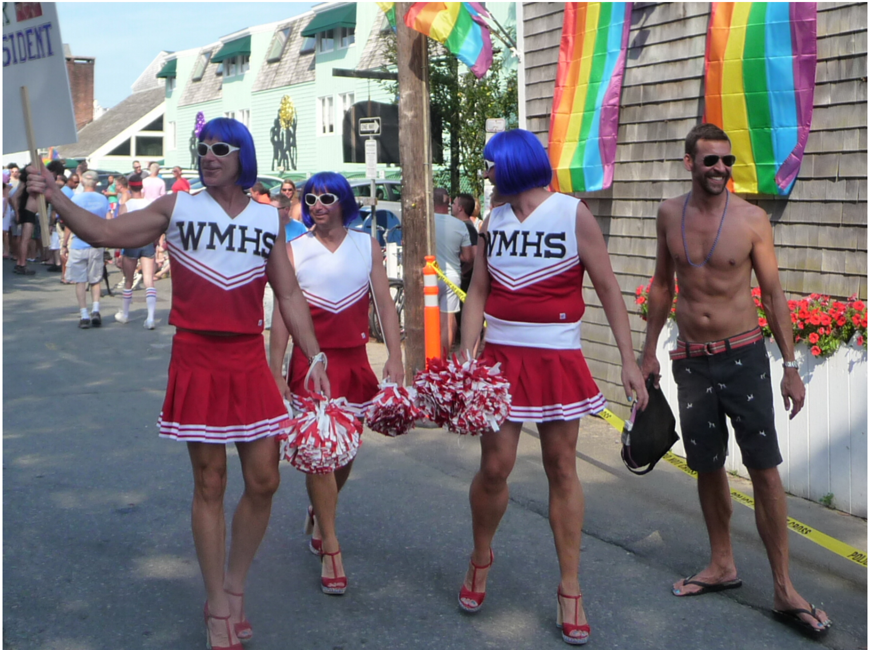
A cheerleading squad.