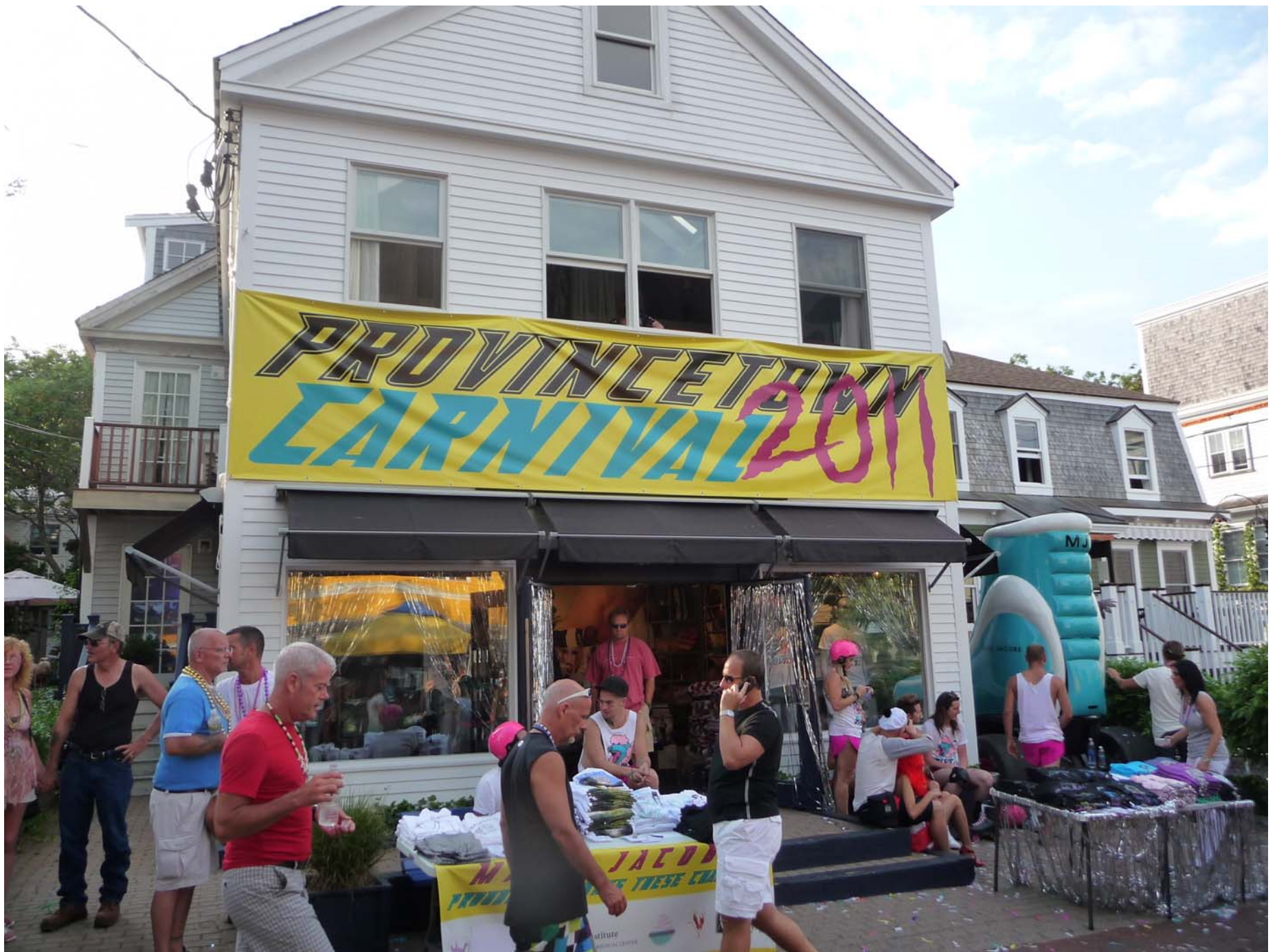
We see the Provincetown Mardi Gras parade which was zany & fun.