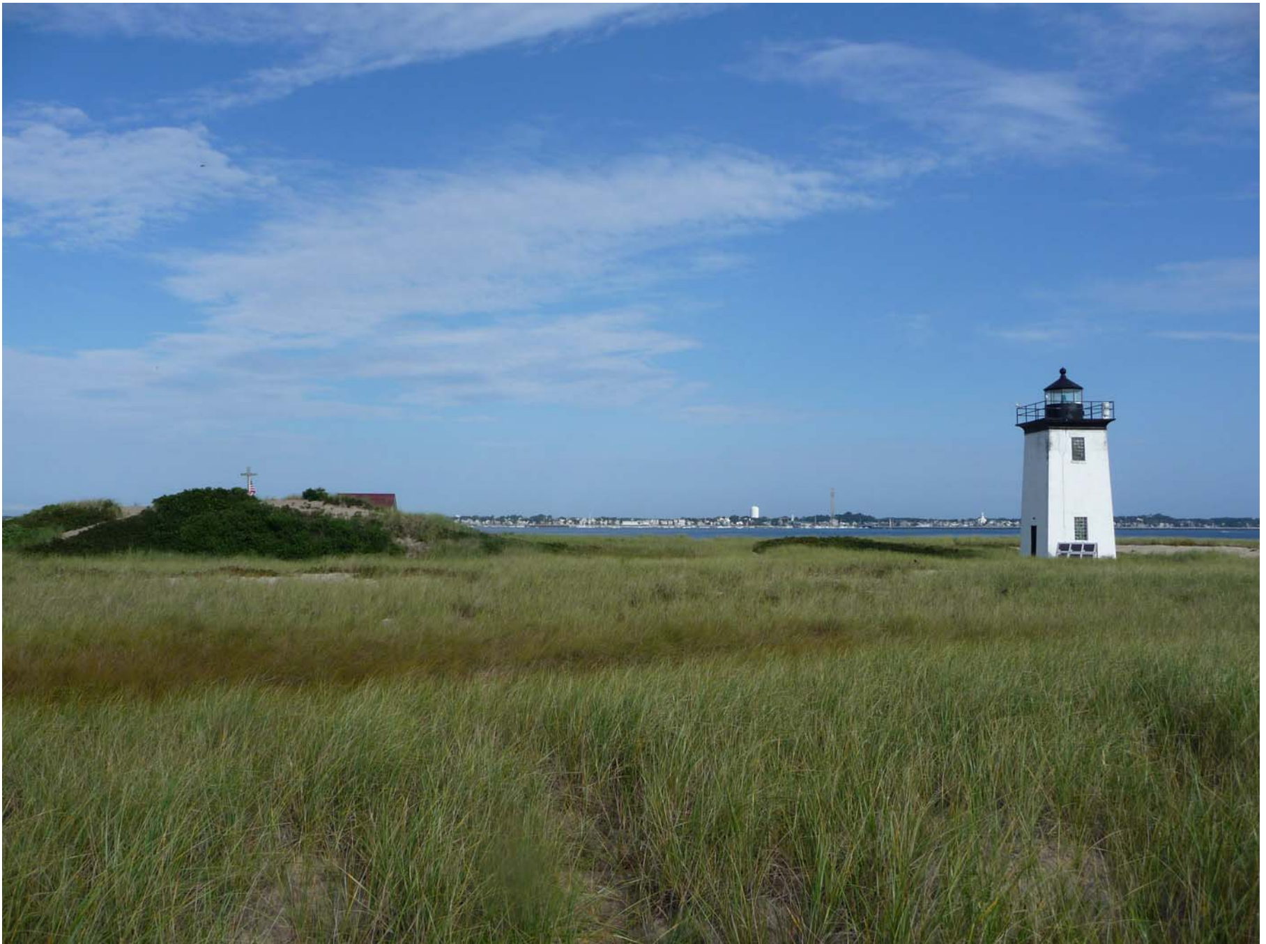
Beach grass & lighthouse with Provincetown in the distance.