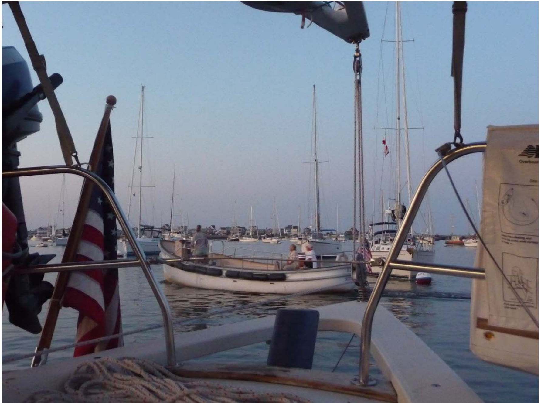
The Scituate water taxi bringing people to their boats on moorings.