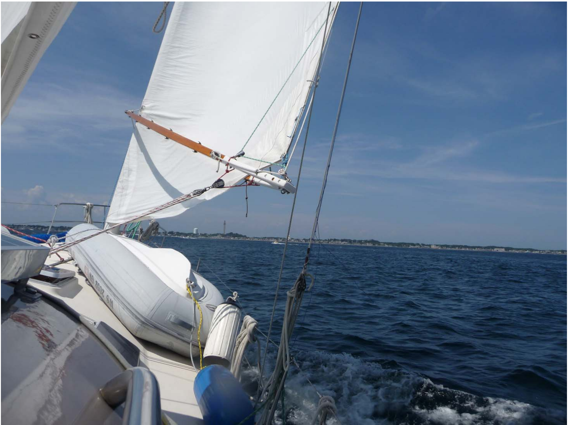
We sailed almost the whole way to Provincetown. Fun.