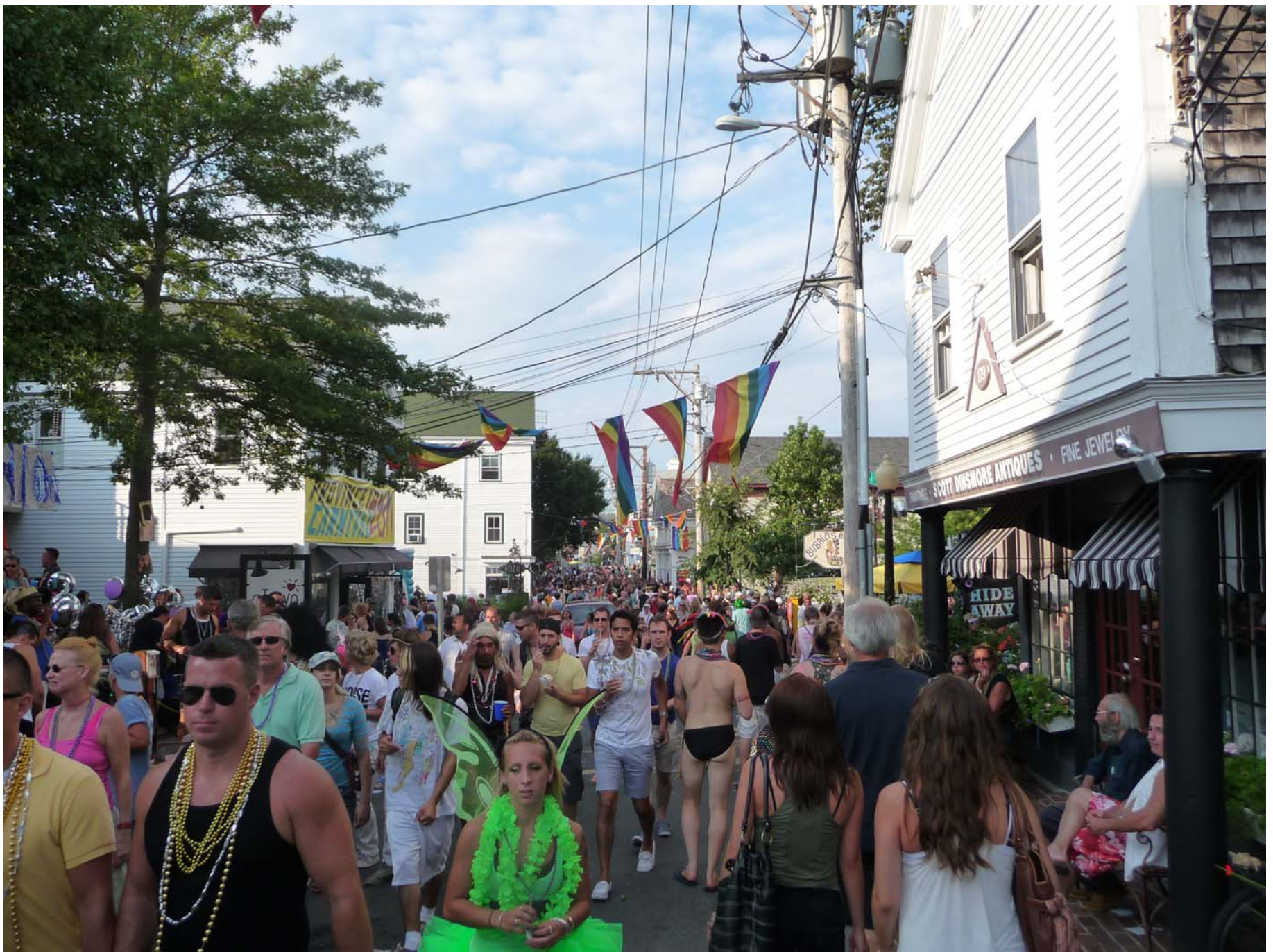
Just a few people come to see the Mardi Gras parade in Provincetown.