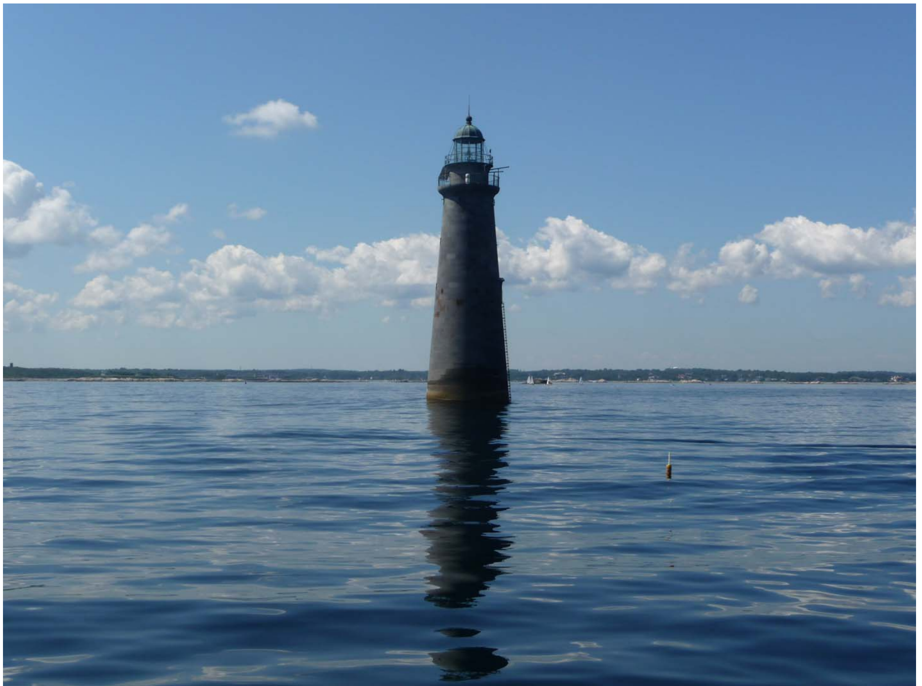
Minot's Lighthouse right in the water on the way to Scituate after leaving Boston.