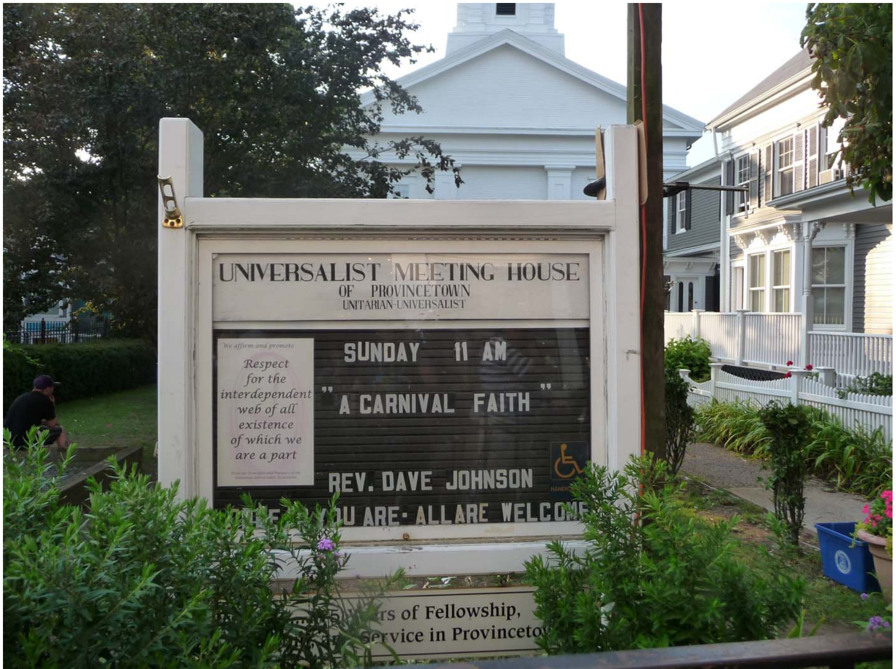
Joyce is happy to see a UU church (the only church) in Provincetown.