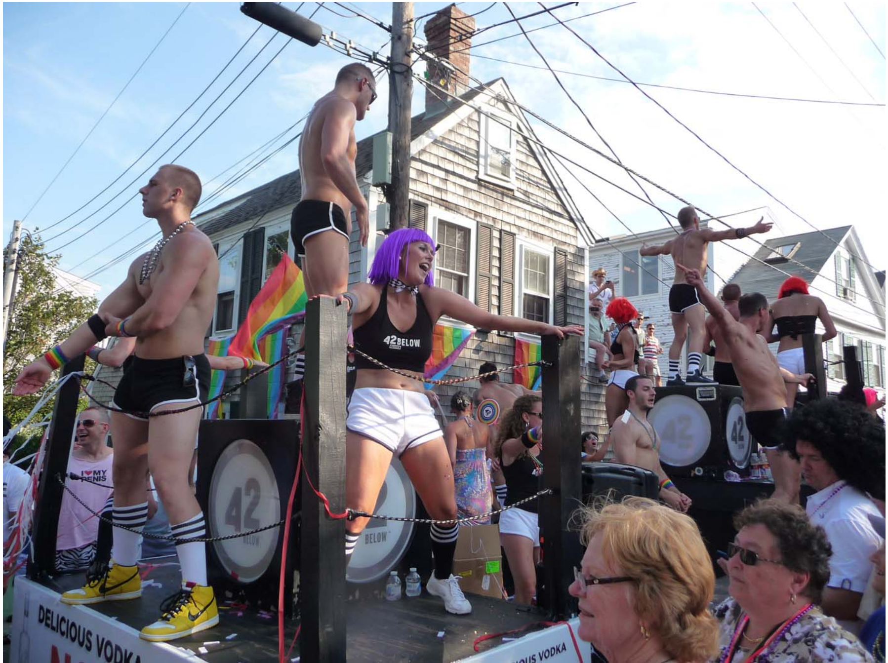
Some good dancing on this float.