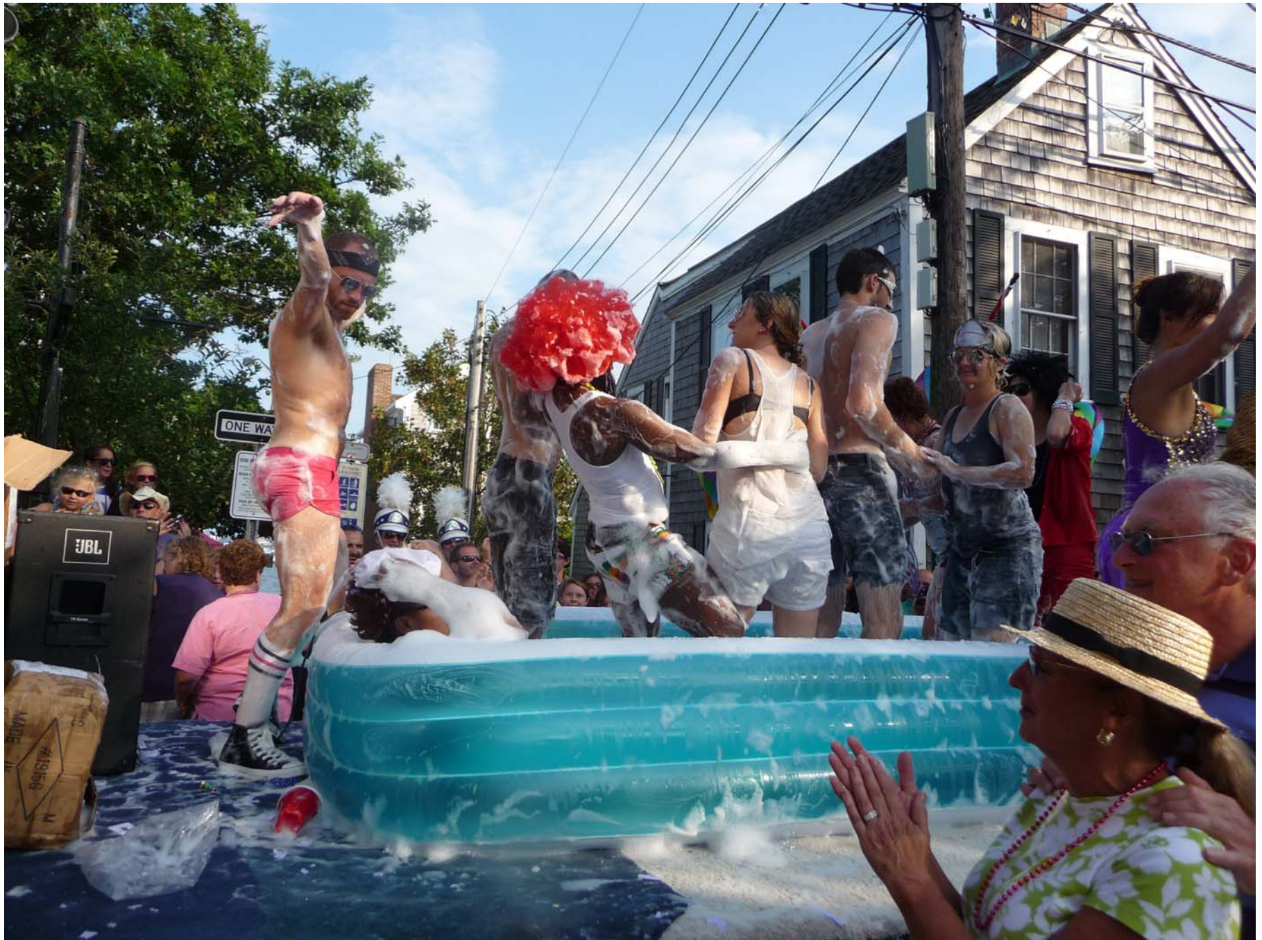
What fun with bubbles!