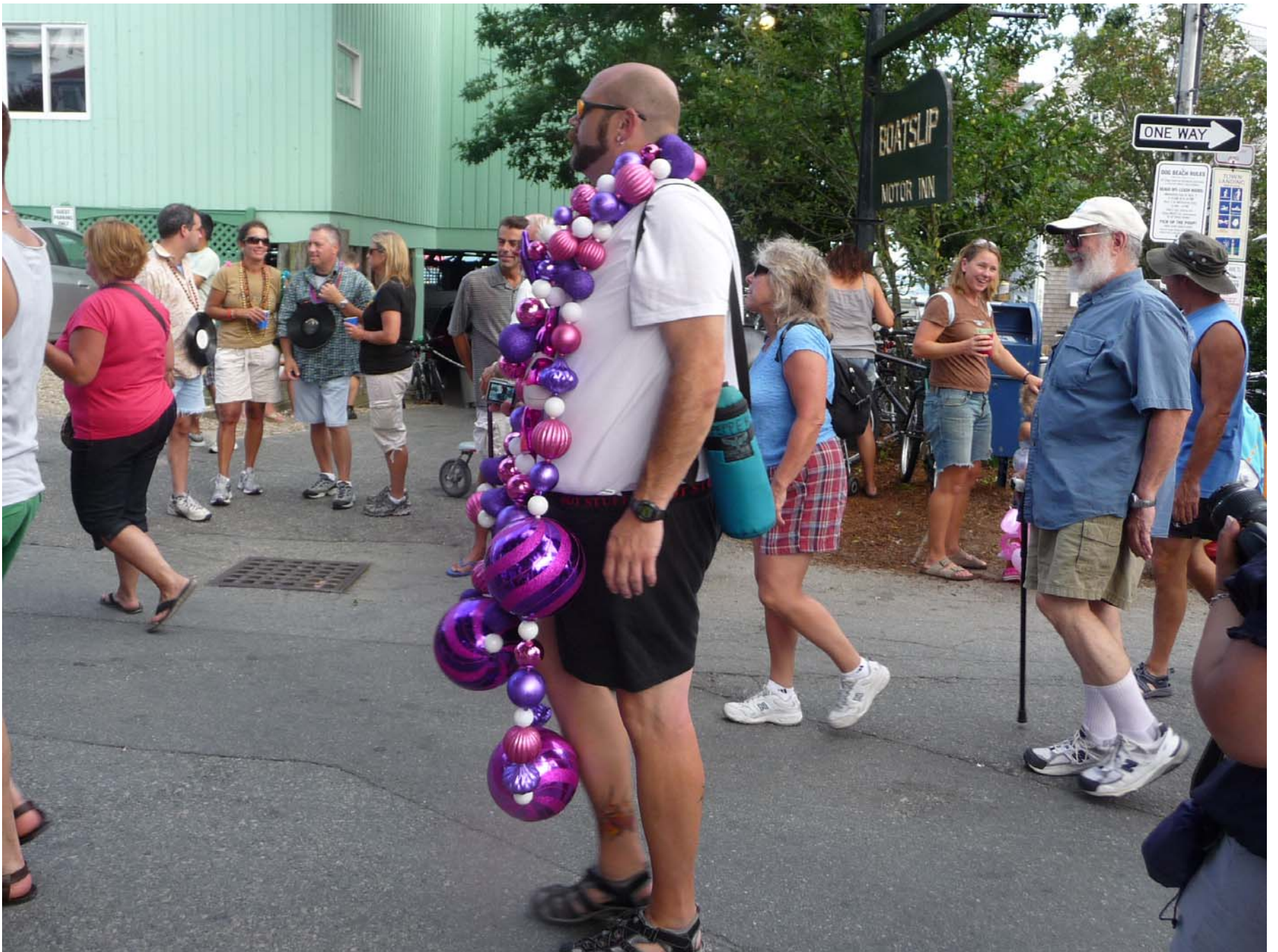
A guy and his big balls.