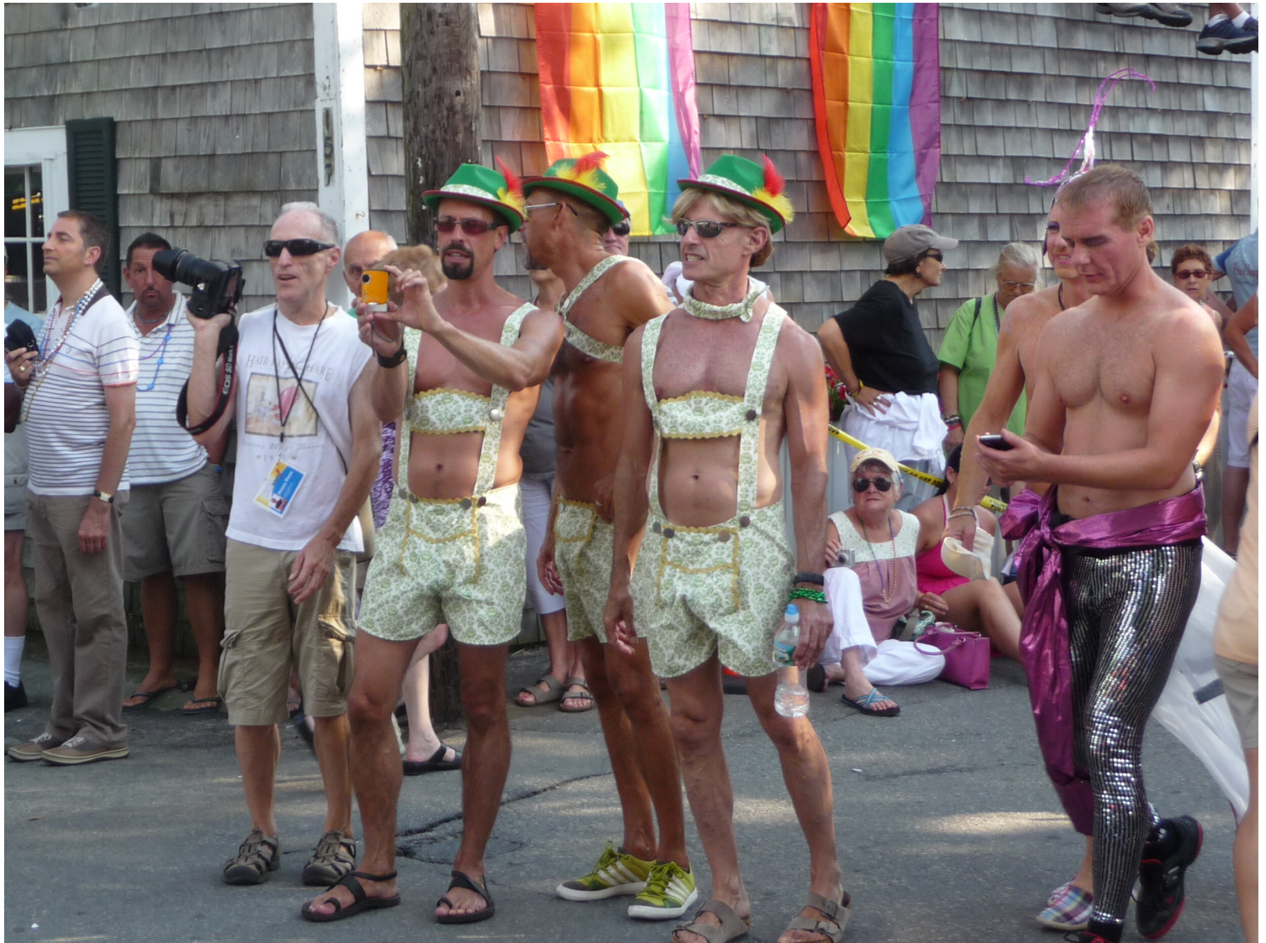
The Sound of Music guys.