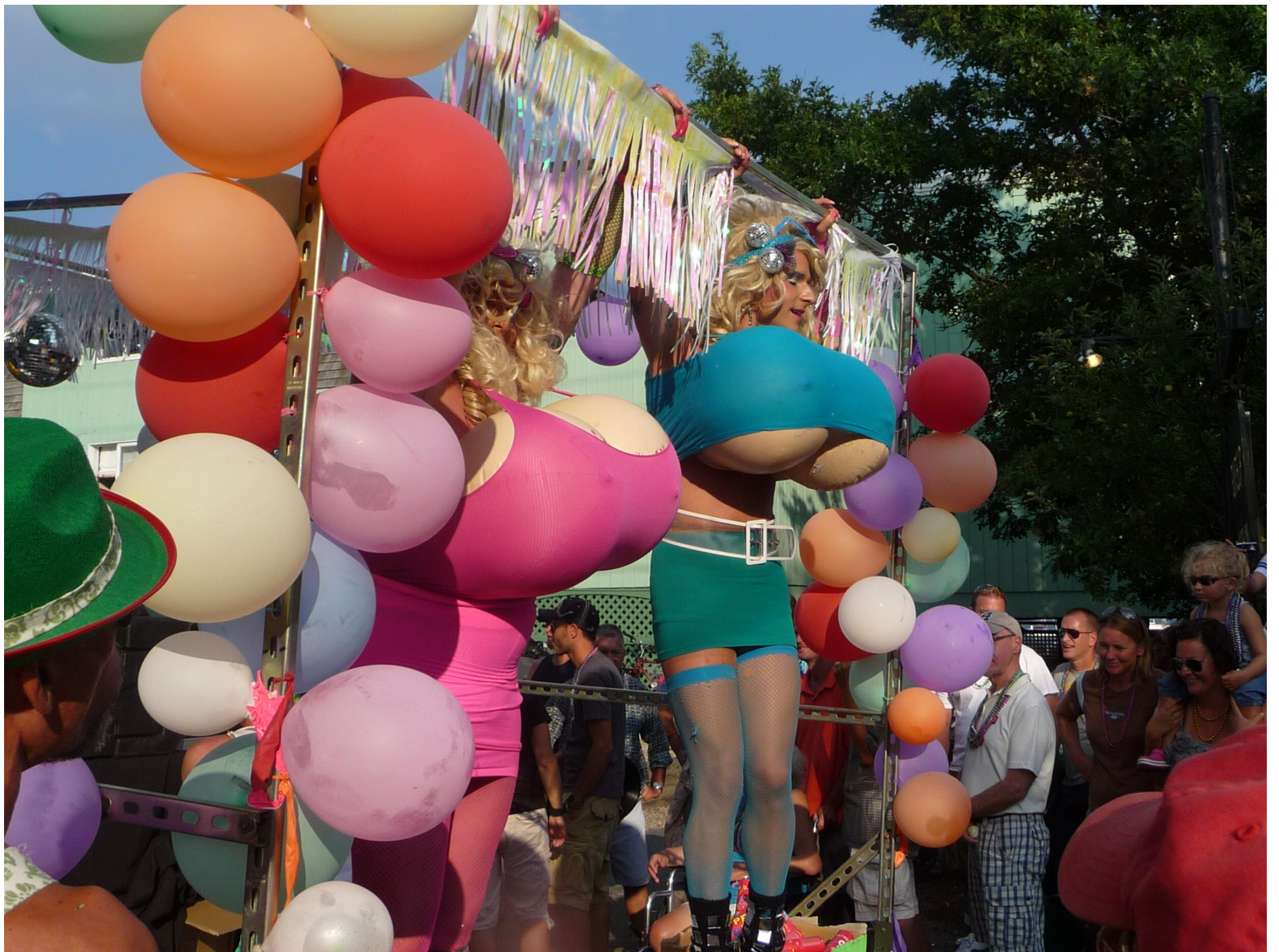
Big boobs were represented.