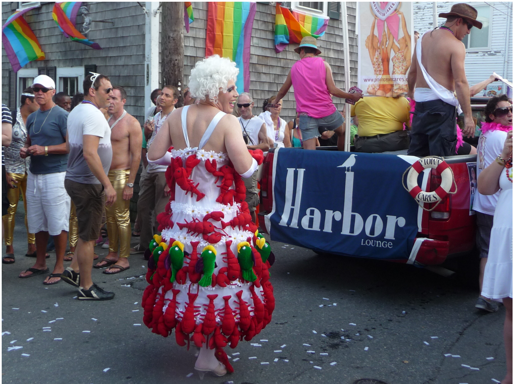
A lobster dress.