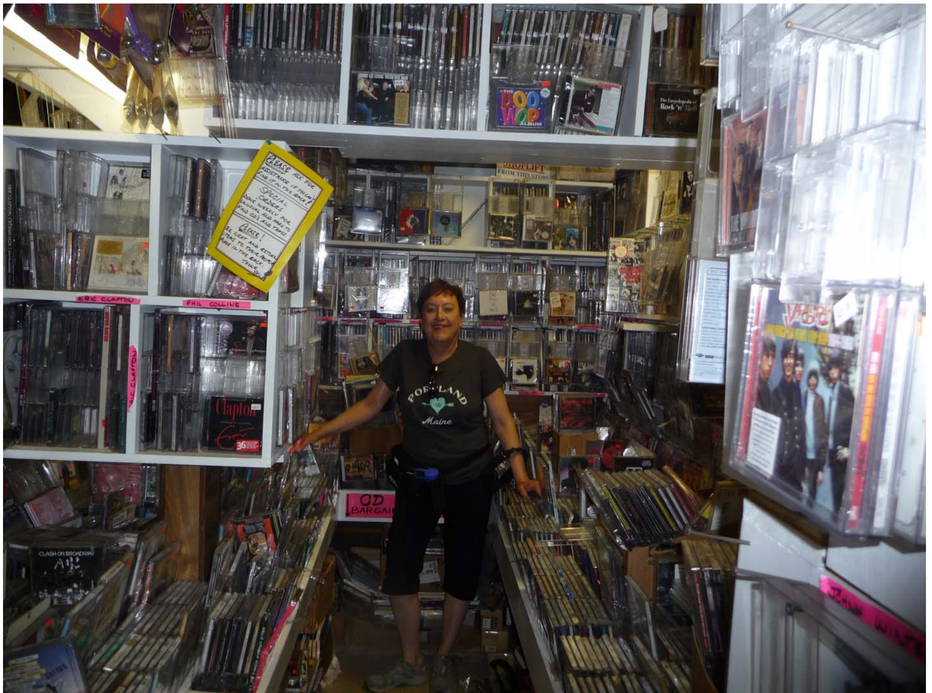
A music store extraordinaire in Scituate packed to the gills with music & instruments.