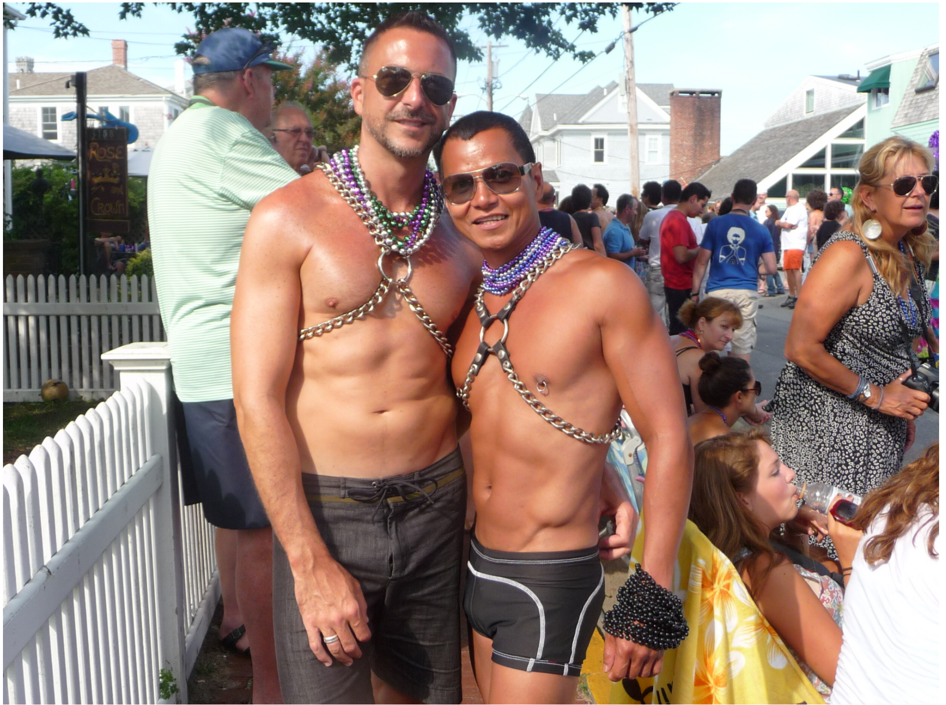
Two guys from Milwaukee.