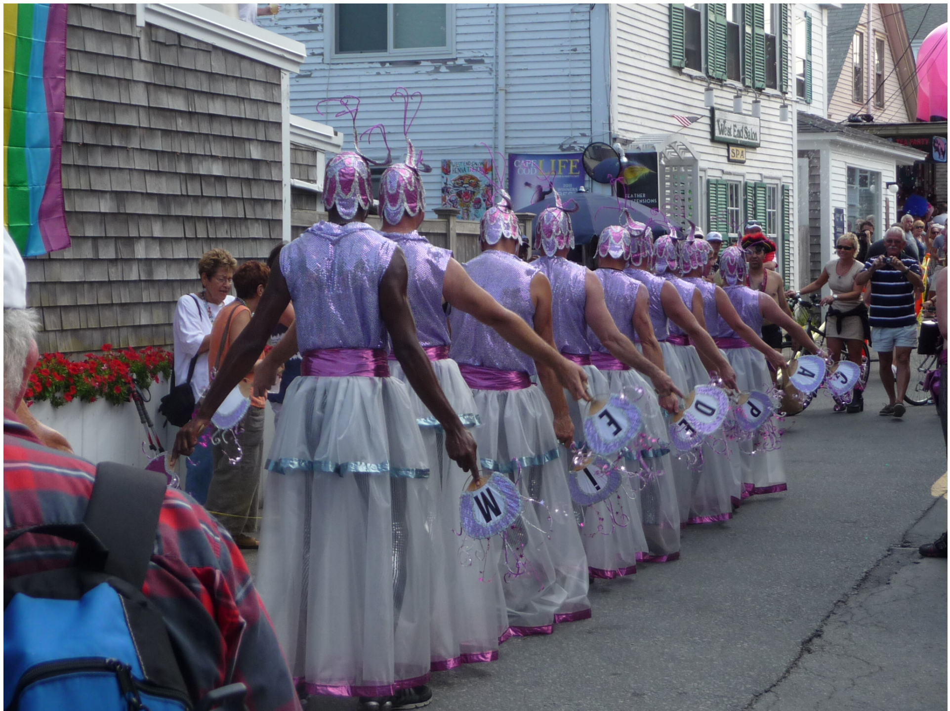
A wonderfully choreographed “Carpe Diem” group.