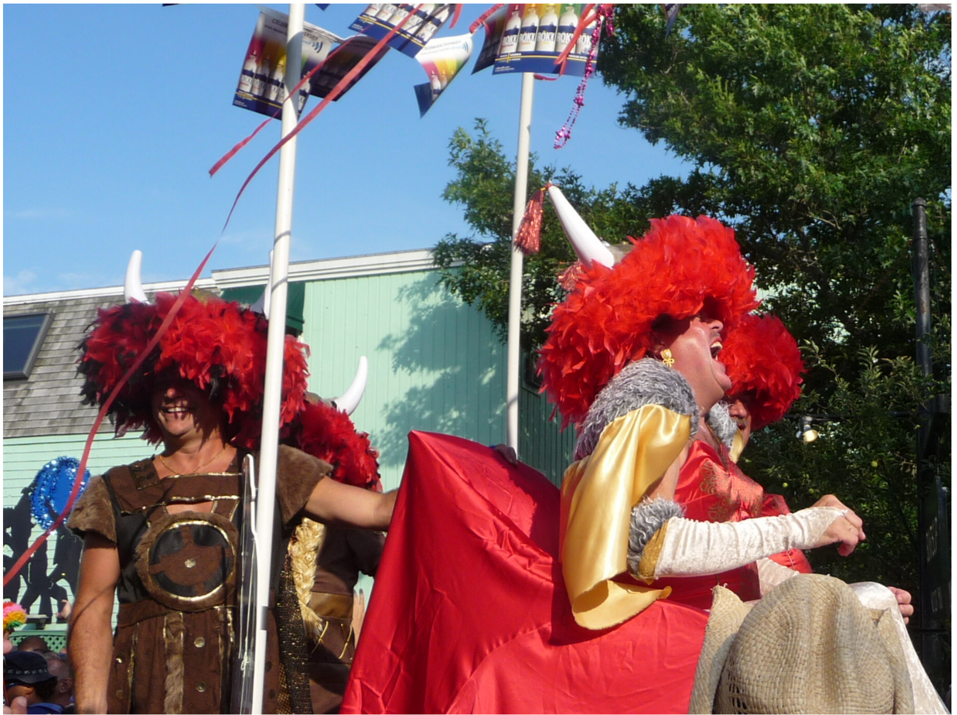
Not sure what this is but they were sure having fun.