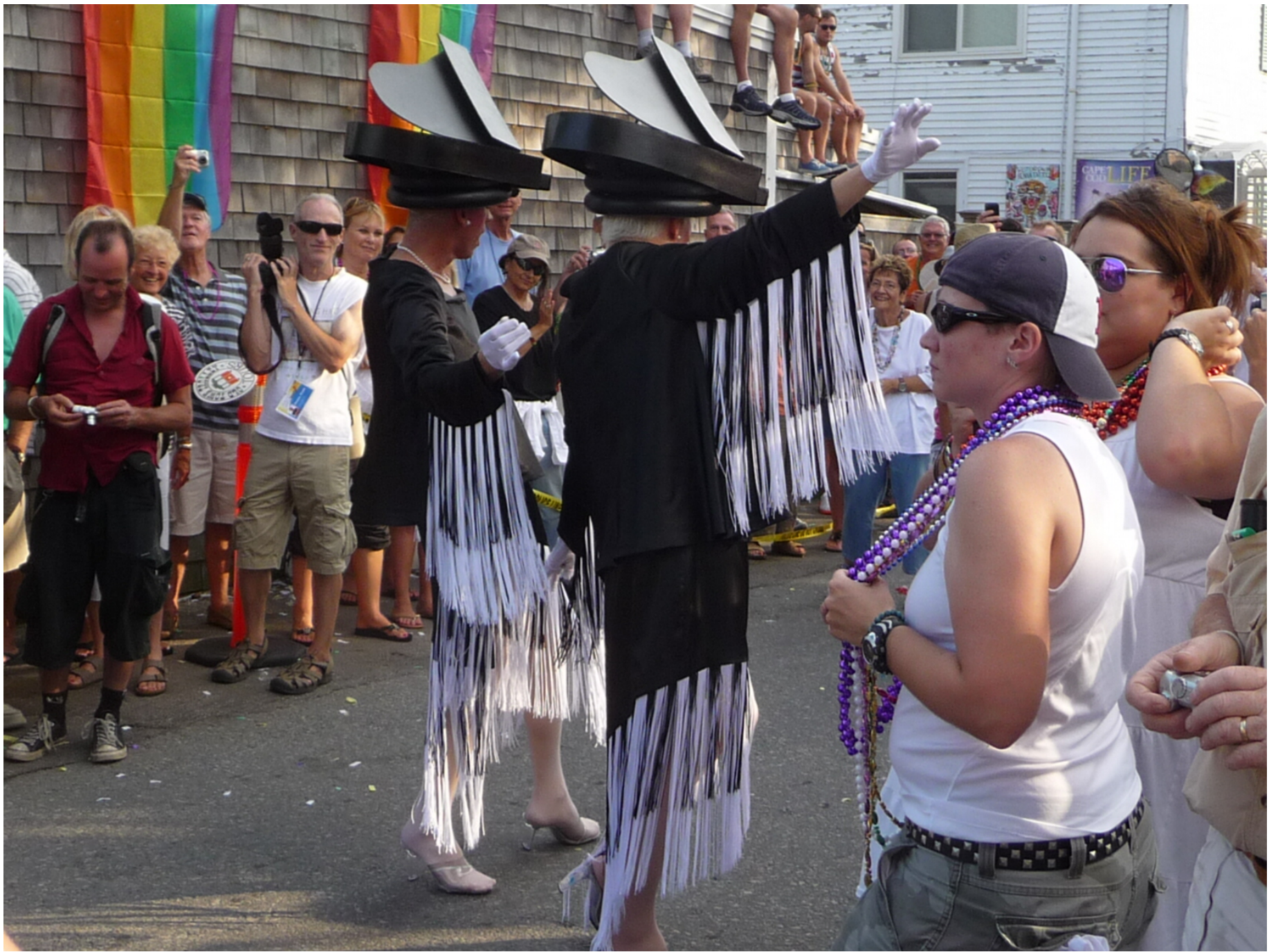
Piano hats & dresses.