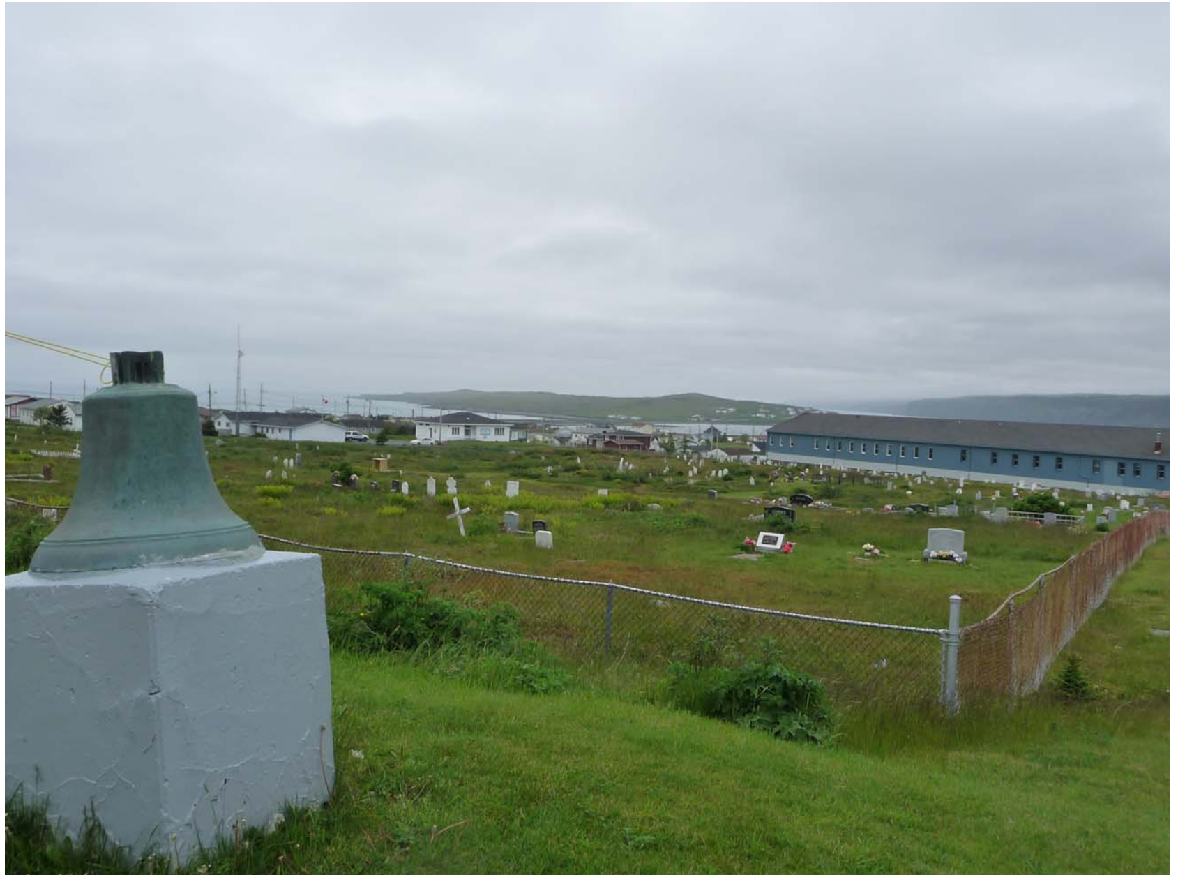
The old cemetery in Trepassey with the school off to the right.