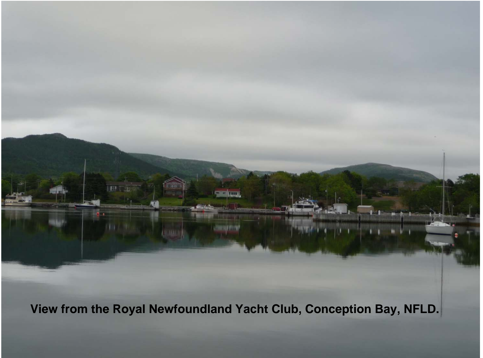
View from the Royal Newfoundland Yacht Club, Conception Bay, NFLD.