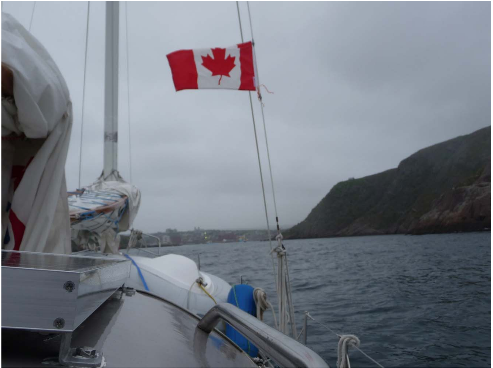
We arrive in St. John's Harbor, June 28, 2011, from Conception Bay.