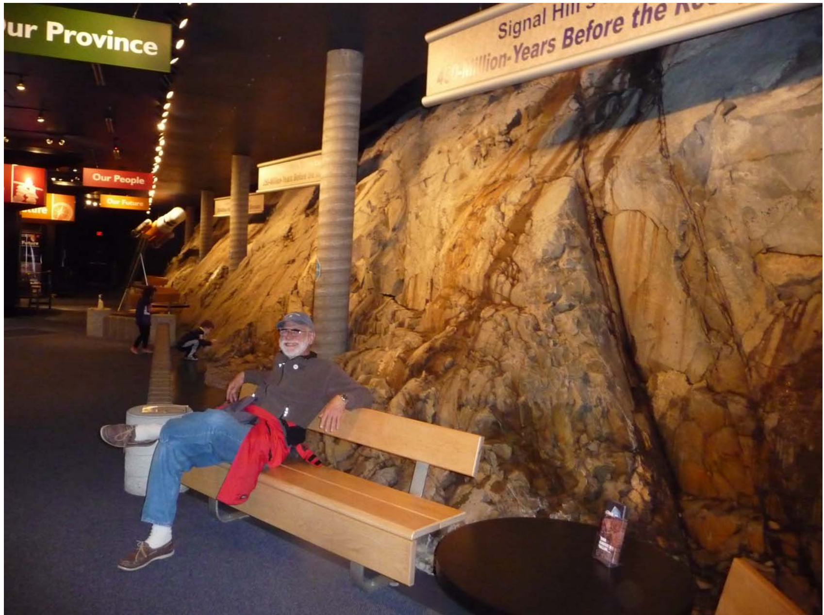
The Geo Center is built right into the rock.