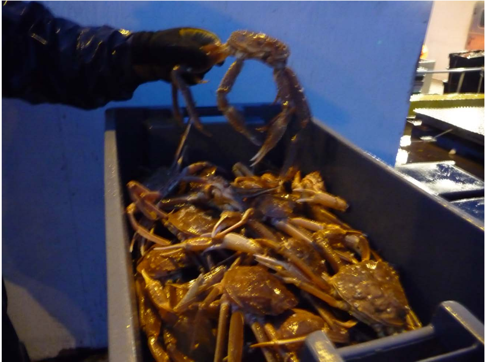
13,000 lbs. of snow crab got unloaded next to our boat late at night in the pouring rain.