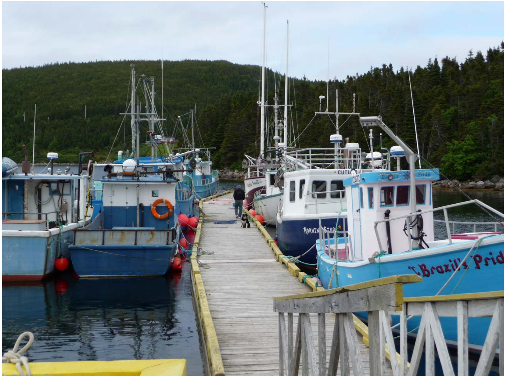
Carl walking to the boat in Fermeuse harbor.