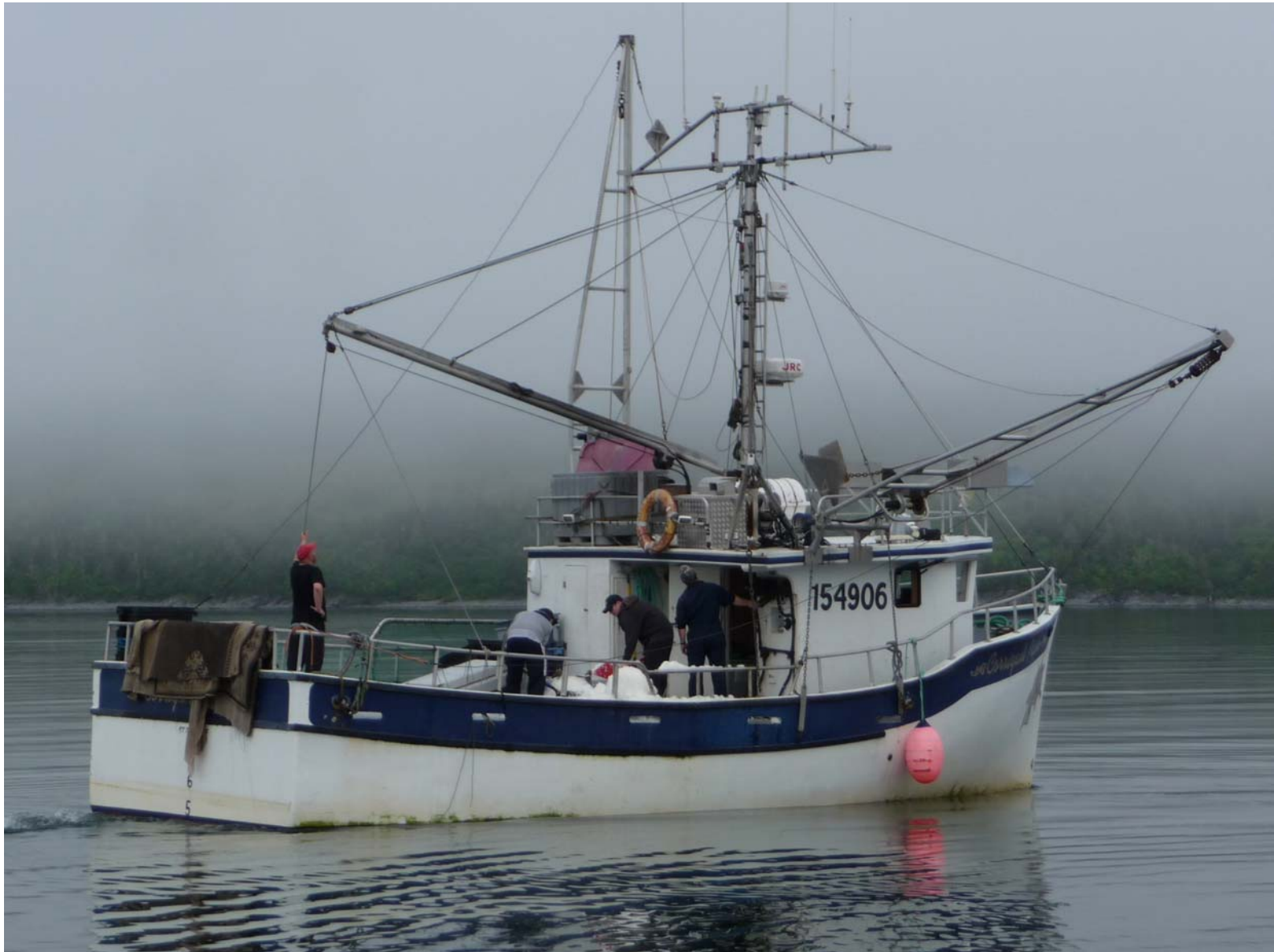
A crab boat leaving Trepassey. Shoveling ice down the hold.