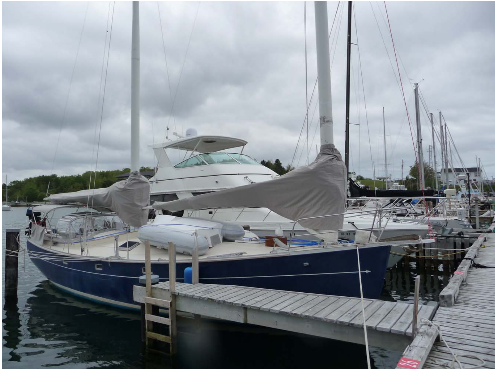
RF is back in full sailing trim after getting the mainsail repaired.