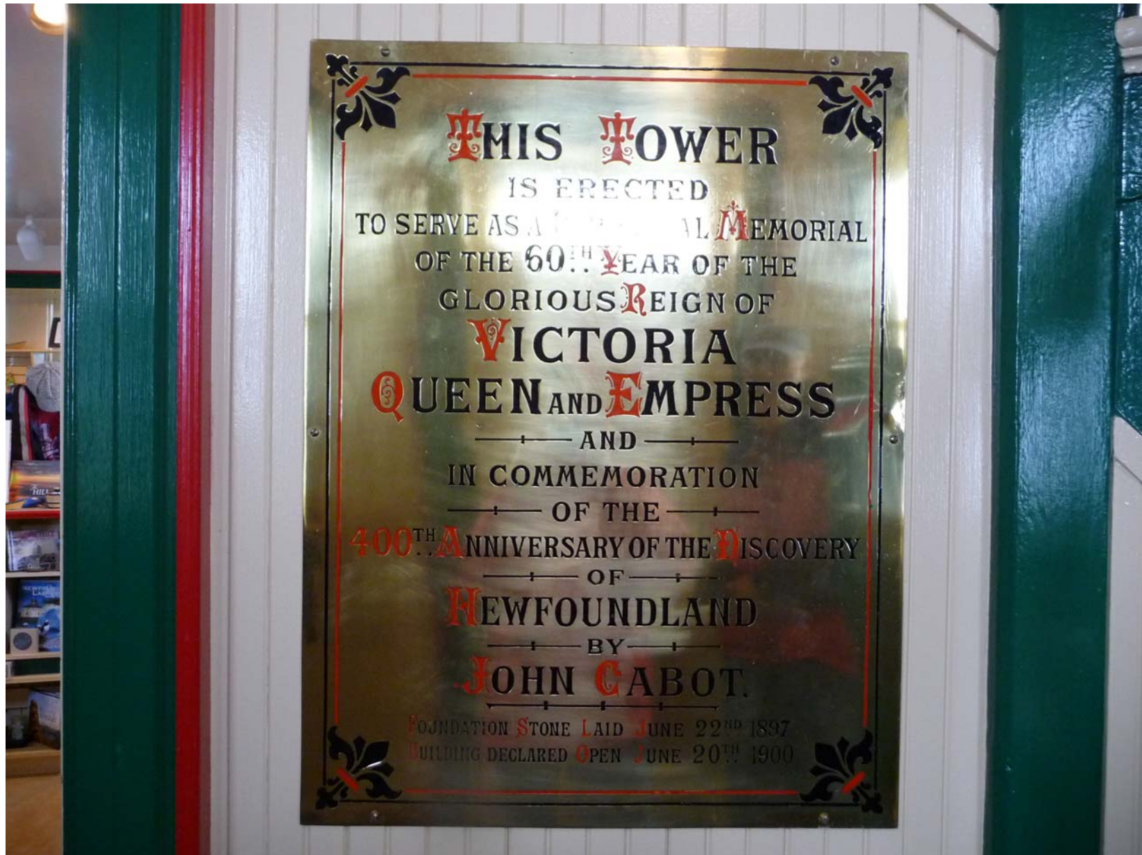
Historic inscription located in the Signal Hill tower.