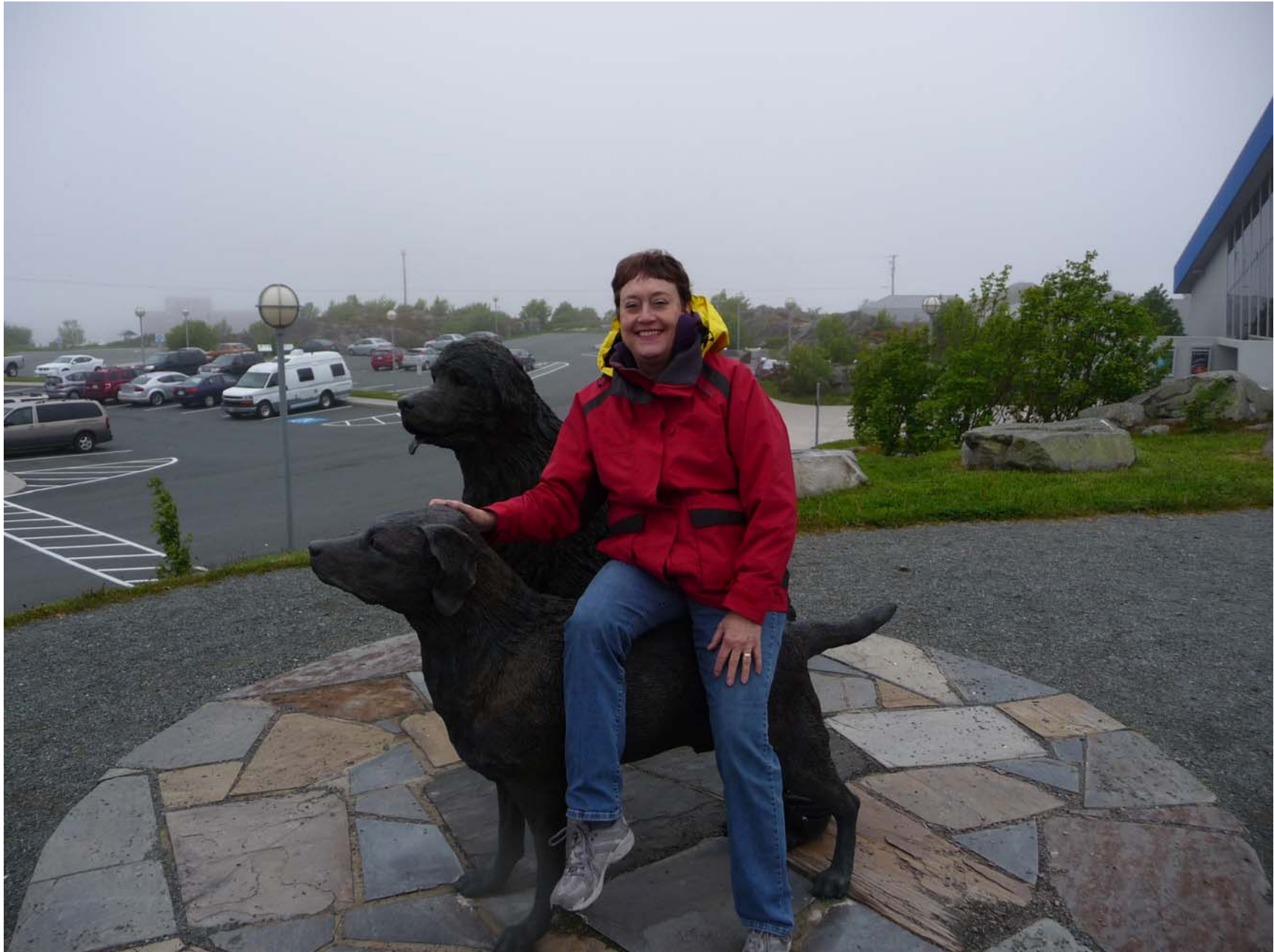
In front of the informative Geo Center by Signal Hill.