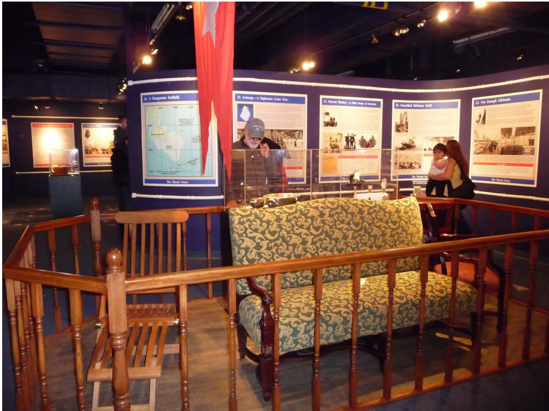
Carl observes the Titanic furniture in part of the exhibit.