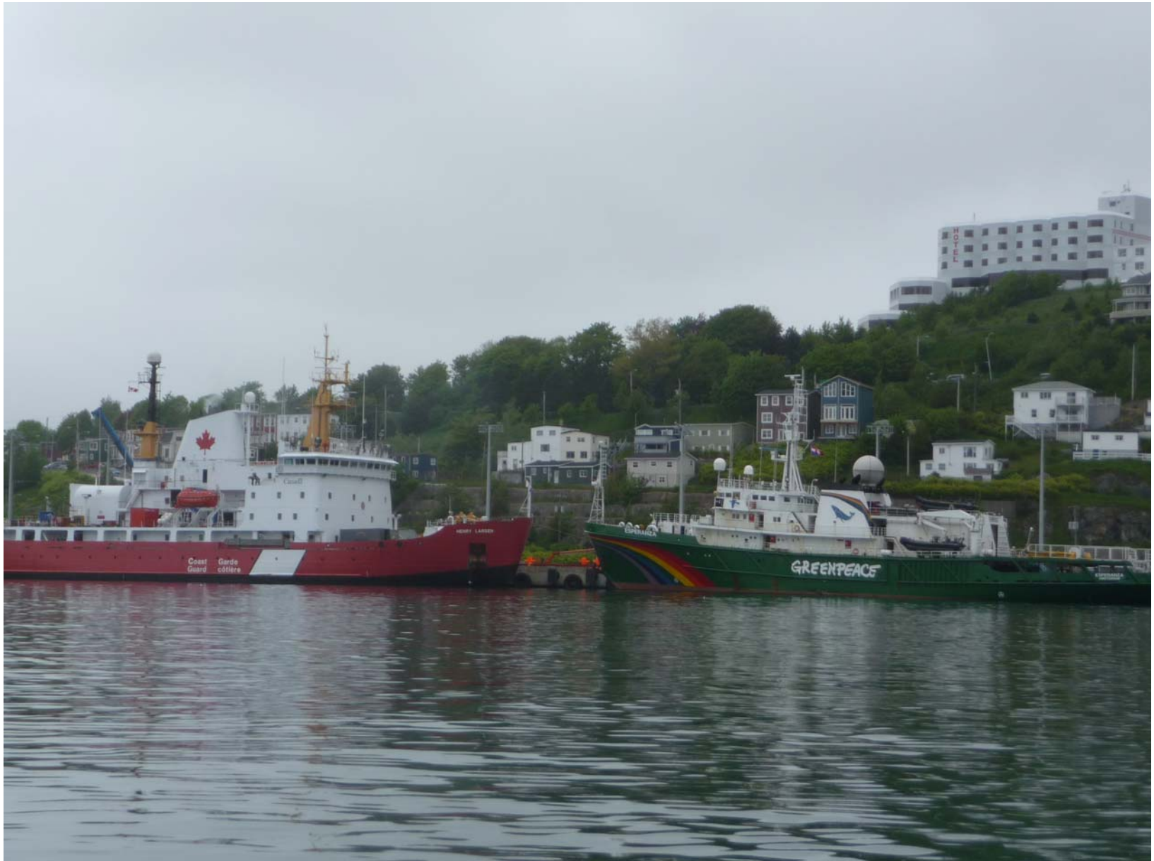
The famous Greenpeace ship by the Coast Guard ship.