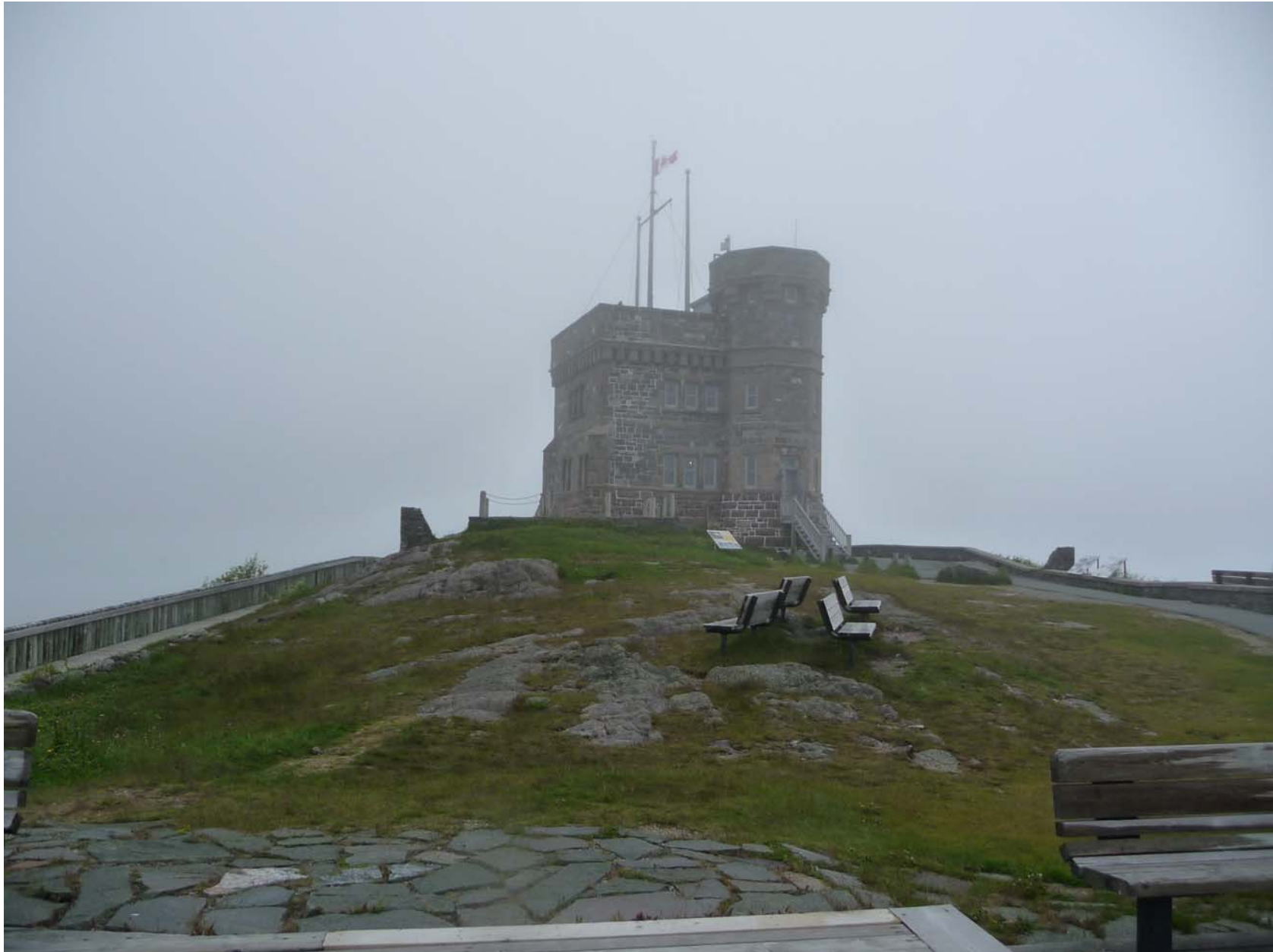
St. John's historic Signal Hill above entrance to the harbor.