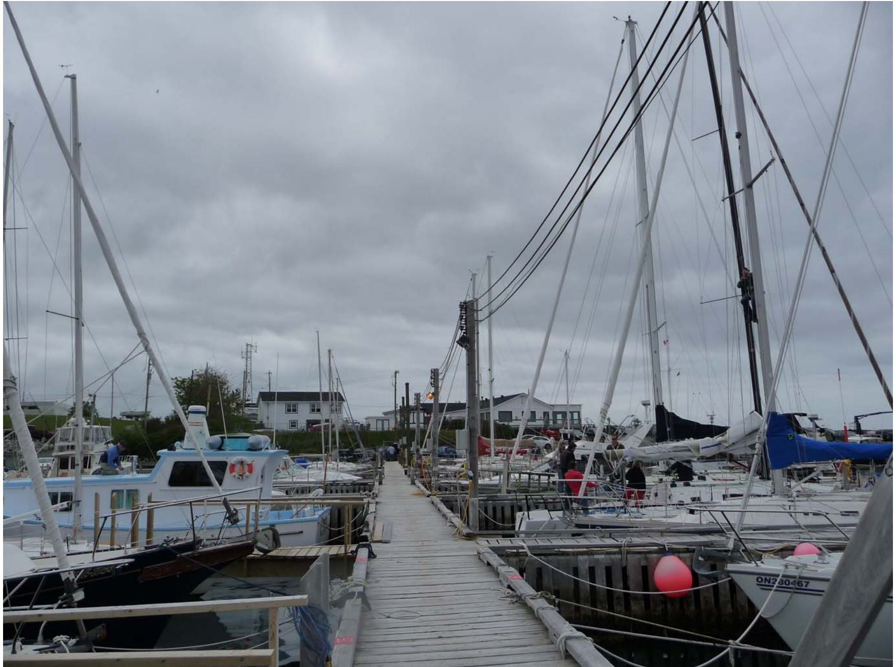
Royal Newfoundland Yacht Club