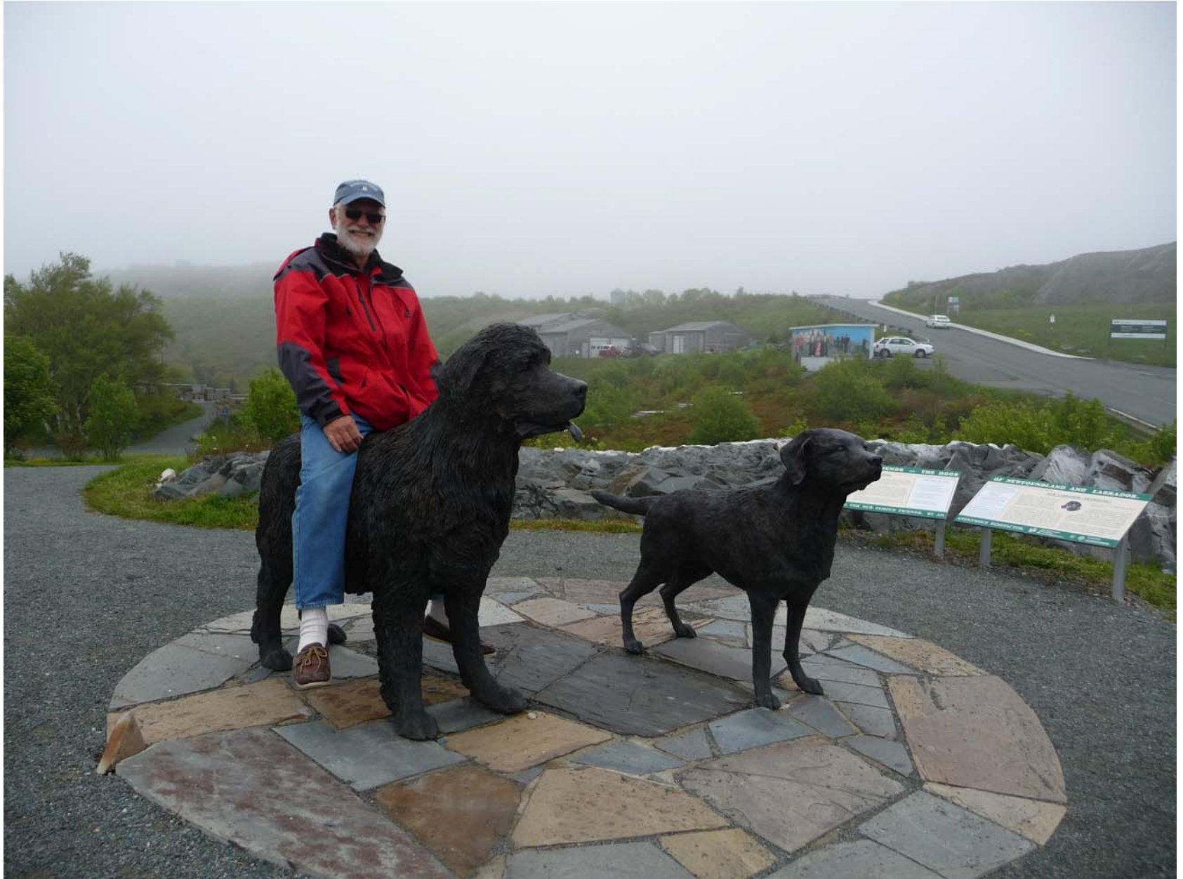
The Laborador & Newfoundland dogs are immortalized in bronze.