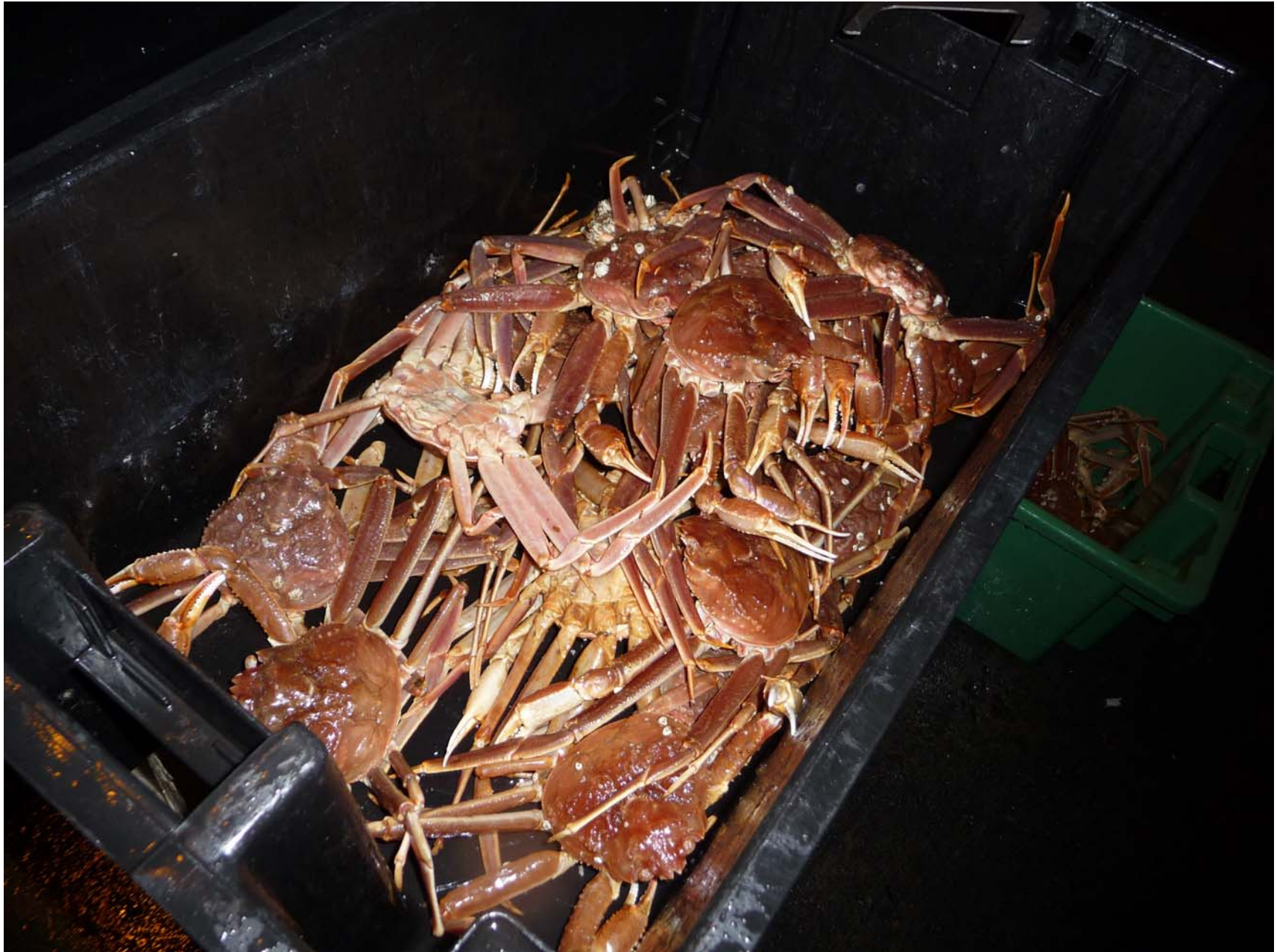
One of many bins full of snow crabs most going to the Japanese.