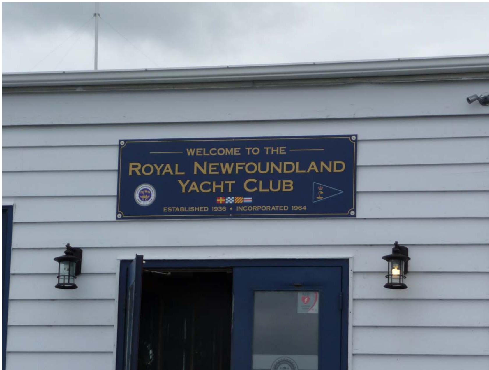
This is Running Free's home in Conception Bay.