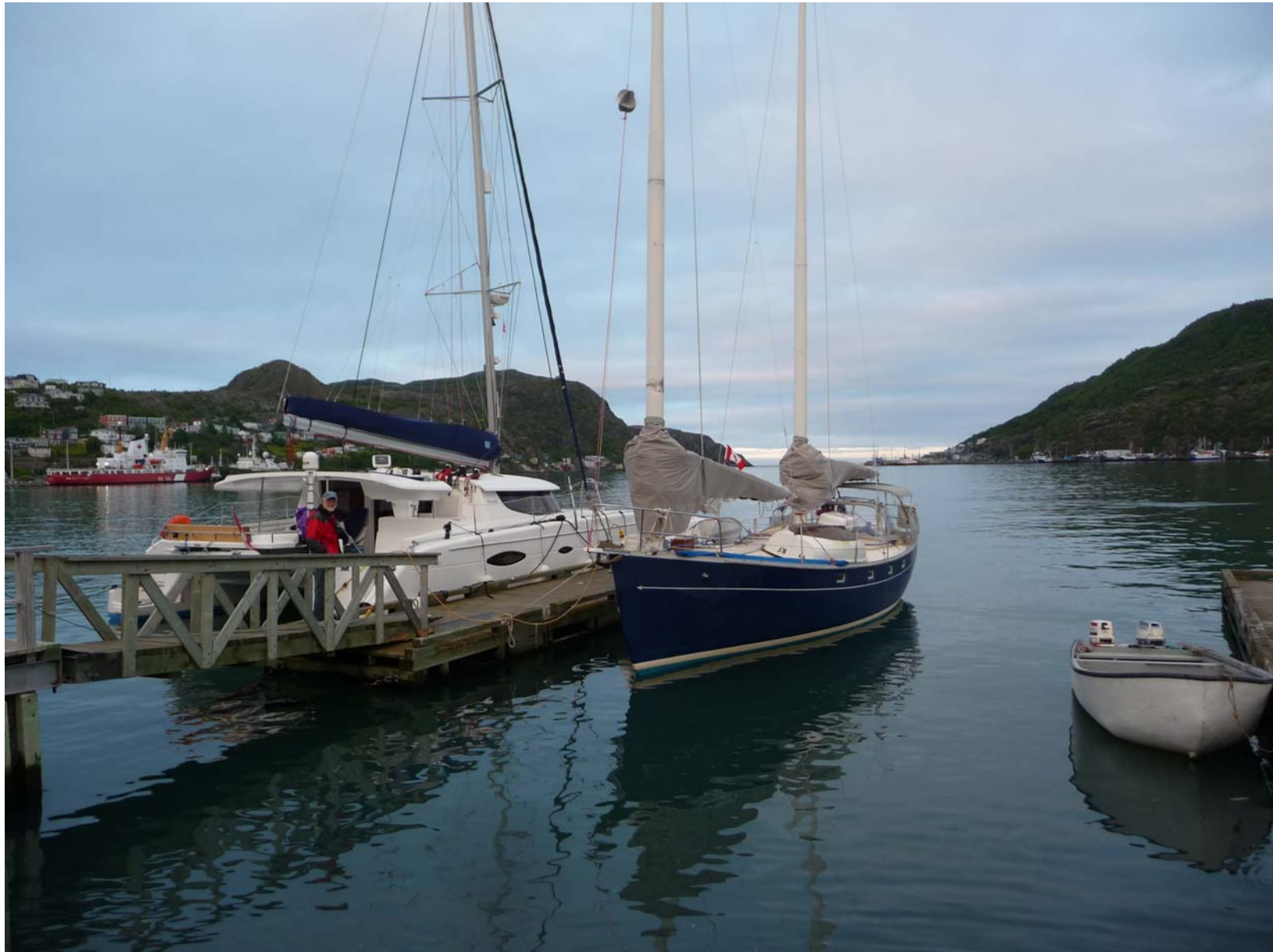
Running Free tied up in St. John's harbor on the floating docks.