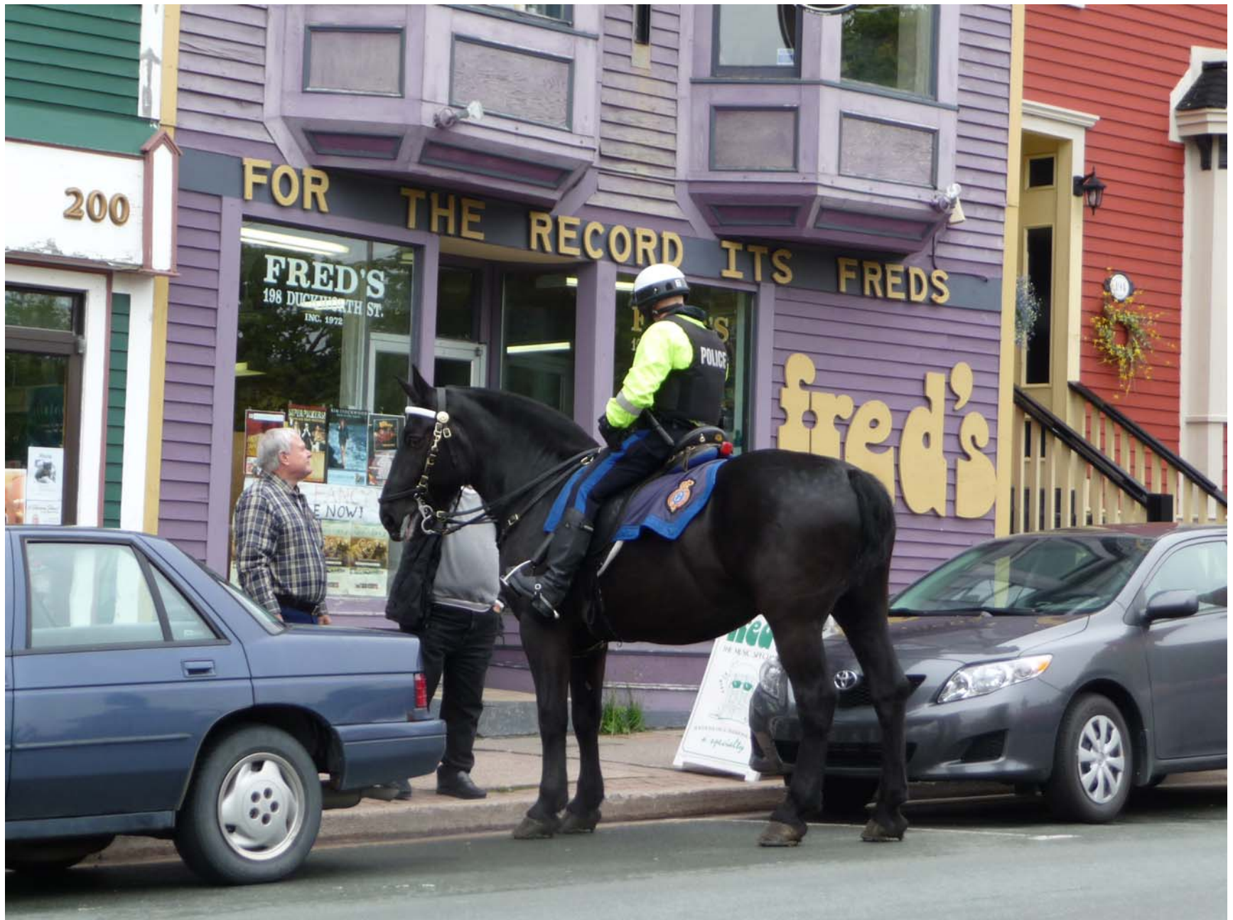
Policeman on percheron horse in front of Fred's Record Store in St. John's.