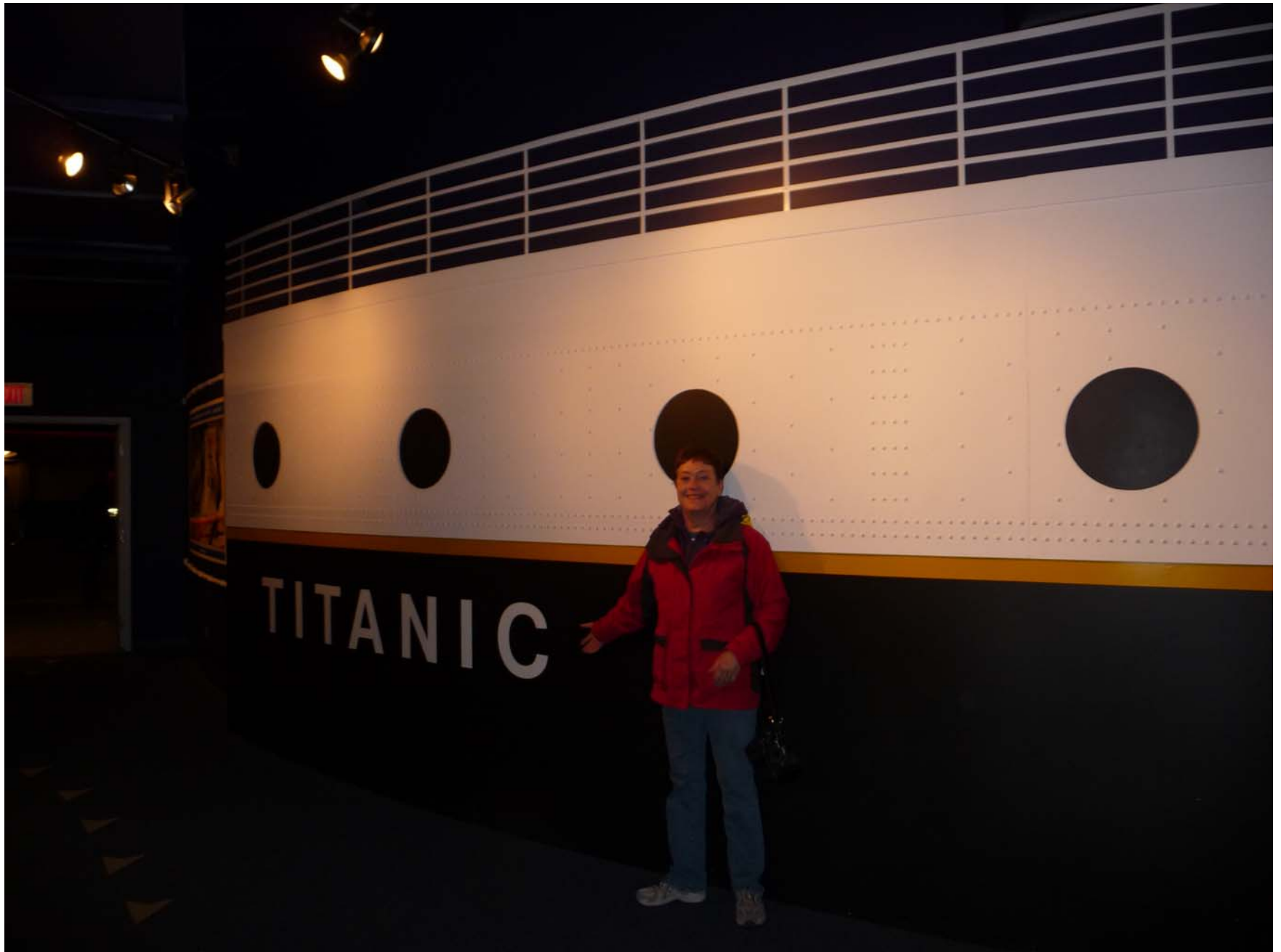
The Titanic Exhibit within the Geo Center.