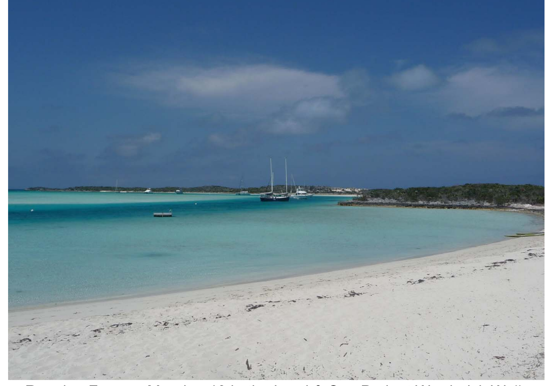
Running Free on Mooring 13 in the Land & Sea Park at Warderick Wells.