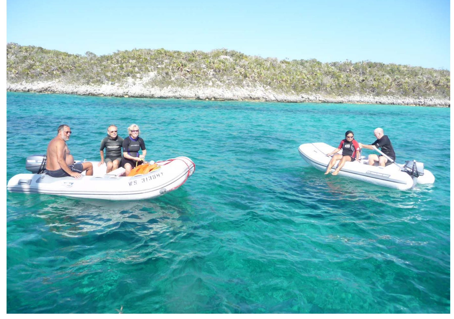
We see our friends on Greenstone, Saber Tooth & Night Star at The Aquarium by Cambridge Cay. Great snorkeling there.