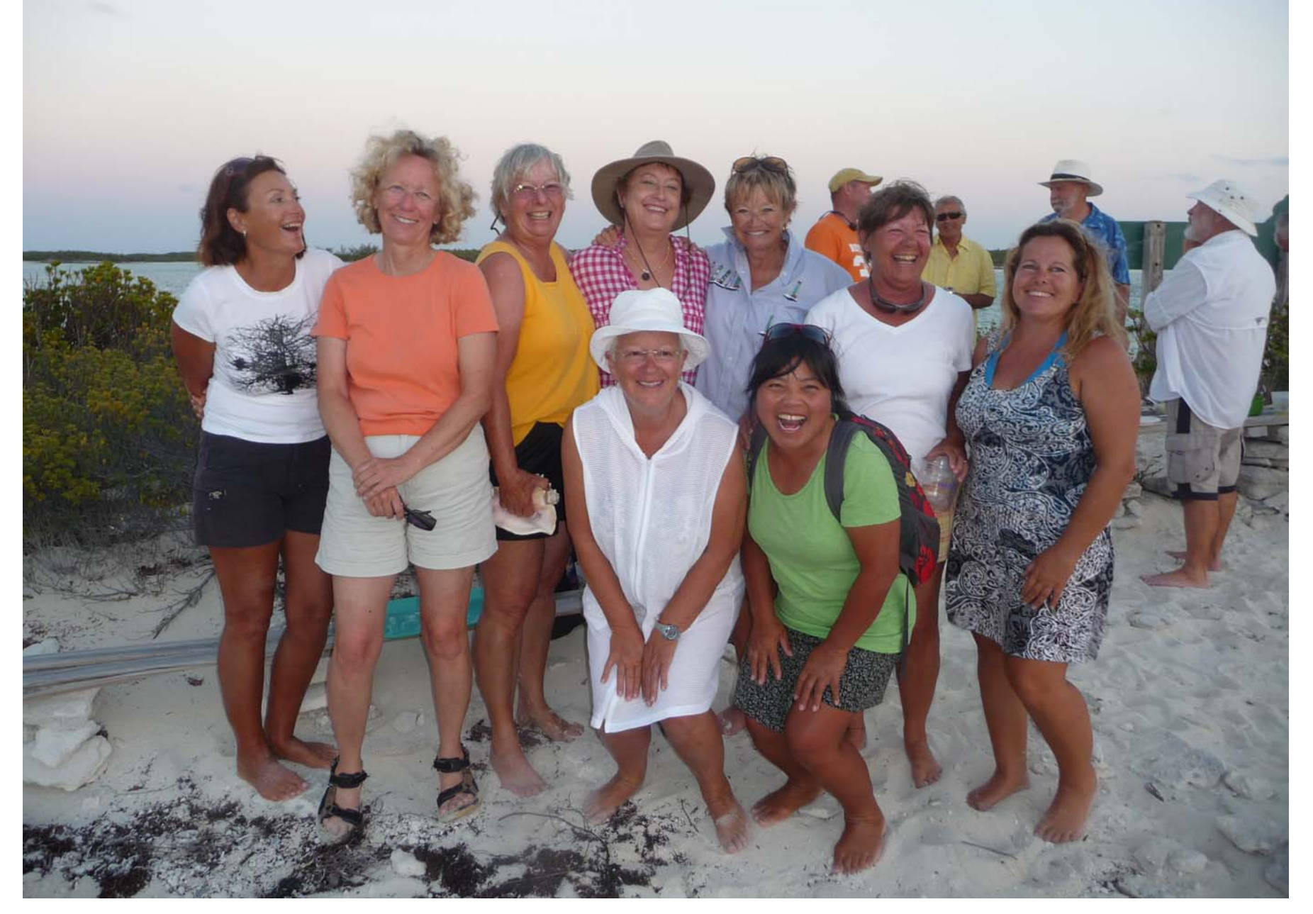
The sailing ladies of Cambridge Cay at the happy hour on a sand spit by the moorings and anchorage.