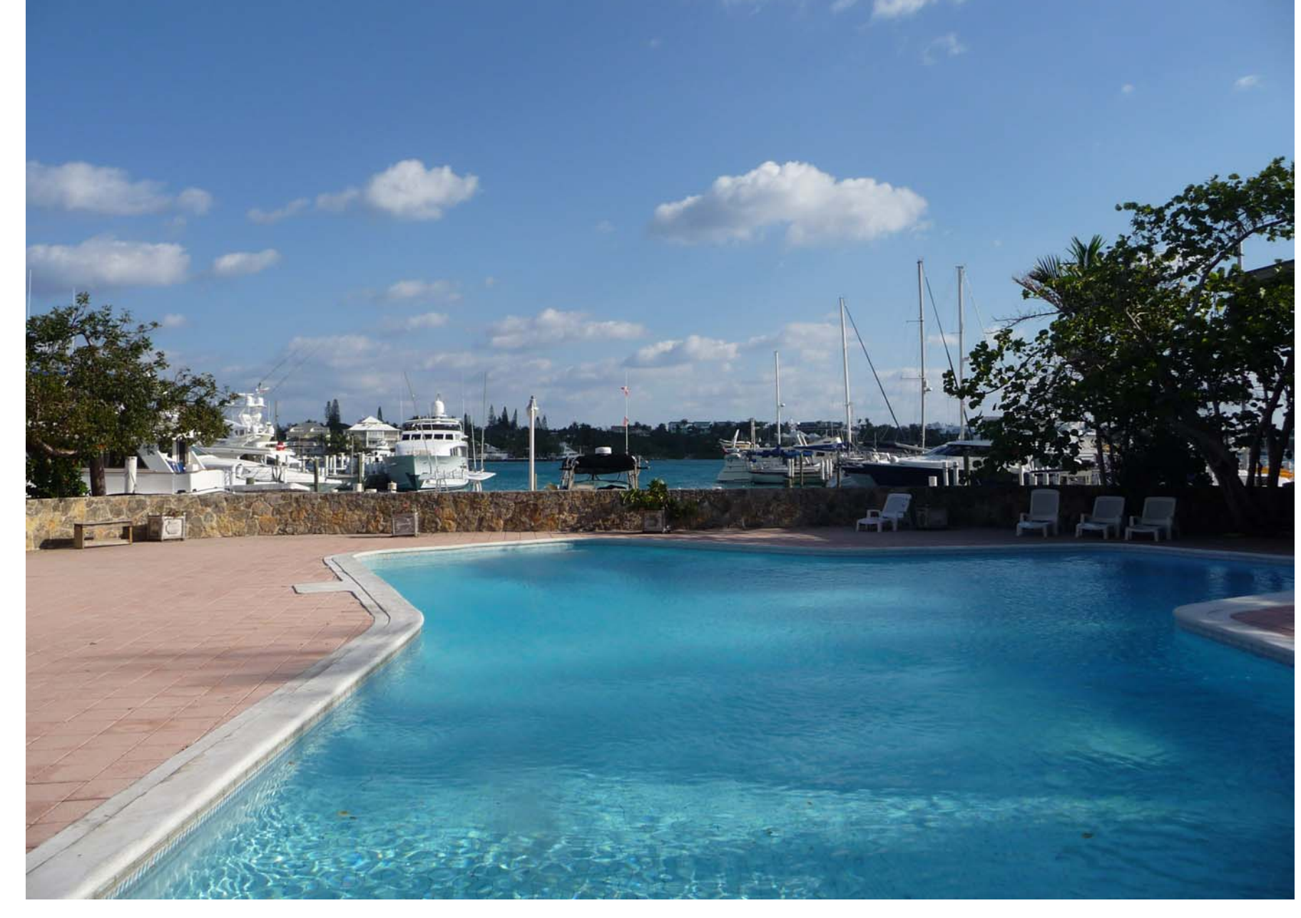
Back at the Nassau Harbor Club awaiting Zoe & Josh's arrival on March 28. They visit us for 5 wonderful days.