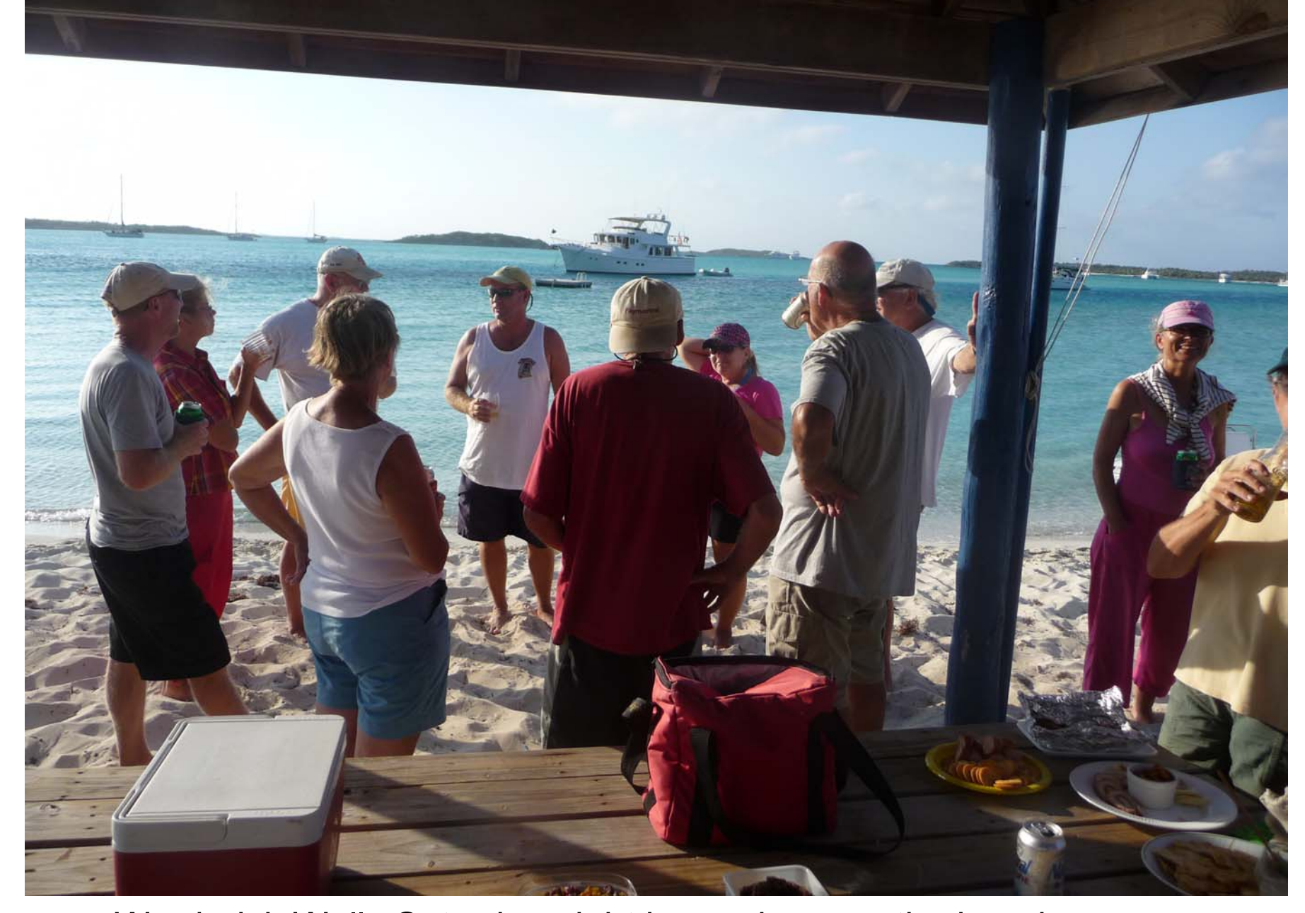
Warderick Wells Saturday night happy hour on the beach.