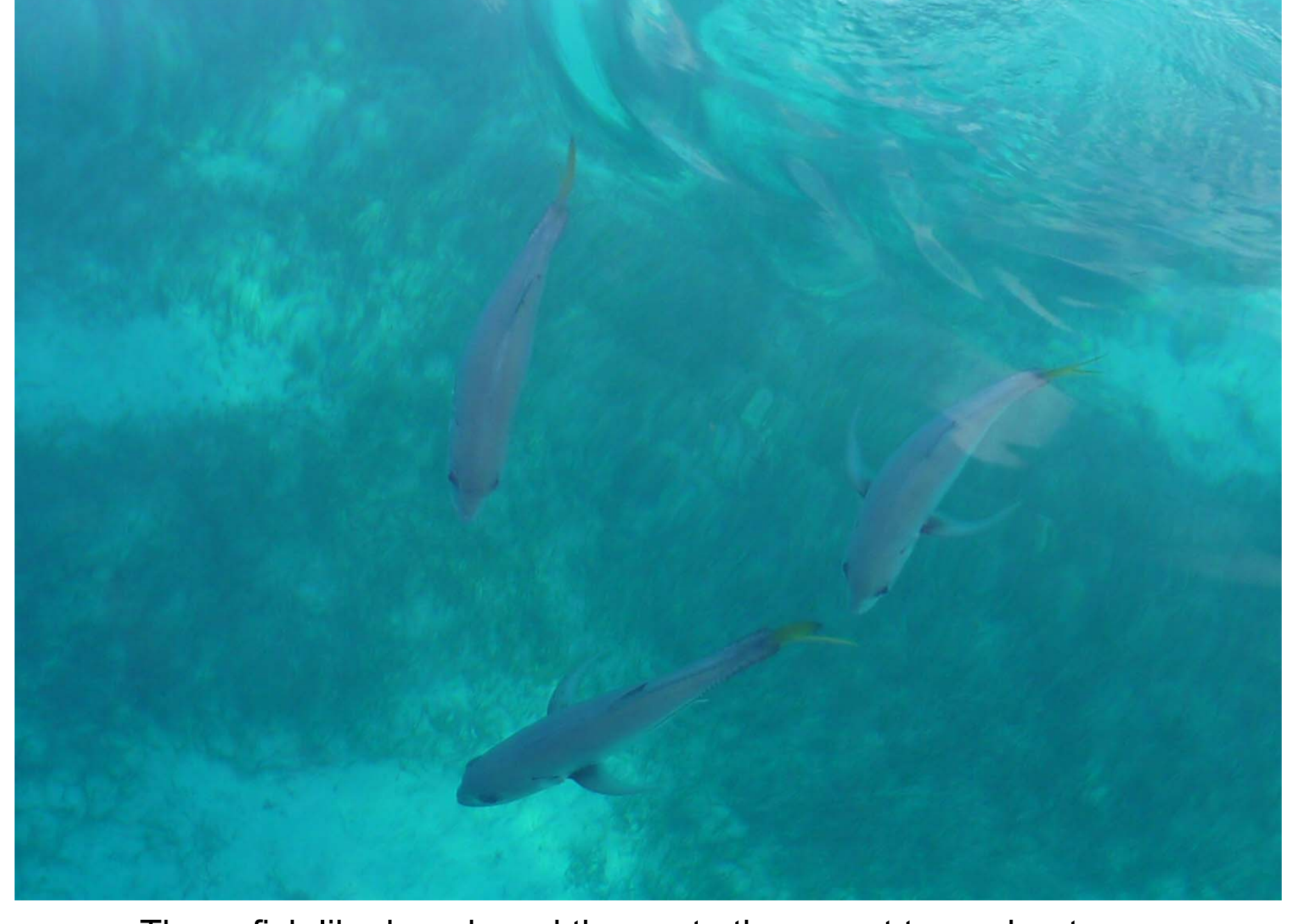
These fish liked our bread thrown to them next to our boat.