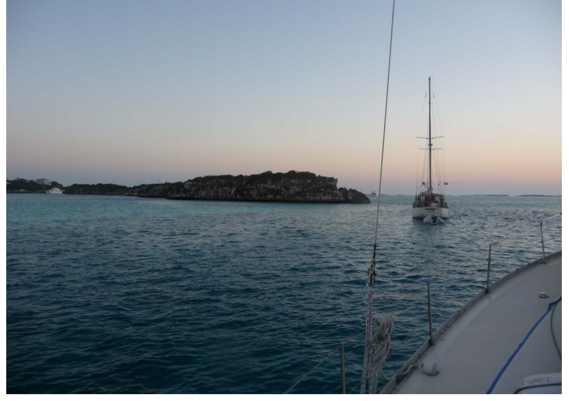
Thunderball Cave, Staniel Cay. Two snorkeling entrances near where our boat is moored.