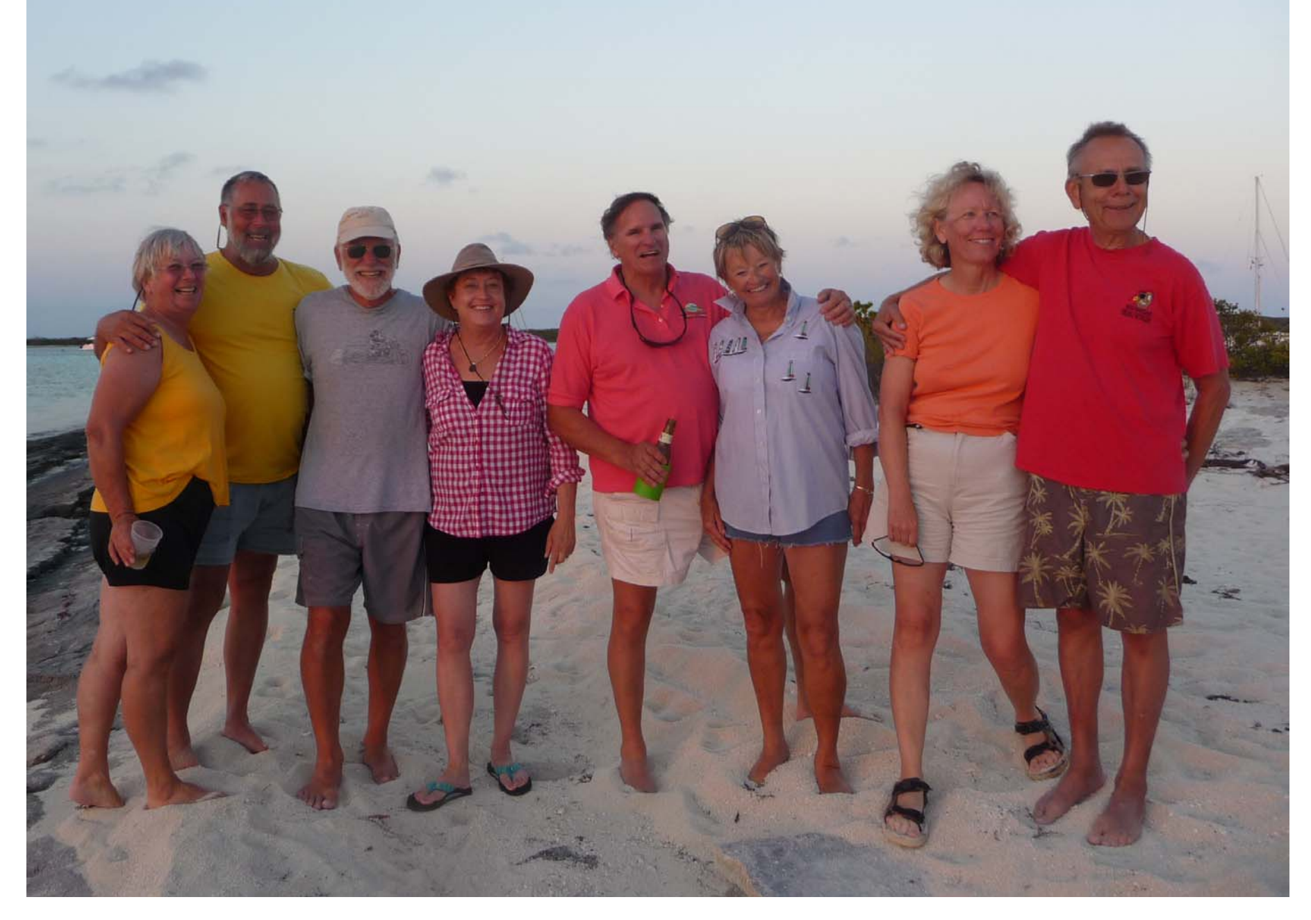
Minnesota sailors represented at Cambridge Cay in the Exumas.