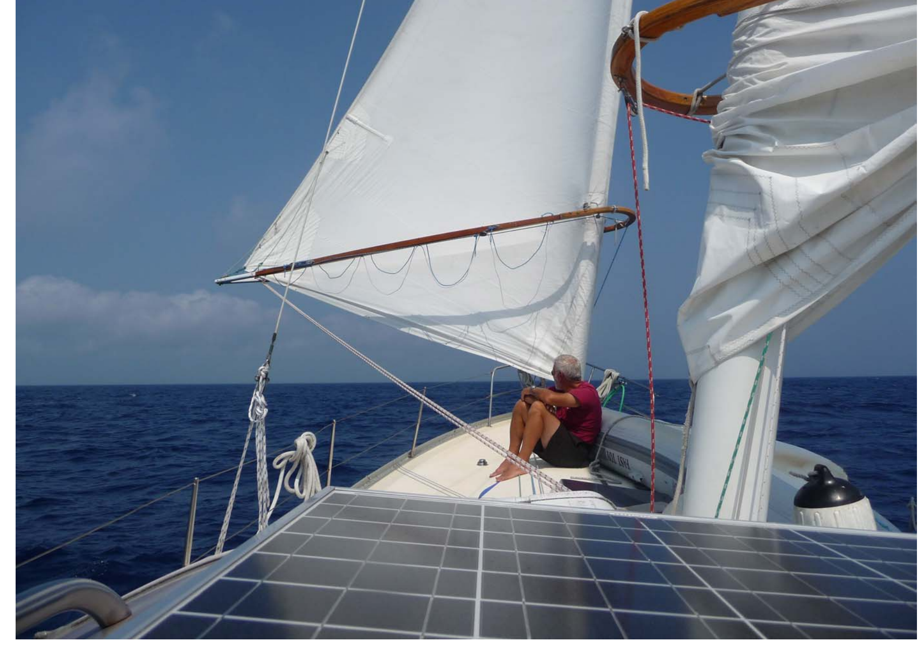
Beautiful downwind sail from Cambridge Cay to Warderick Wells.