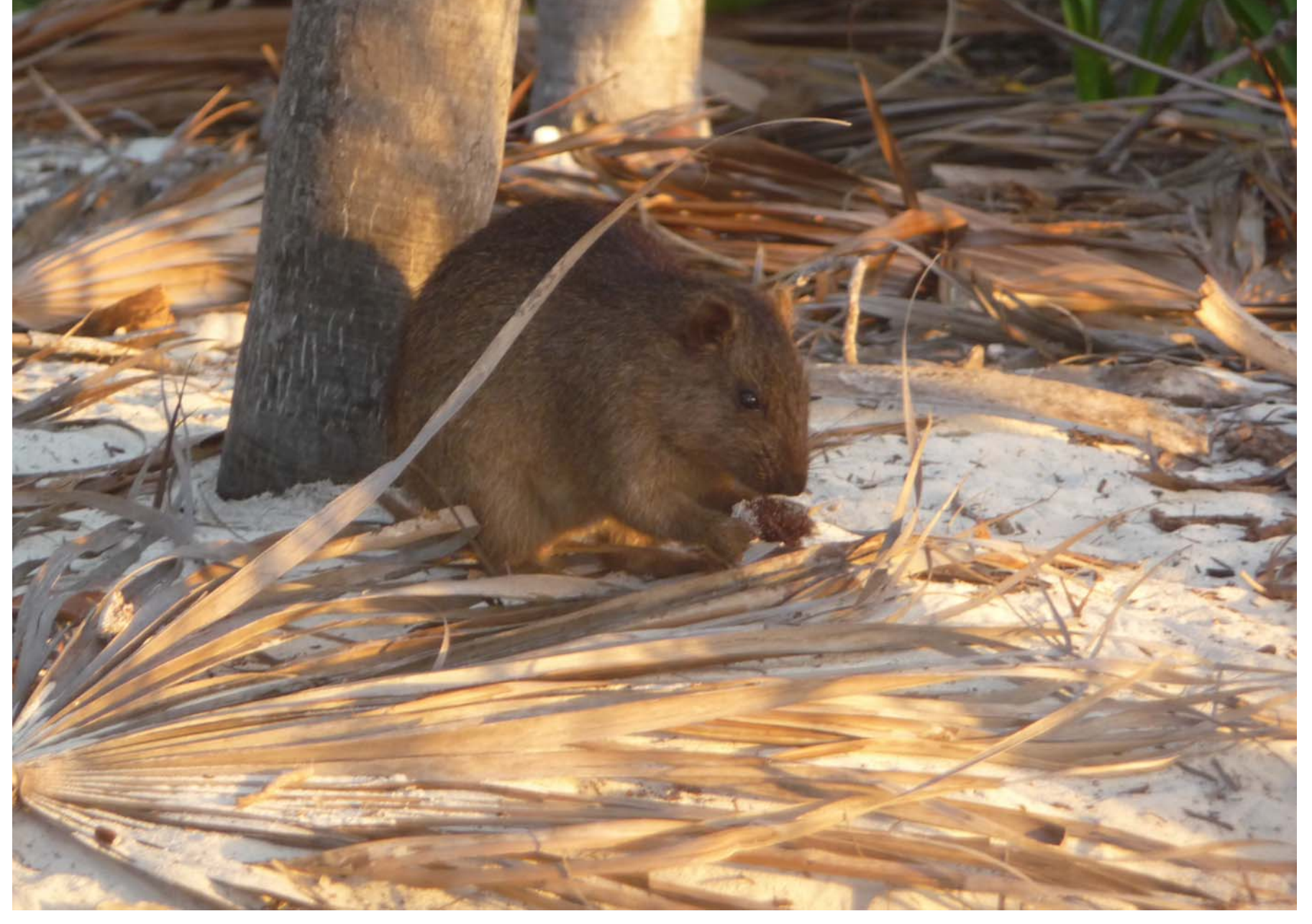
A Hoodia, the only true Bahamian mammal, comes out at sunset.