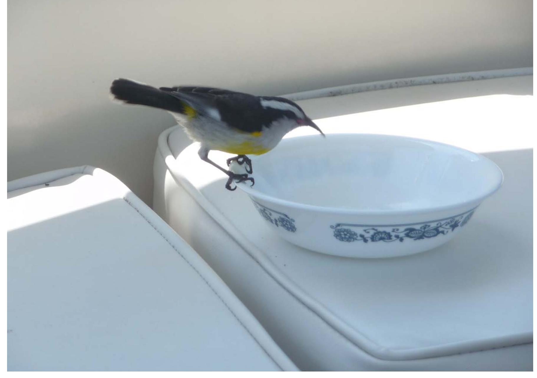
A Banana Quit bird comes to our boat and eats up the sugar we give him.