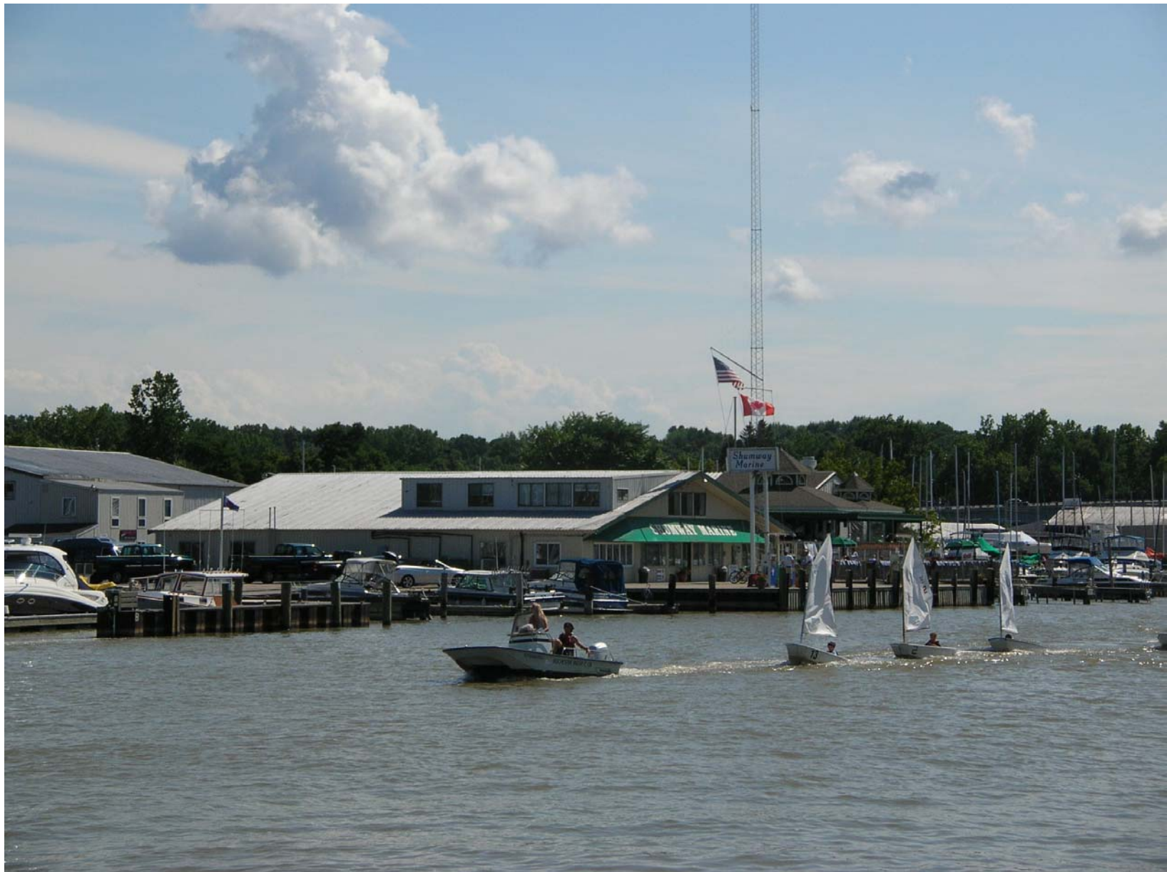
Towing little sailboats out for their lesson in front of Shumway Marine.