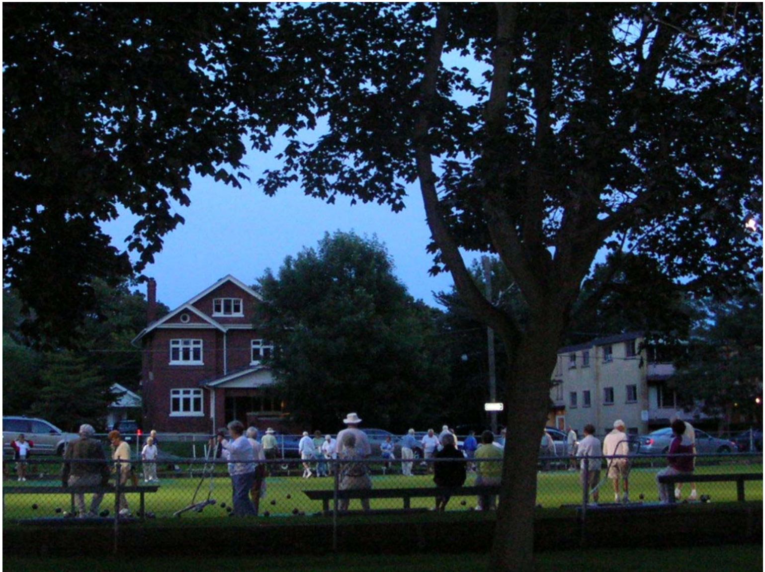
Lawn bowling was next to the park where the band played.