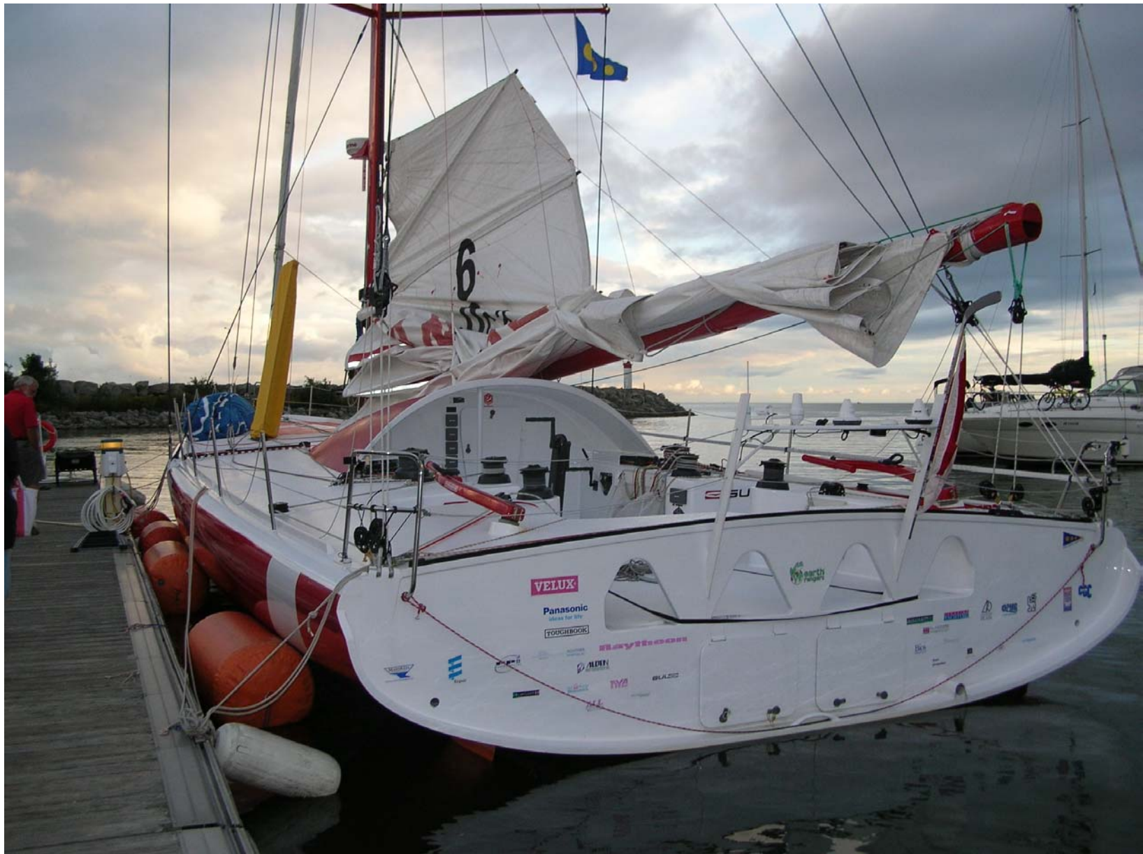
“Spirit of Canada” sailboat soon to be single handed in a around the world race.