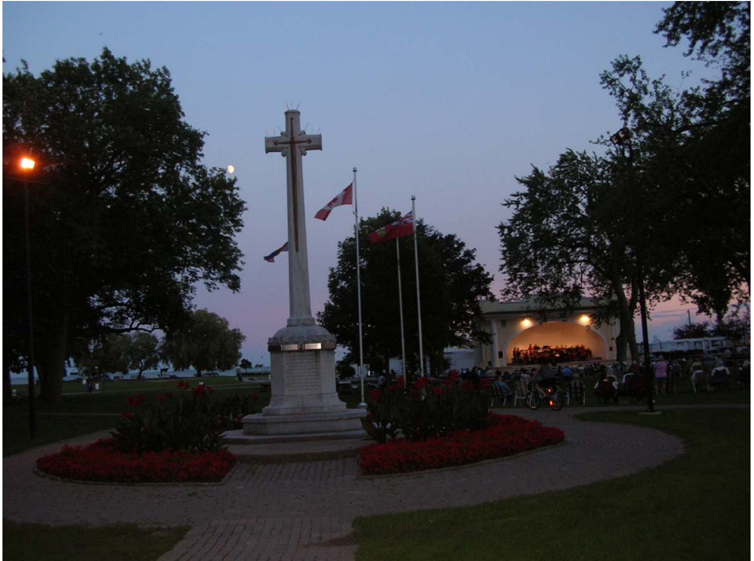
Cobourg is a lovely little town with sculptured gardens & band concerts.