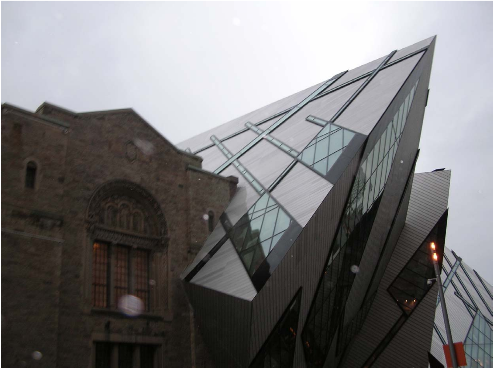
The new addition to the Ontario Art Museum—spectacular!