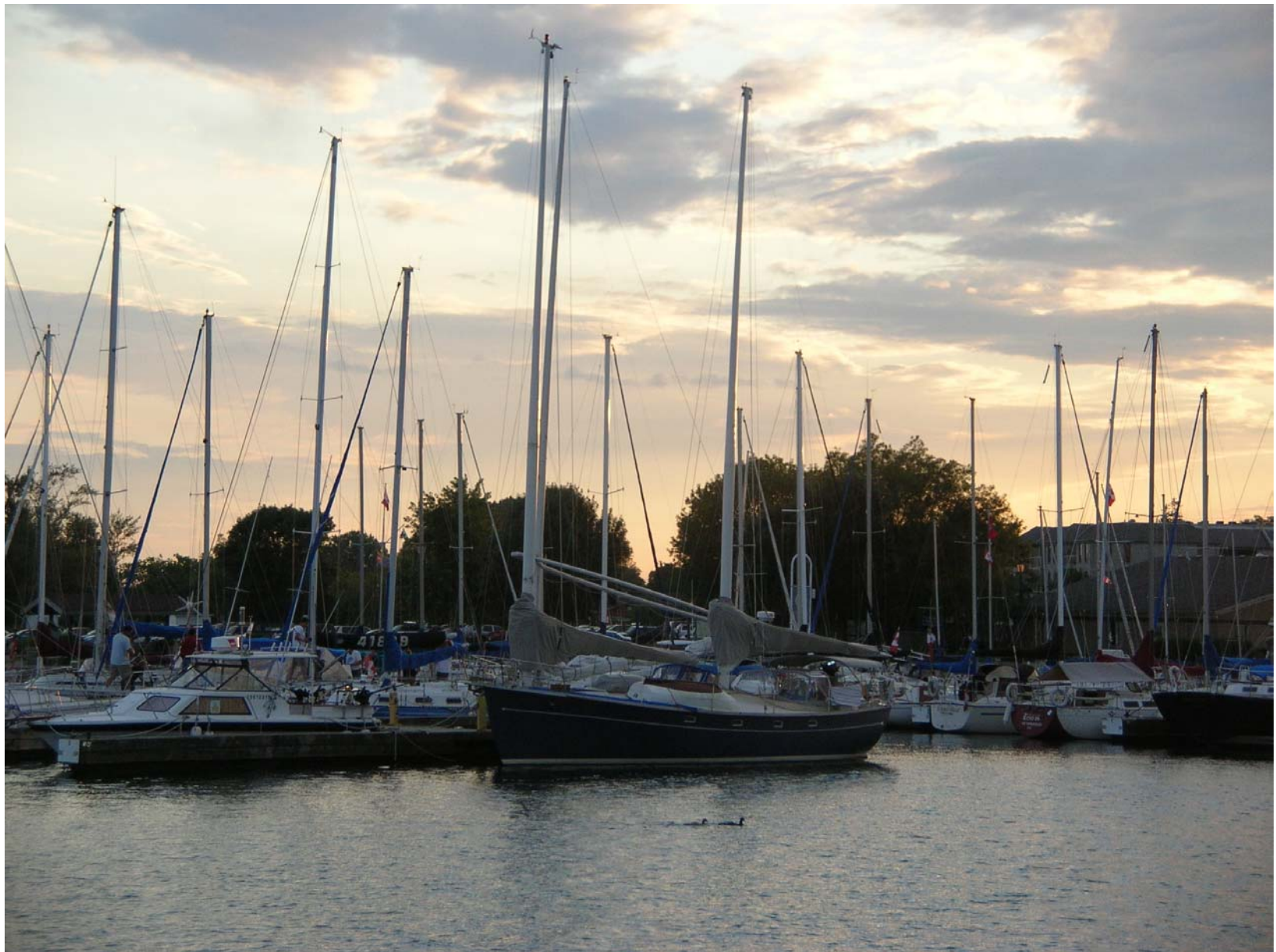
Running Free docked at Cobourg Marina at sunset.