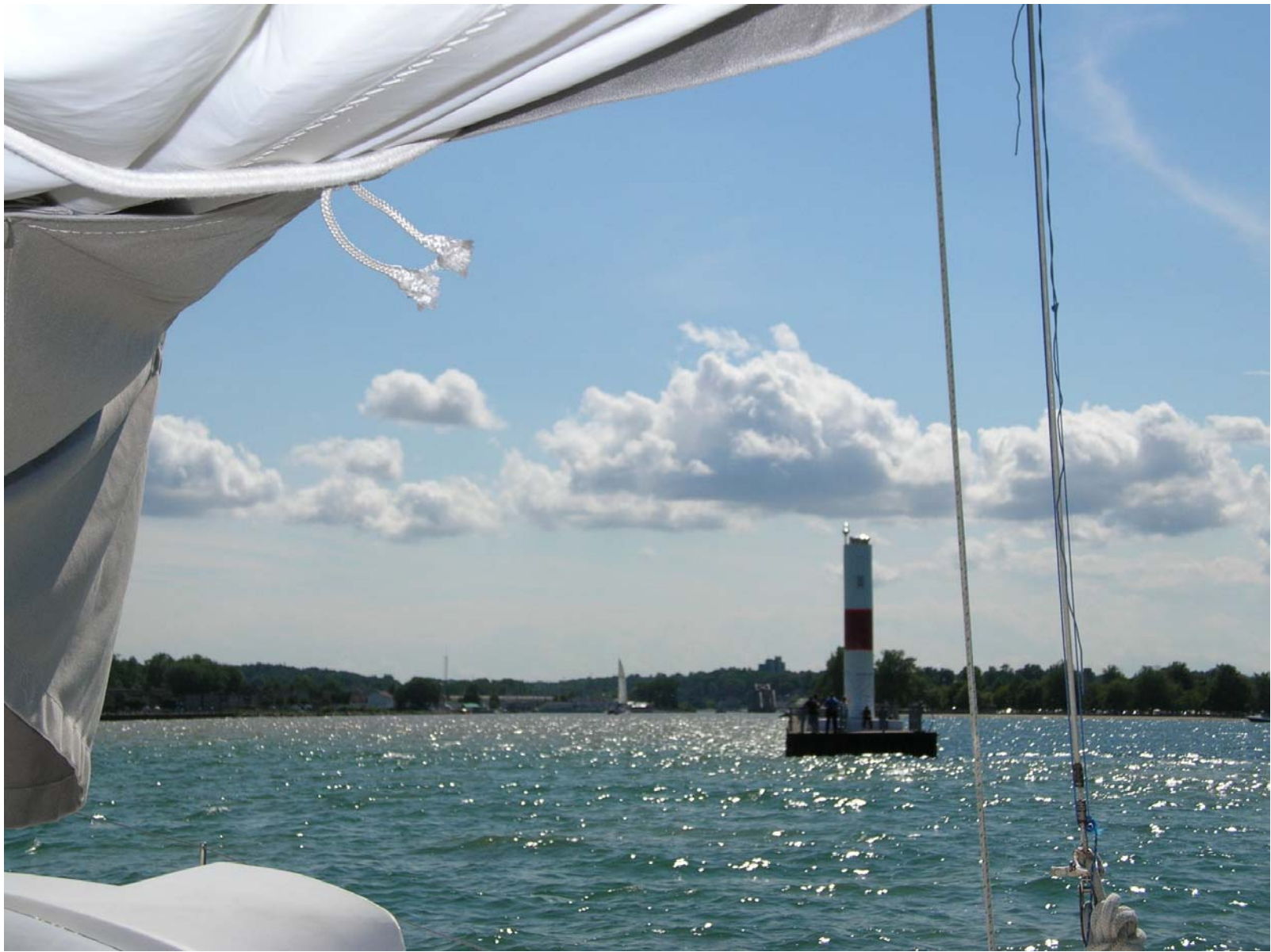
Entering Rochester harbor—goodbye Lake Ontario!