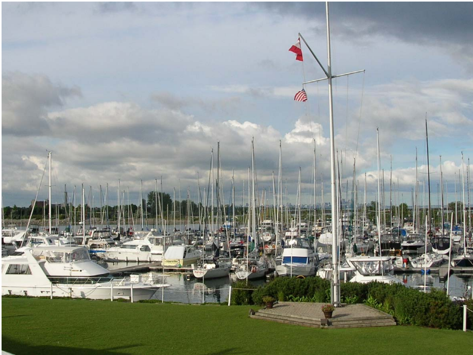
Bruce & Lila take us to dinner at their Port Credit Yacht Club—lots of boats!