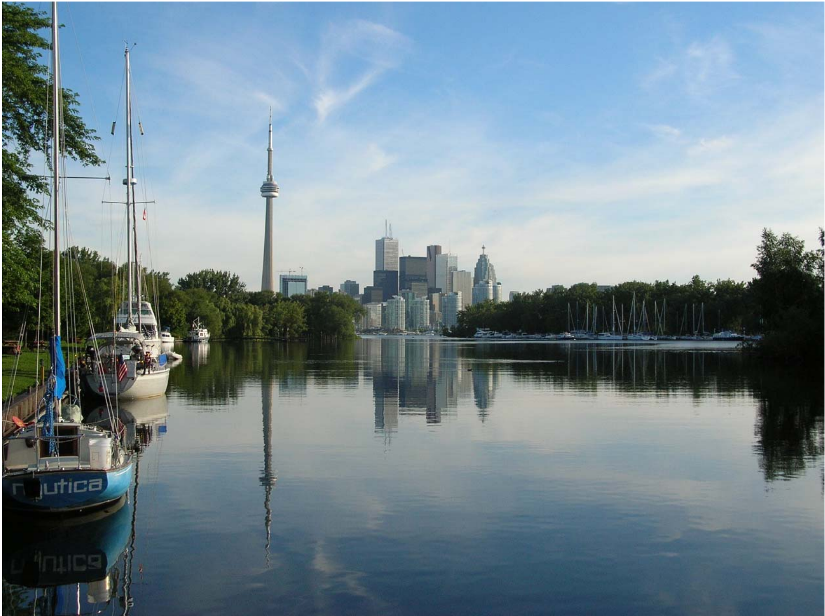
View of downtown Toronto from Hanlan's Point Marina