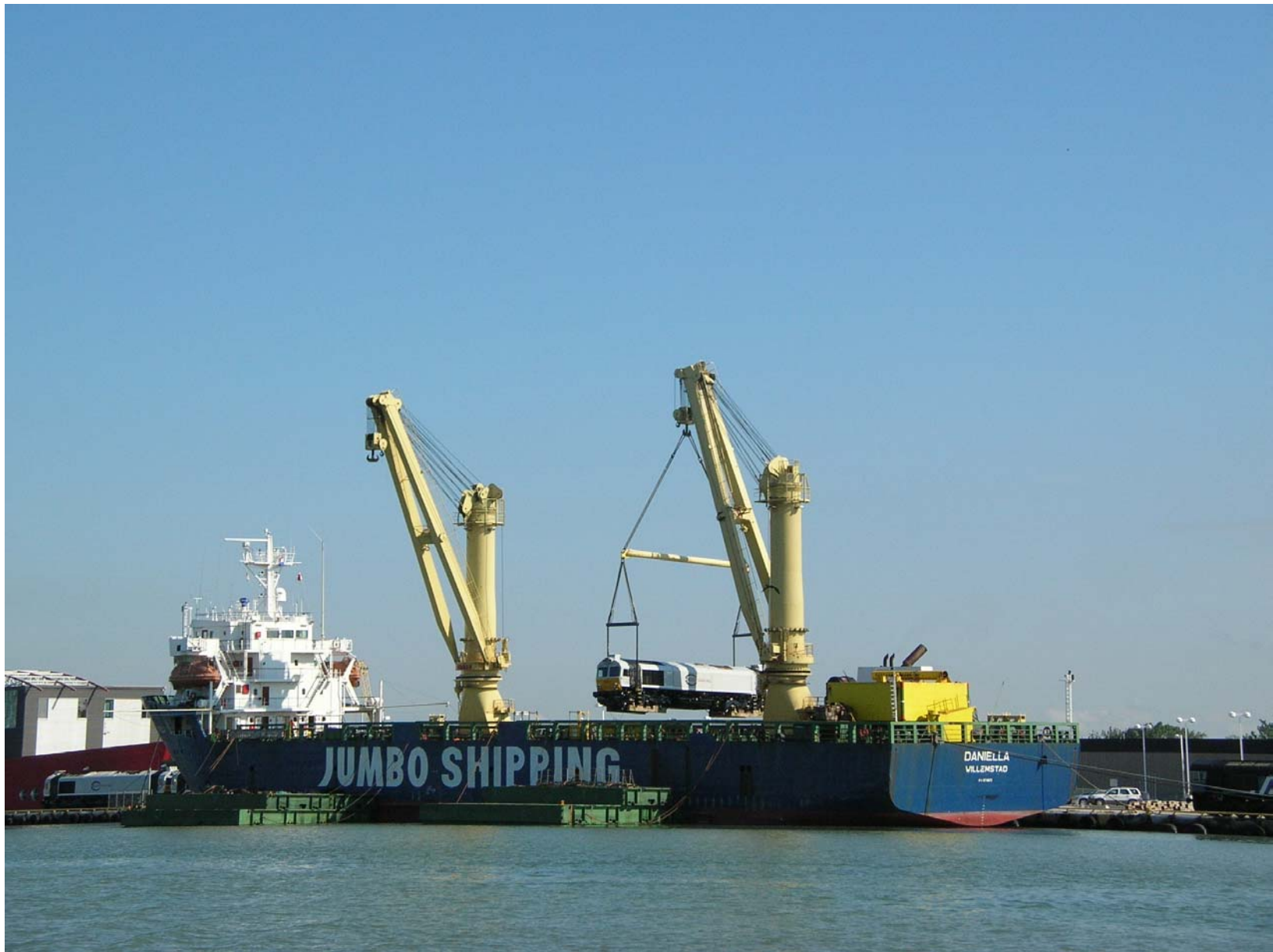
Leaving Toronto harbor we see “Jumbo Shipping” loading a train car!