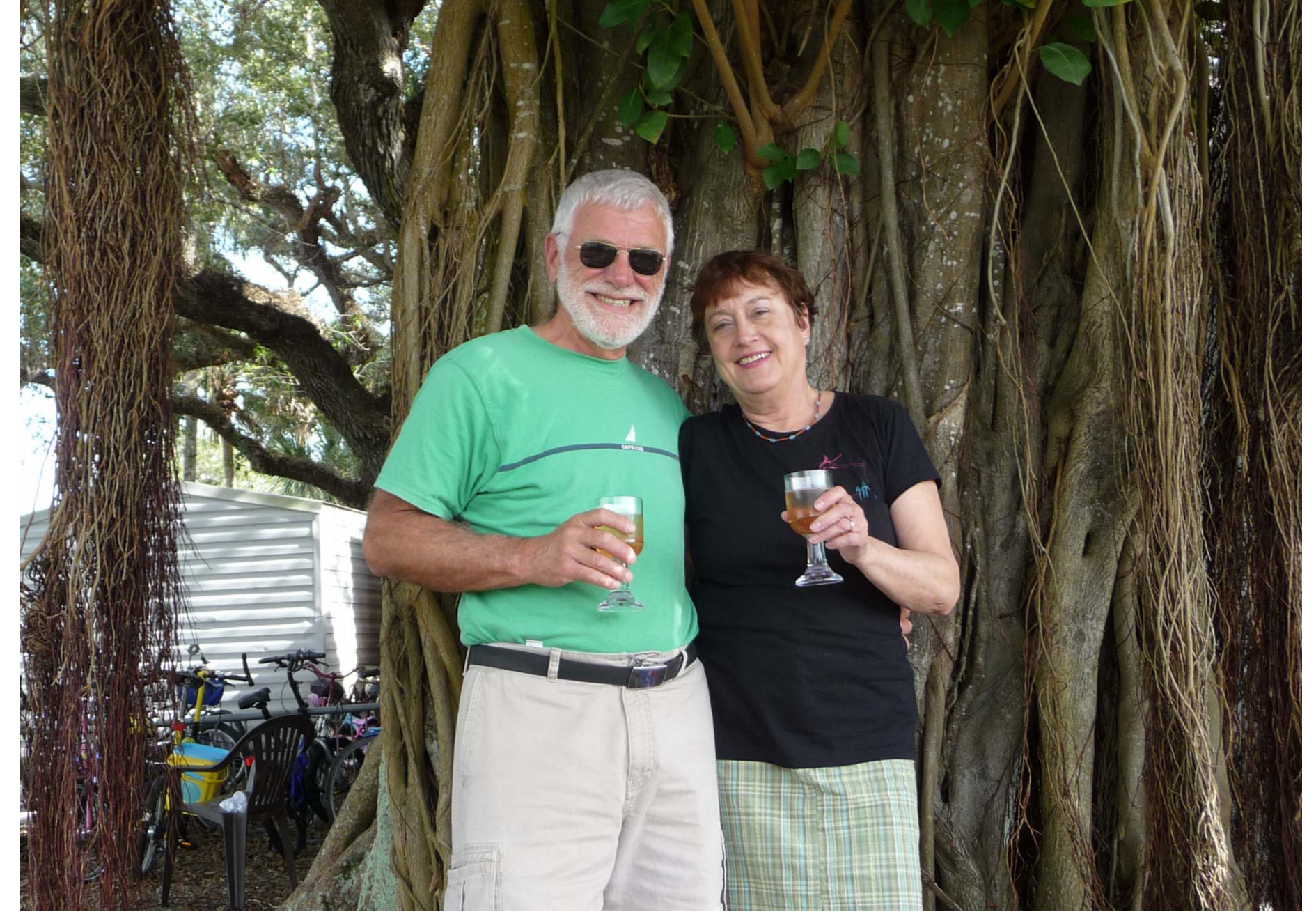
Celebratory New Year's Day champagne at Vero Beach.