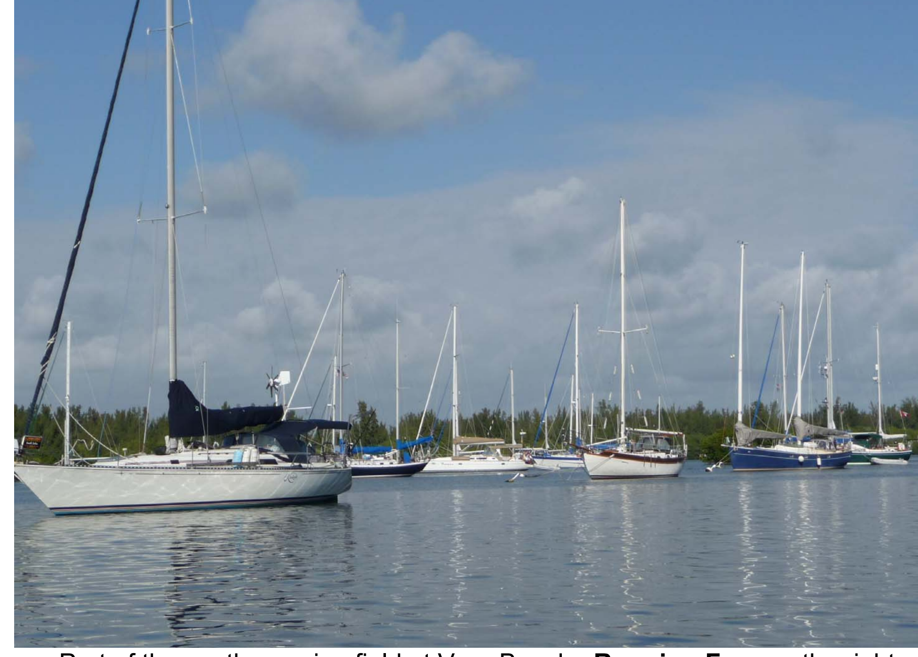
Part of the south mooring field at Vero Beach. Running Free on the right.