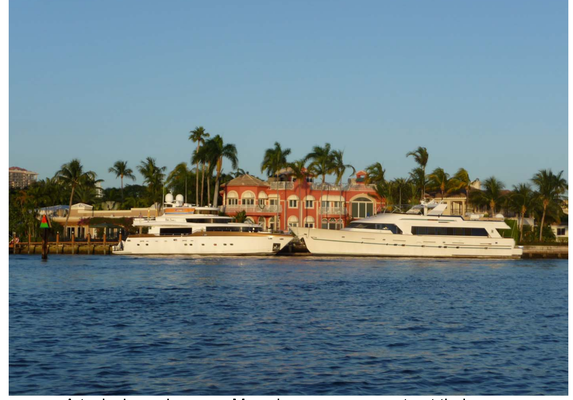
A typical canal scene. Many home owners rent out their dock space; or, this owner happens to have 2 mega yachts.