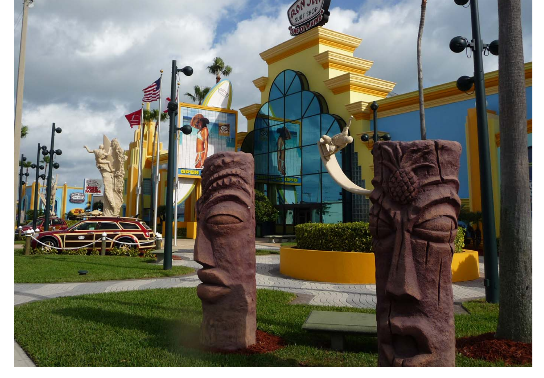
Ron Jon Surf Shop in Cocoa Beach, a mega store!