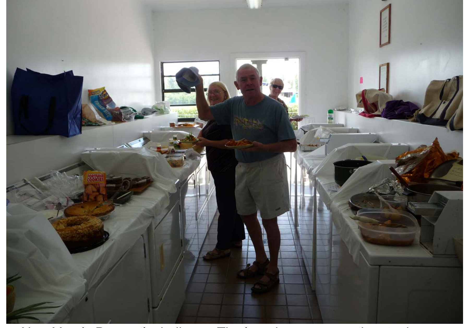
New Year's Day potluck dinner. The laundry room was the staging area for all the yummy food. In one door and out the other. This couple is from the UK.