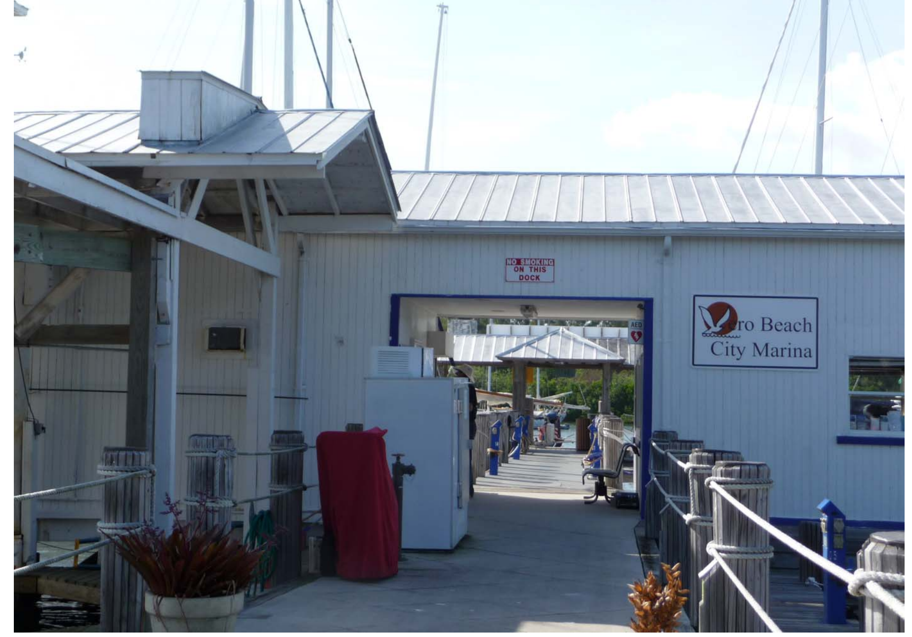
We enjoy picking up a mooring at Vero Beach Marina for New Year's.