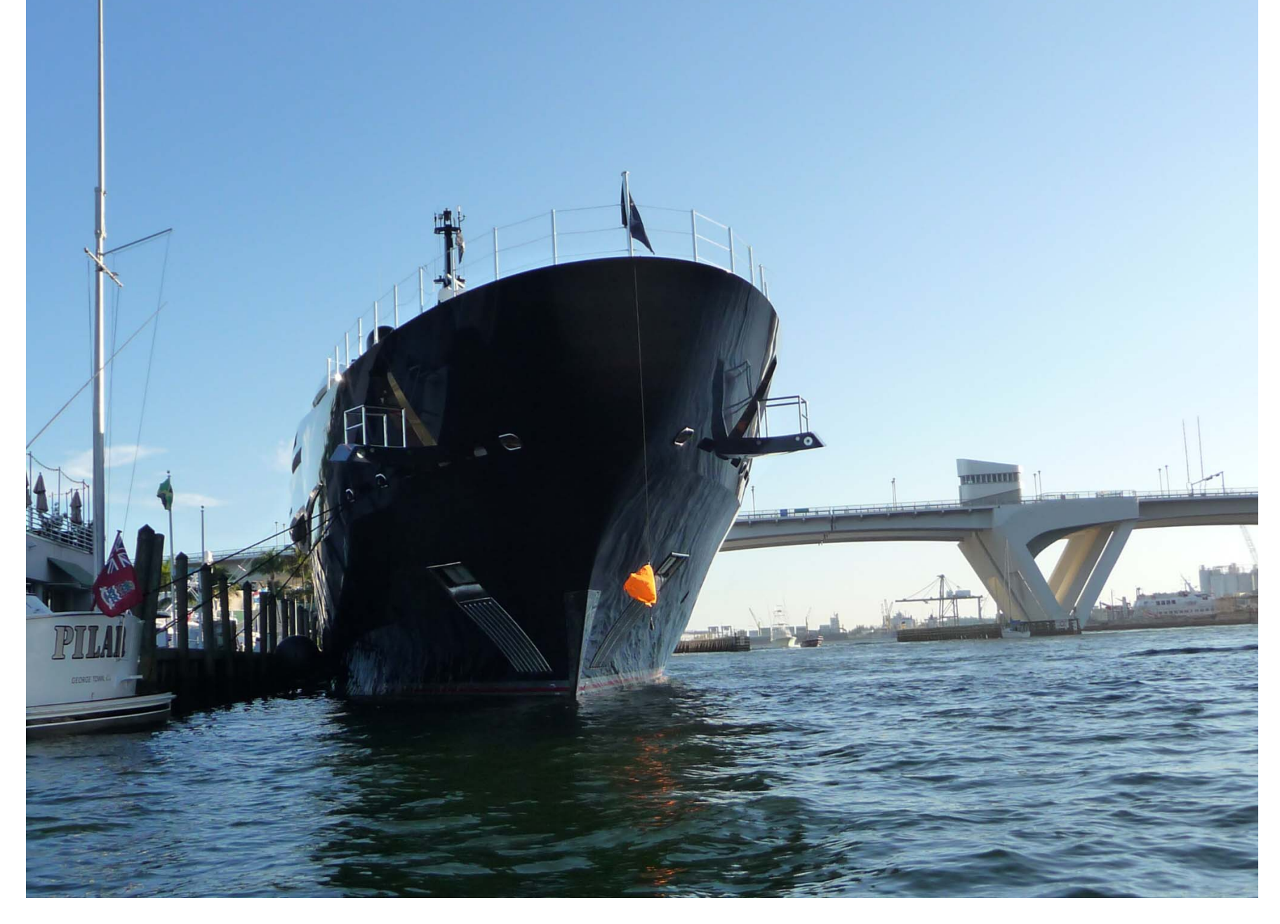
A little intimidating taking our dinghy under this yacht's bow.