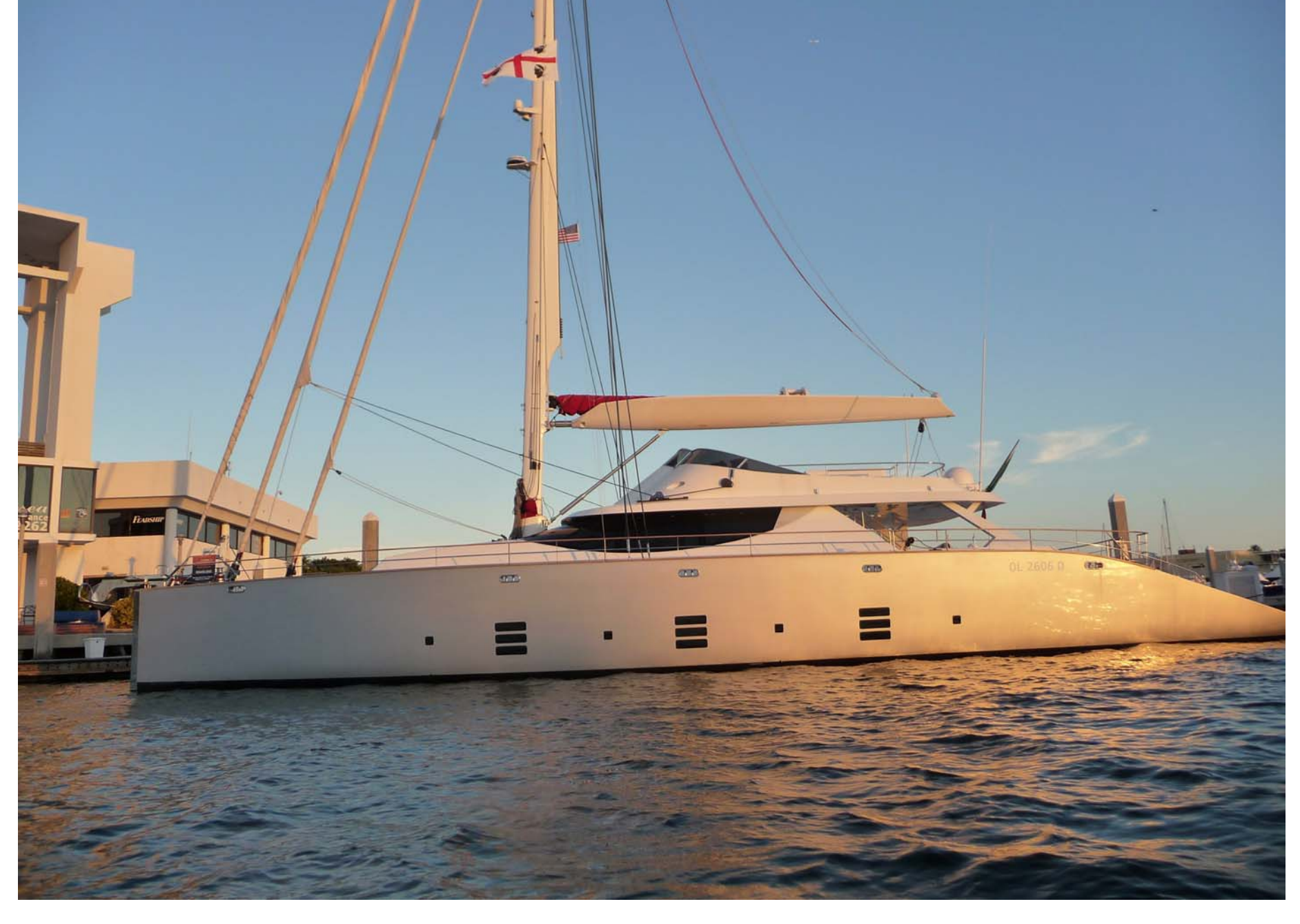
A million dollar catamaran docked at Bahia Mar Marina.