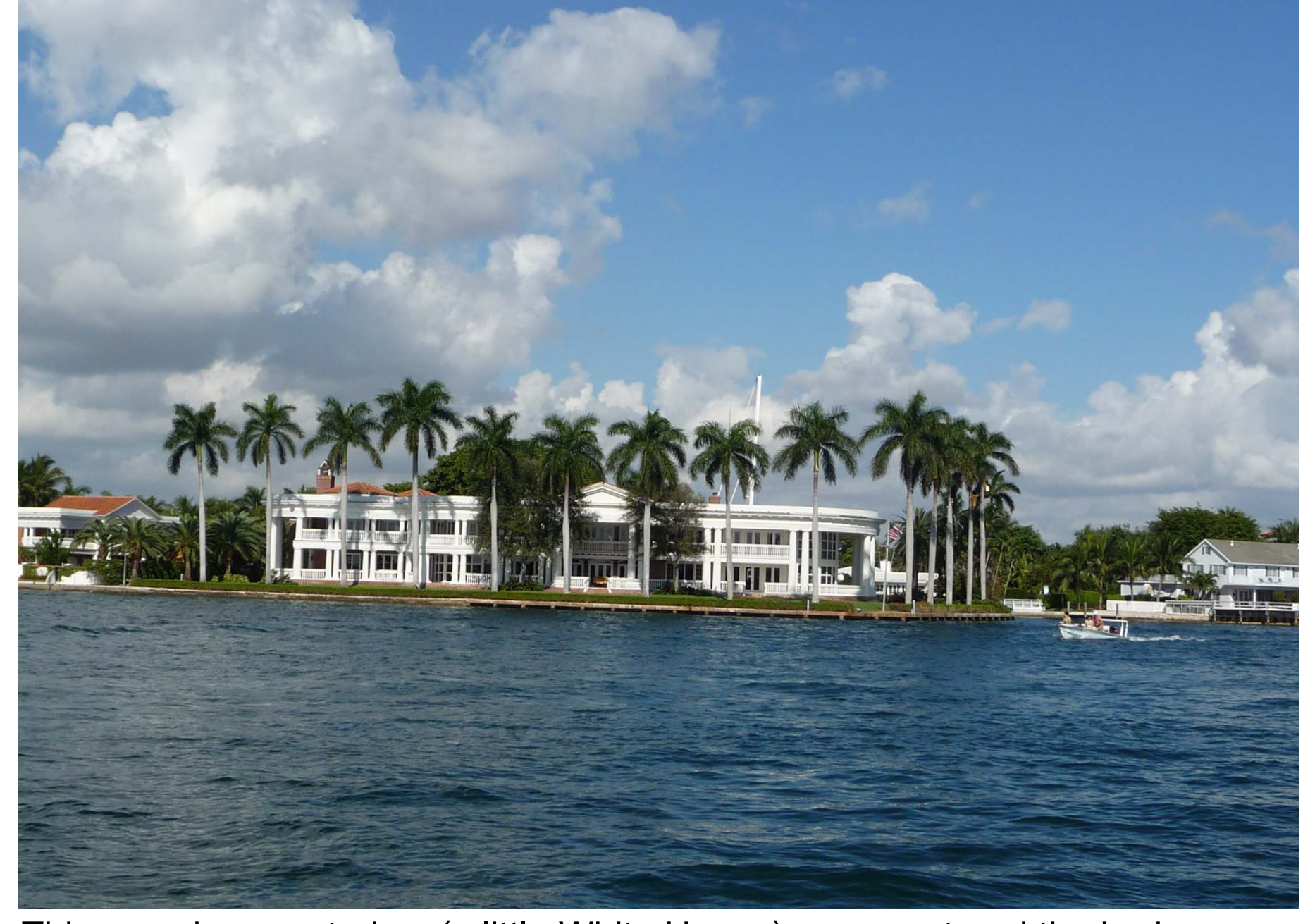
This mansion greeted us (a little White House) as we entered the harbor.