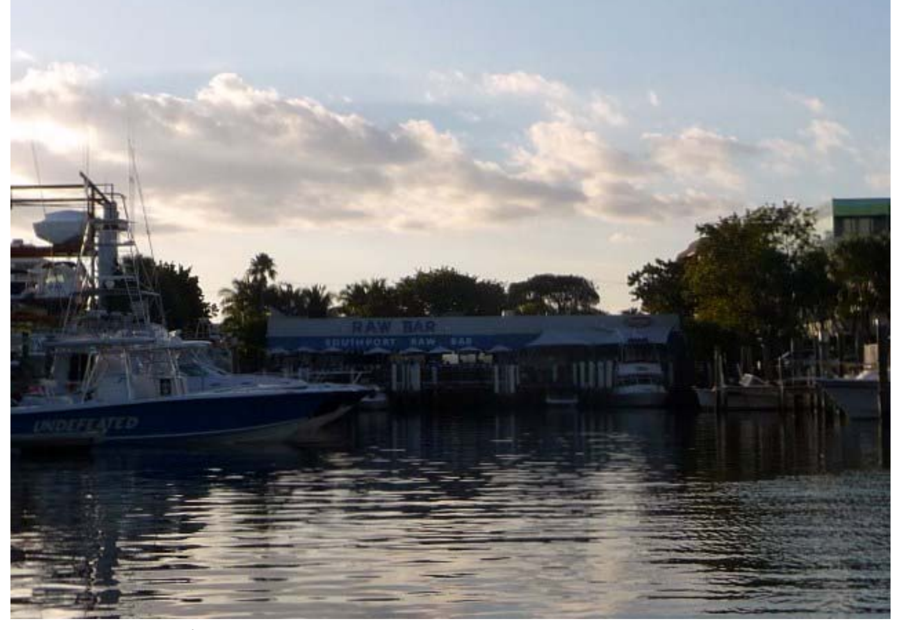
End of the 17<sup>th</sup> St. Canal. This Raw Bar lets us tie up the dinghy to do errands if we eat there. Good food!