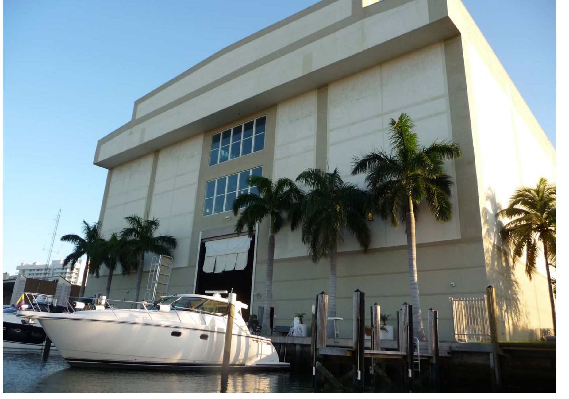
A indoor boat storage building in the 17<sup>th</sup> St. canal.