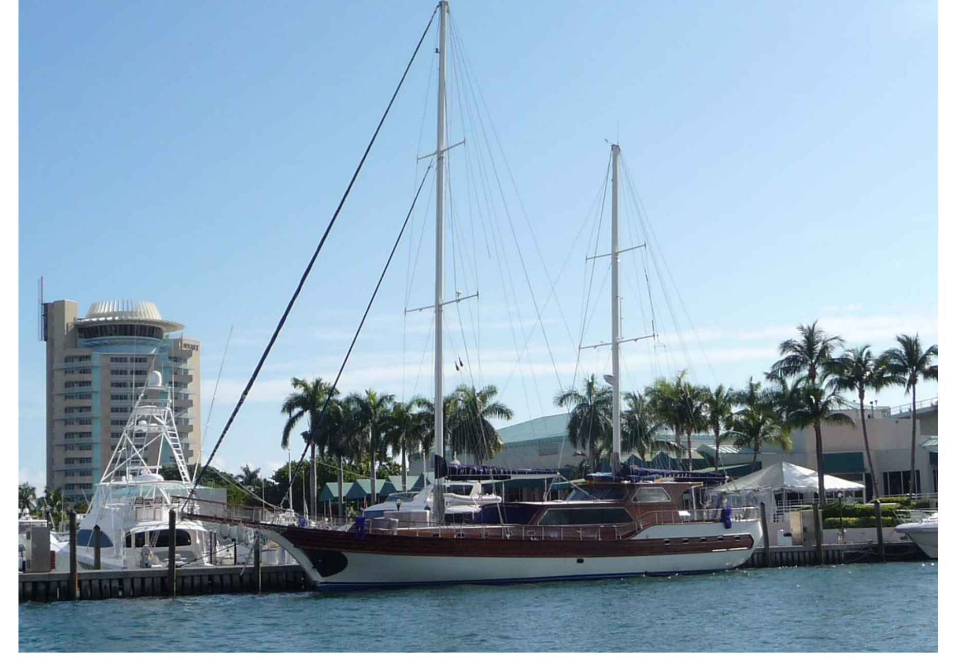
Fort Lauderdale harbor. Many gorgeous boats!