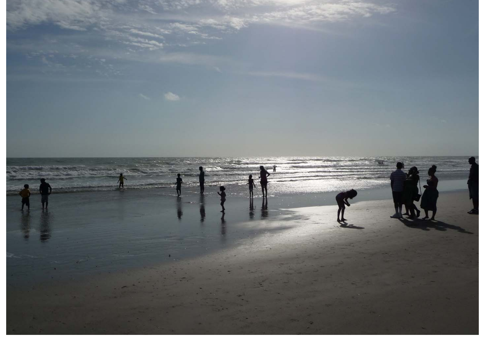
Cocoa Beach scene, Dec. 26, 2012.