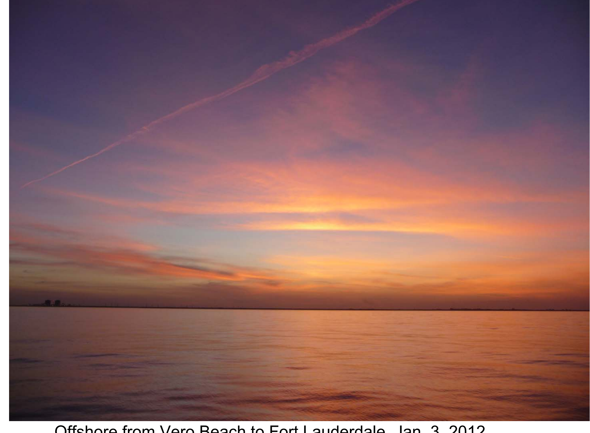
Offshore from Vero Beach to Fort Lauderdale, Jan. 3, 2012.