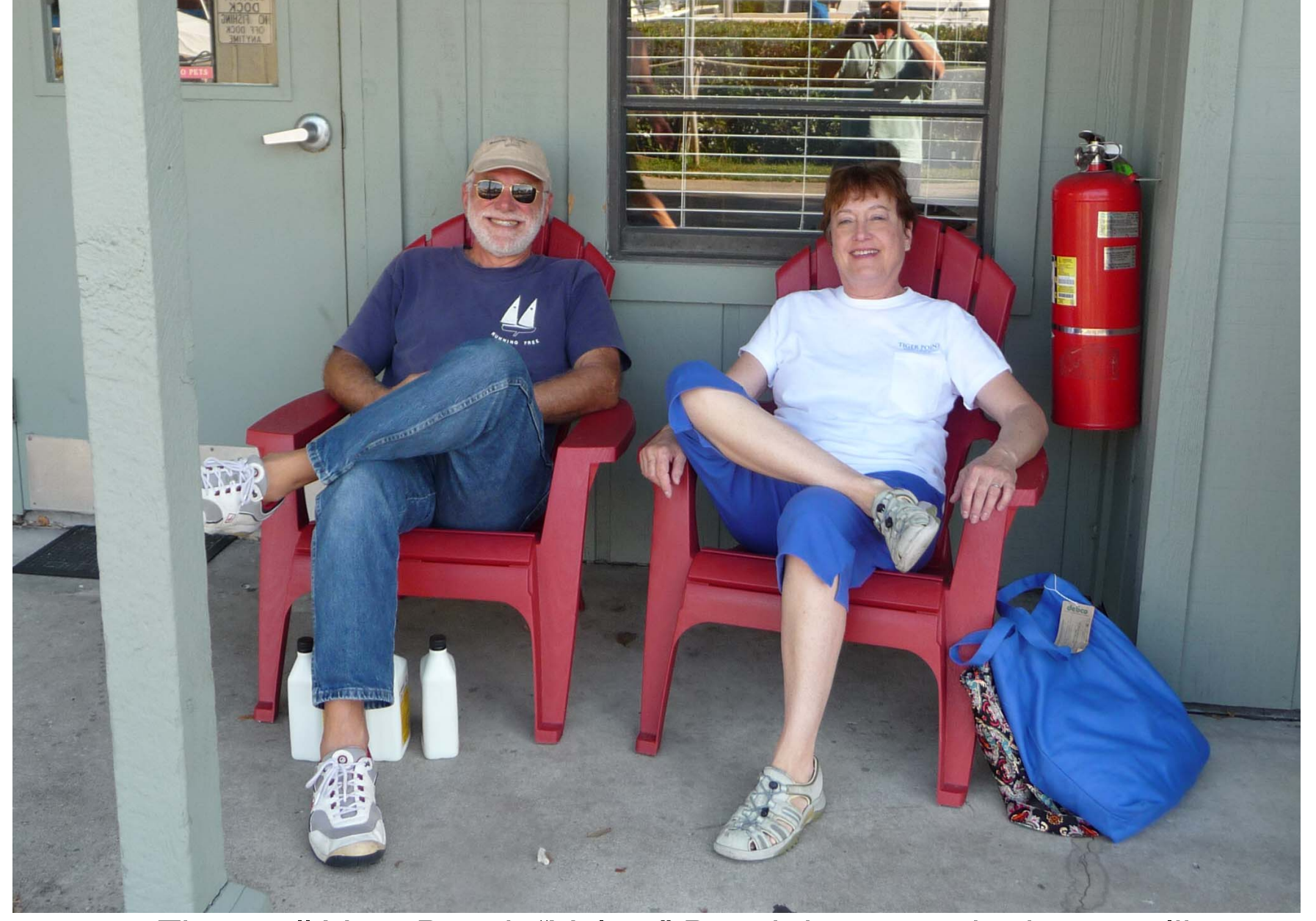
They call Vero Beach "Velcro" Beach because the boaters like it so much they don't leave.