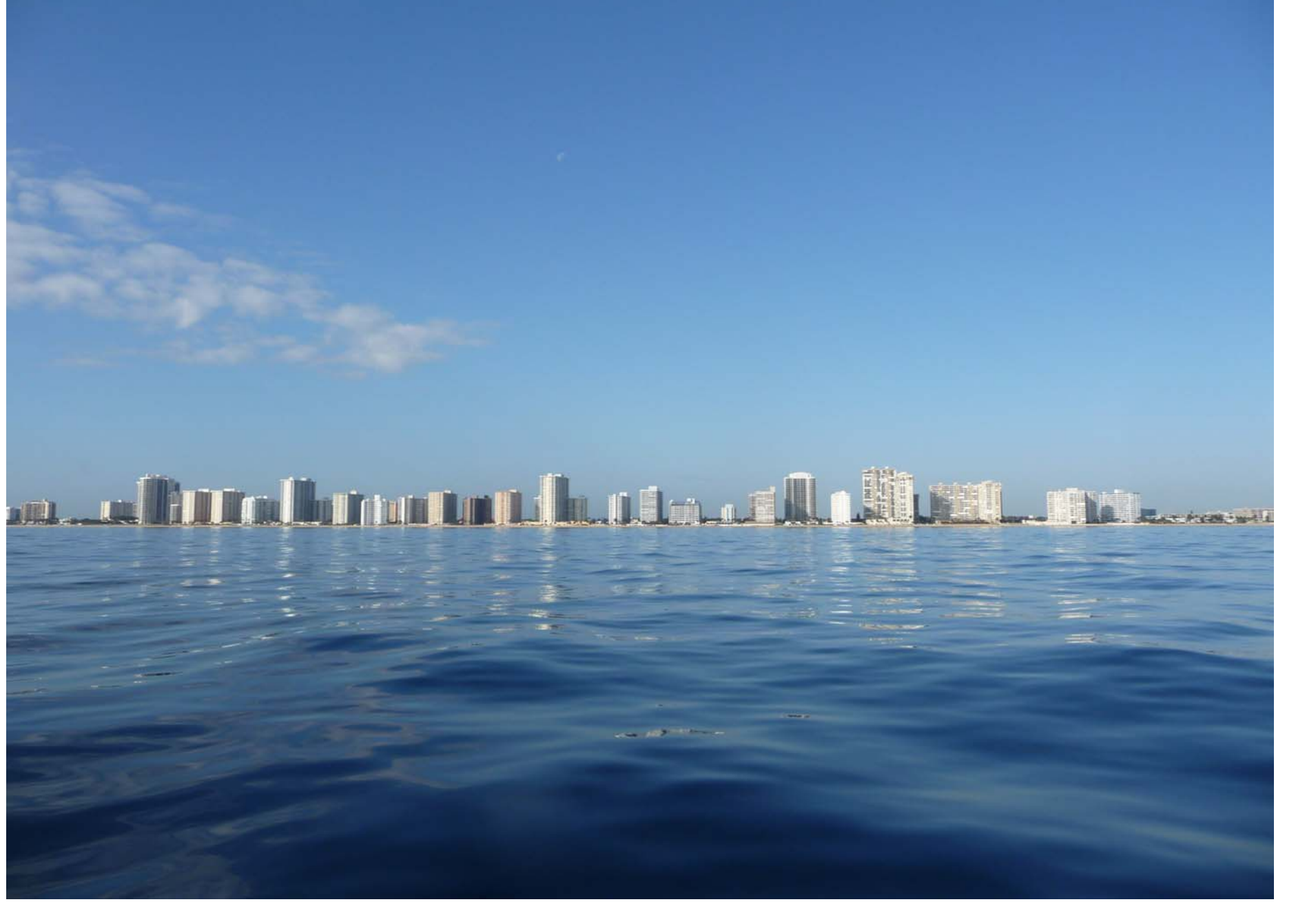
Placid water as we near Fort Lauderdale in the morning.