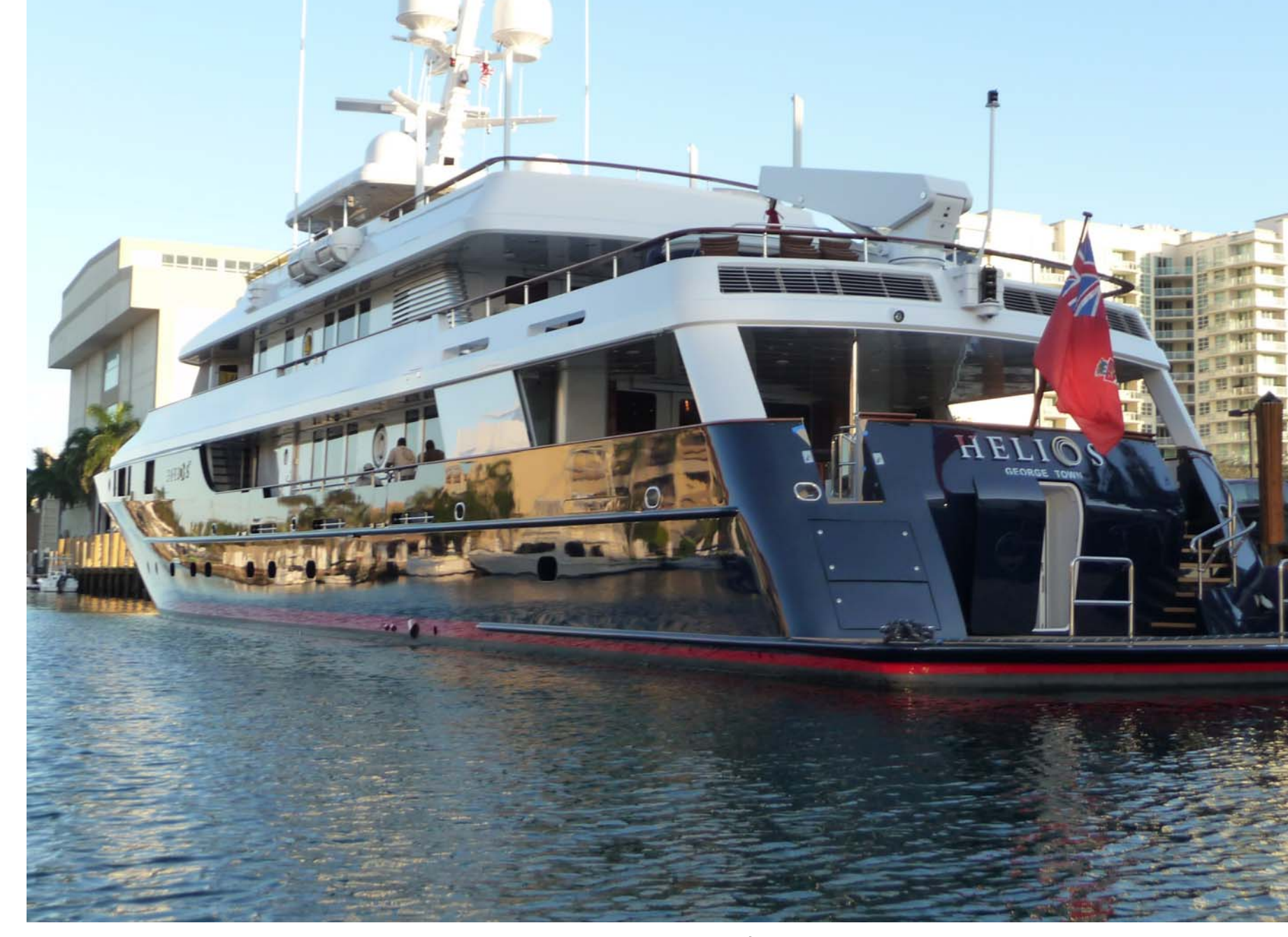
Helios yacht docked in the 17<sup>th</sup> St. Canal.