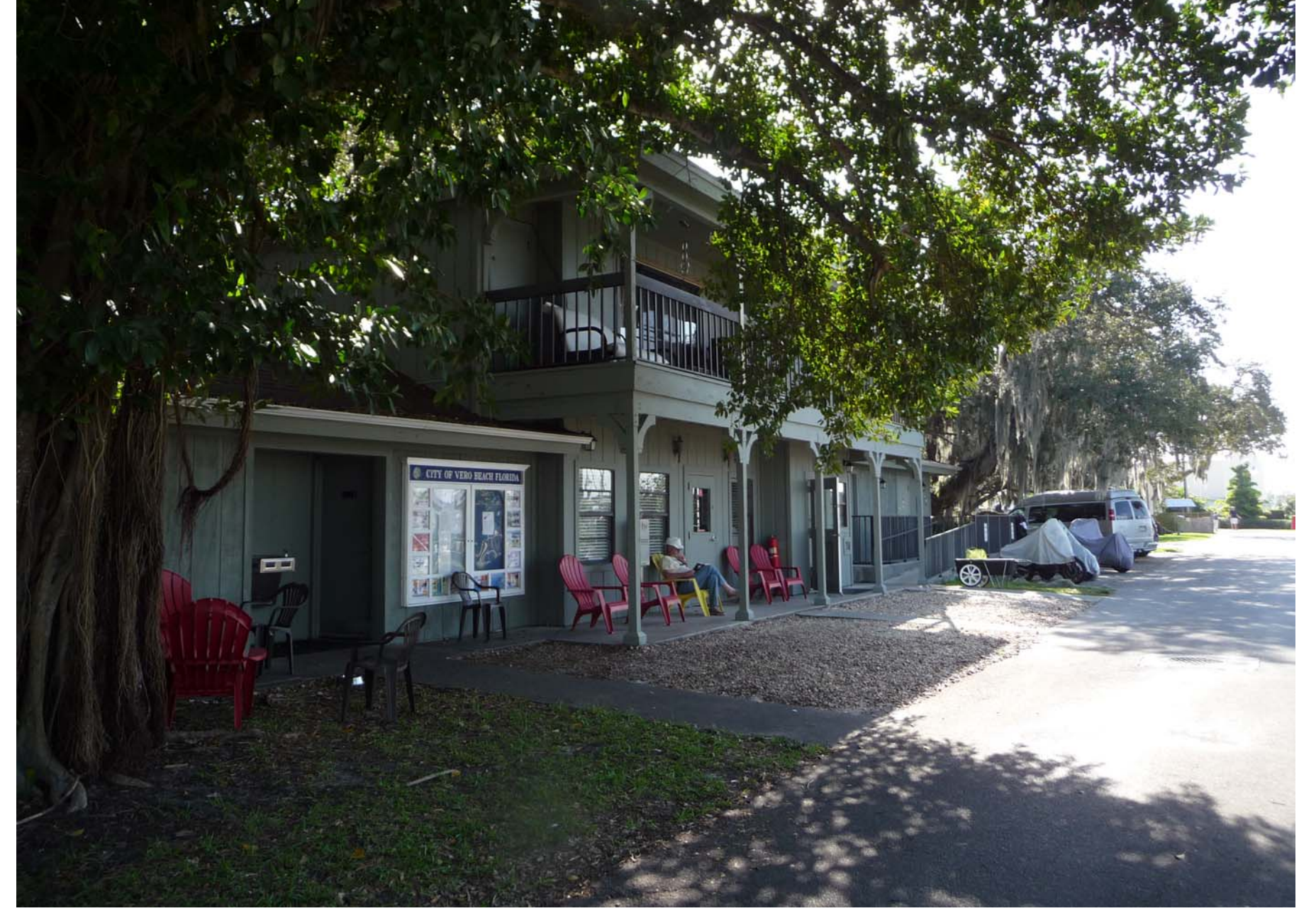
Vero Beach boater's building—very comfortable.