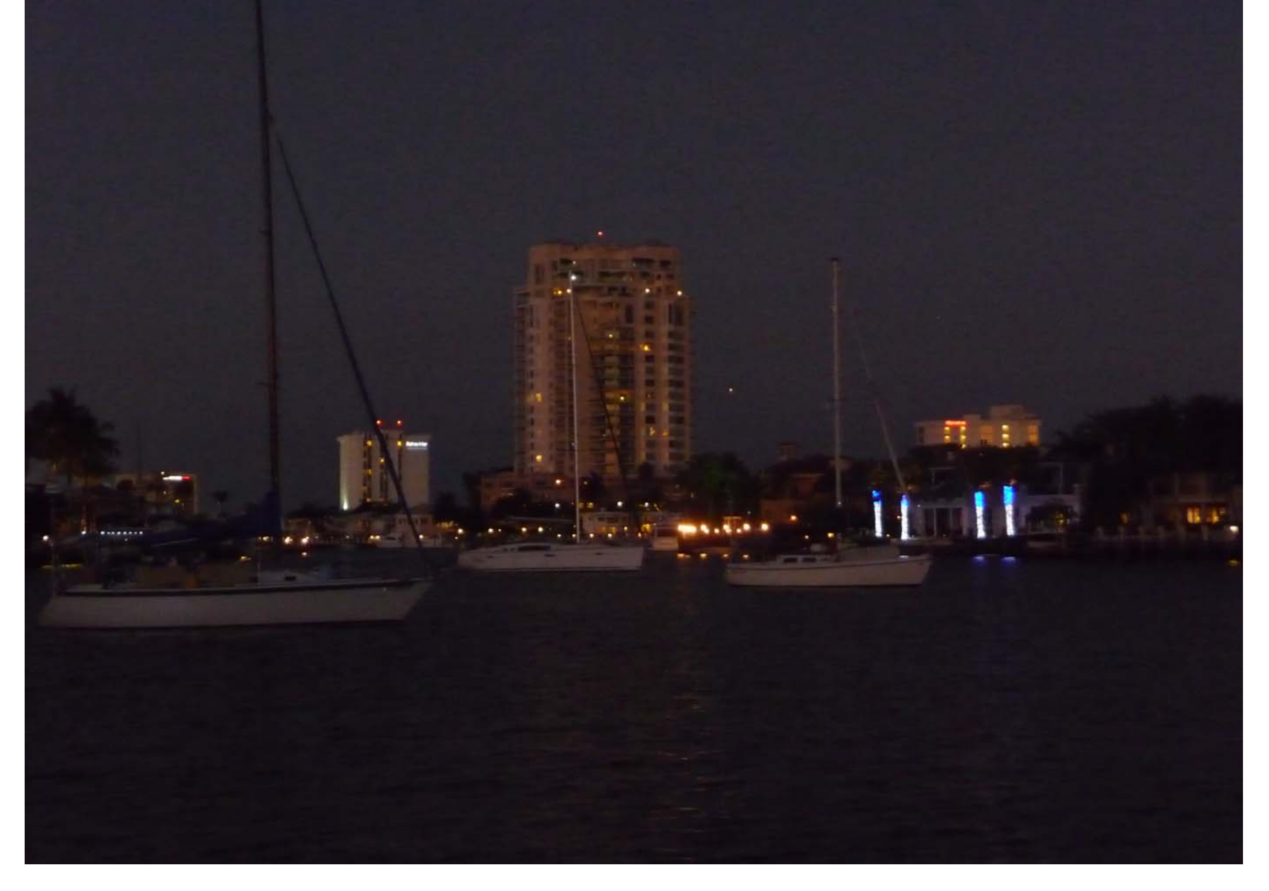
At anchor in Lake Sylvia in Fort Lauderdale.