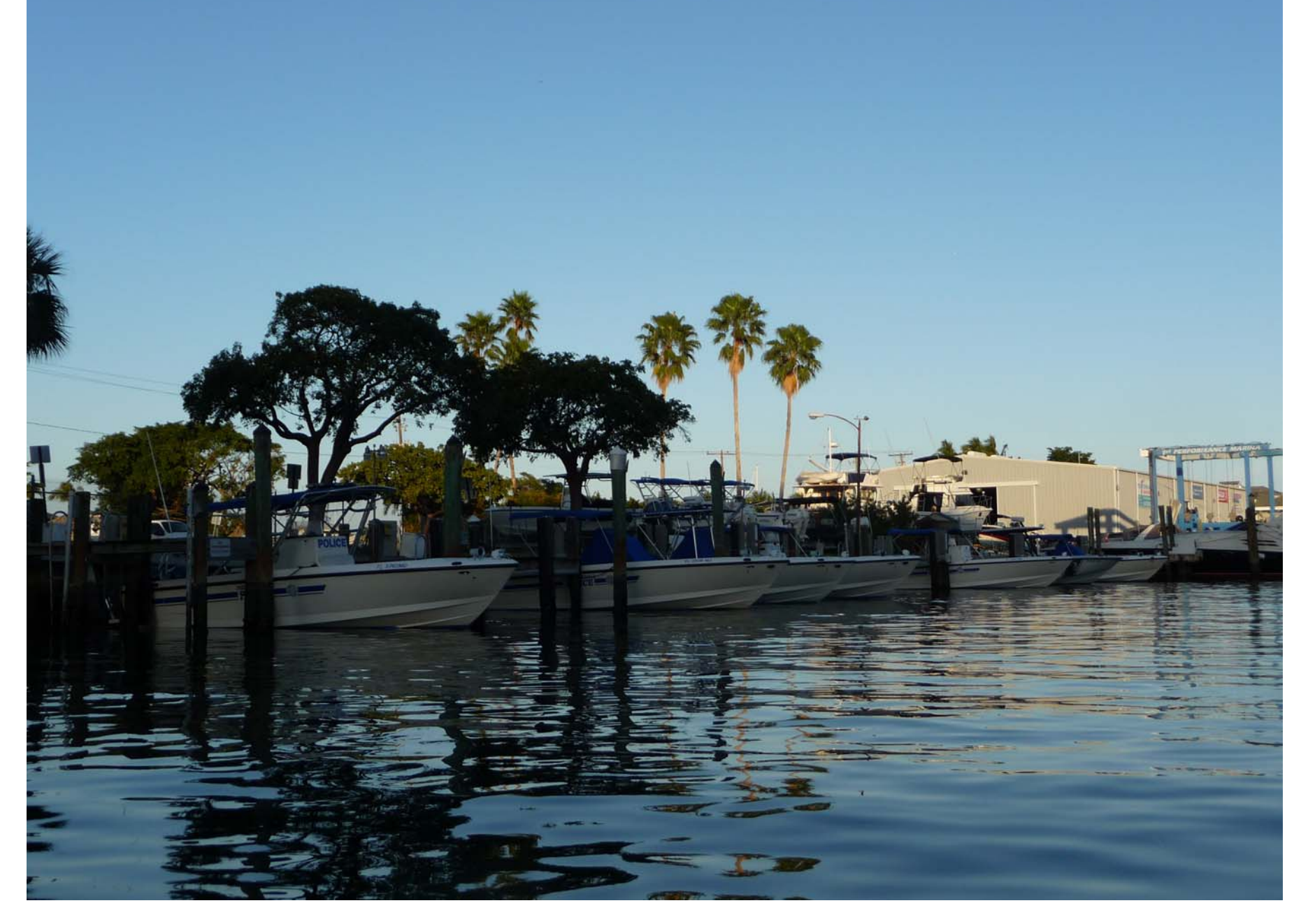
A fleet of Police boats in the 17th St. canal. Watch your speed!