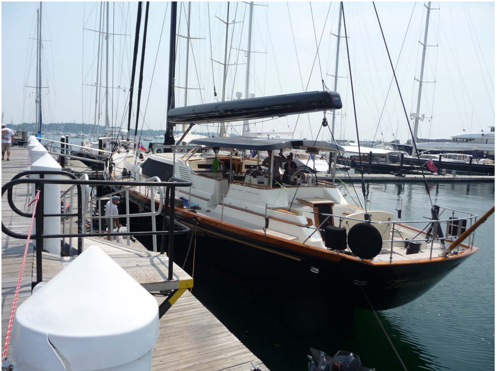
A gorgeous boat Tenacious at the Newport Shipyard. The guy who repaired our hydraulic steering ram was repairing something hydraulic on this boat.