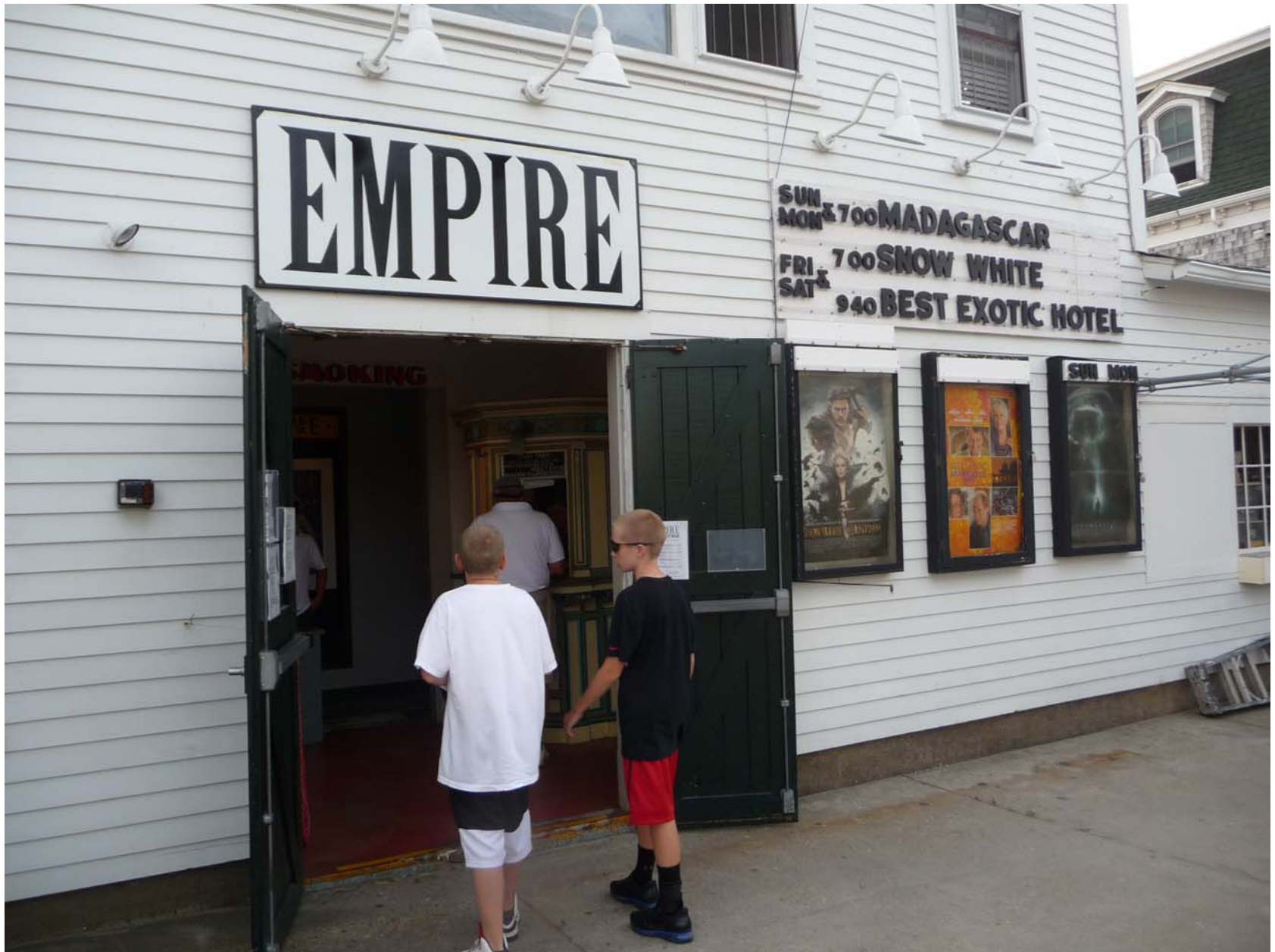
Nifty old movie theater. Enjoyed Snow White & the Huntsman.