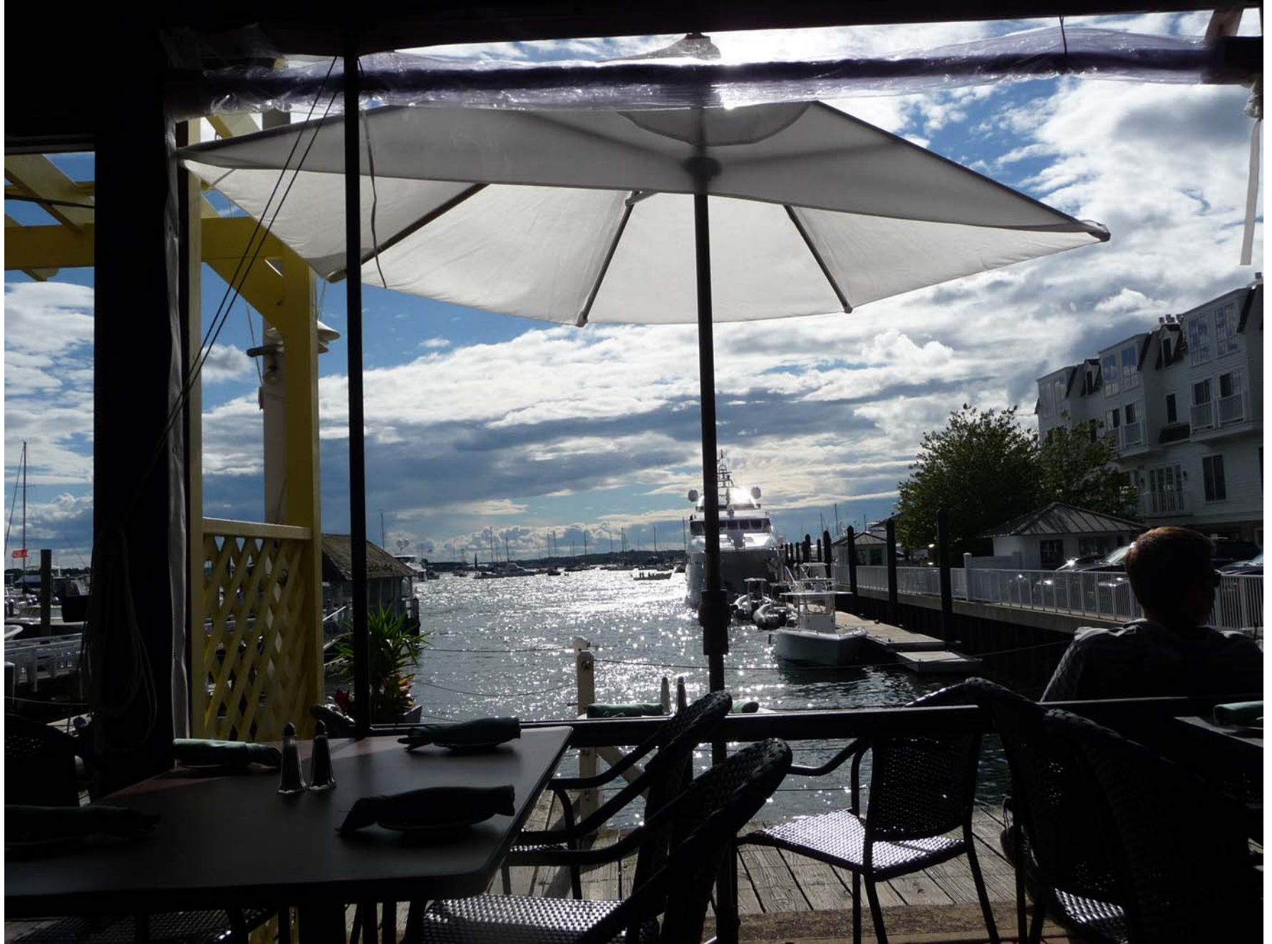
View from The Port restaurant of a very busy harbor.