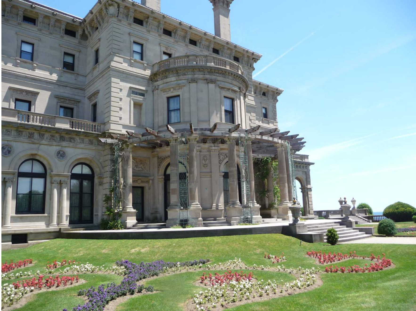
Side view of The Breakers mansion. Its interiors feature rare marble, alabaster, and gilded woods throughout.