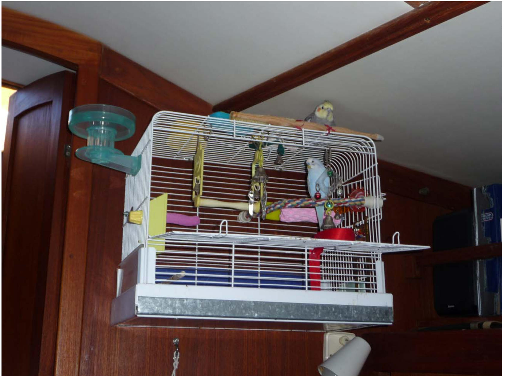
The Berdie birds, Quinn & Pepper, assume their positions in the boat.