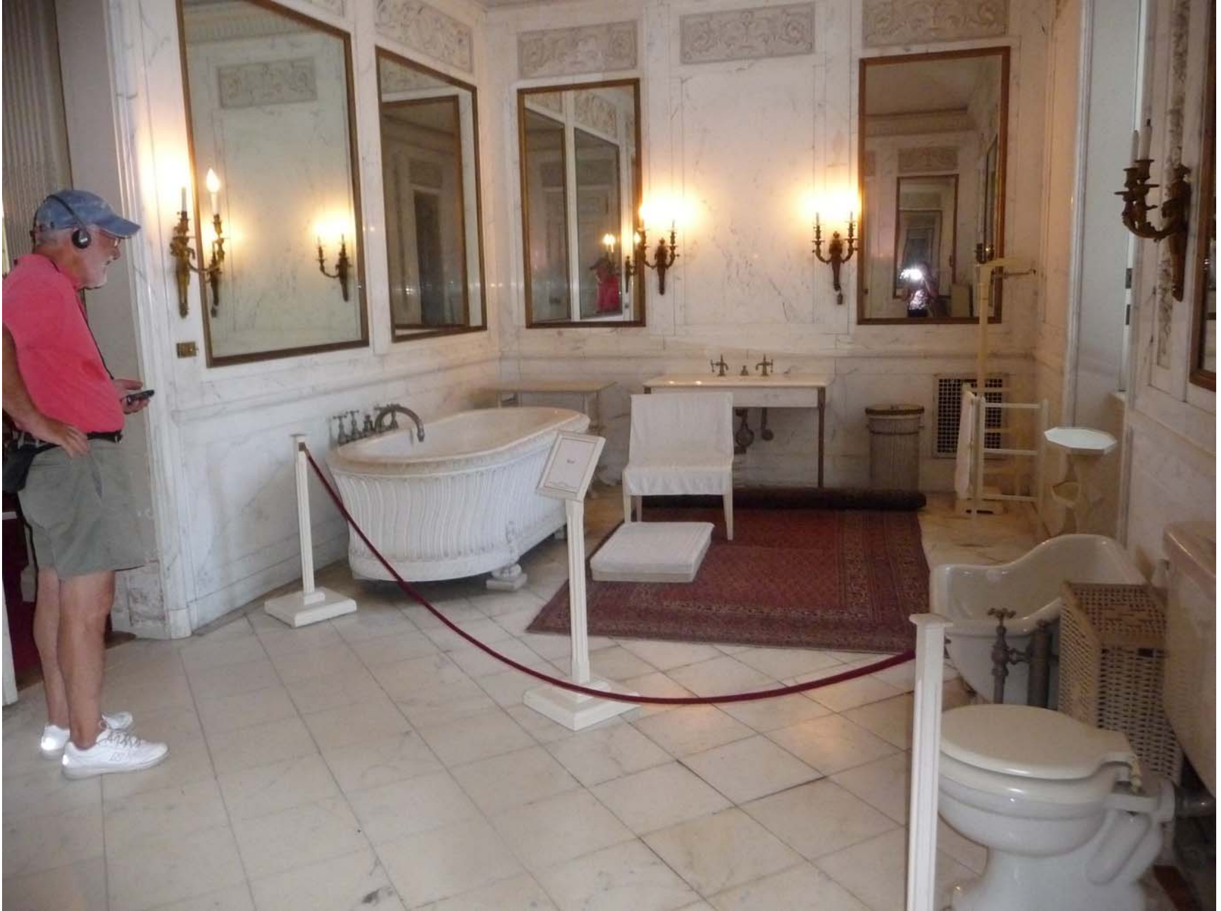
Cornelius' bathroom. The tub was carved out of one block of marble.