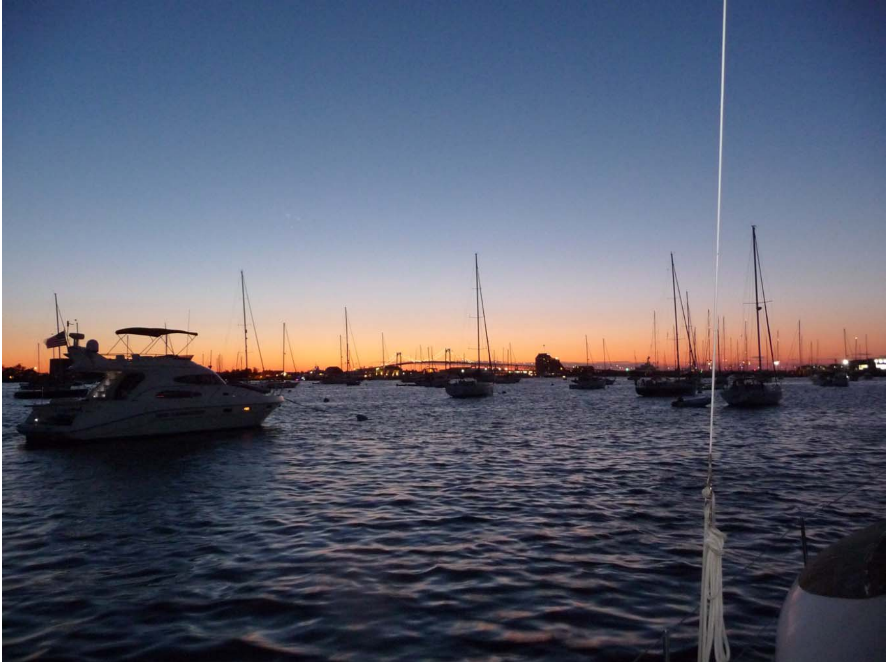
Sunset in Newport harbor. Just a few boats.