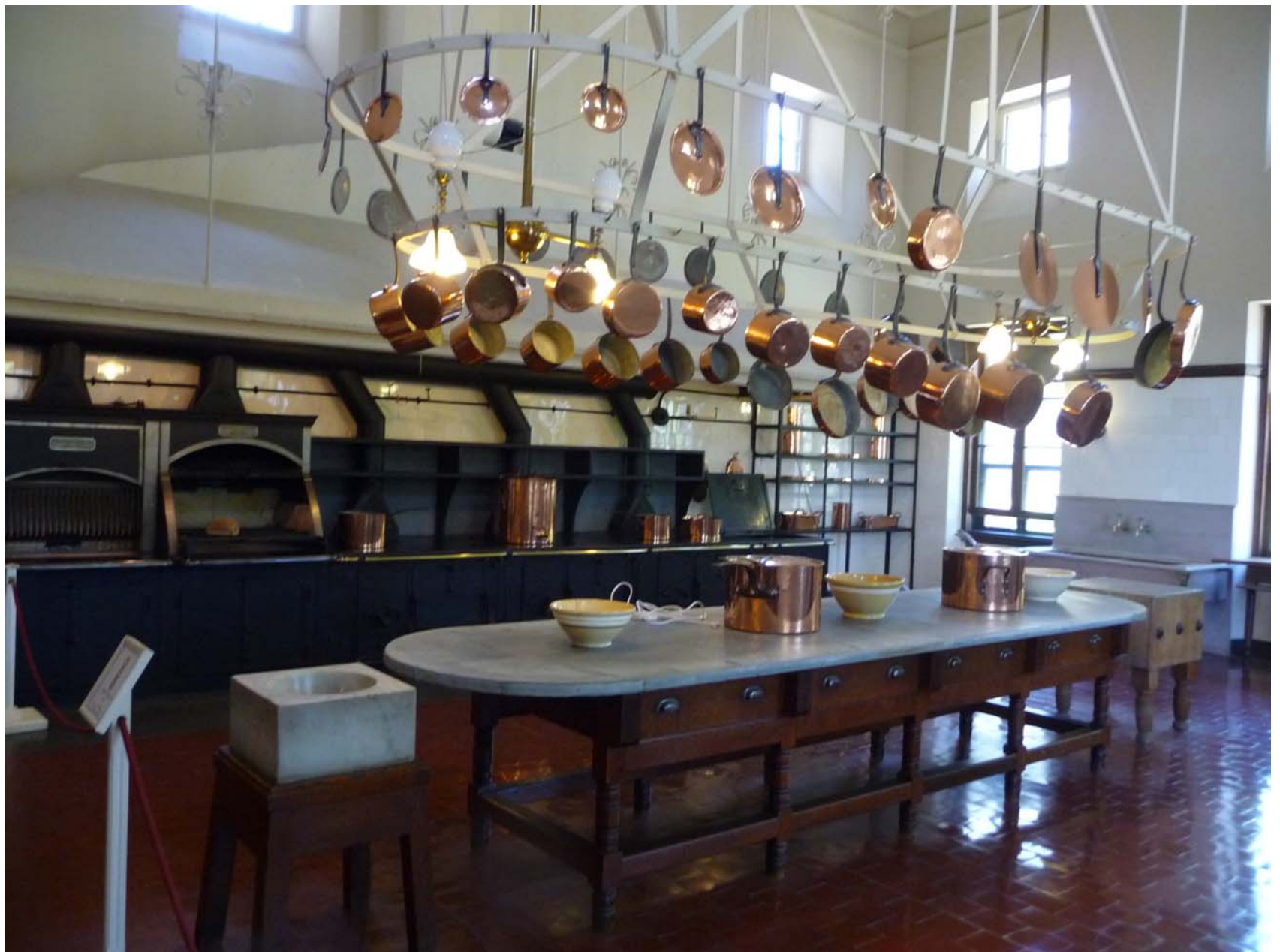
The Breakers totally French kitchen with a zinc work table.