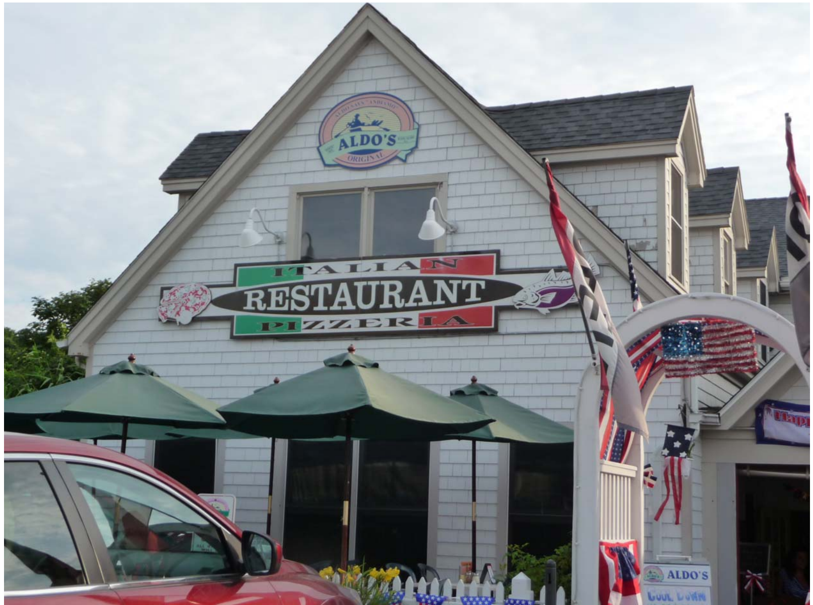
Had the BEST Italian dinner at Aldo's. Yum. The bakery is attached.