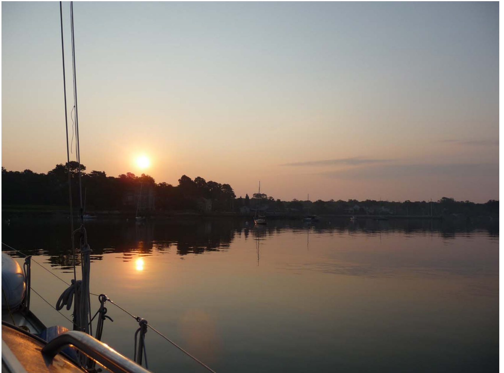
Sunrise at Potter's Cove.