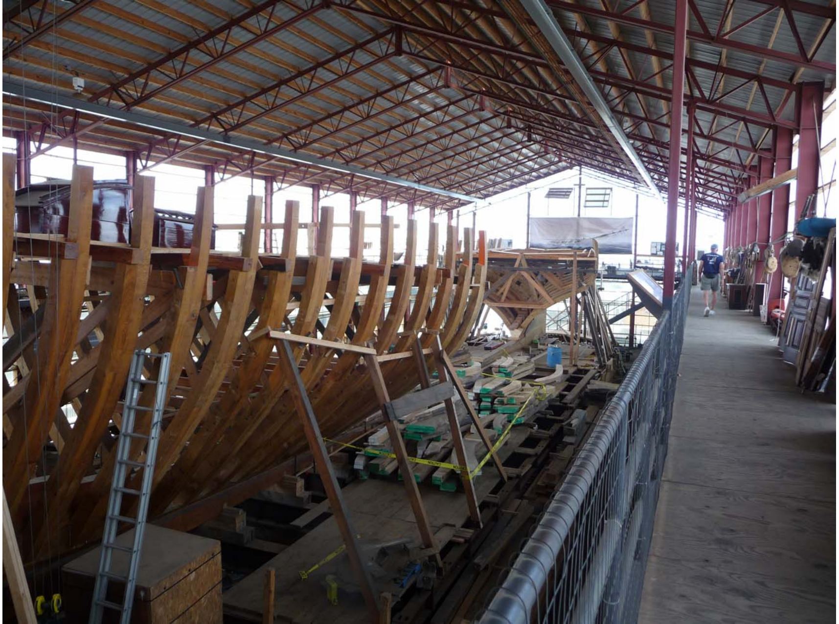
The Coronet . Largest private yacht in the world when it was built. Latter decades was owned by a missionary group who sailed it around the world many times.