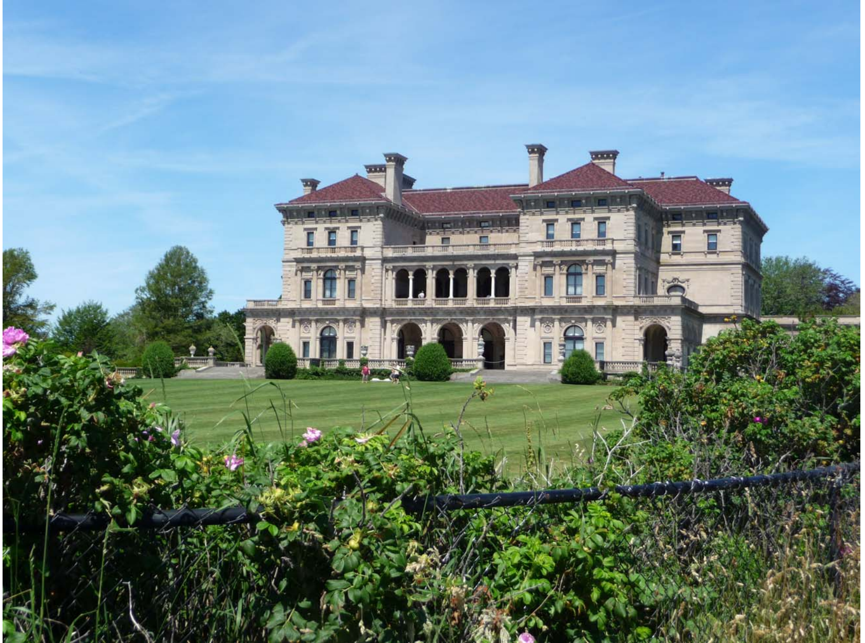
The Breakers is a surviving jewel of the New York Central Railroad fortune, a 70 room, 1895 summer estate of Cornelius Vanderbilt II.