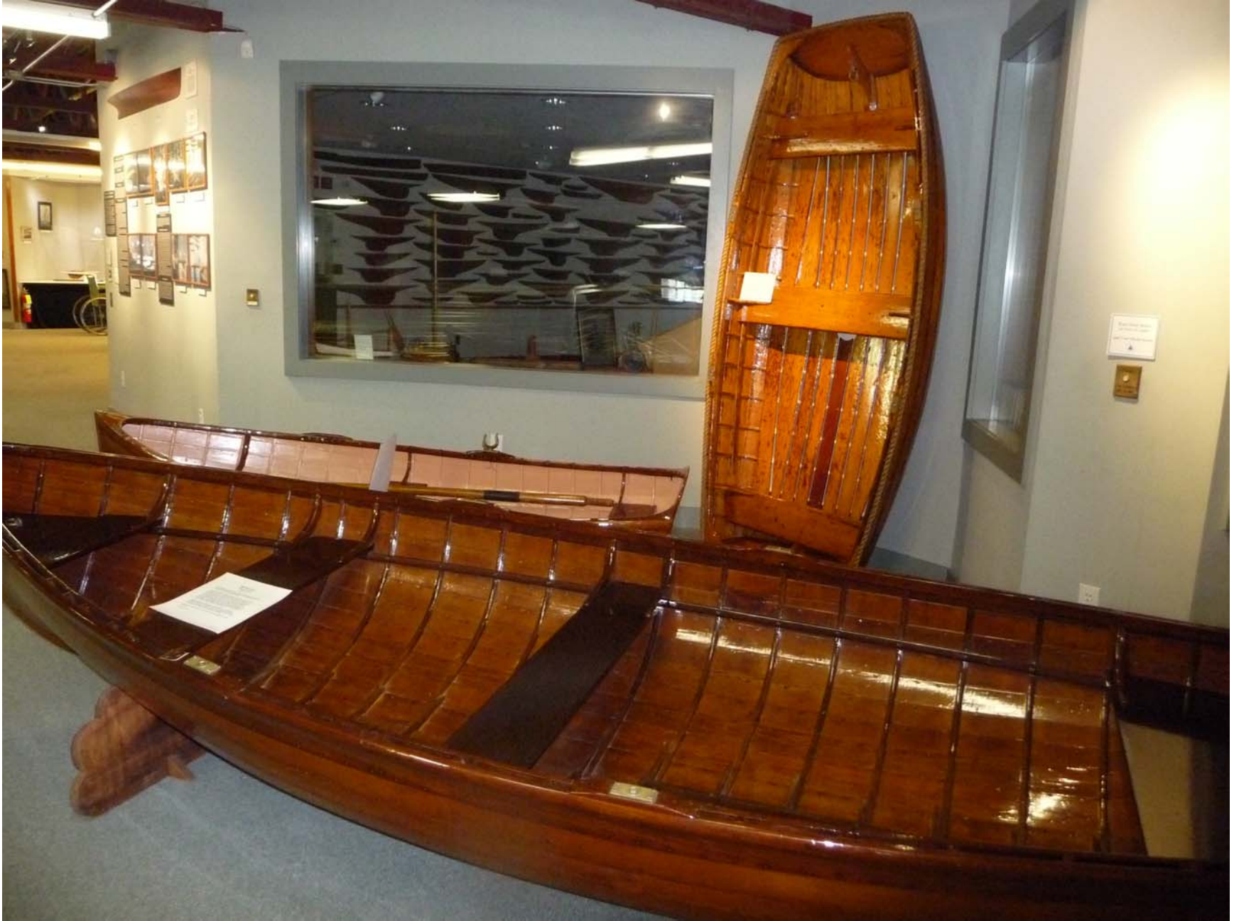
Herreshoff built this little row boat called Gem for his daughter.