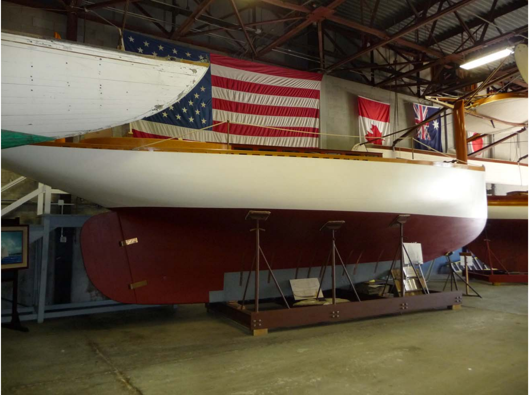
Nathaniel Herreshoff built the Clara when he was a teenager and sailed it nonstop to NYC and back to Bristol.