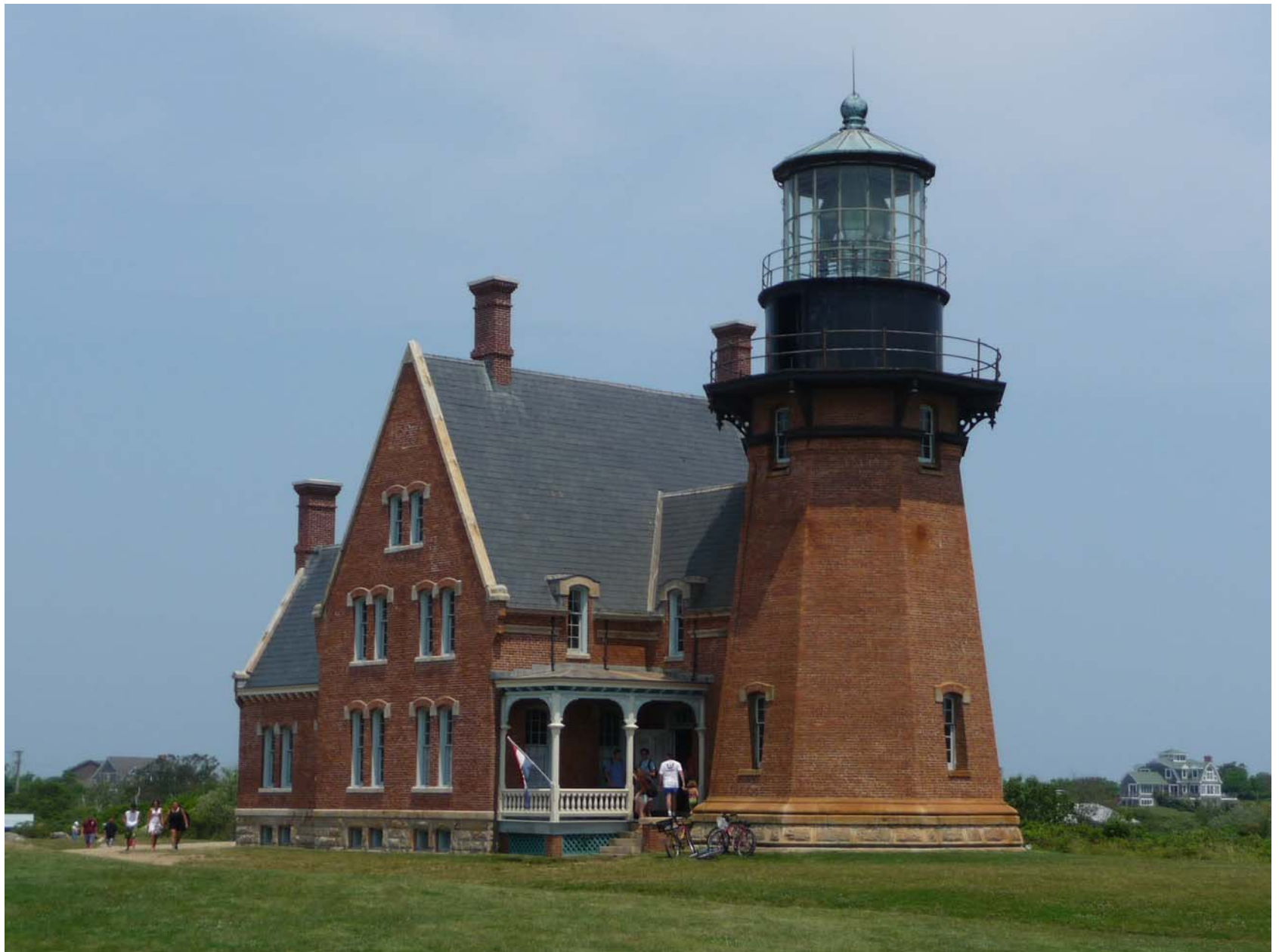
Southeast Lighthouse. In 1985 they had to move it back from falling off the cliff.