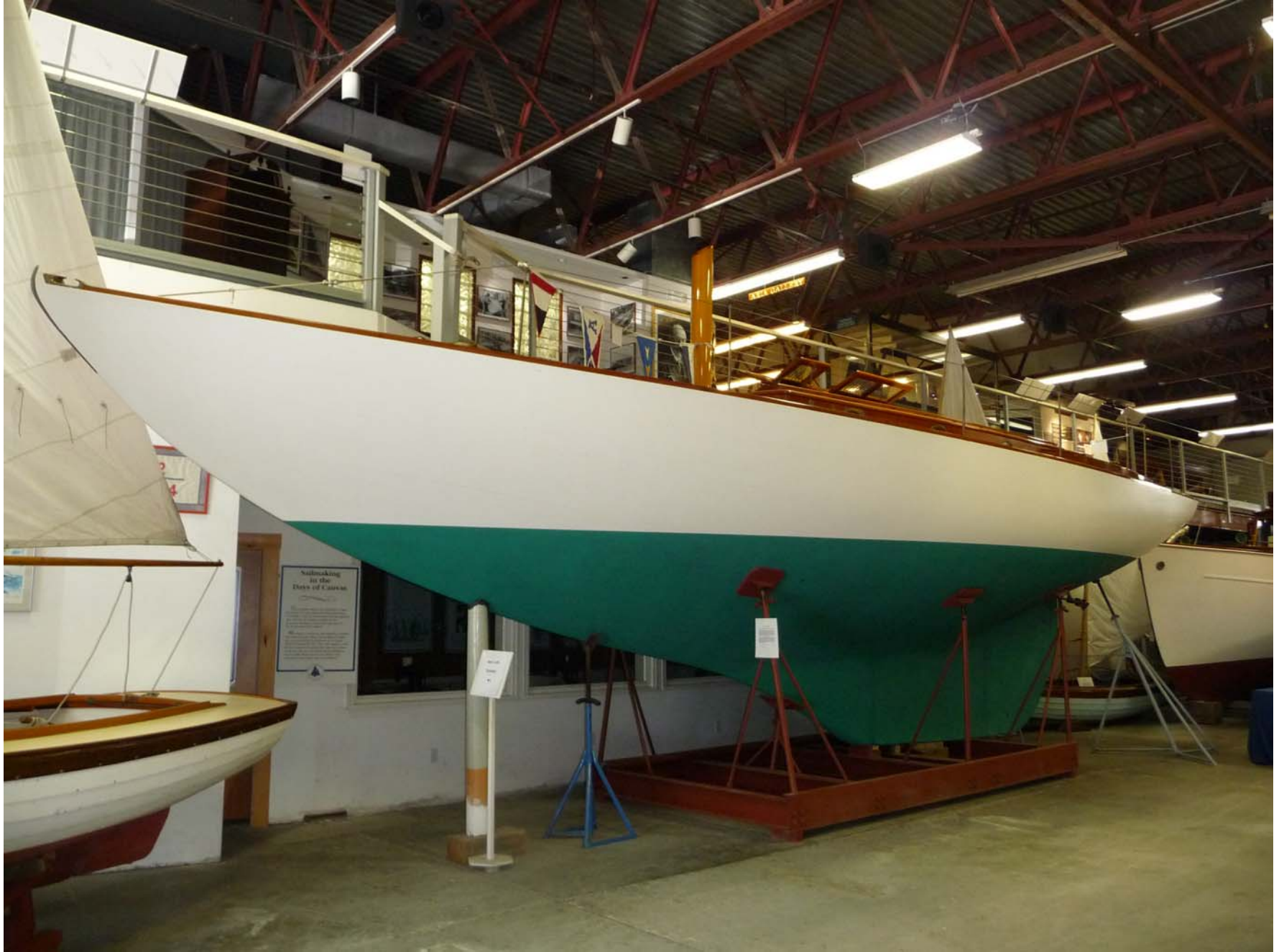
A lovely Herreshoff sloop.