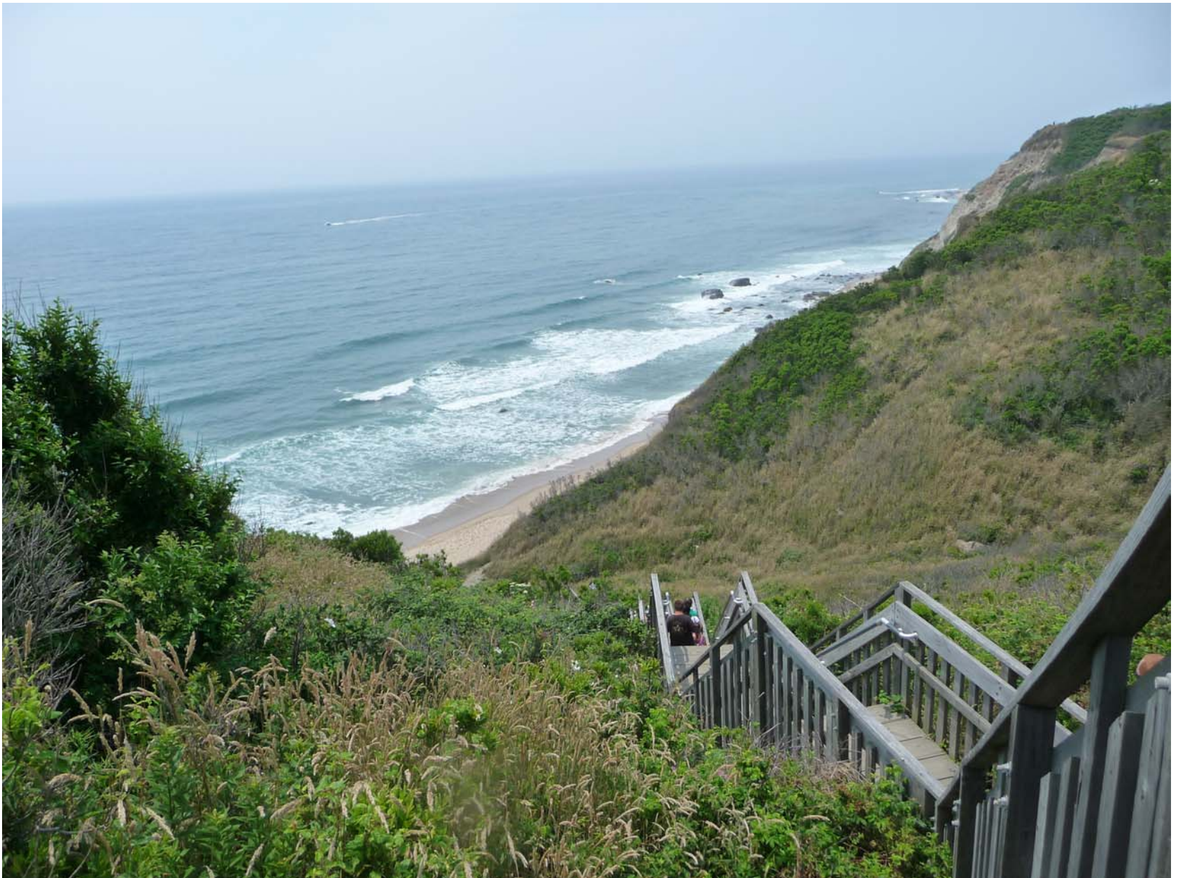
The cliff near the Southeast Lighthouse.