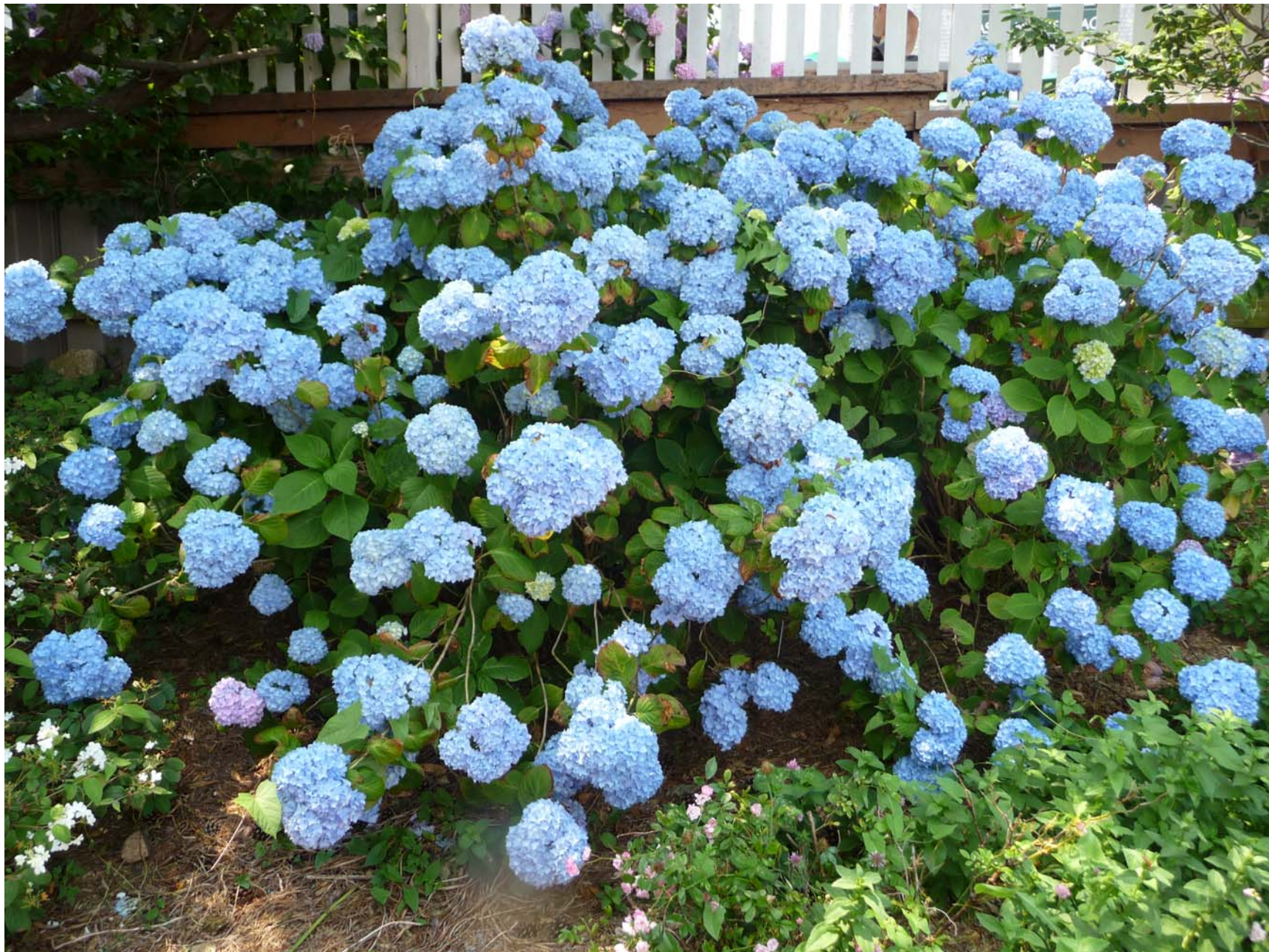
Blue hydrangeas near the Old Harbor of Block Island.