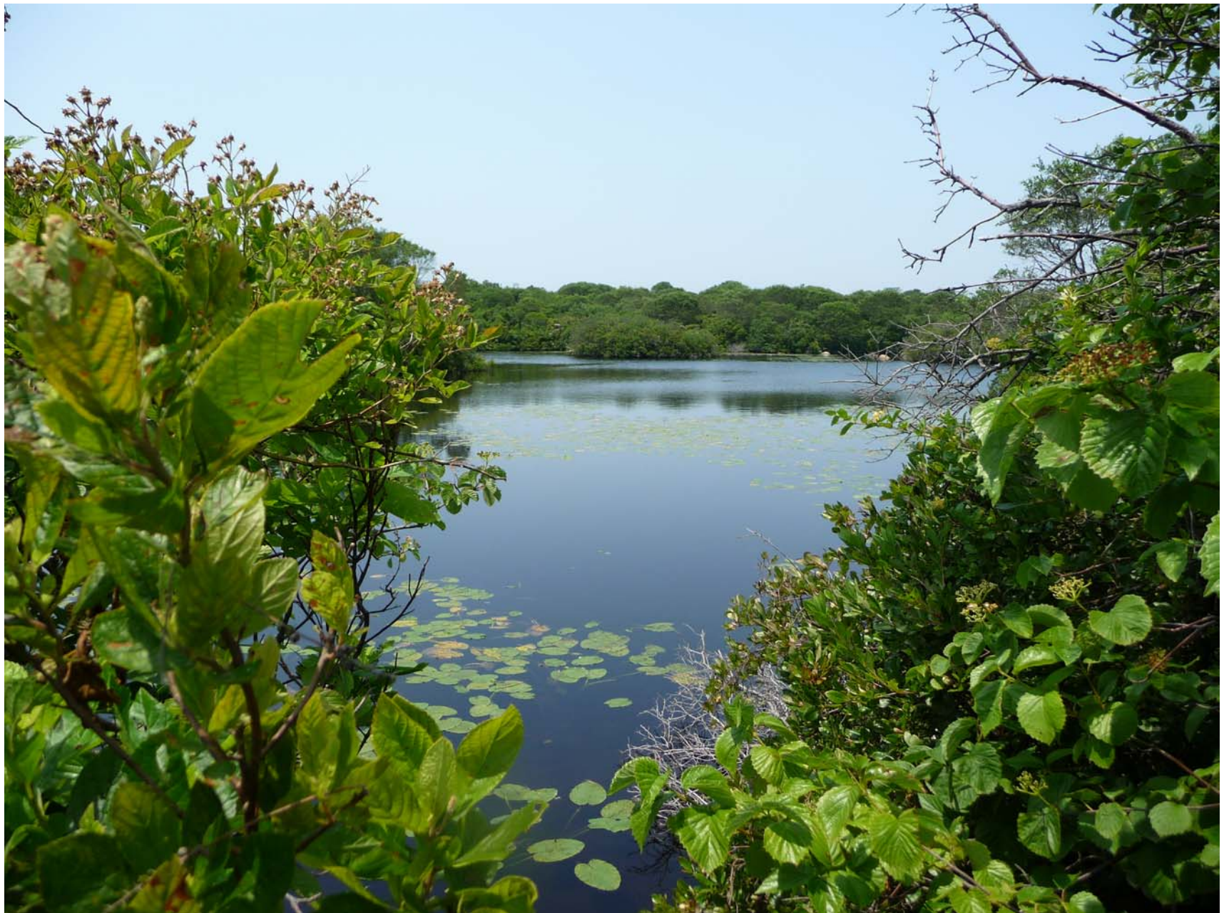
We walk back to town from the lighthouse and this was a pretty scene.