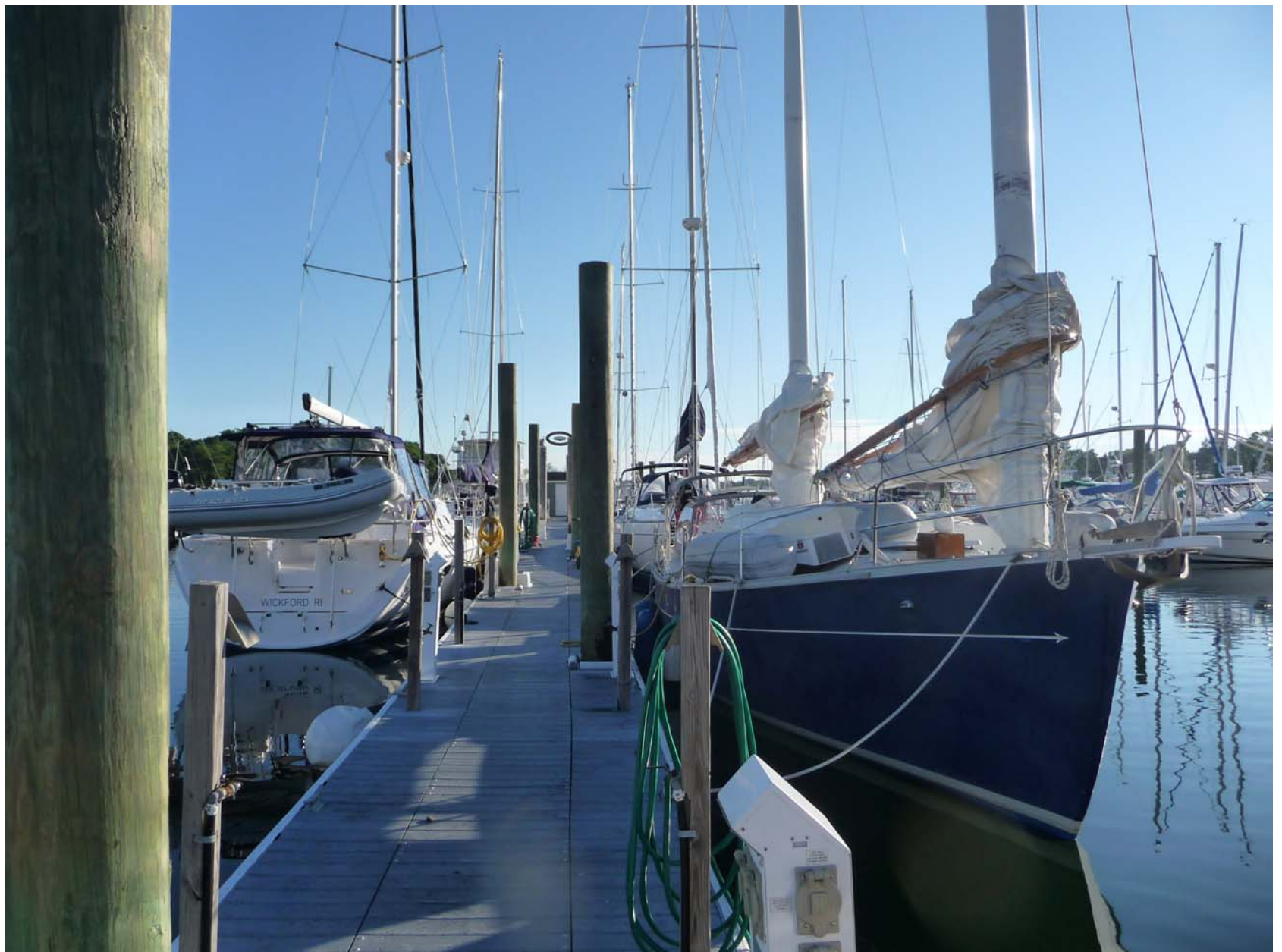
Running Free all set to cast off the lines in Wickford, RI.