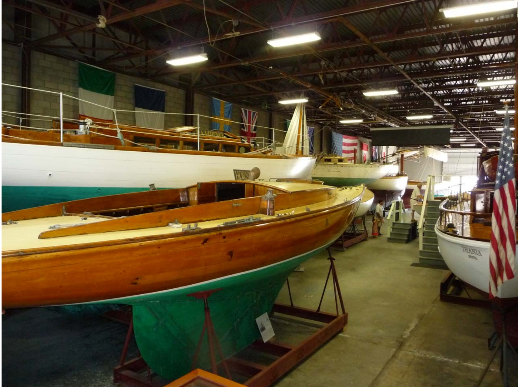
Inside the museum.