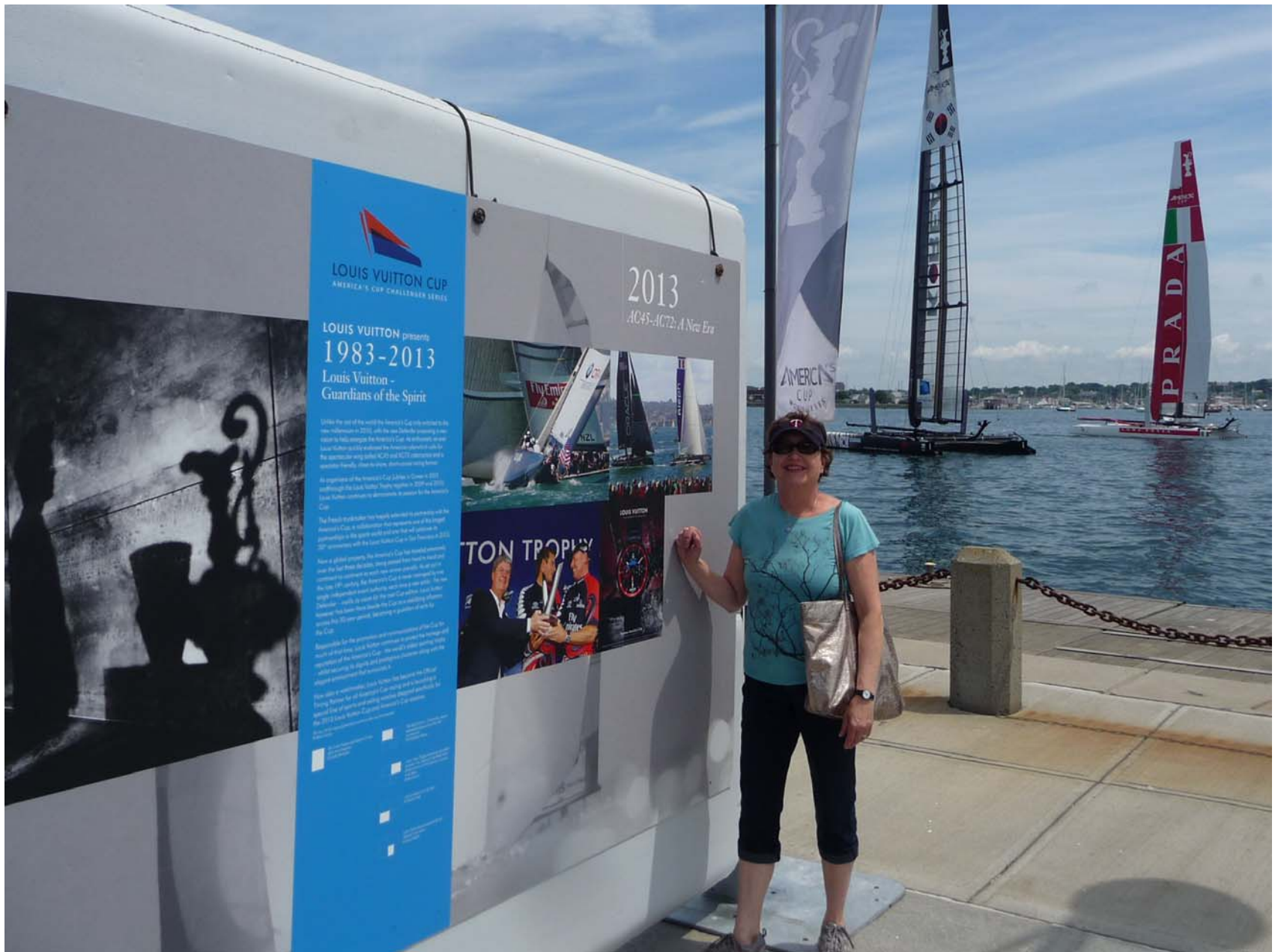
AC World Series June 26-July1, 2012, Newport, RI.