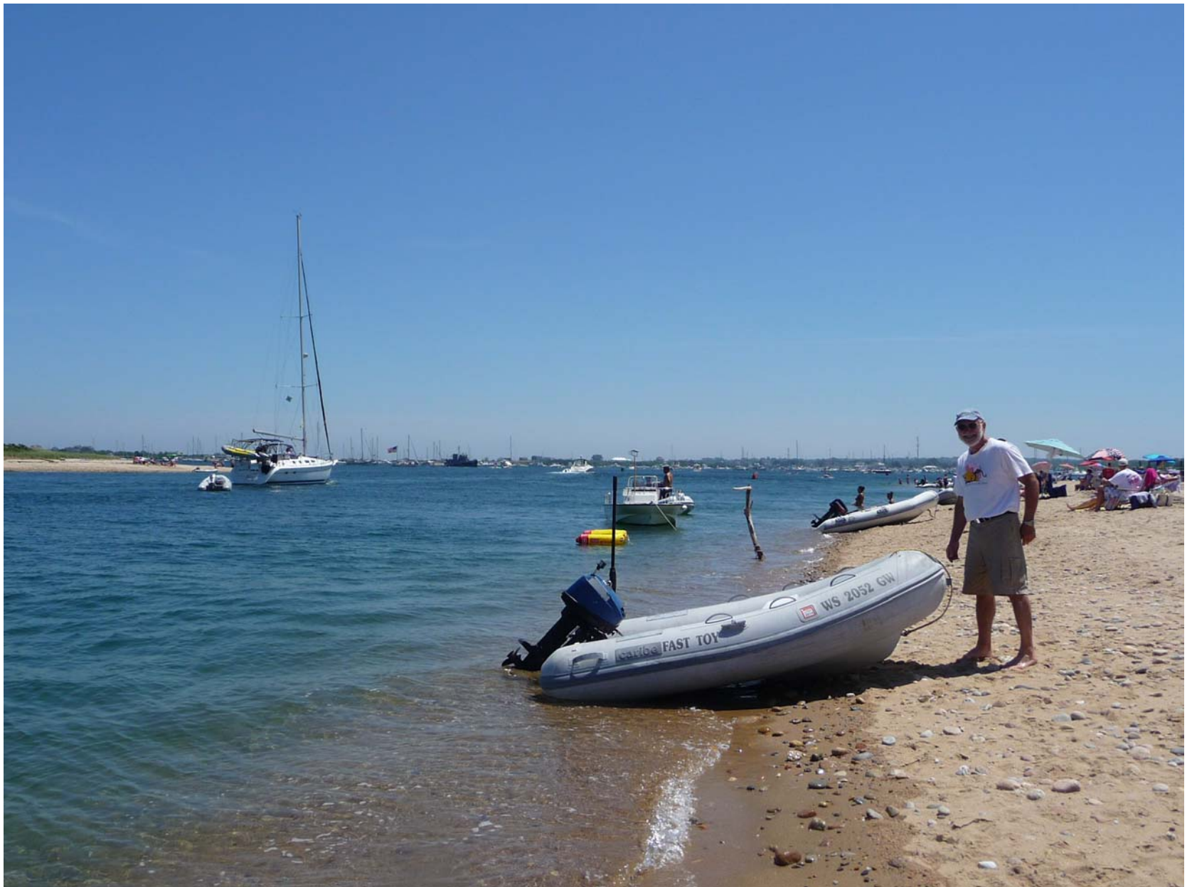
We take the dinghy to the entrance to Great Salt Pond. A parade of boats that weekend before the 4 th .