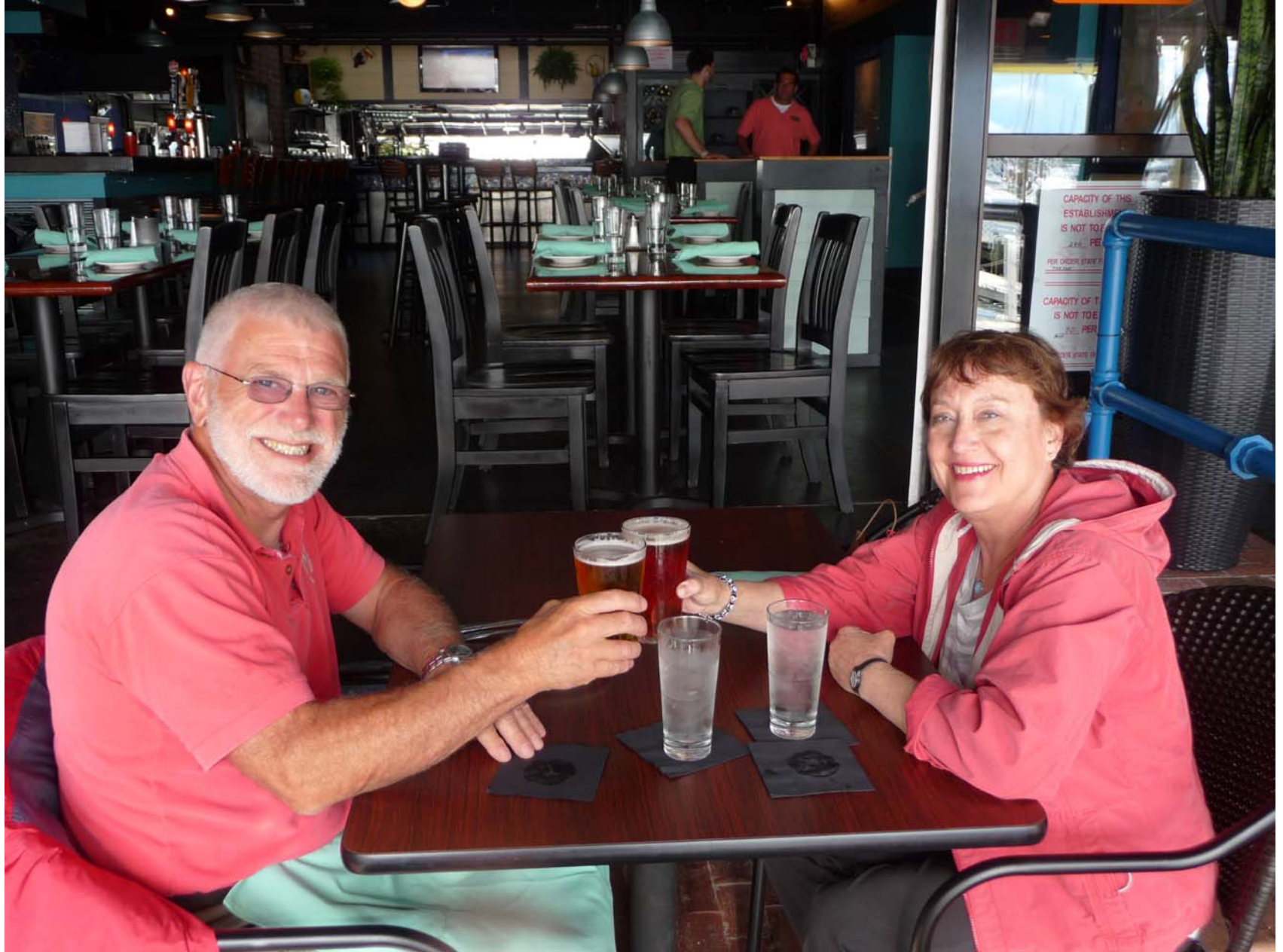
We dine at The Port next to the Ann St. Pier where the dinghy dock is located. We toast the beginning of a year on Running Free. Good lobster dinner too!