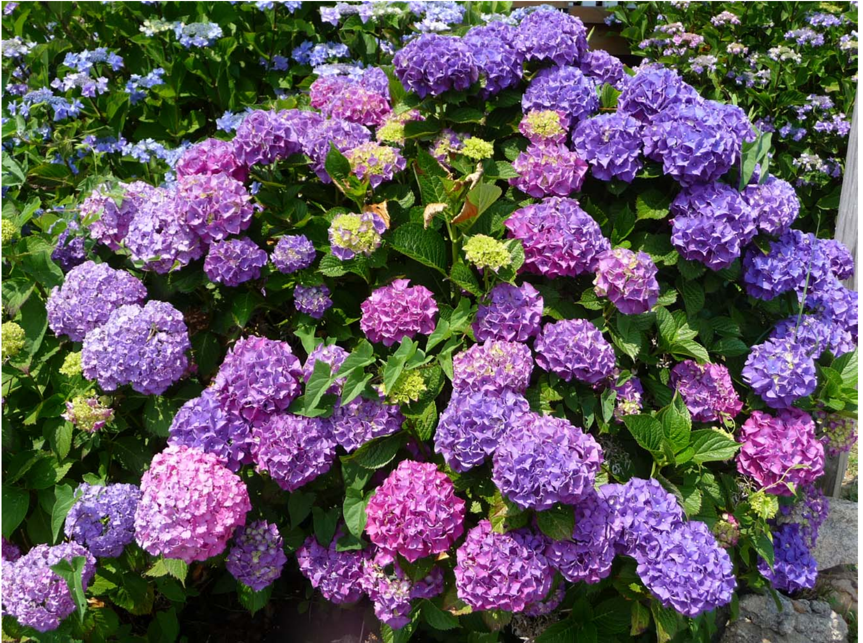
Gorgeous hydrangeas on Block Island.