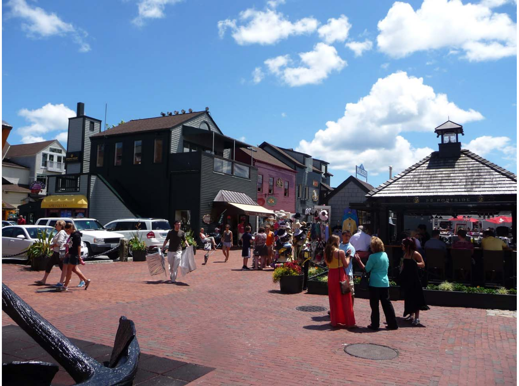
A festive Bannister's Wharf in Newport.