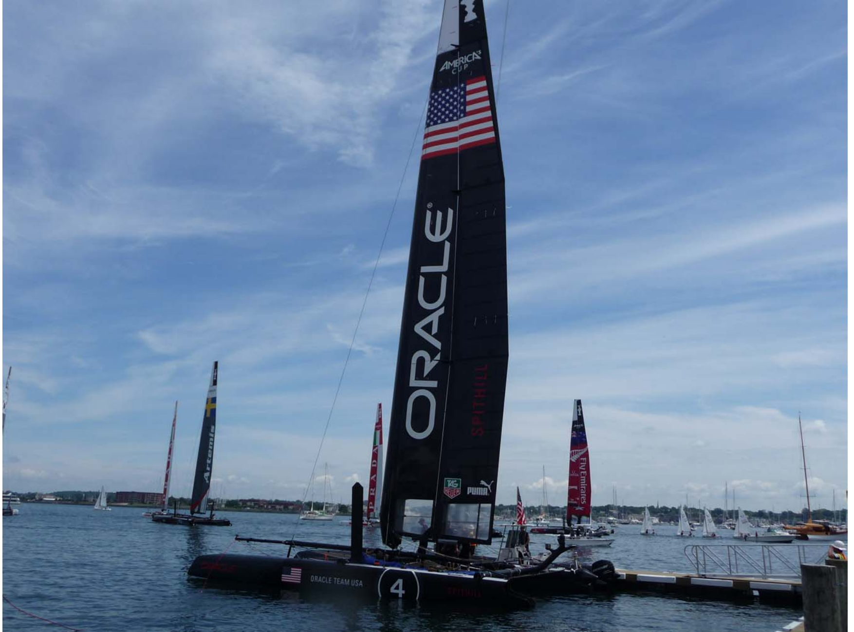
America's Cup World Series 45' catamaran Oracle .