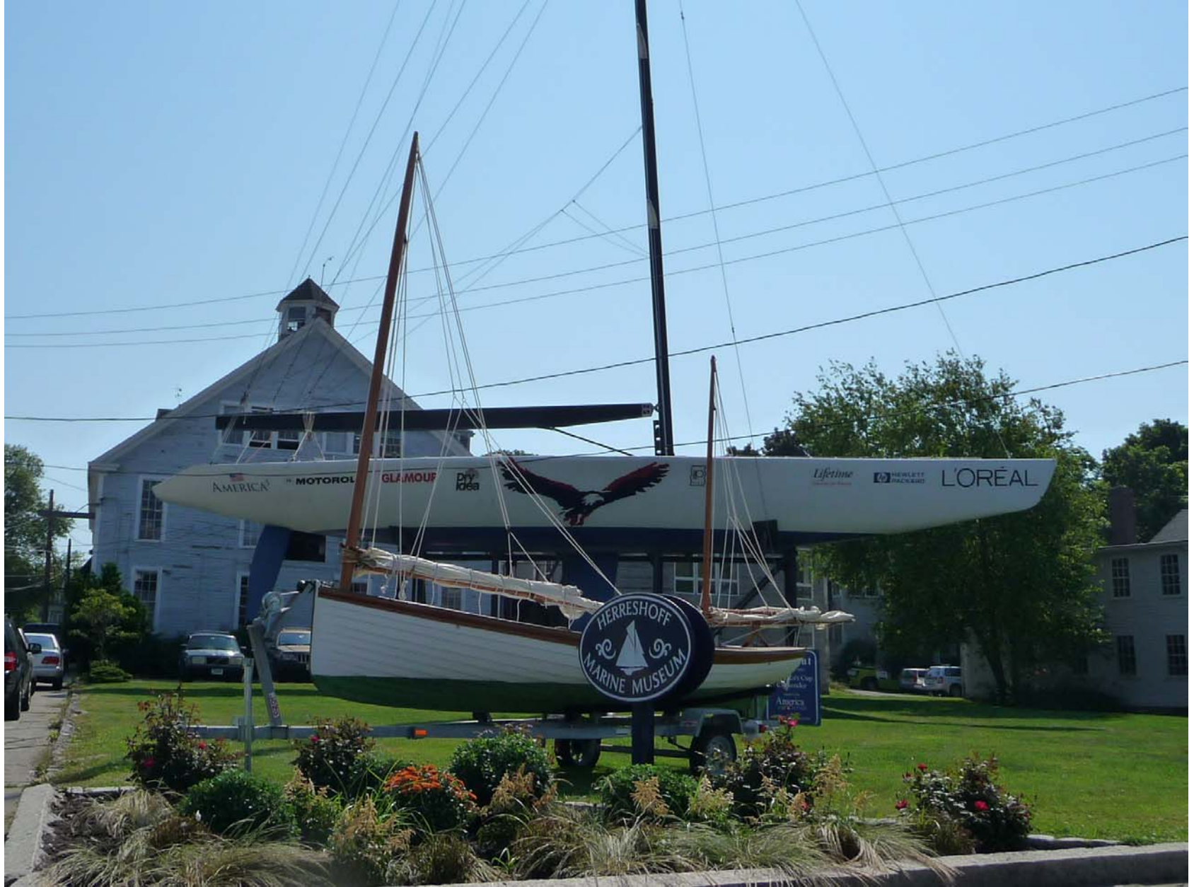
Bristol, RI, we tour the Herreshoff Museum.