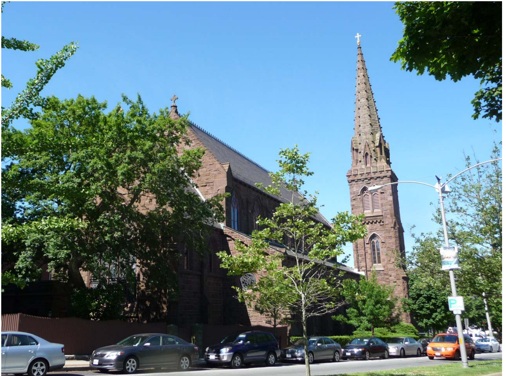
This is the church where Jack & Jackie Kennedy got married, 9/12/53. On Memorial Drive in Newport.