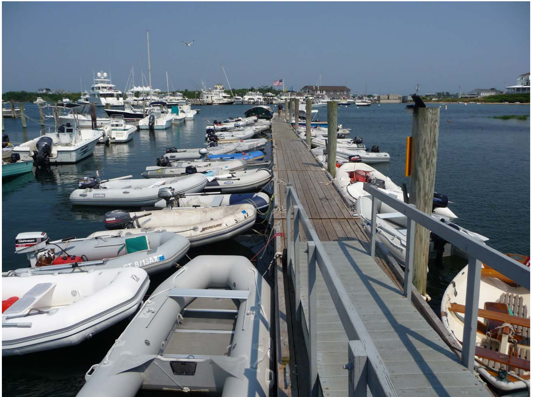
Just a few dinghies tied up in Block Island's Great Salt Pond.