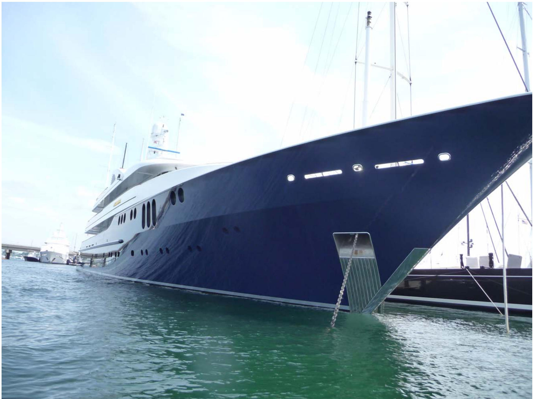
Newport harbor is full of big boats, this one included.