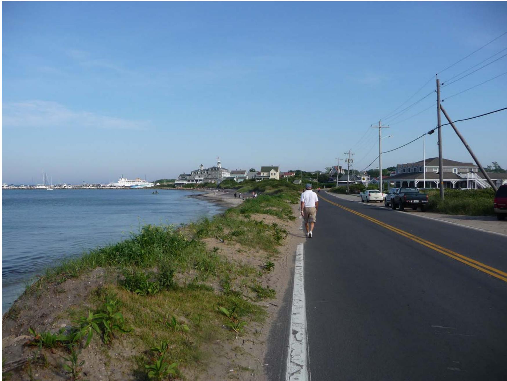
We walk from Great Salt Pond to Old Harbor to dine & see a movie.