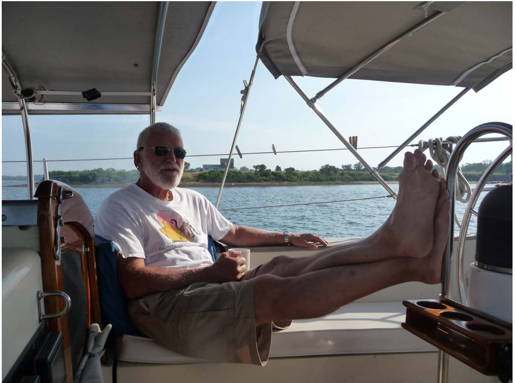
We anchor in Great Salt Pond on Block Island.