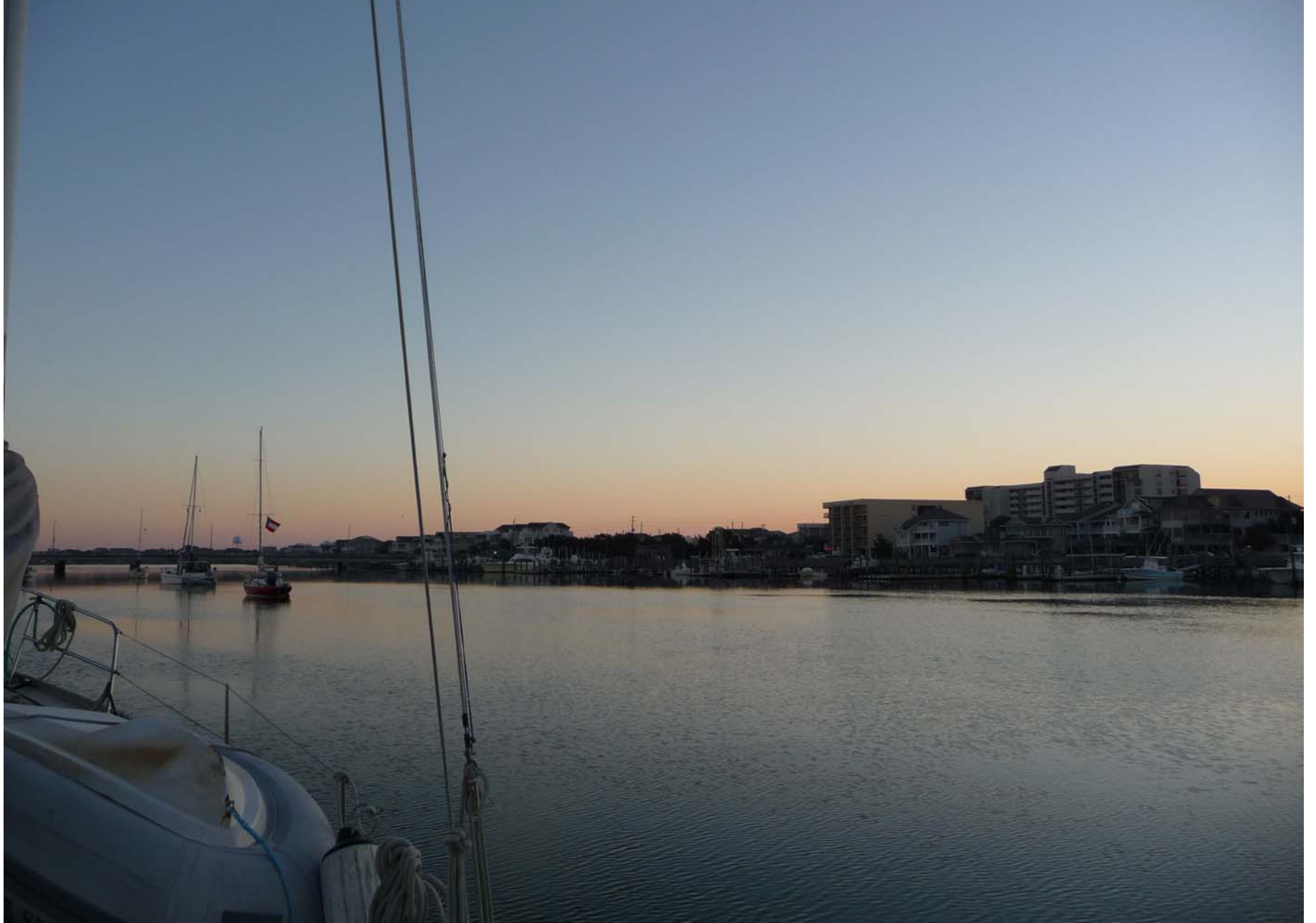
An early start leaving Wrightsville Beach for Southport, NC.