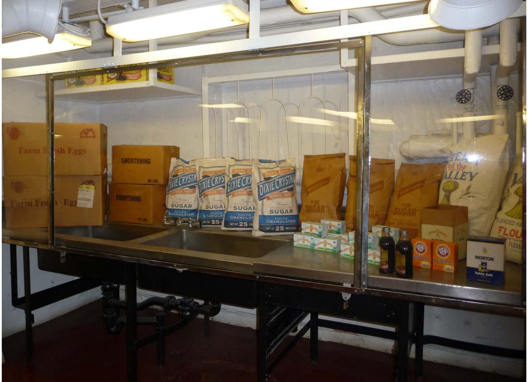
Ingredients needed to make 10,000 chocolate chip cookies.