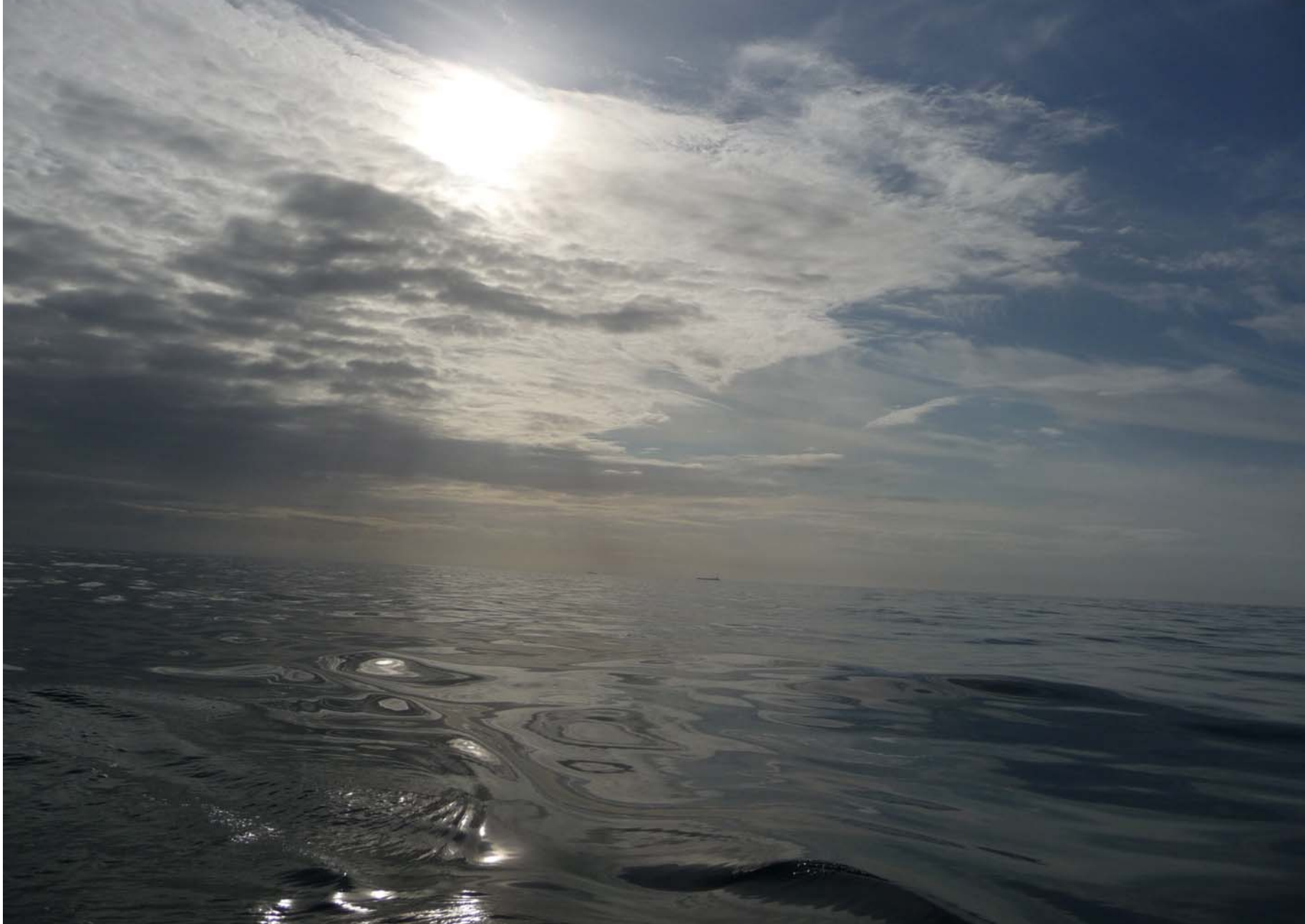
The morning of our 27 hour, 148 mile offshore from Southport, NC, to Charleston, SC.