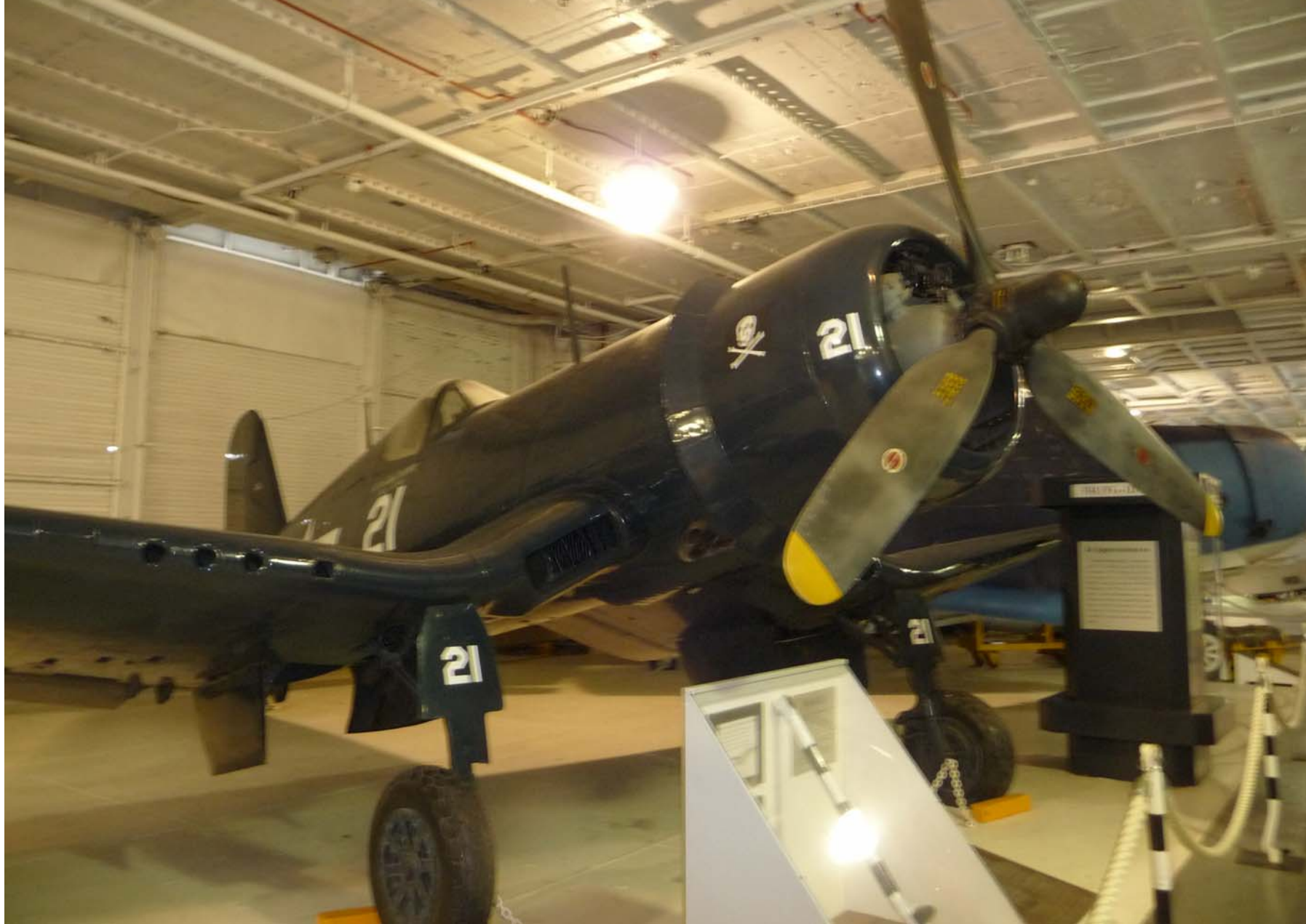
WWII Corsair fighter plane.