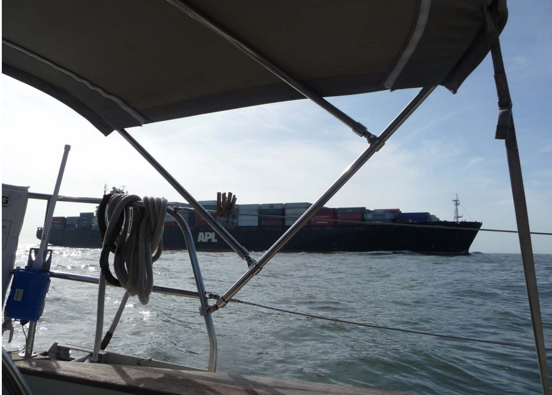
A big container ship passes us in the Charleston breakwater.