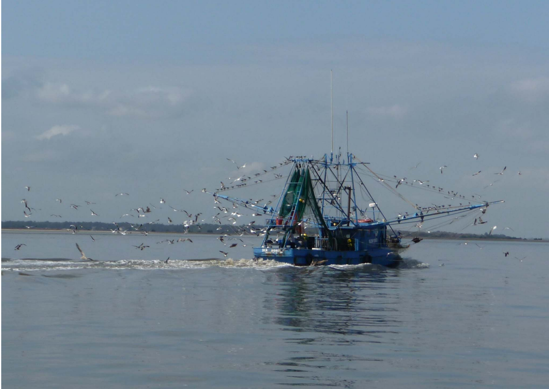
Hundreds of birds savoring what the shrimp boat tosses overboard within the Charleston breakwater.