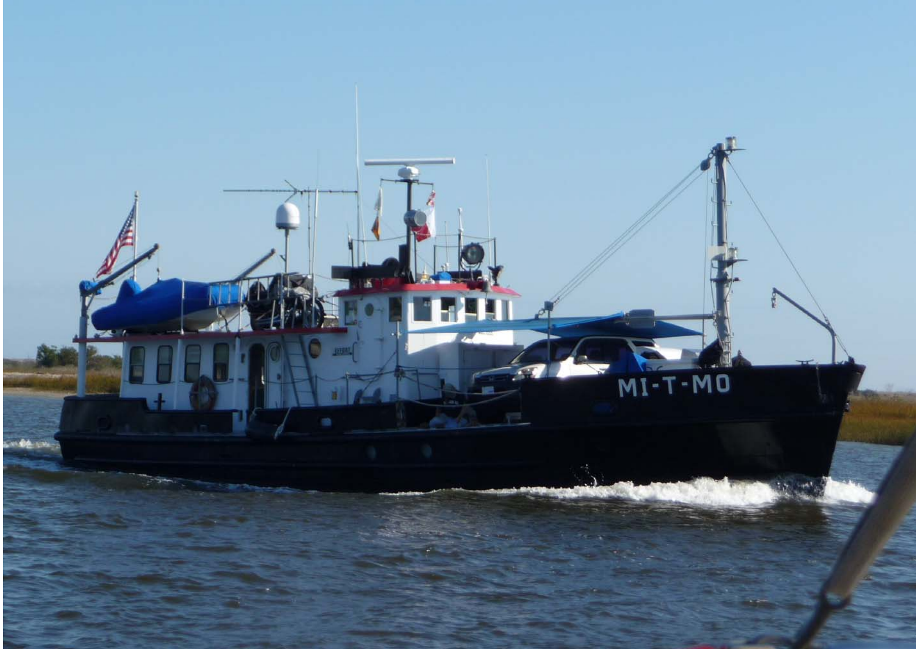
We get passed by Mi-T-Mo in the ICW. On deck: car & Harley.