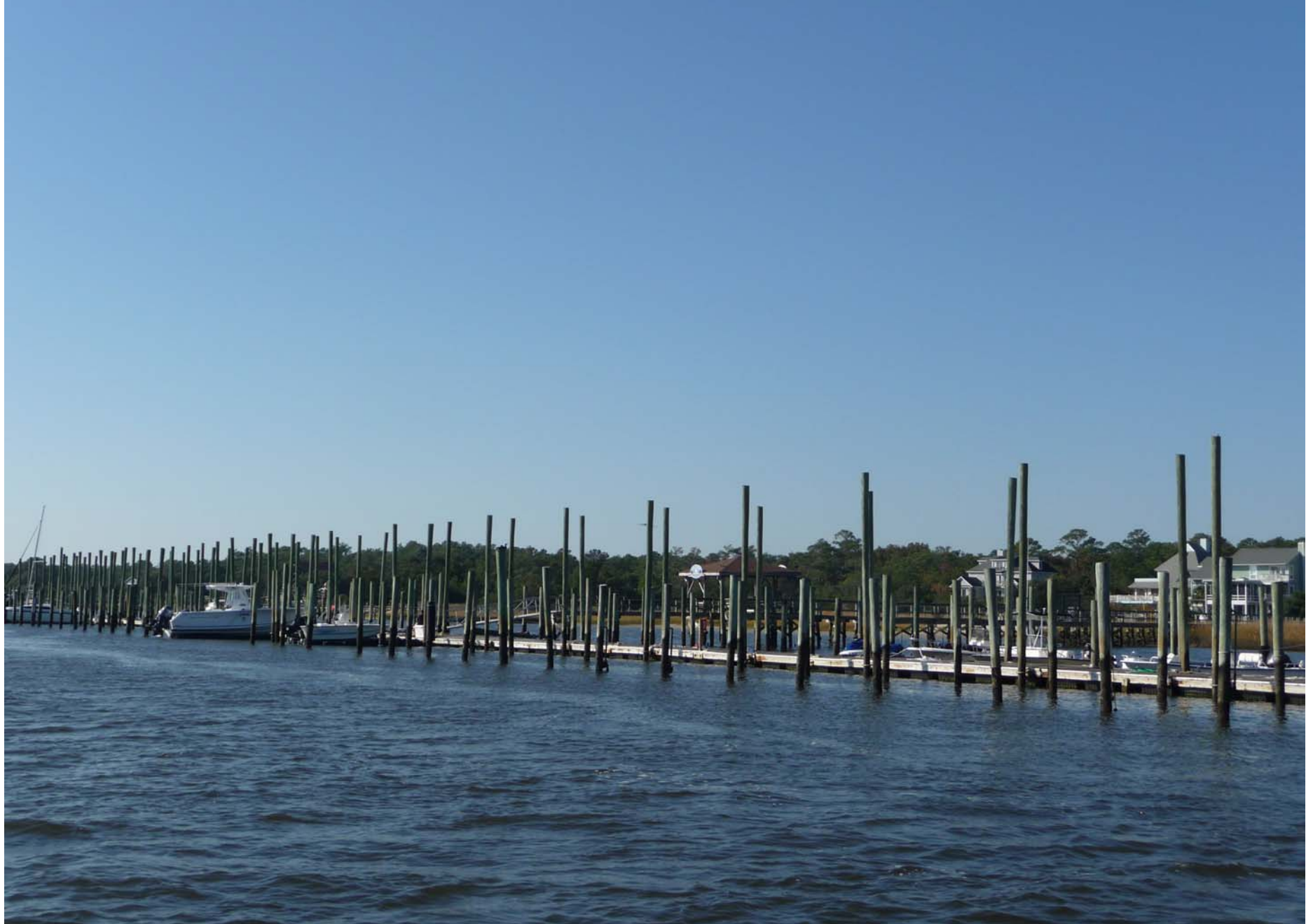
Very tall posts on floating docks ever ready for high water.