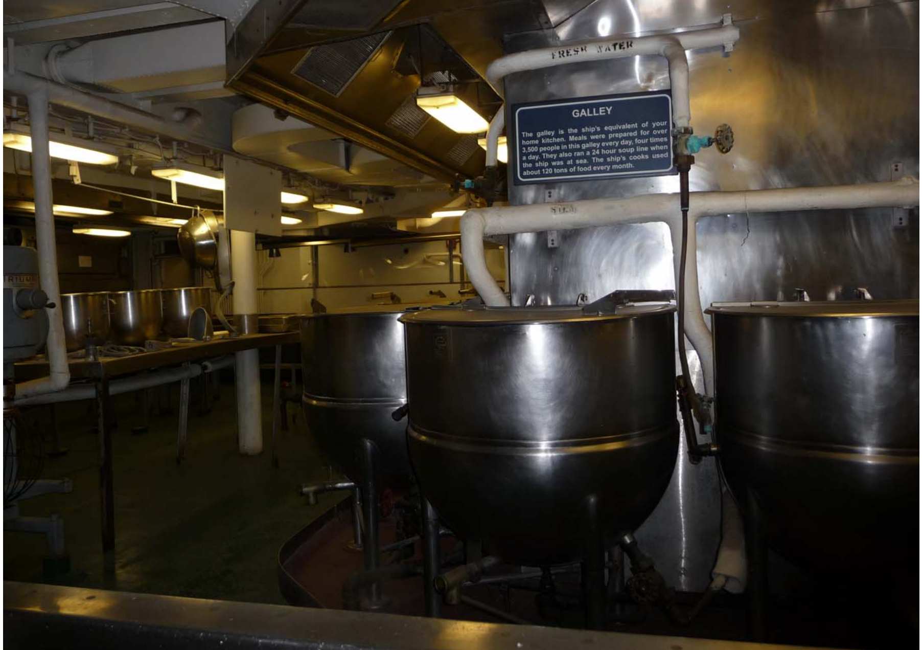
The main Galley of the Yorktown.