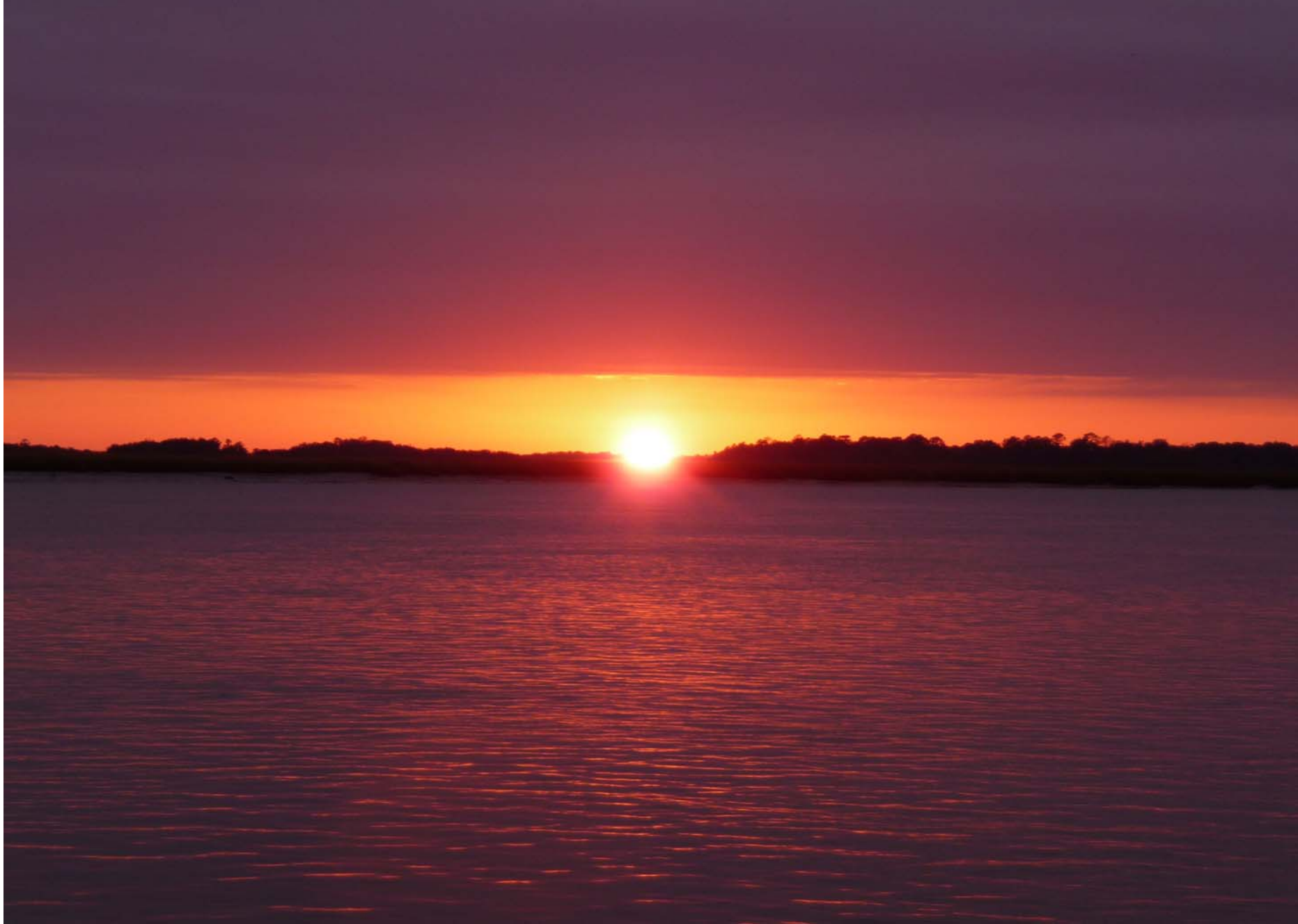
Sunset at anchor at Fenwick Island, ICW, Nov. 17, 2012.