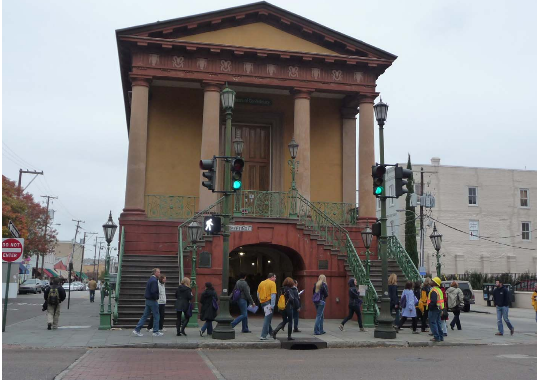
Charleston's historic marketplace.