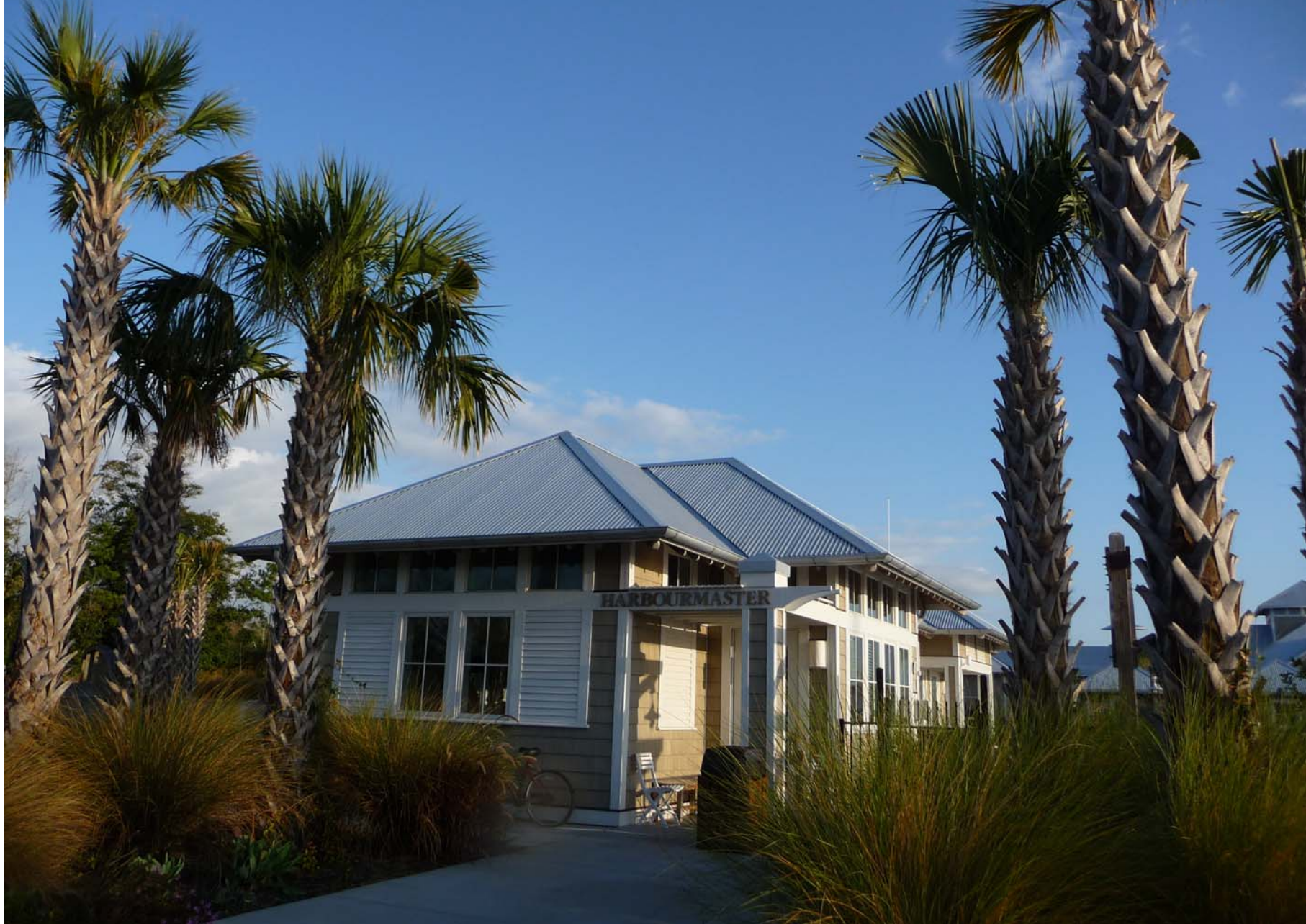
Deep Point Marina, Southport, NC. A fine marina with free laundry.