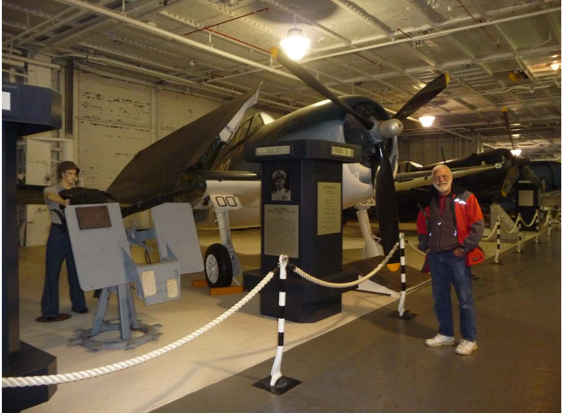
Many WWII fighter planes on exhibit in the Yorktown.