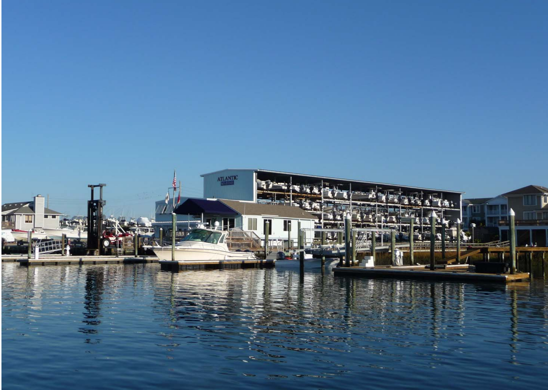
Boat storage to the max in Wrightsville Beach.