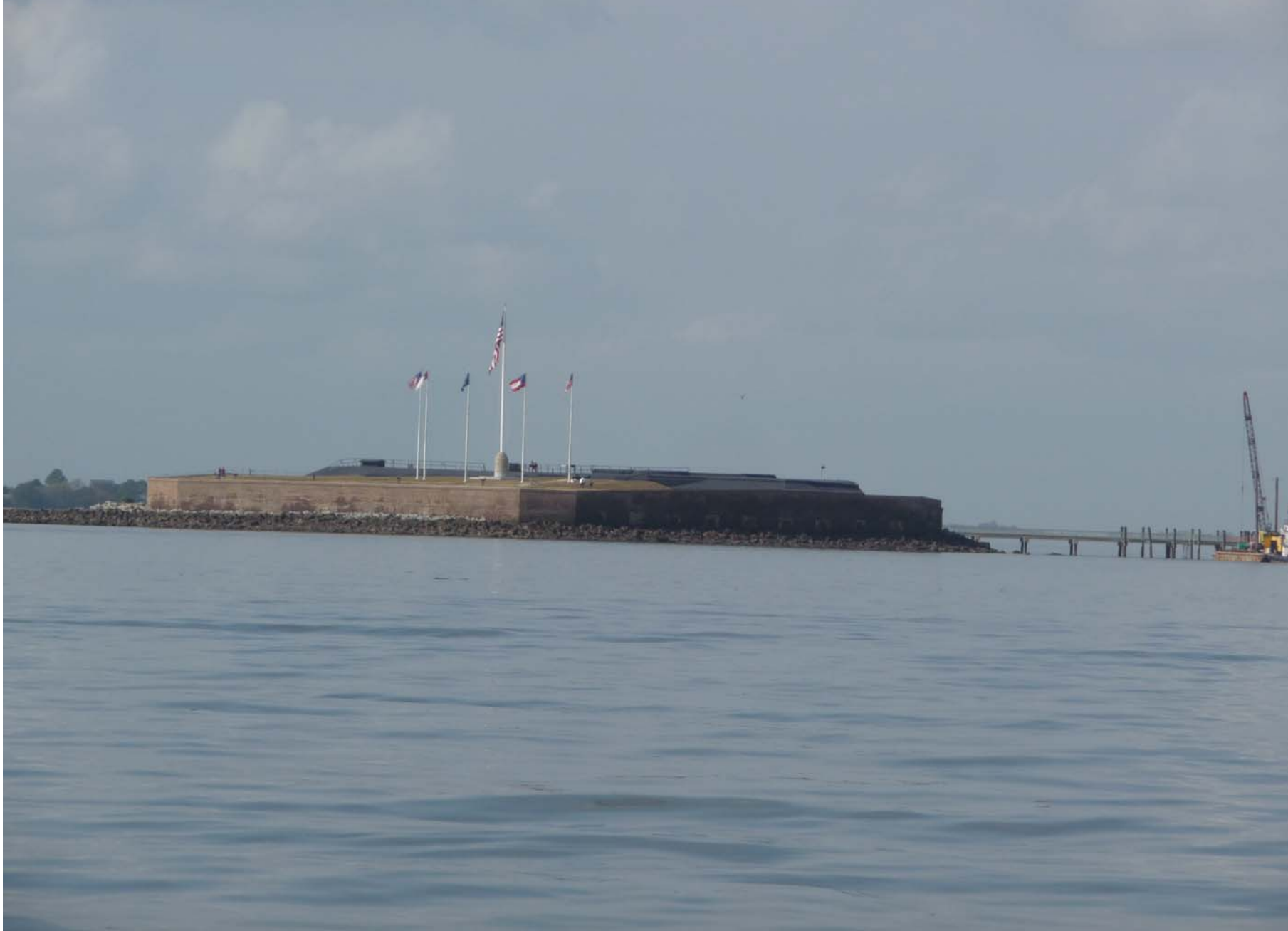
Fort Sumter, Charleston Harbor. “First shots of the Civil War”.